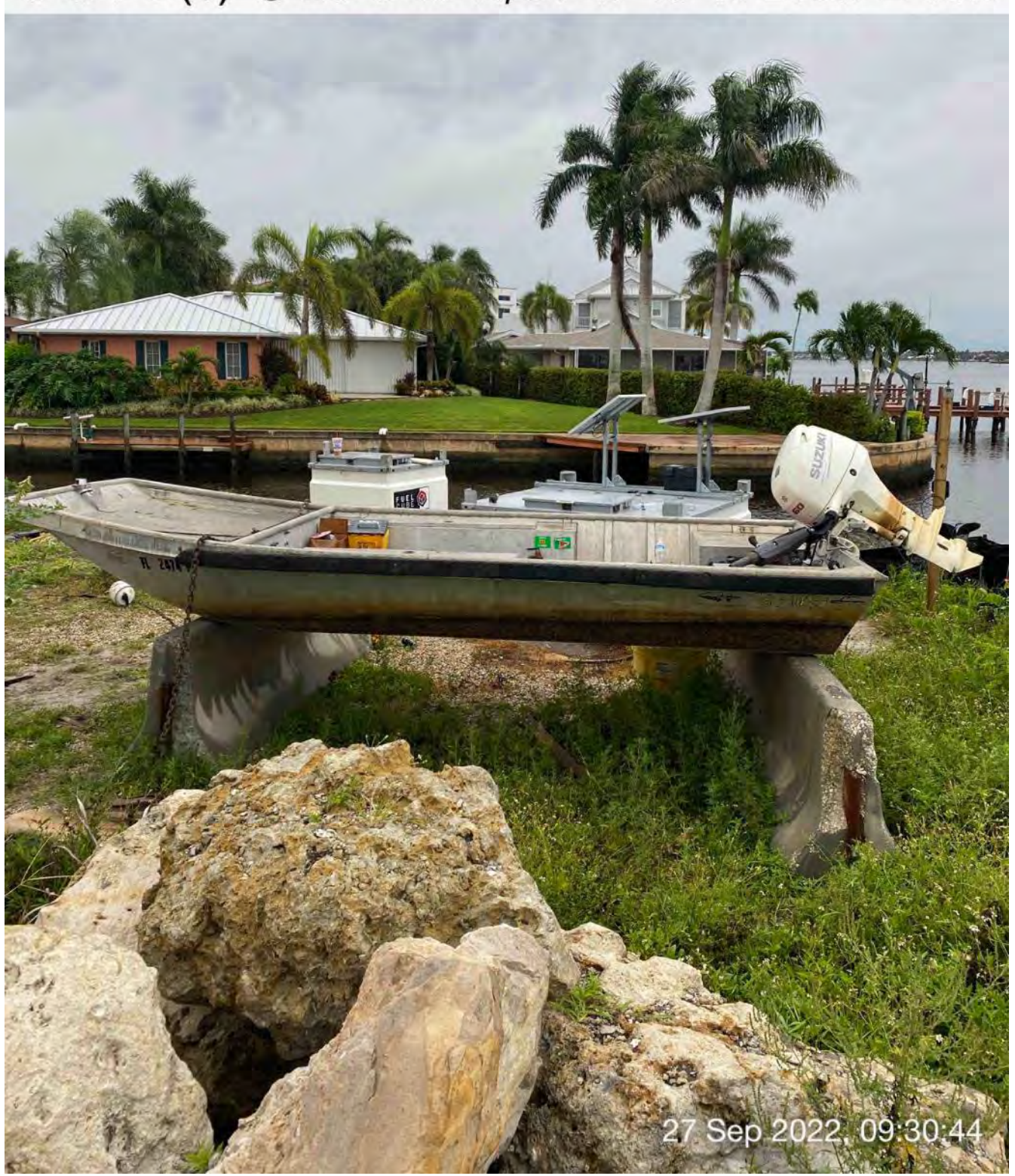
Support boat on jersey barriers at 1300 Curlew Avenue