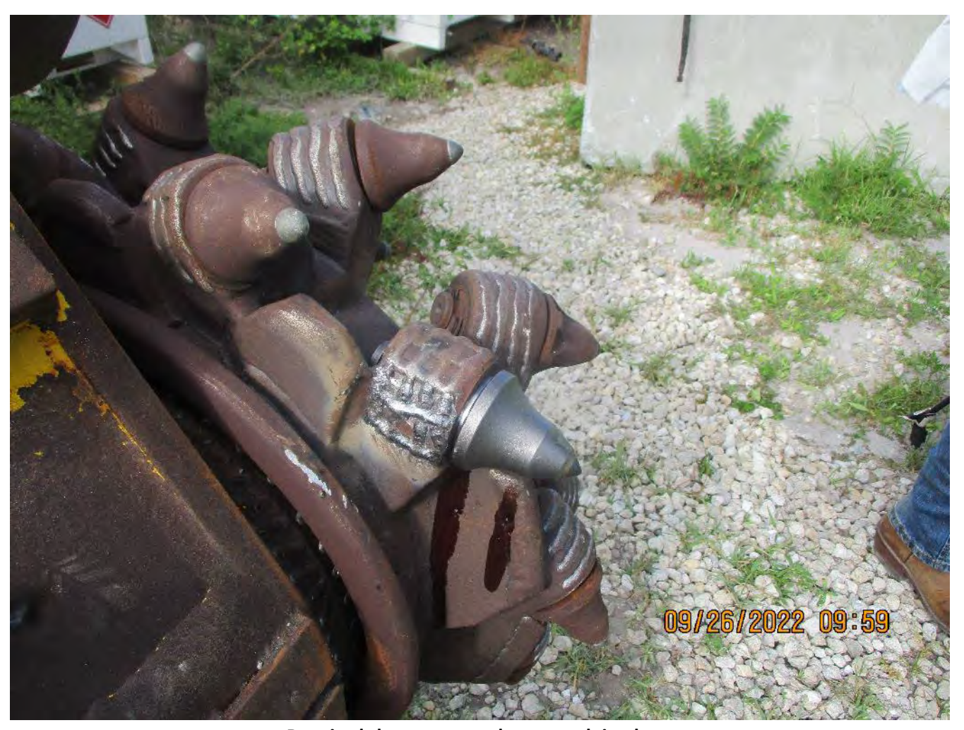
Repaired sleeve area and new tooth in place