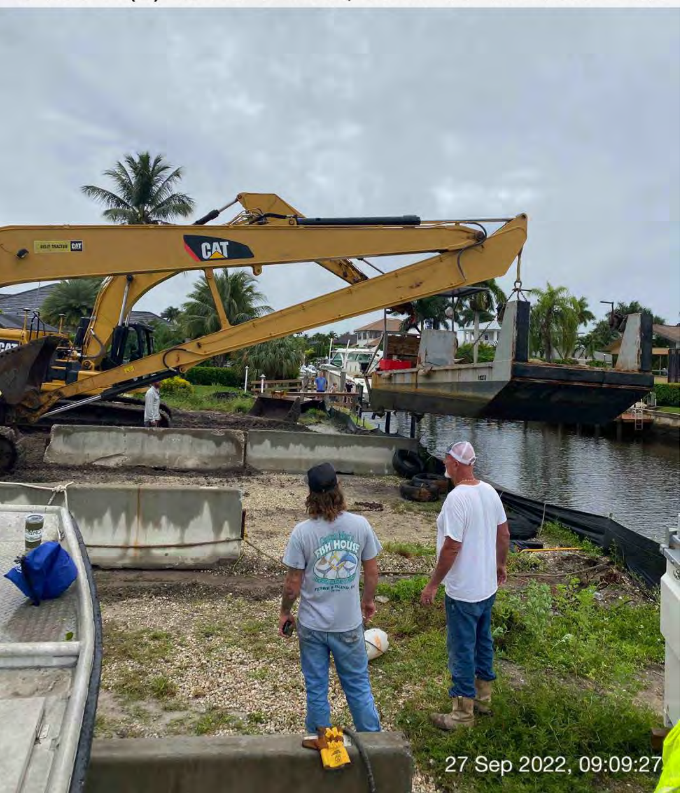
323 and 326 excavators lifting push boat out of Canal CC-CC and onto jersey barriers at 1300 Curlew Avenue