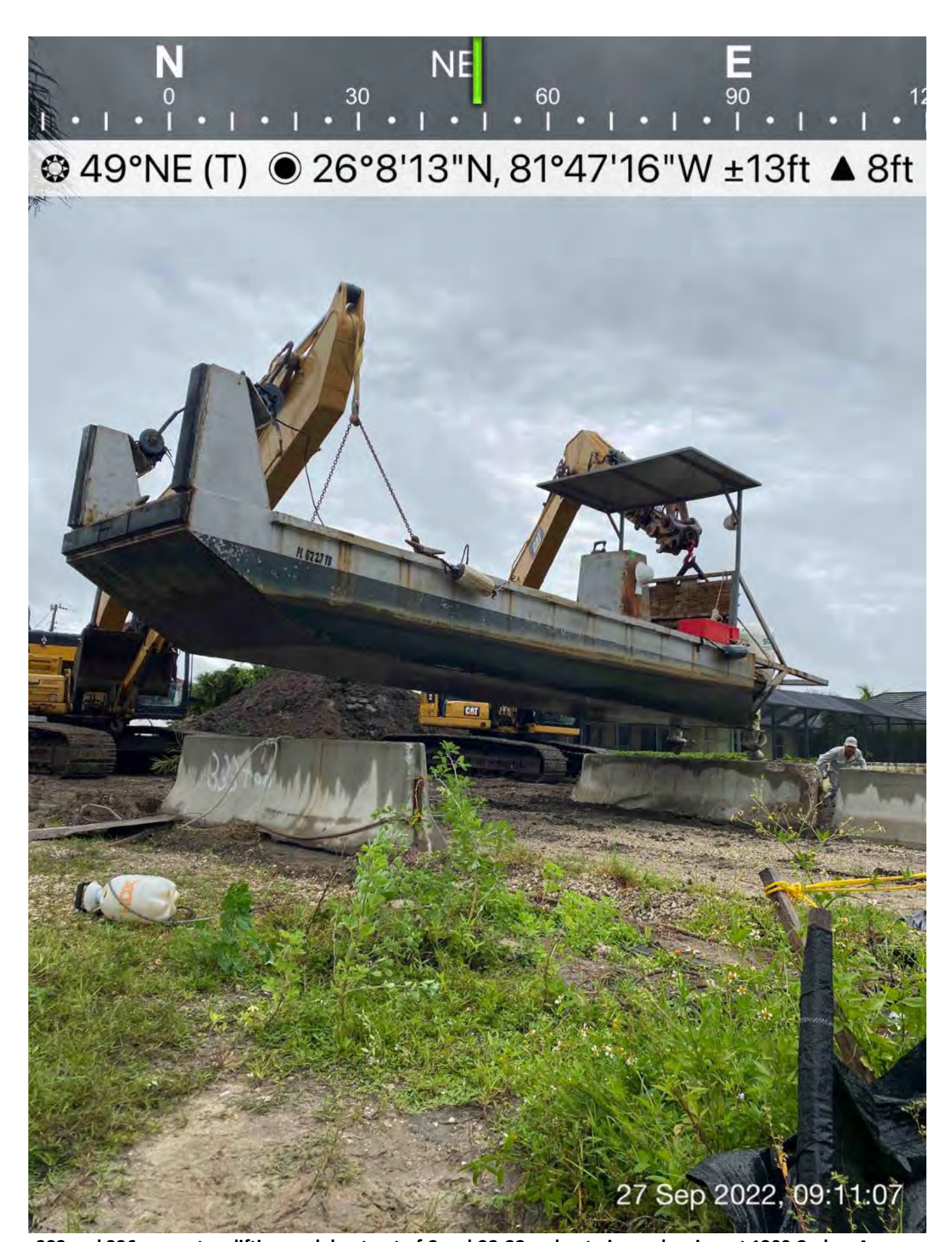
323 and 326 excavators lifting push boat out of Canal CC-CC and onto jersey barriers at 1300 Curlew Avenue