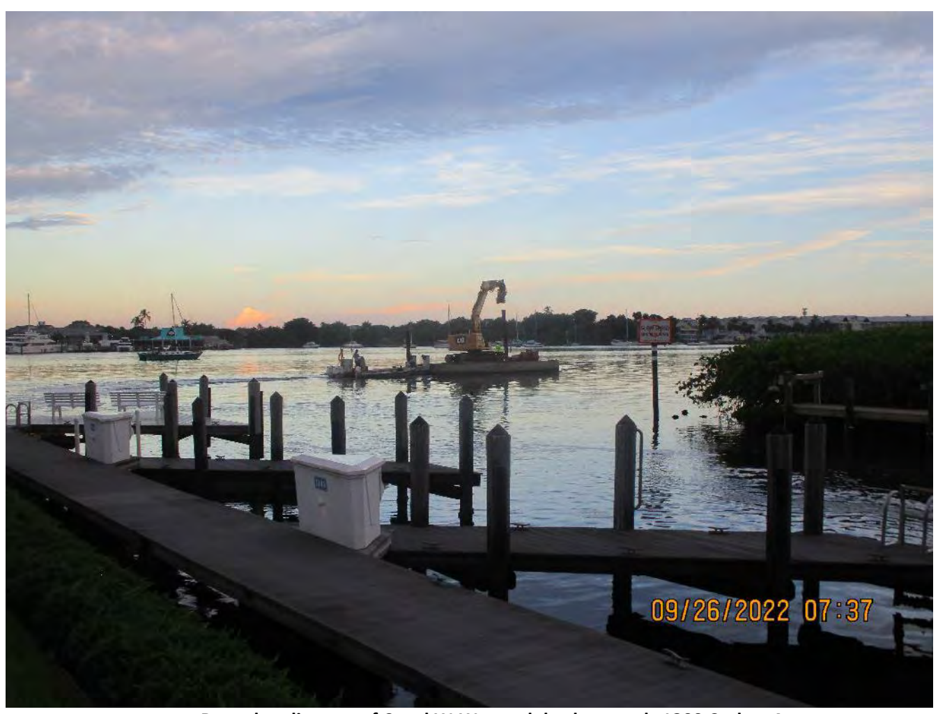
Barge heading out of Canal W-W mouth back towards 1300 Curlew Ave.