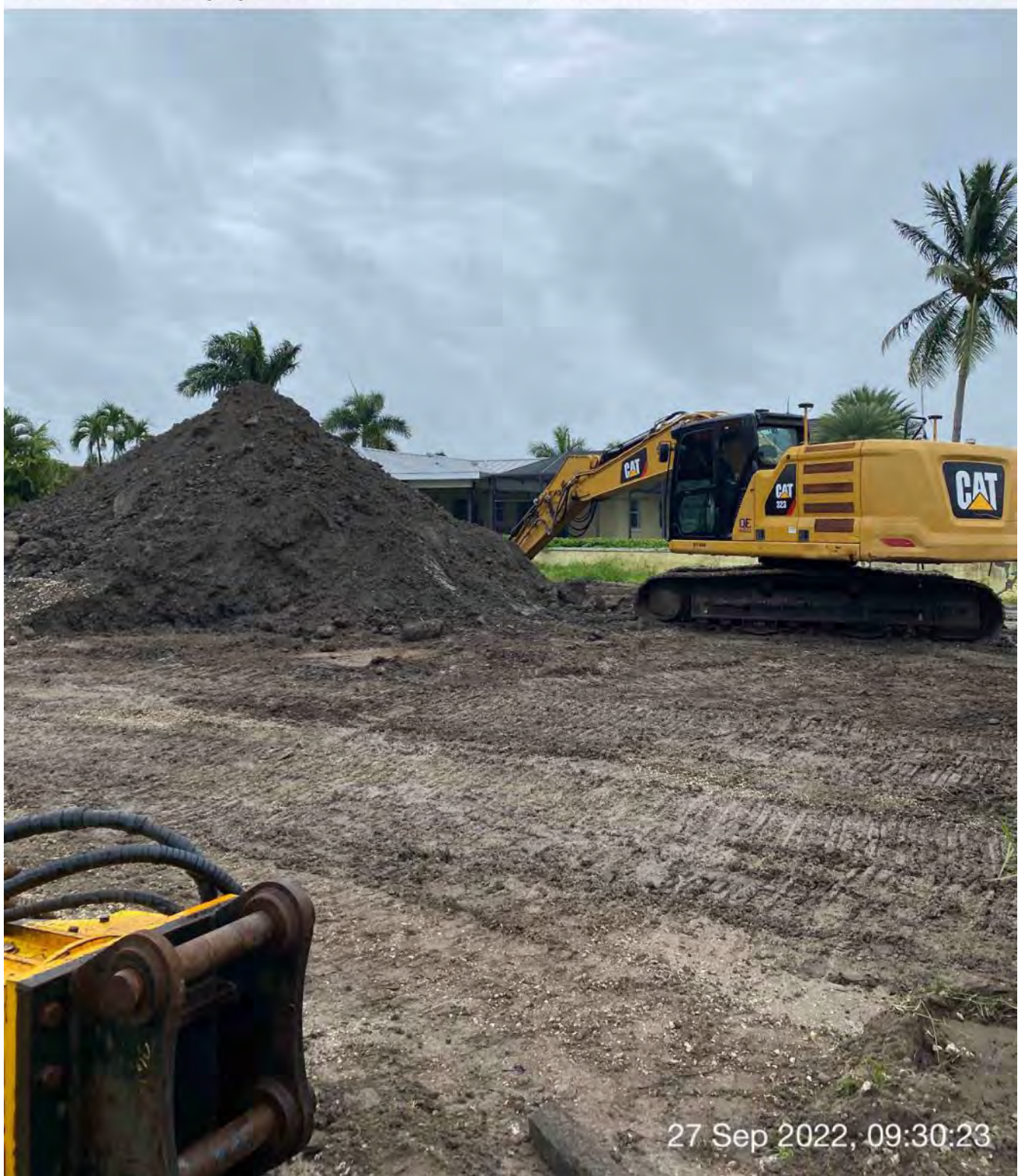
323 excavator and removed material on site at 1300 Curlew Avenue