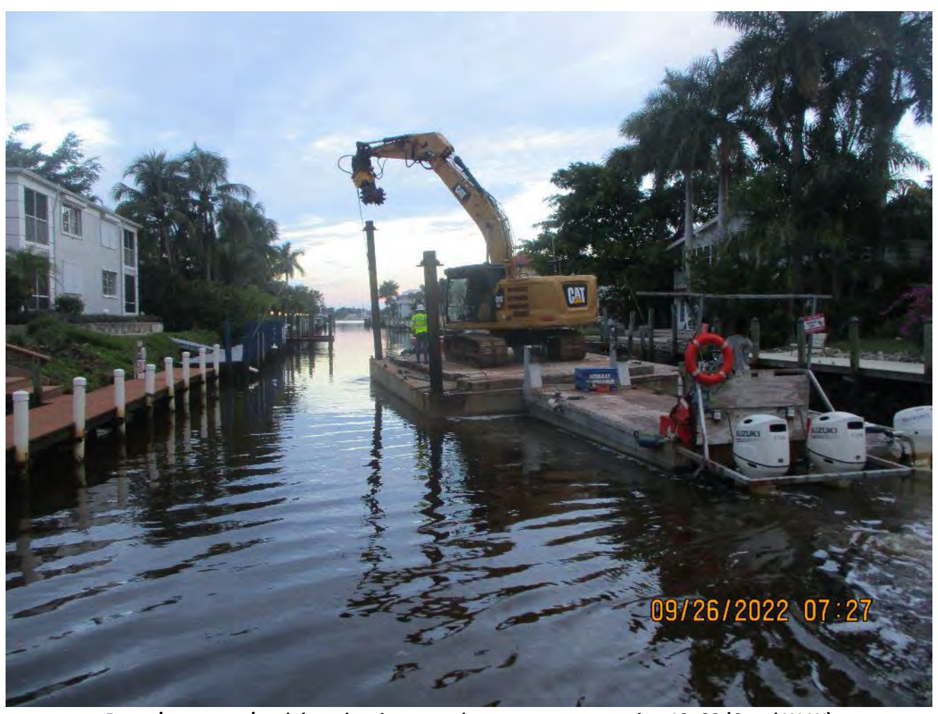
Barge/excavator/push boat leaving staged area at approx. station 13+00 (Canal W-W)