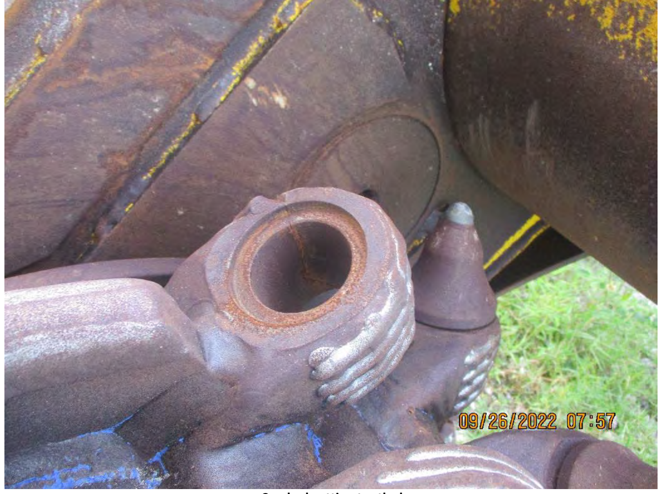
Cracked cutting tooth sleeve