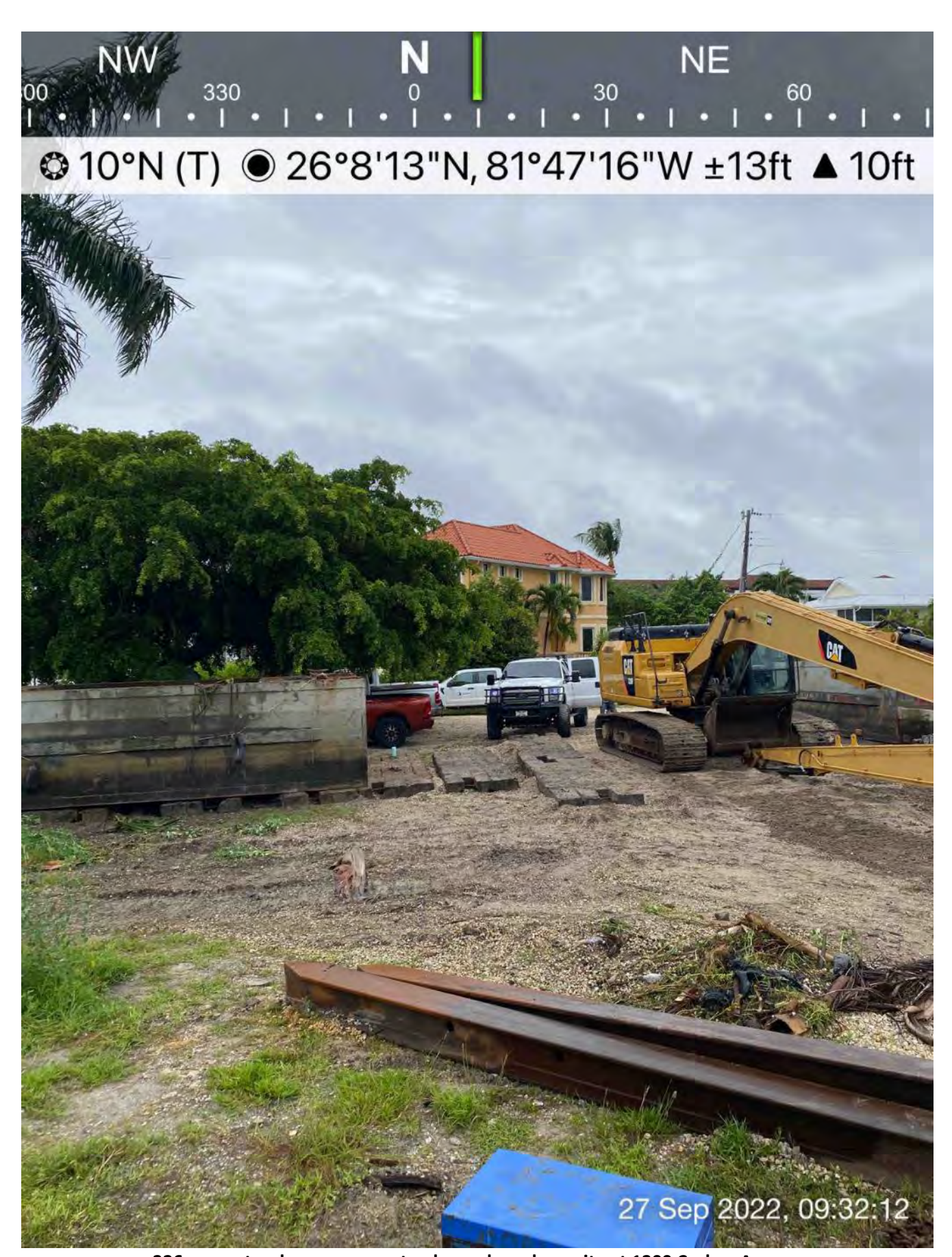
326 excavator, hopper, crane tracks, and spuds on site at 1300 Curlew Avenue