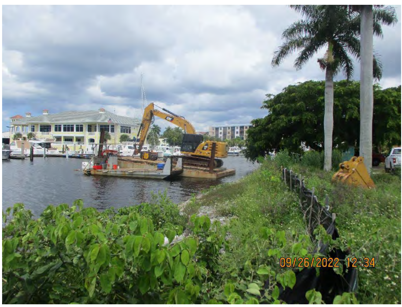
Excavator walk off area to Curlew Ave staging location