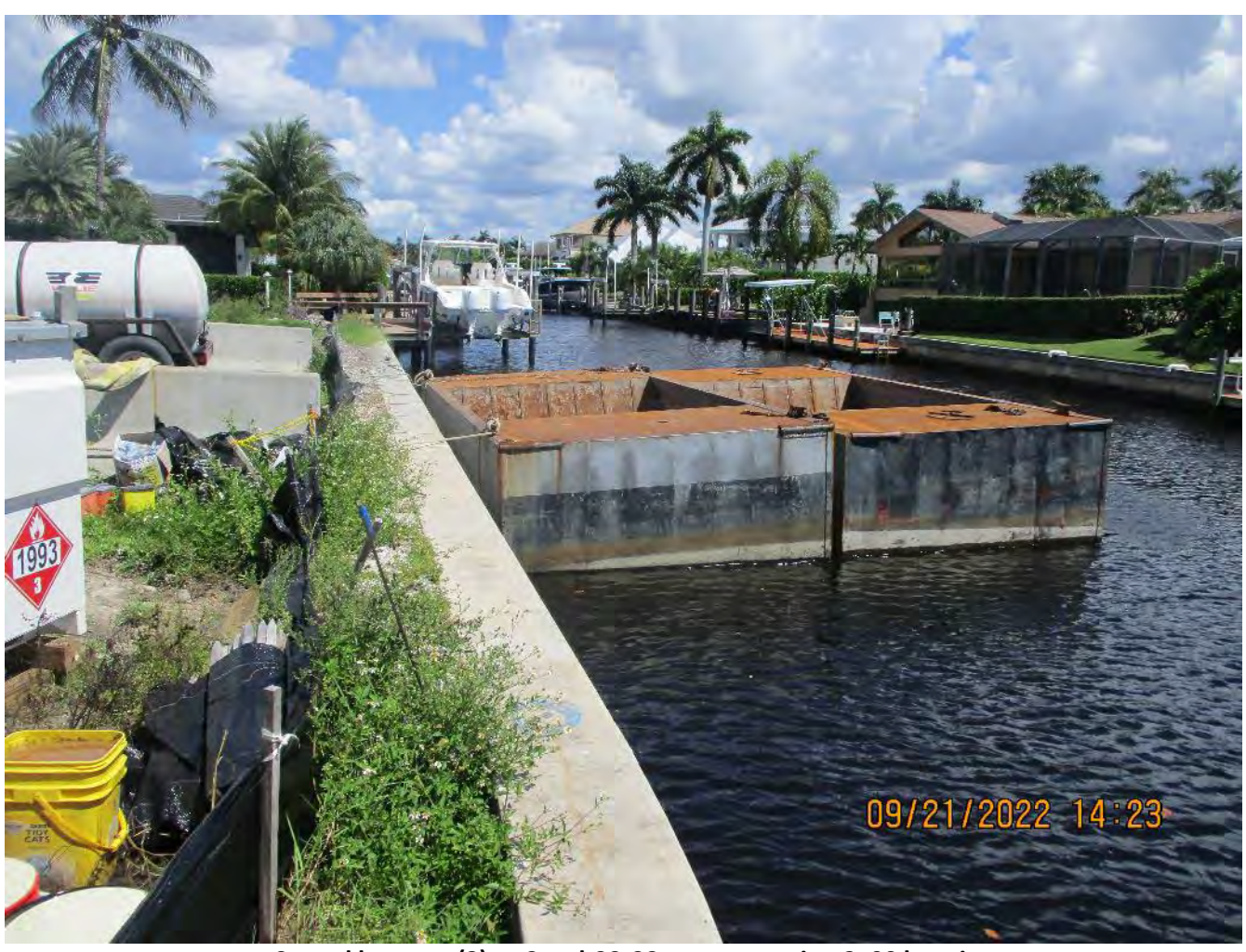
Staged hoppers (2) at Canal CC-CC approx. station 2+00 location