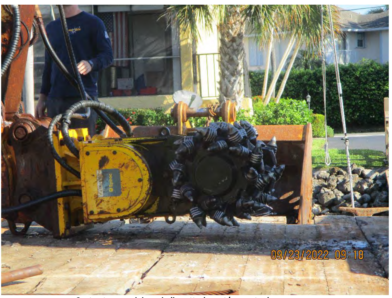
Contractor examining grinding attachment/excavator boom areas