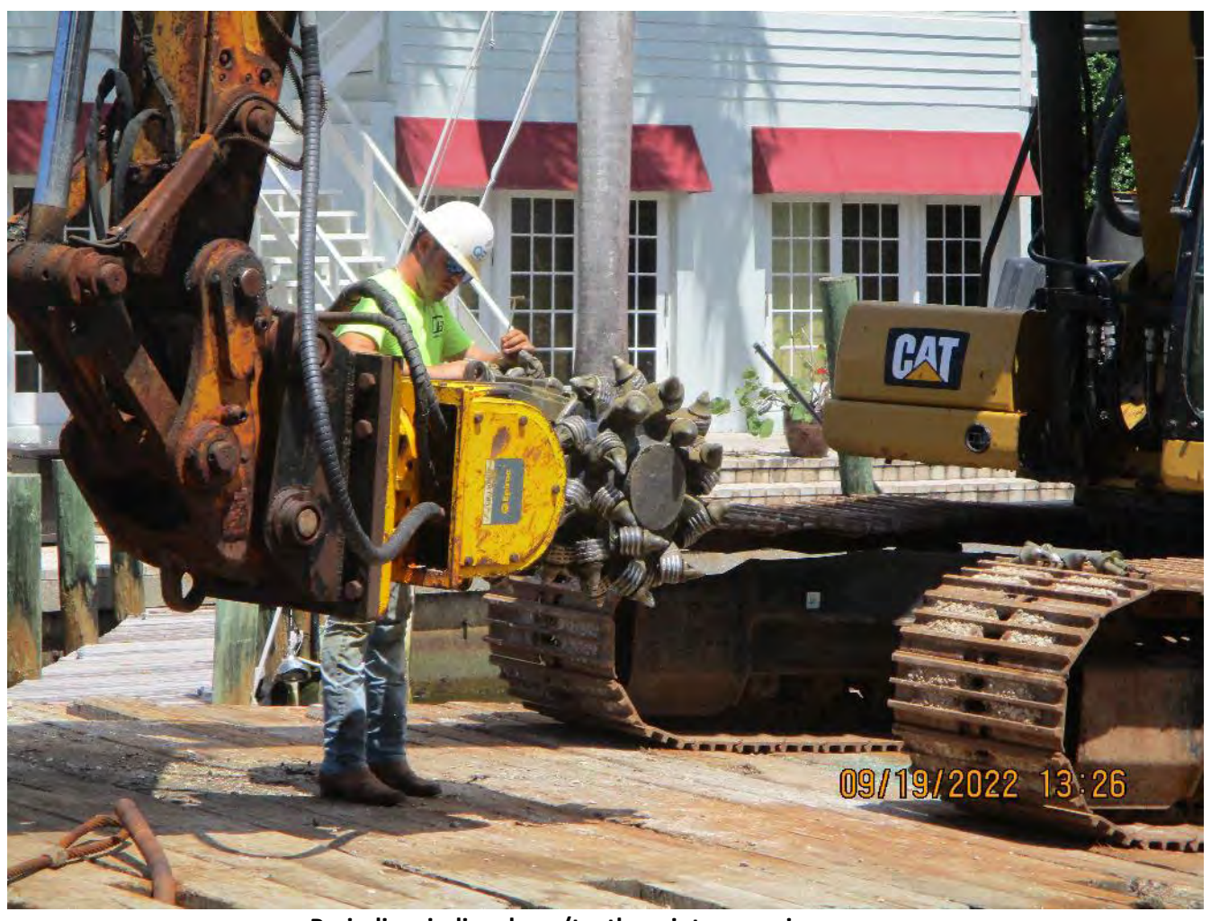
Periodic grinding drum/teeth maintenance in progress