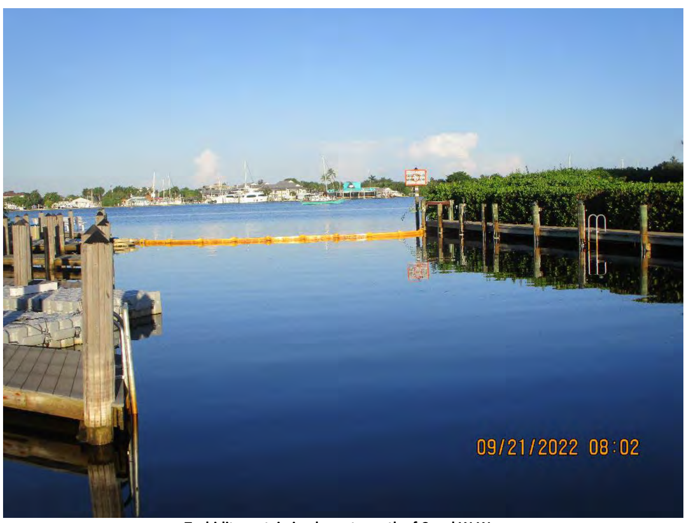
Turbidity curtain in place at mouth of Canal W-W