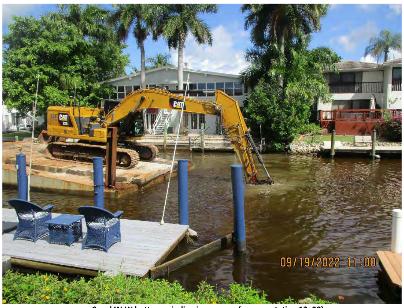
Canal W-W bottom grinding in progress (approx. station 12+50)