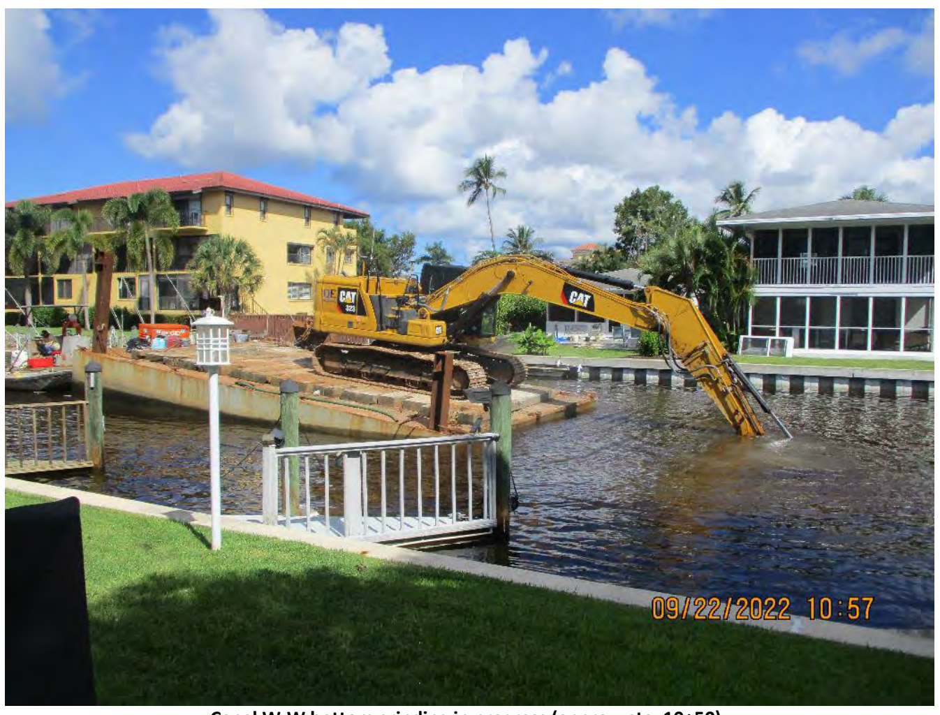
Canal W-W bottom grinding in progress (approx. sta. 10+50)