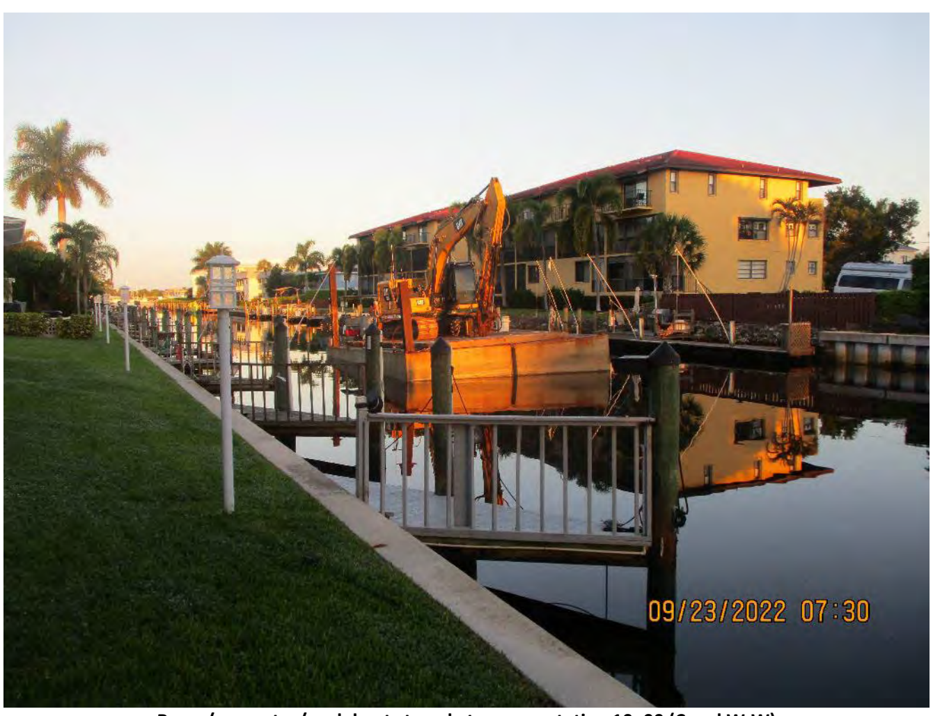
Barge/excavator/push boat staged at approx. station 10+00 (Canal W-W)