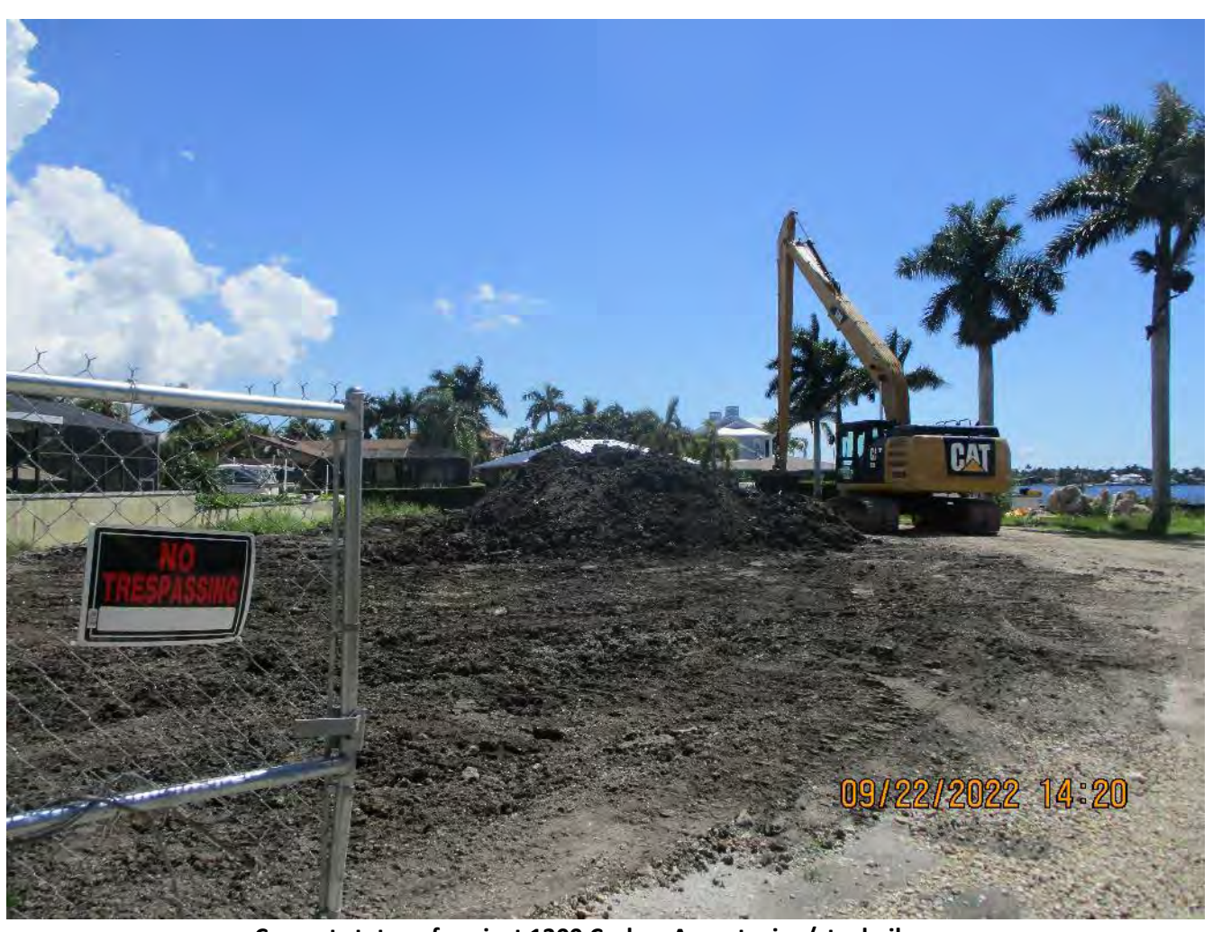
Current status of project 1300 Curlew Ave. staging/stockpile area