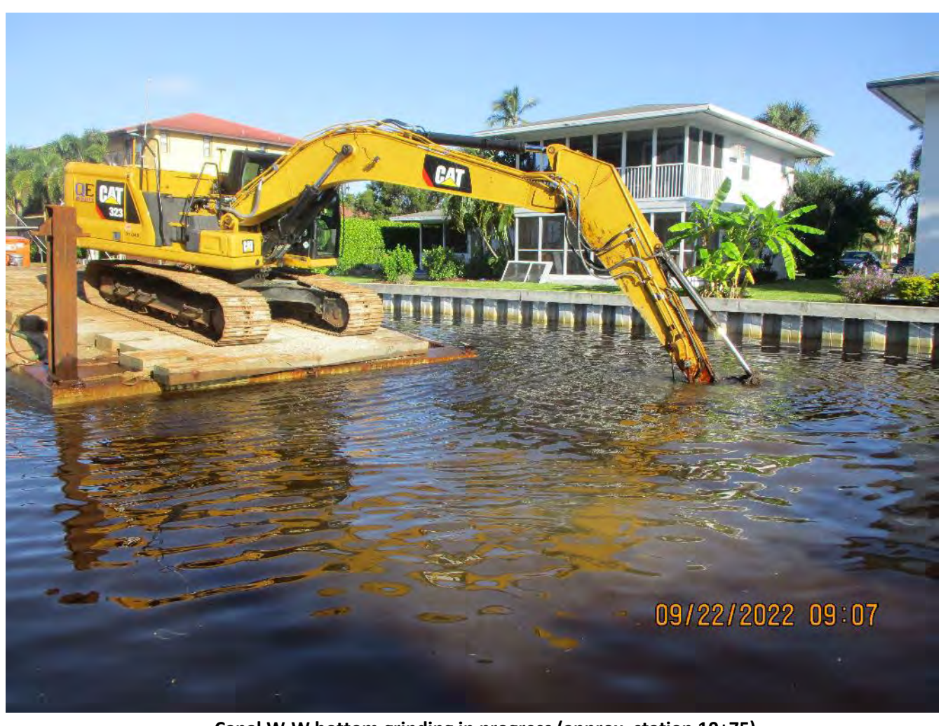
Canal W-W bottom grinding in progress (approx. station 10+75)