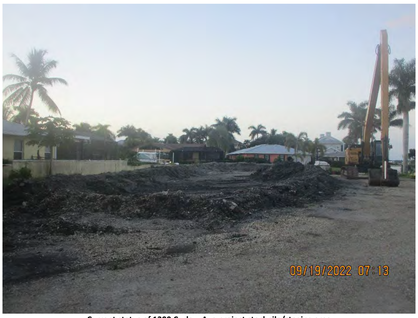
Current status of 1300 Curlew Ave project stockpile/staging area