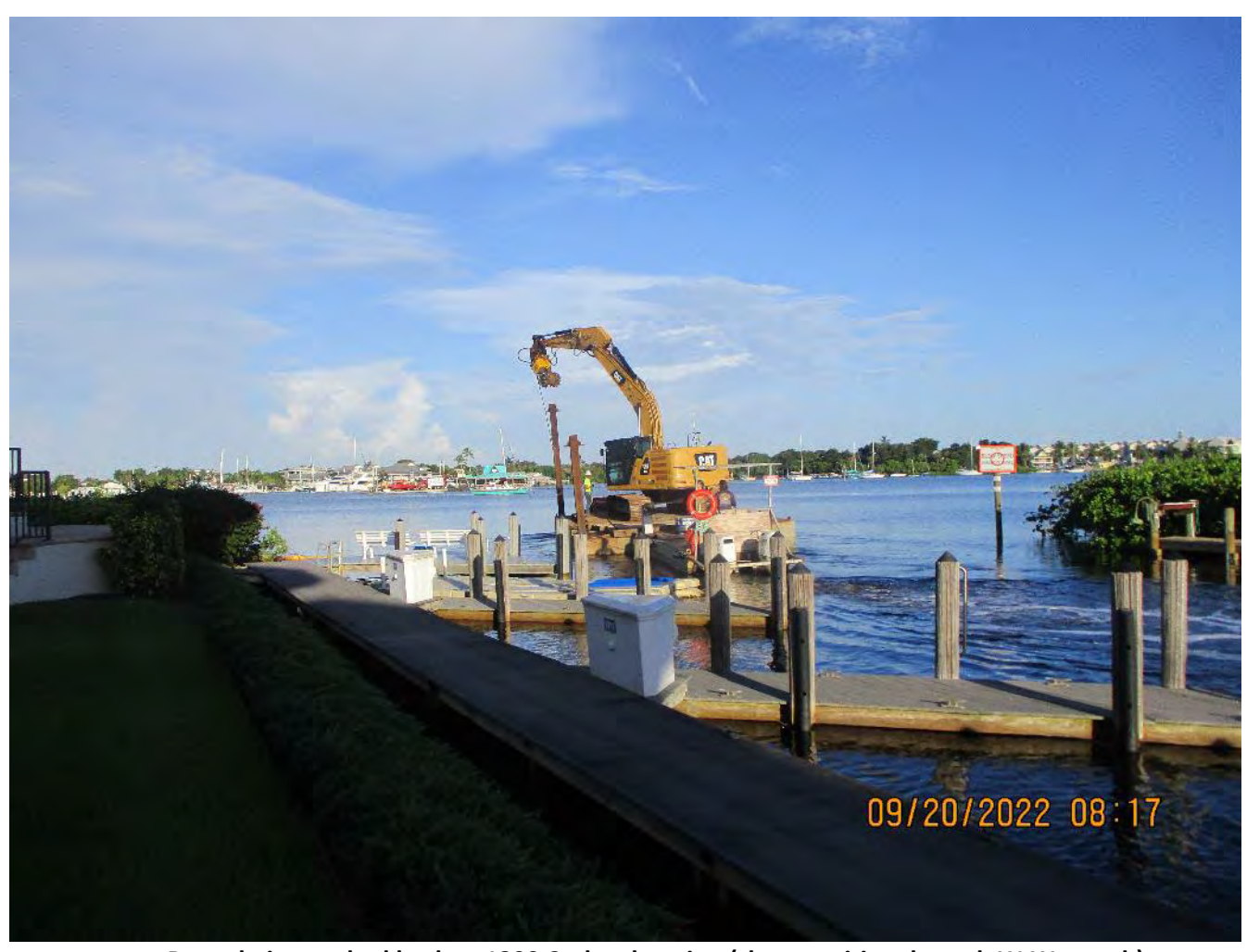
Barge being pushed back to 1300 Curlew location (shown exiting through W-W mouth)