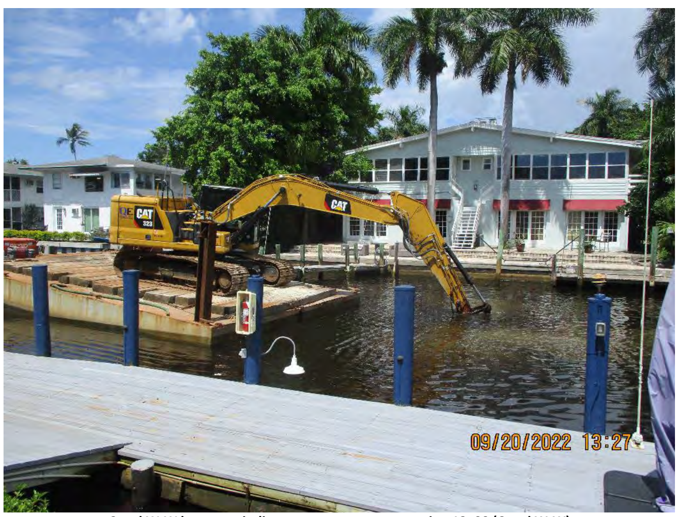
Canal W-W bottom grinding resumes at approx. station 12+00 (Canal W-W)