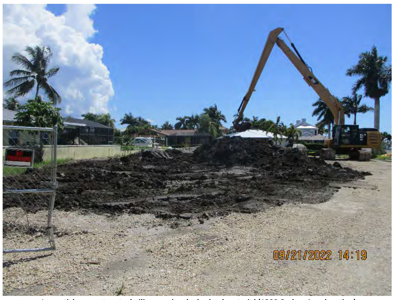
Long stick excavator stockpiling previously dredged material (1300 Curlew Ave. location)