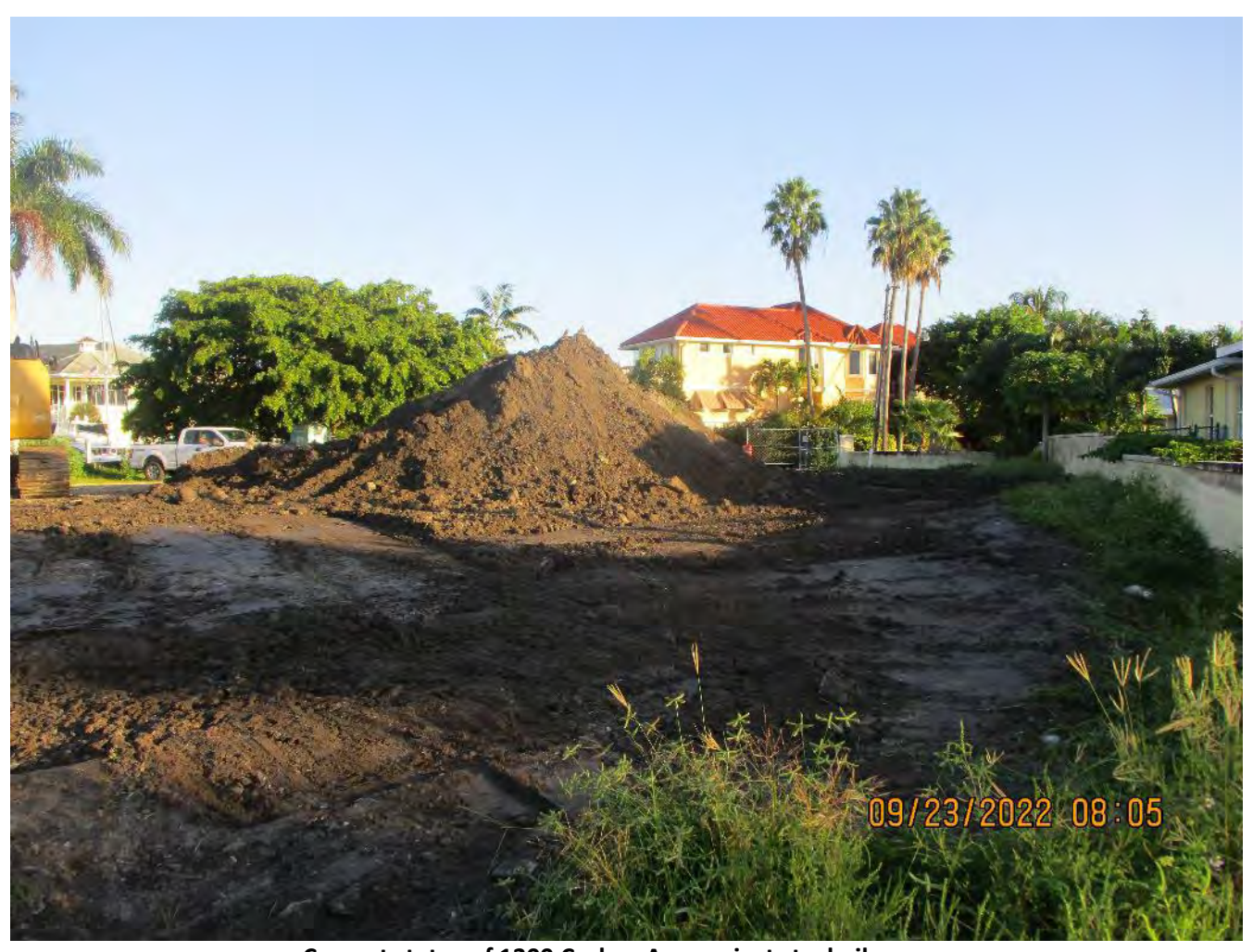
Current status of 1300 Curlew Ave project stockpile area