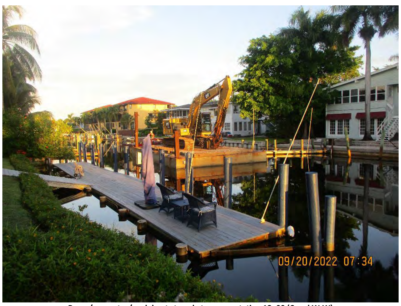
Barge/excavator/push boat staged at approx. station 12+00 (Canal W-W)