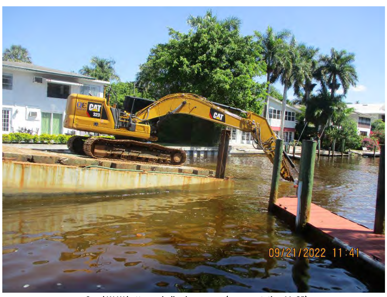
Canal W-W bottom grinding in progress (approx. station 11+25)