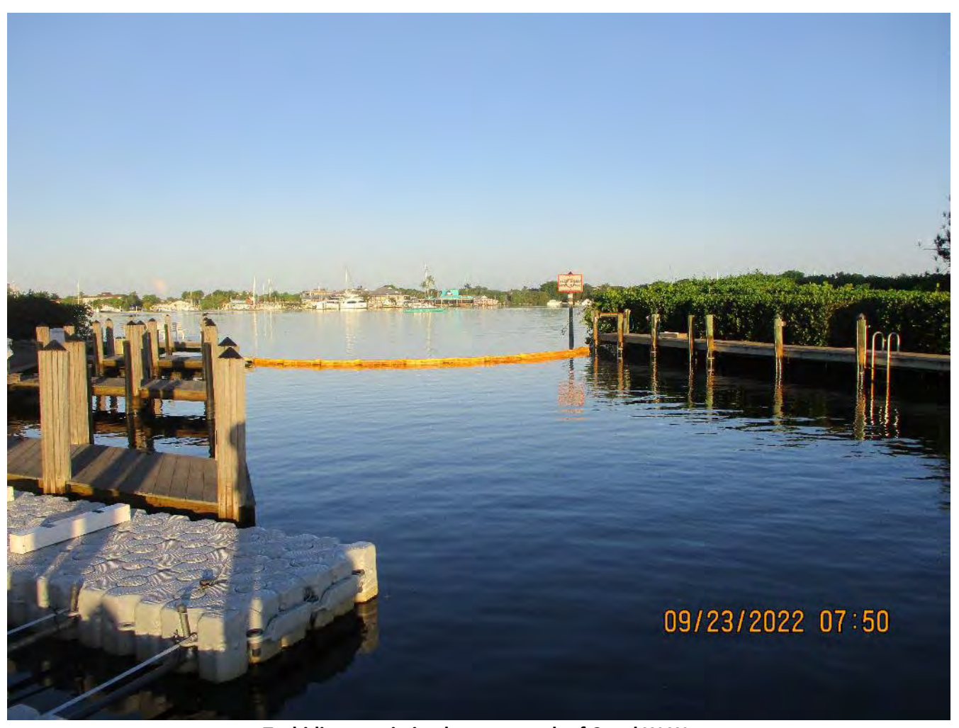
Turbidity curtain in place at mouth of Canal W-W