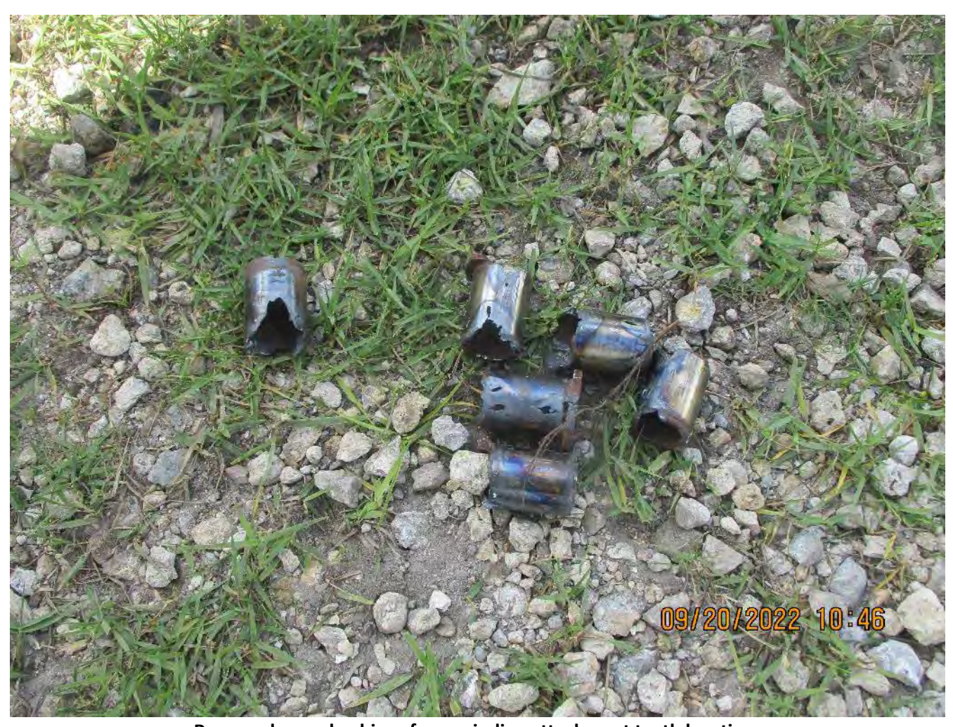
Removed worn bushings from grinding attachment teeth locations