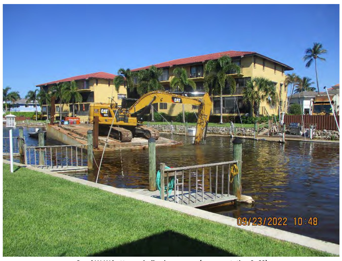
Canal W-W bottom grinding in progress (approx. station 9+60)