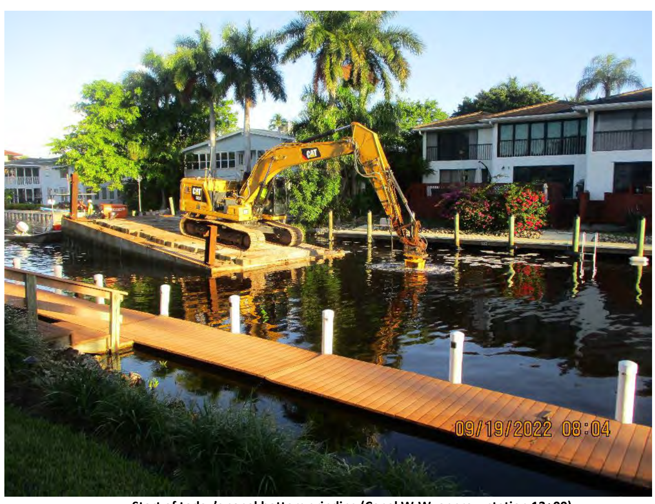
Start of today's canal bottom grinding (Canal W-W, approx. station 13+00)