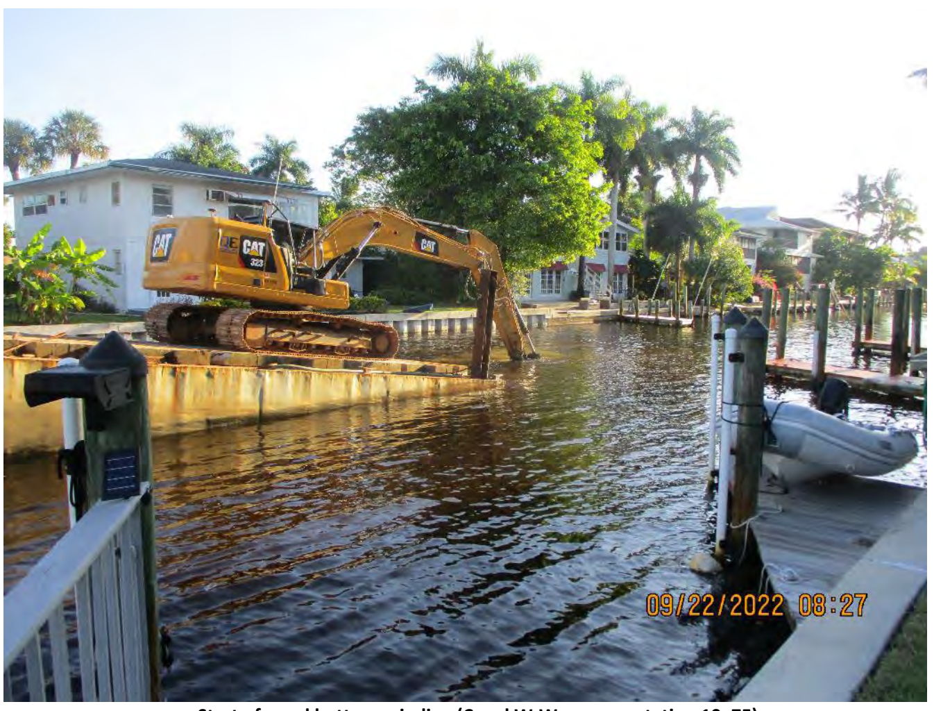
Start of canal bottom grinding (Canal W-W, approx. station 10+75)