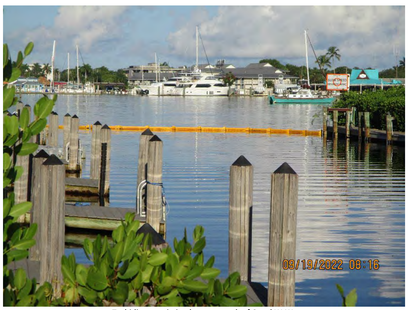
Turbidity curtain in place at mouth of Canal W-W