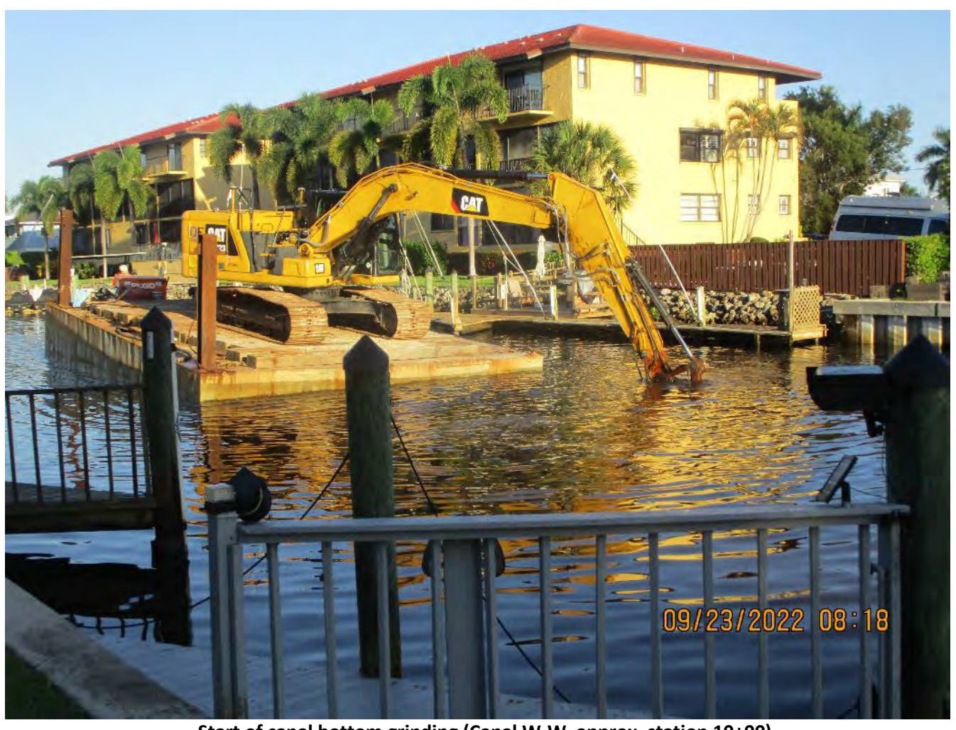
Start of canal bottom grinding (Canal W-W, approx. station 10+00)