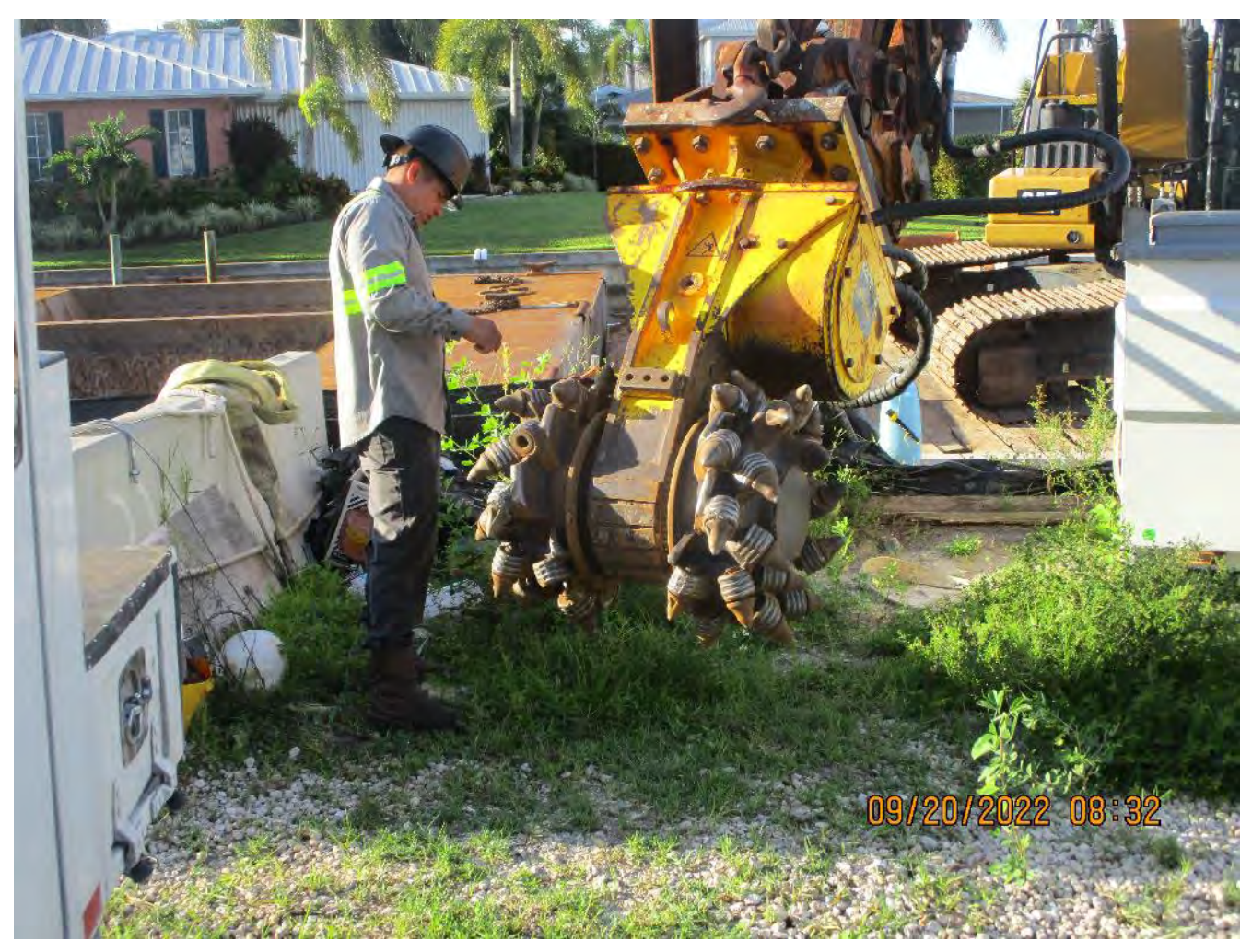
Maintenance begins on the grinding head attachment