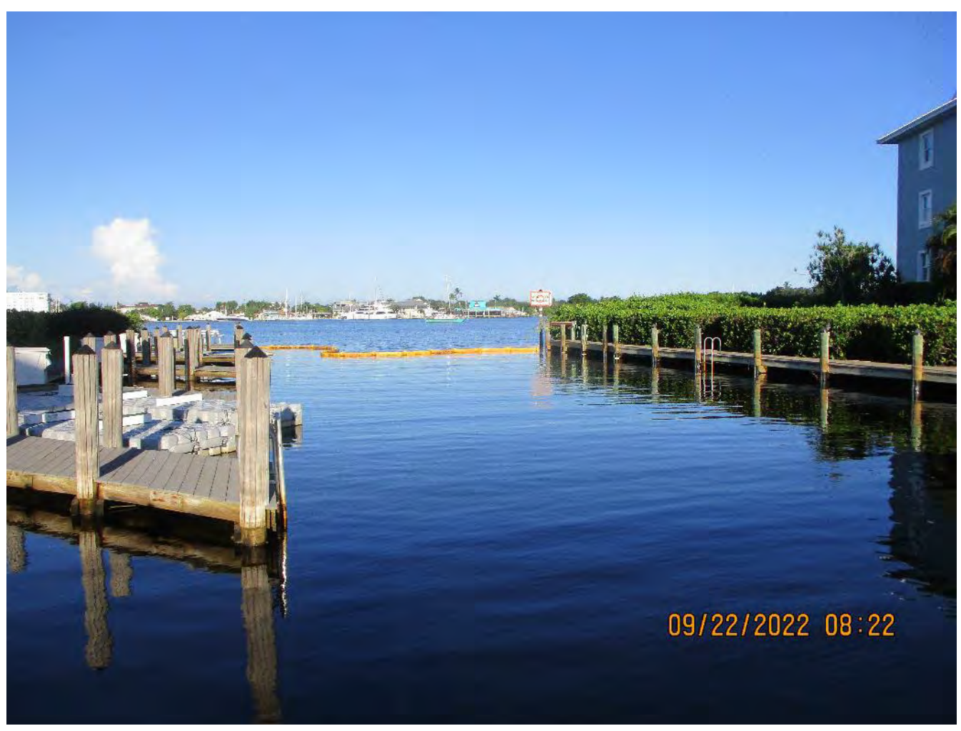
Turbidity curtain in place at mouth of Canal W-W