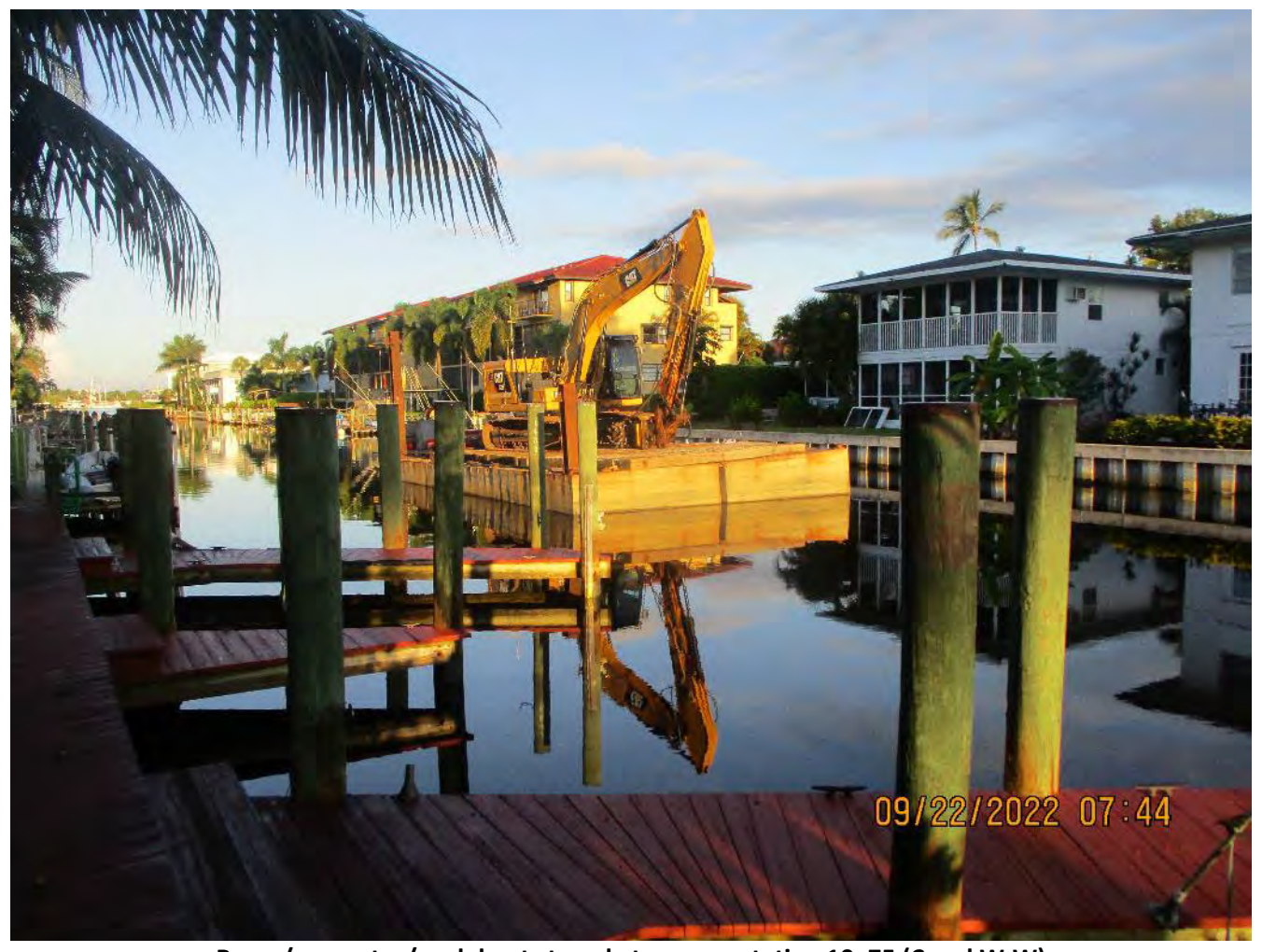
Barge/excavator/push boat staged at approx. station 10+75 (Canal W-W)