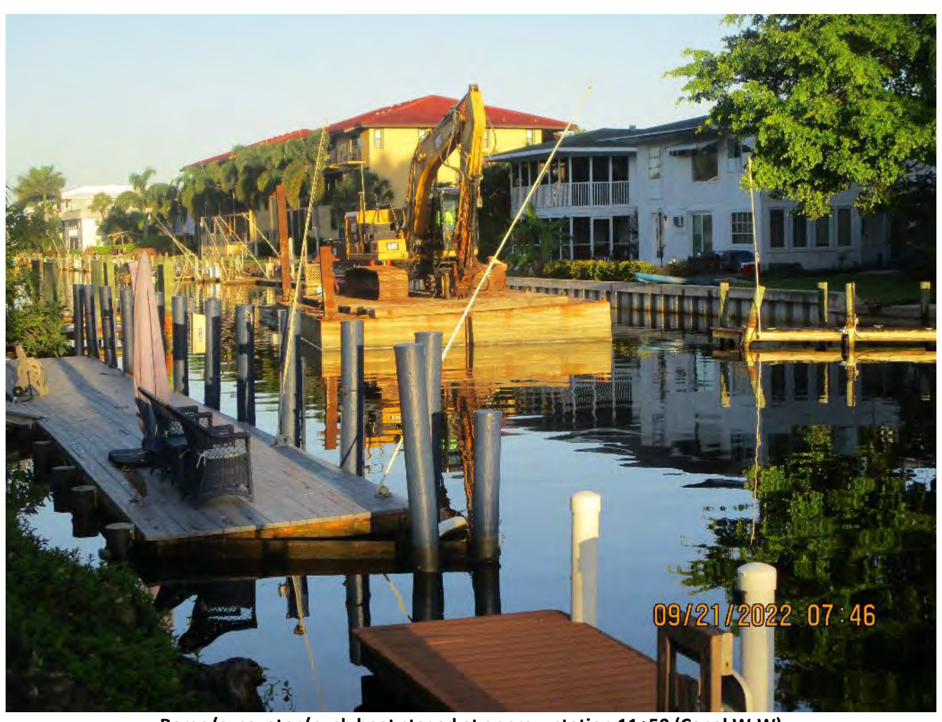
Barge/excavator/push boat staged at approx. station 11+50 (Canal W-W)