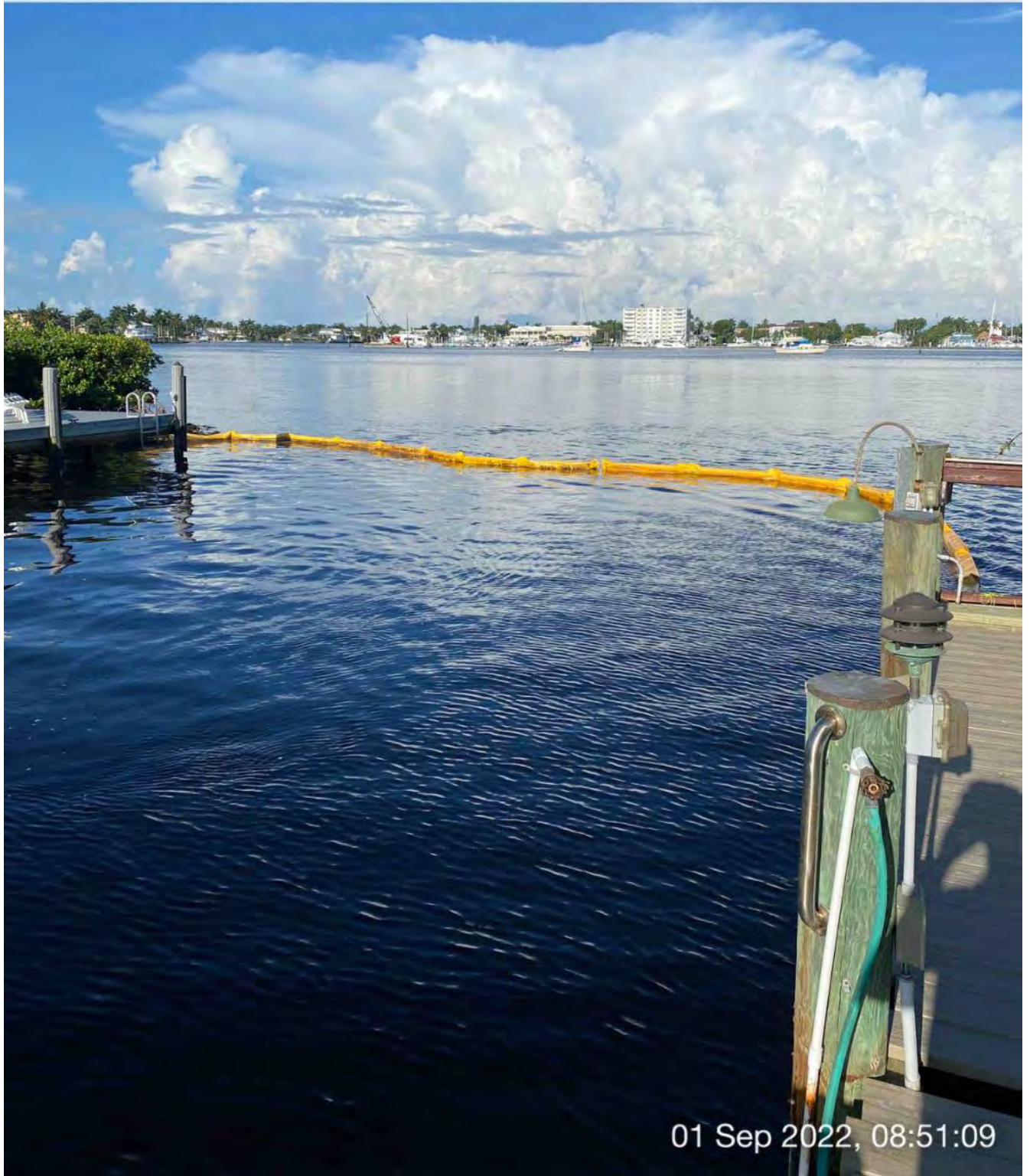
Turbidity curtain installed across the mouth of Canal W-W

☀ 248°W (T) ☉ 26°7'58"N, 81°47'17"W ±26ft ▲ 11ft