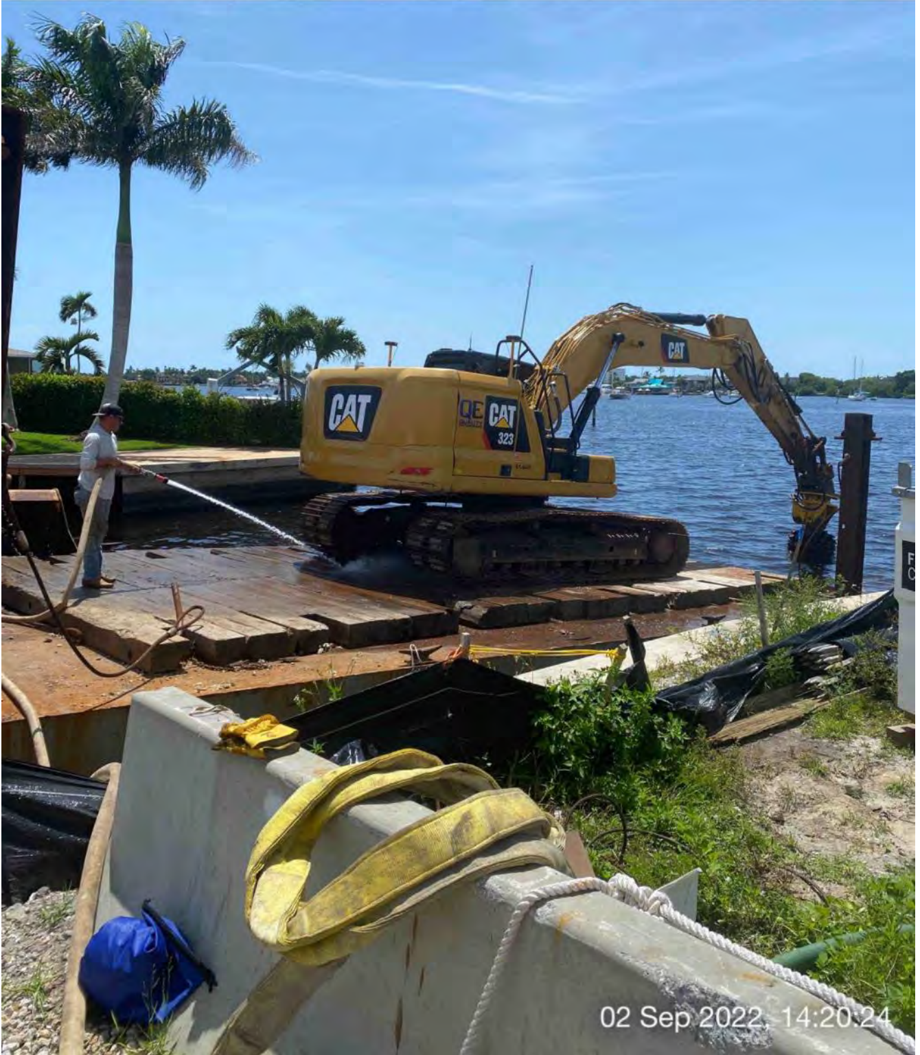
Contractor cleaning equipment with water hose

S 180 SW 210 W 240 270 3 ☉ 228°SW (T) ☉ 26°8'13"N, 81°47'16"W ±26ft ▲ 9ft