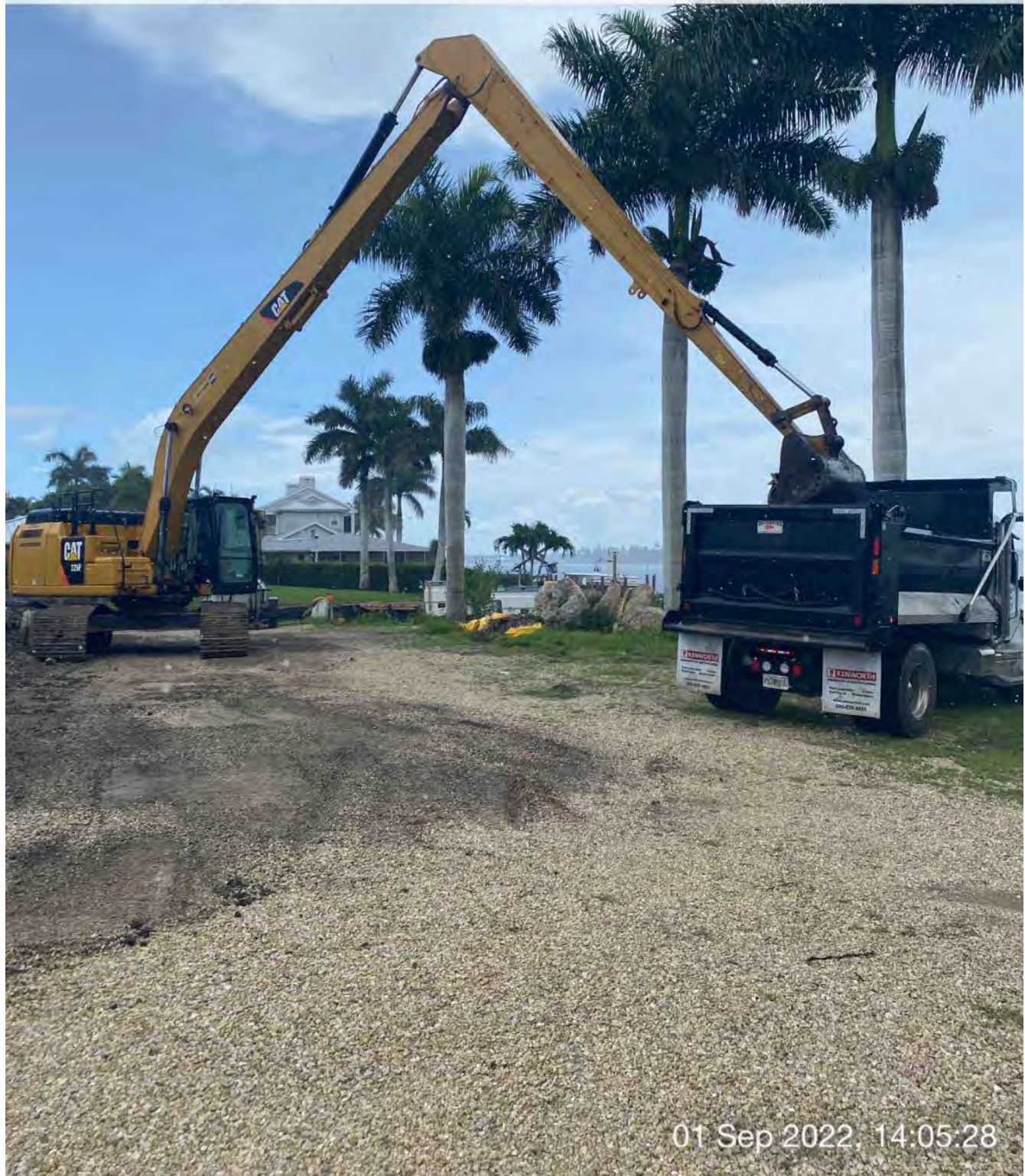
326 excavator transferring trash to dump truck bed at 1300 Curlew Avenue

☀ 203°S (T) ☉ 26°8'14"N, 81°47'16"W ±16ft ▲ 8ft