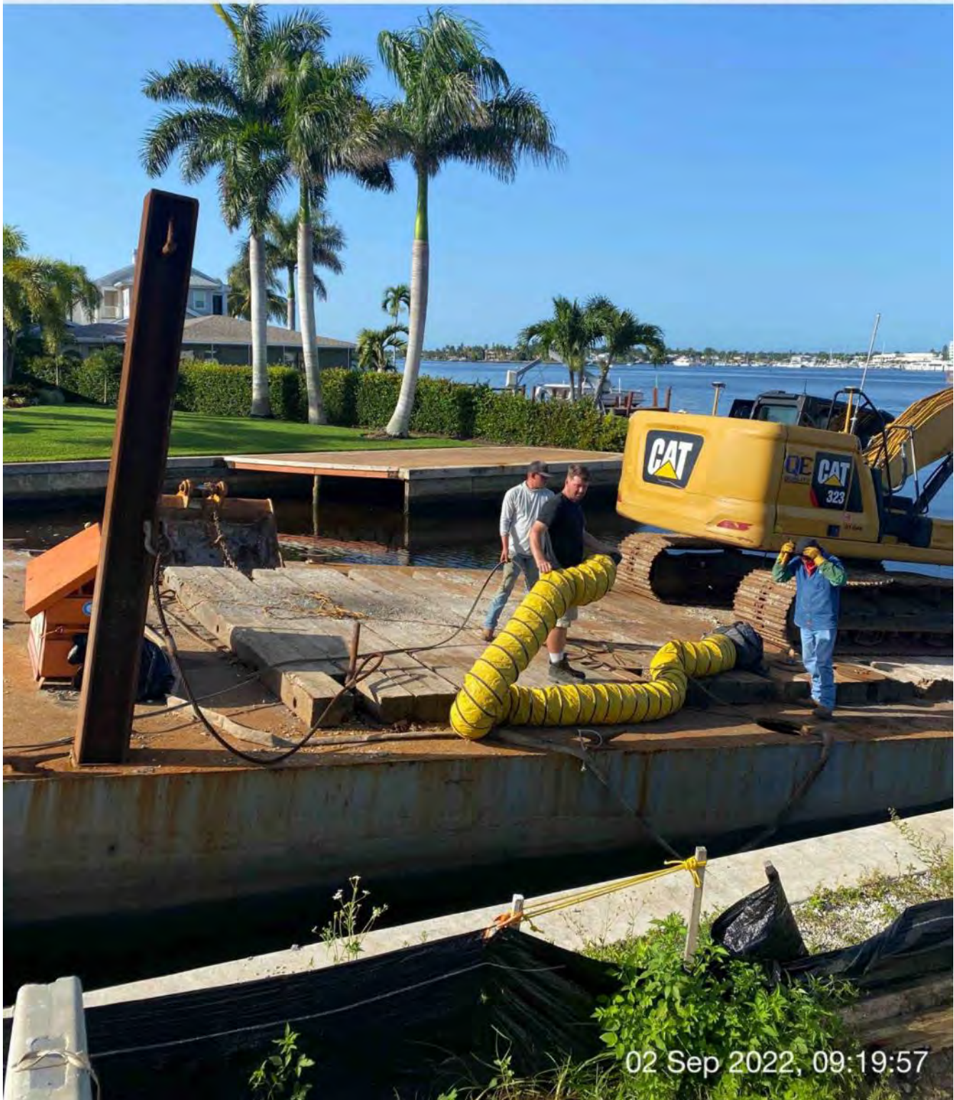
Welder on barge with air ventilation

E 150 S 180 210 SW 240 W 270 ☉ 206°SW (T) ● 26°8'13"N, 81°47'16"W ±13ft ▲ 10ft