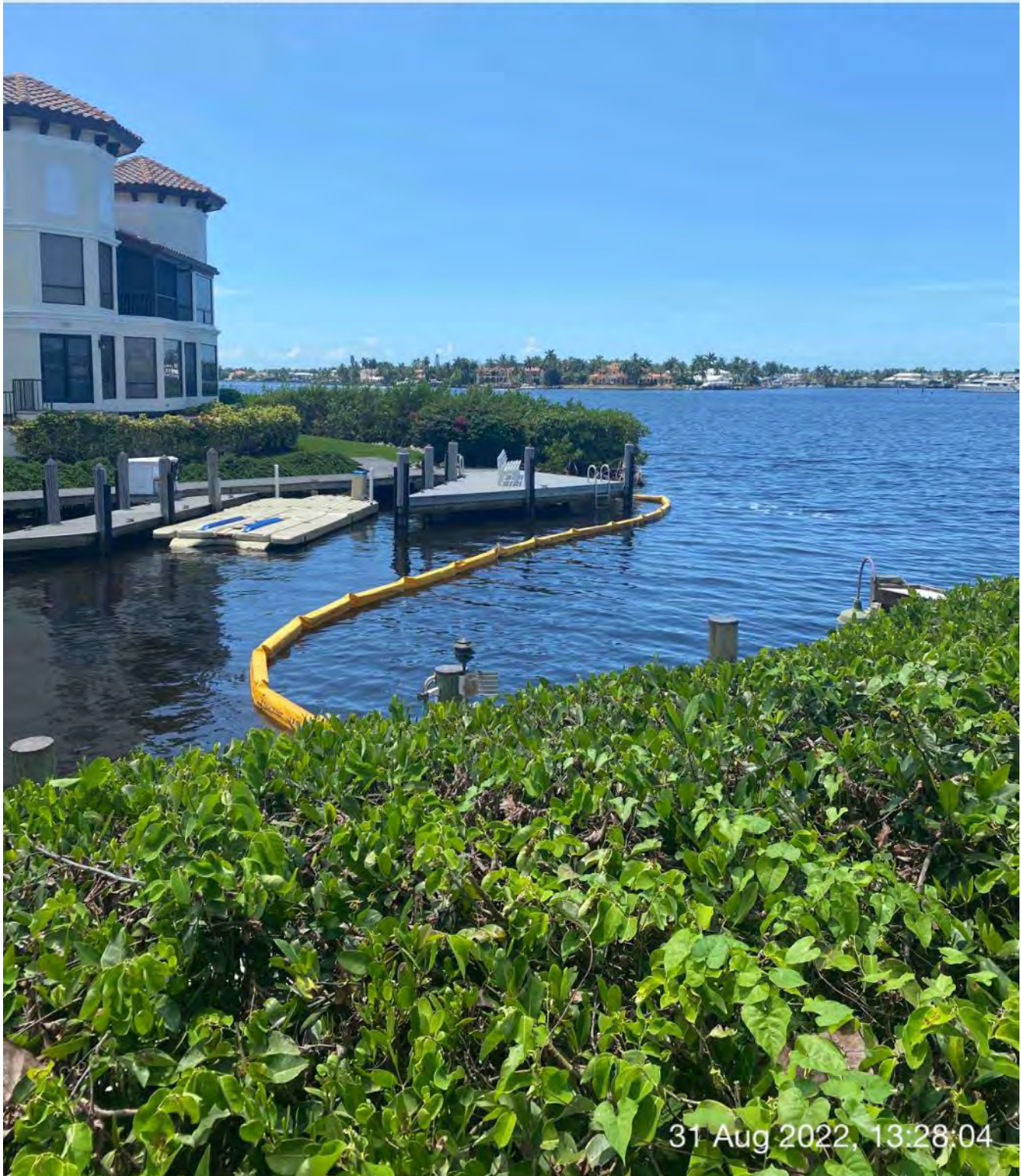
Turbidity curtain installed across the mouth of Canal W-W

S 150 180 210 SW 240 W 270 ☀ 217°SW (T) ● 26°7'58"N, 81°47'17"W ±22ft ▲ 8ft