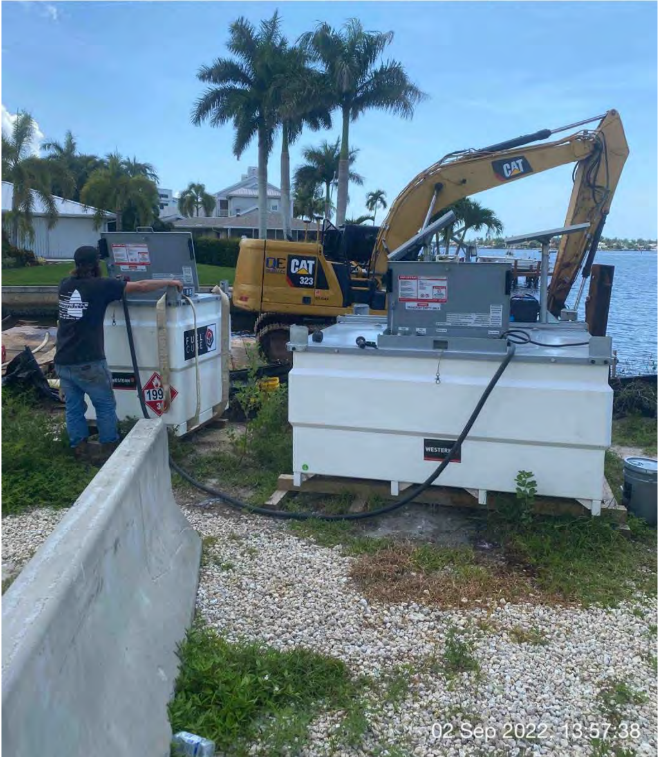
Contractor refilling small fuel cube with large fuel cube

SE S SW 120 150 180 210 240 188°S (T) 26°8'13"N, 81°47'16"W ±22ft ▲ 8ft