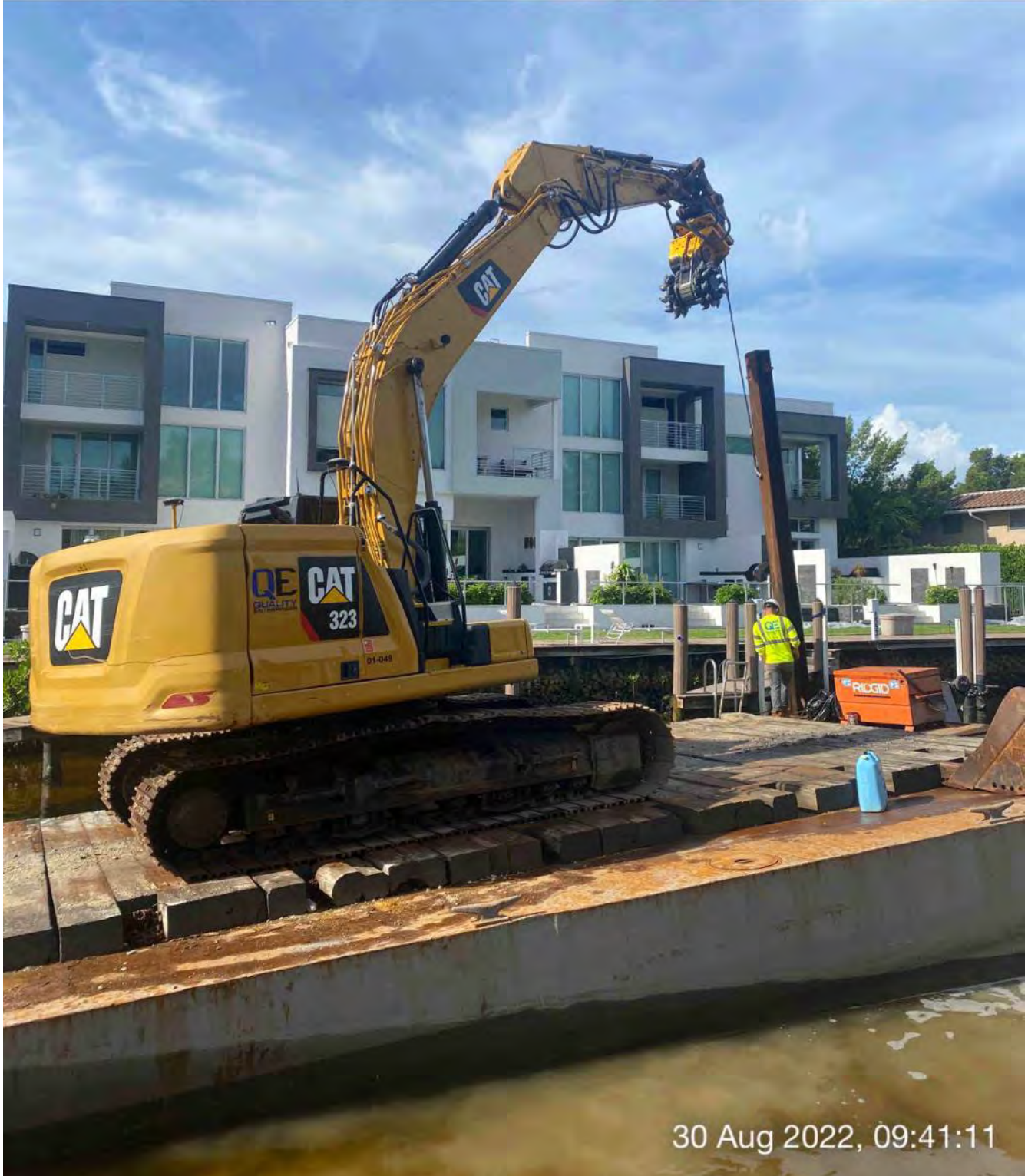
323 excavator lifting spud to allow push boat to mobilize barge at station 16+25

☀ 201°S (T) ☉ 26°7'58"N, 81°47'2"W ±49ft ▲ 8ft