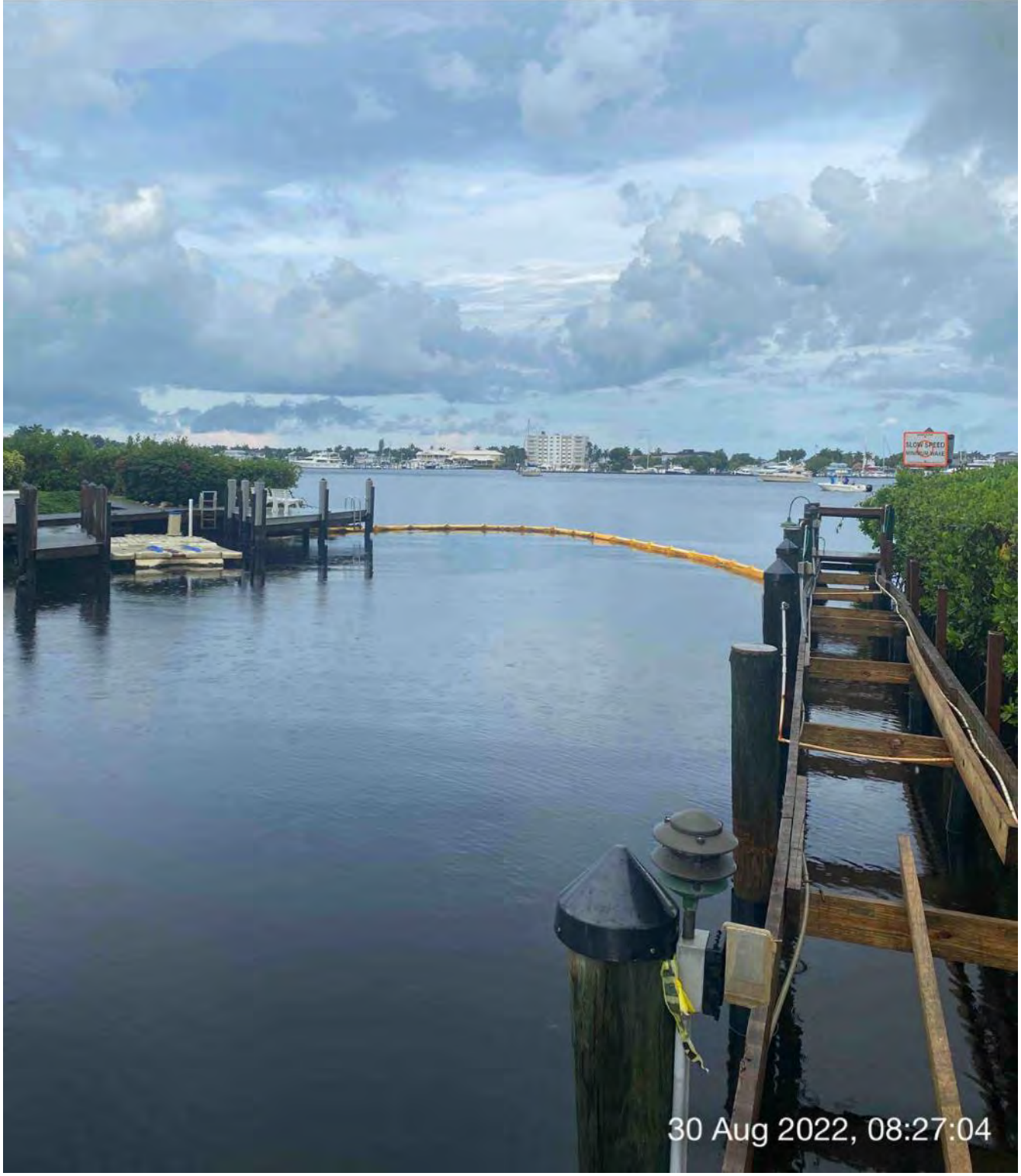
Turbidity curtain installed across the mouth of Canal W-W

☉ 253°W (T) ● 26°7'58"N, 81°47'16"W ±82ft ▲ 8ft