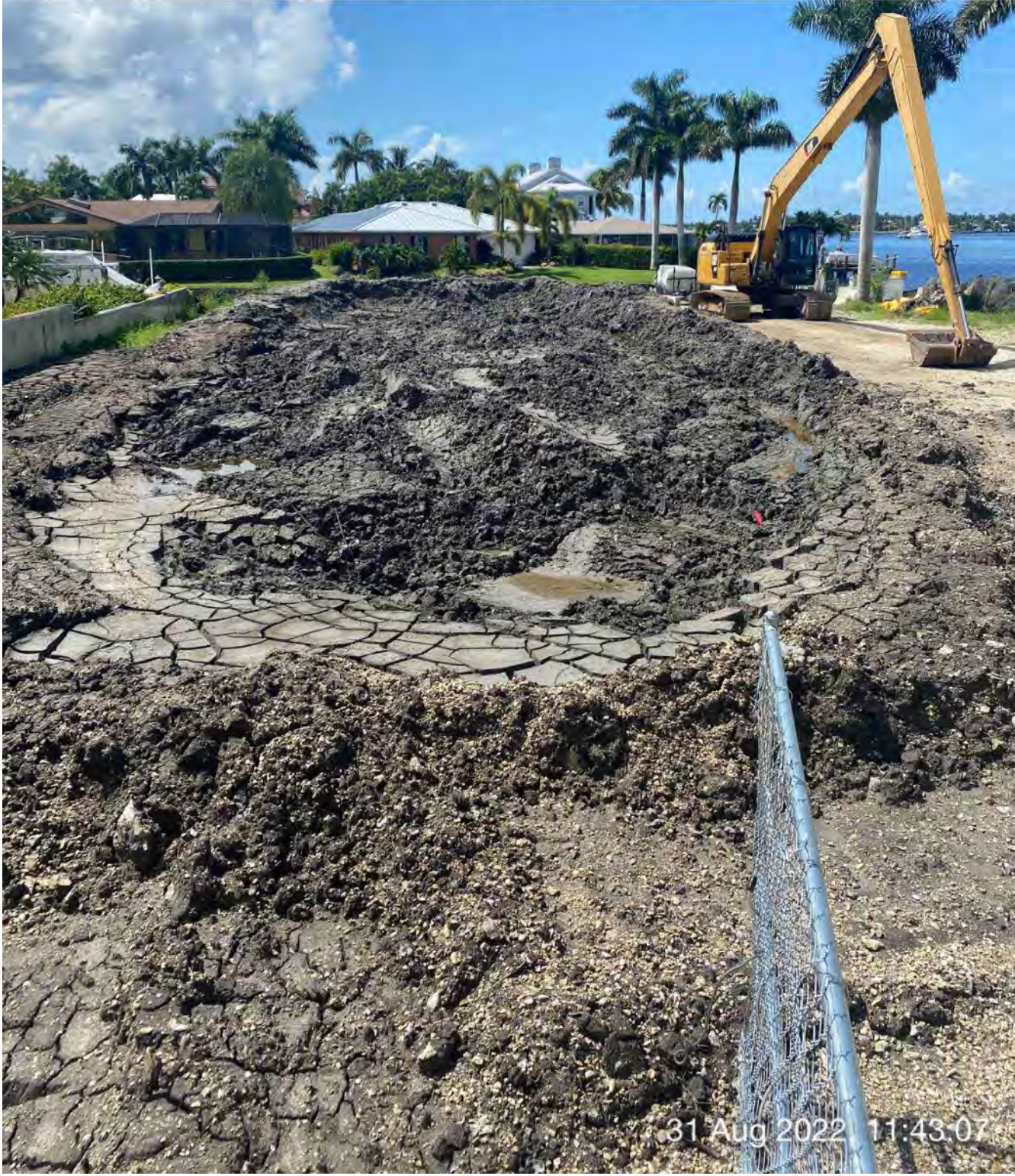
Removed material at dewatering site at 1300 Curlew Avenue

☀ 185°S (T) ☉ 26°8'15"N, 81°47'15"W ±42ft ▲ 8ft