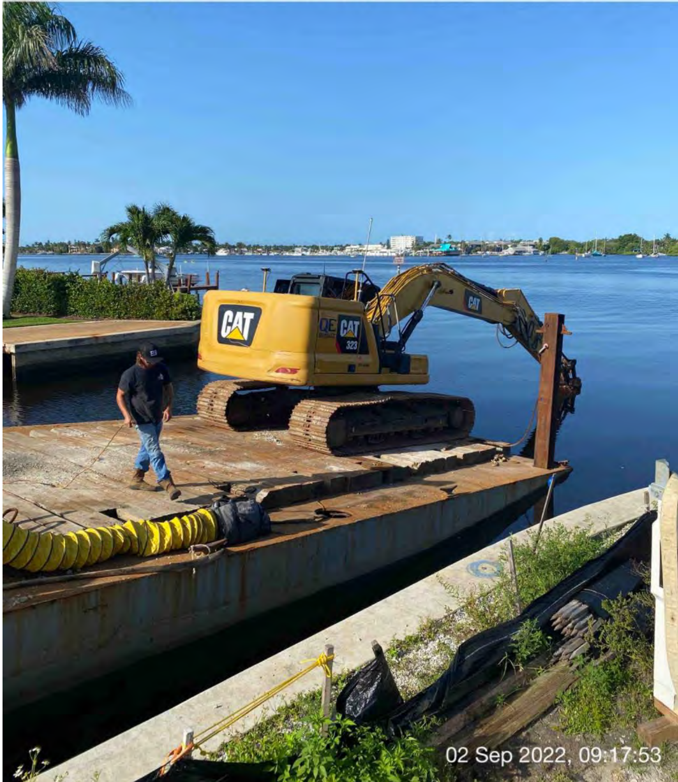
323 excavator tilting barge to allow Contractor to pump water out from bottom of barge

☀ 220°SW (T) ☉ 26°8'13"N, 81°47'16"W ±36ft ▲ 9ft