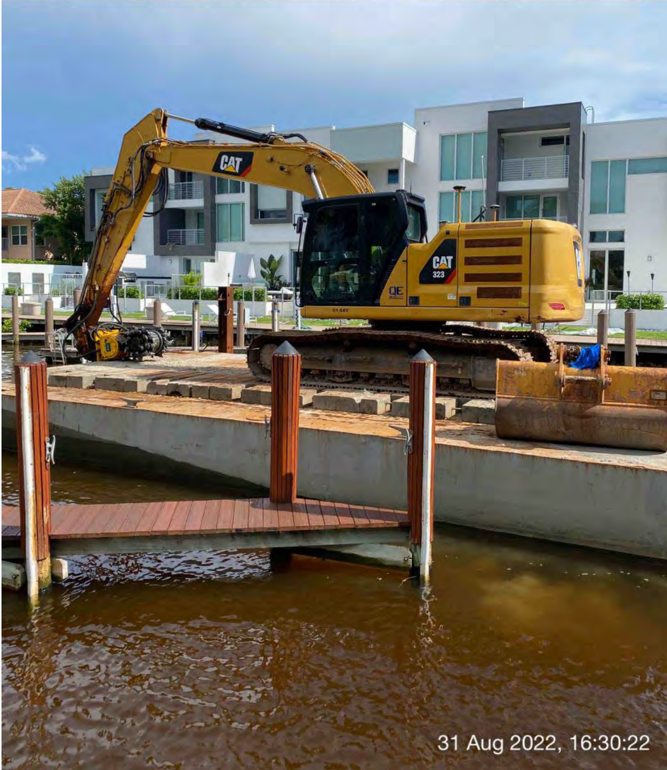
323 excavator on barge at station 15+75

E 90 SE 120 15 S 180 210 ☀ 152°SE (T) ☉ 26°7'58"N, 81°47'3"W ±36ft ▲ 9ft