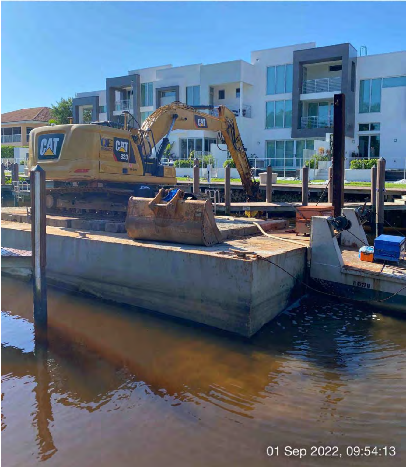
323 excavator tilting barge to allow Contractor to pump water out from bottom of barge

☀ 145°SE (T) ☉ 26°7'58"N, 81°47'3"W ±13ft ▲ 9ft