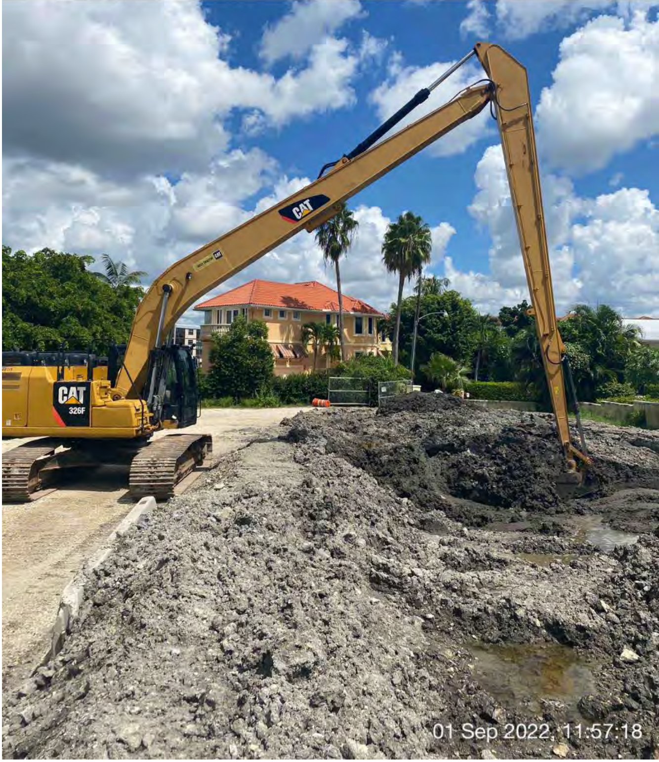
326 excavator redistributing removed material at dewatering site at 1300 Curlew Avenue.

☉ 8°N (T) ☉ 26°8'13"N, 81°47'16"W ±29ft ▲ 8ft