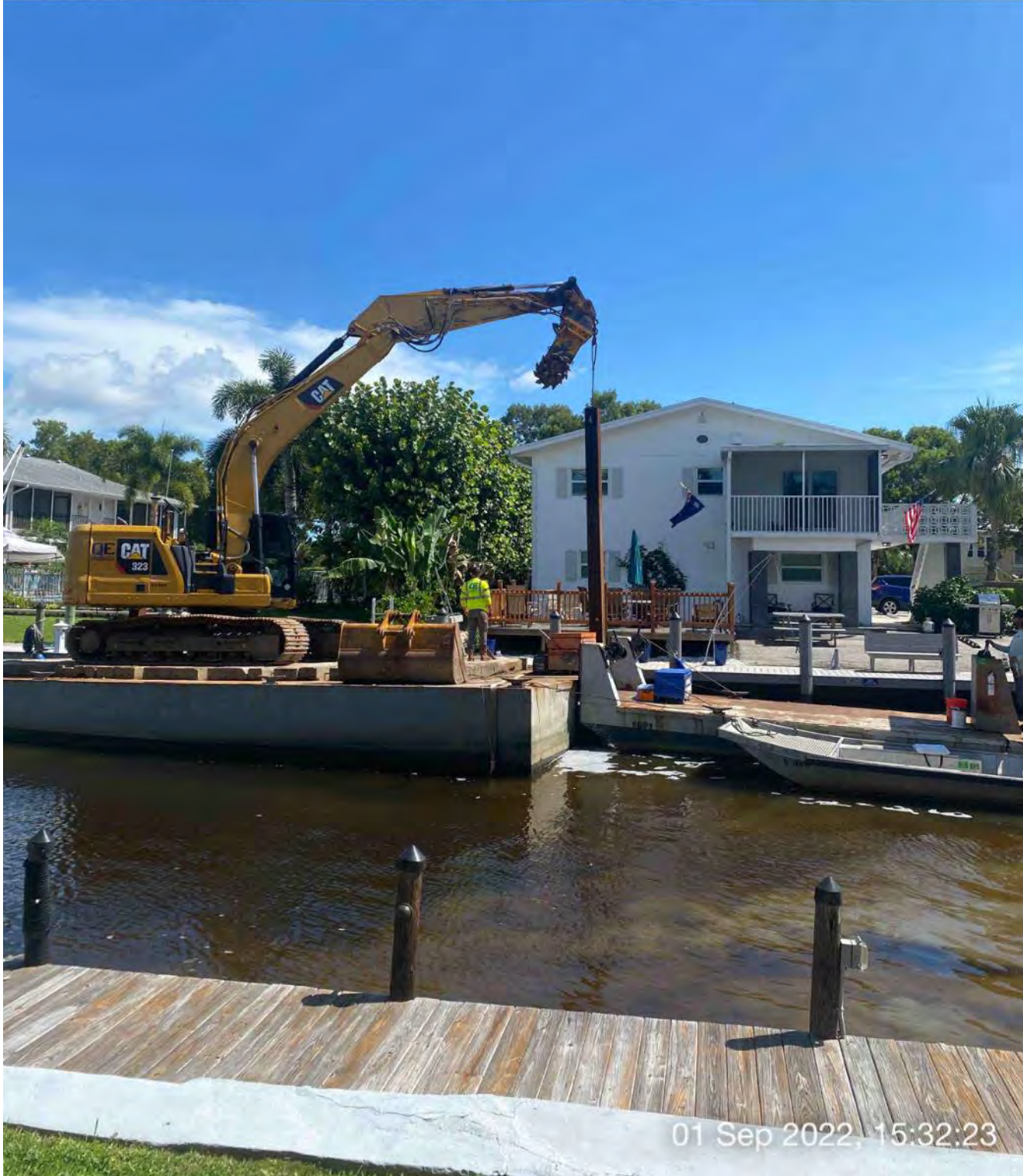
323 excavator lifting spud to allow push boat to transport barge to Canal W-W

SE S SW 120 150 180 210 ☀ 167°S (T) ☉ 26°7'58"N, 81°47'0"W ±13ft ▲ 11ft