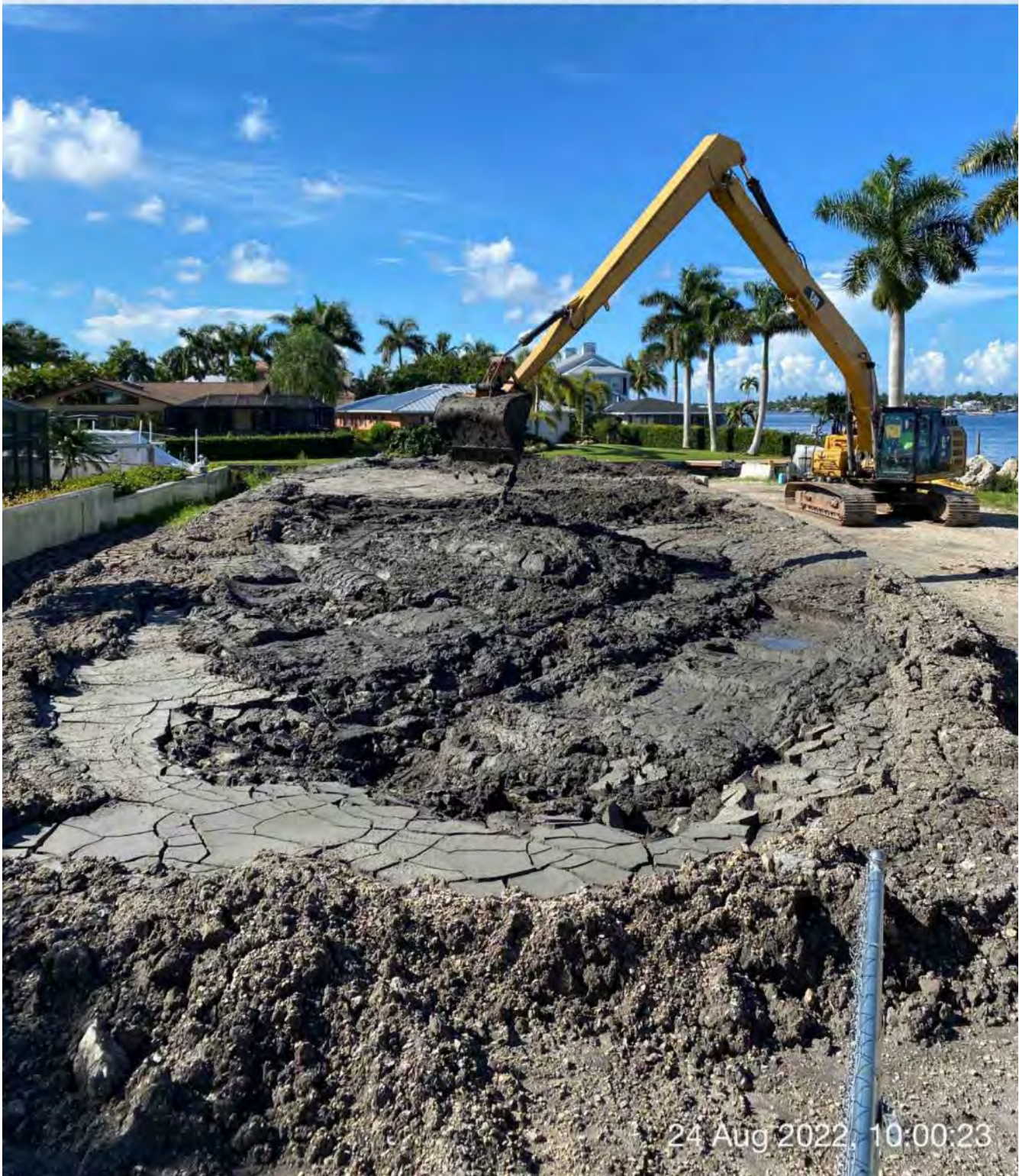
Contractor using 326 excavator to redistribute removed material at dewatering site at 1300 Curlew Avenue

SE S SW 120 150 180 210 240 ☀ 188°S (T) ☉ 26°8'14"N, 81°47'15"W ±13ft ▲ 10ft