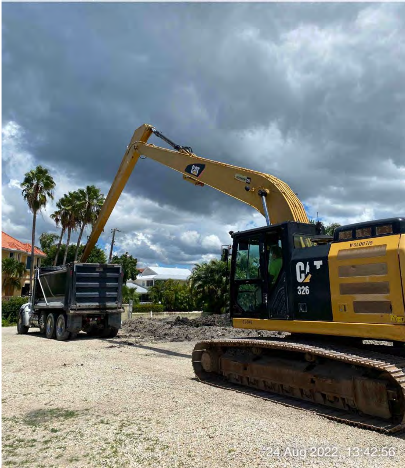
326 excavator transferring removed material from dewatering site to dump truck bed at 1300 Curlew Avenue

N 0 30 60 90 NE E 330 0 30 60 90 ☀ 36°NE (T) ☉ 26°8'14"N, 81°47'16"W ±13ft ▲ 10ft