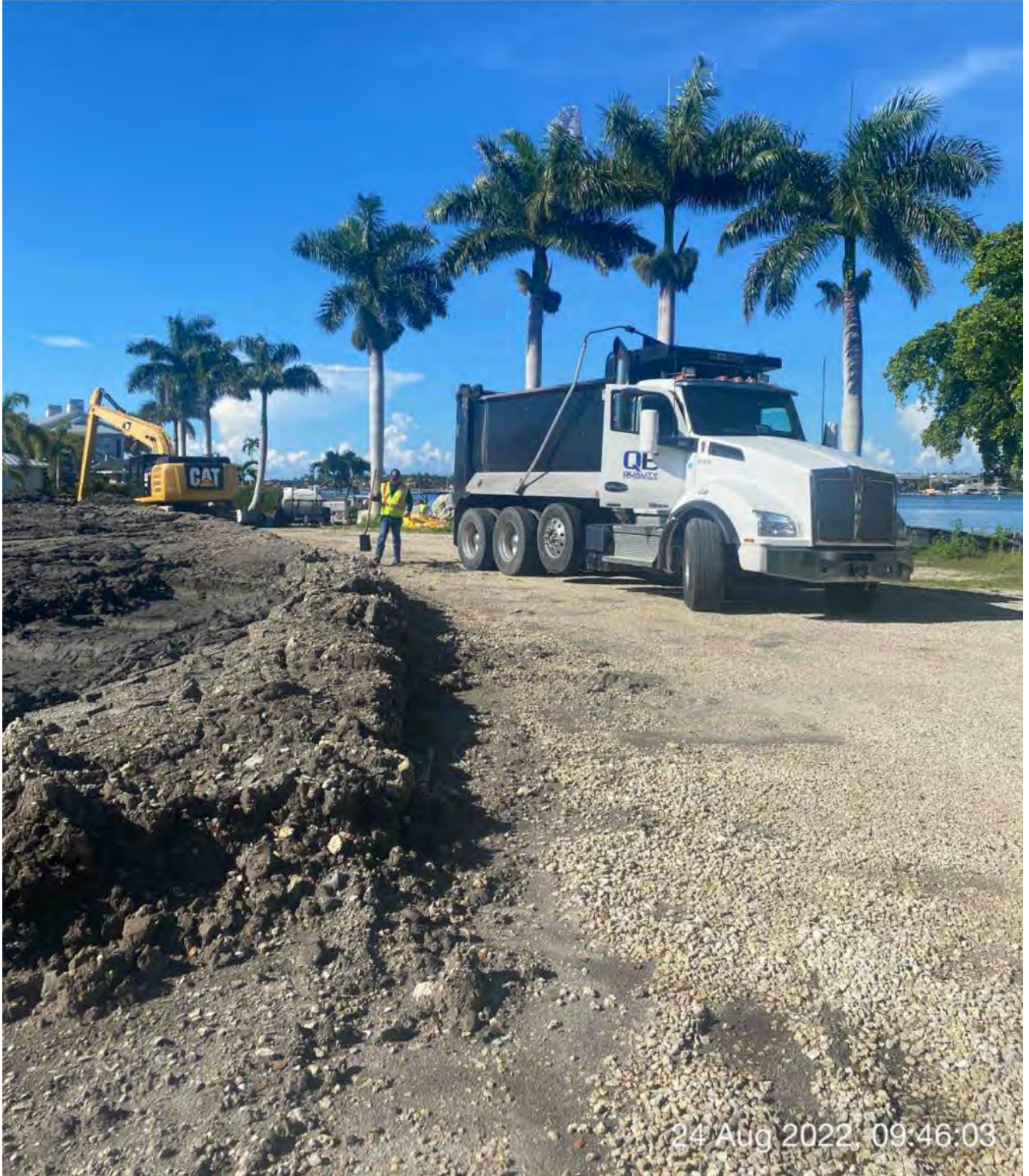
Dump truck on site at 1300 Curlew Avenue

S SW W 150 180 210 240 270 ☉ 211°SW (T) ☉ 26°8'14"N, 81°47'15"W ±39ft ▲ 8ft