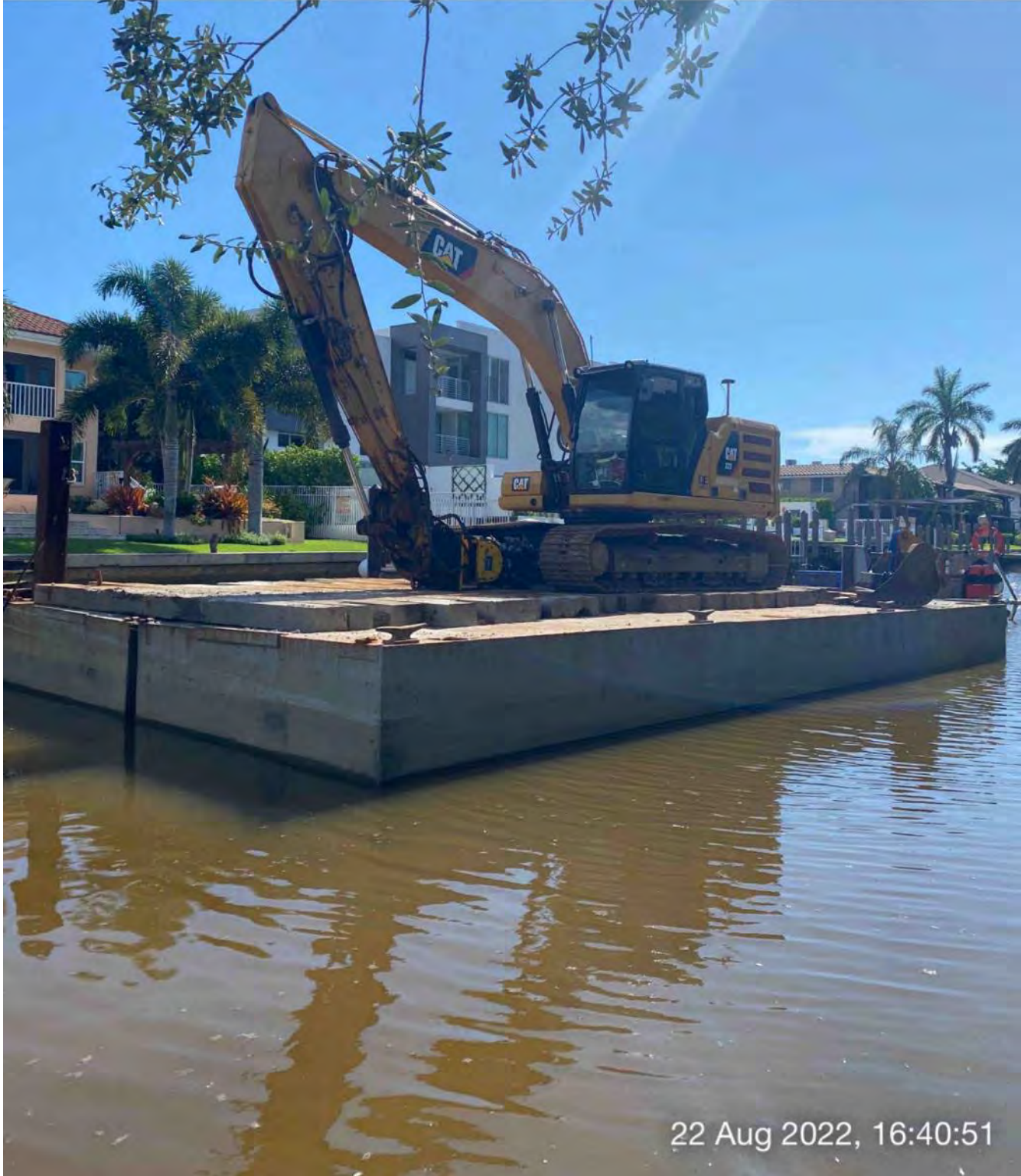
323 excavator, barge, and push boat in Canal W-W at station 17+00

S 180 SW 210 240 W 270 300 ☀ 236°SW (T) ☉ 26°7'58"N, 81°47'0"W ±26ft ▲ 8ft