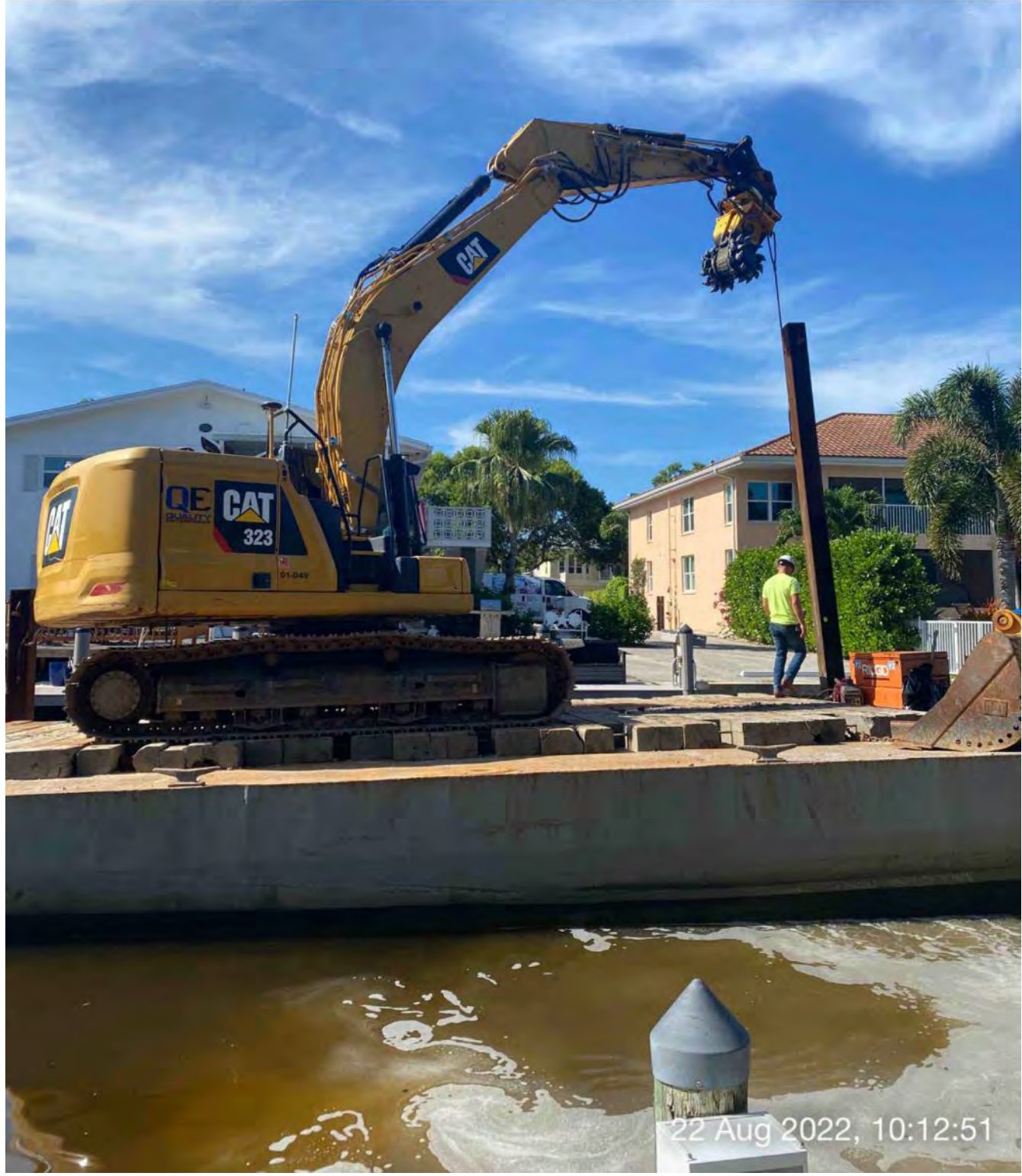
323 excavator lifting spud to allow push boat to mobilize barge at station 18+25

☉ 187°S (T) ☉ 26°7'58"N, 81°47'0"W ±16ft ▲ 8ft