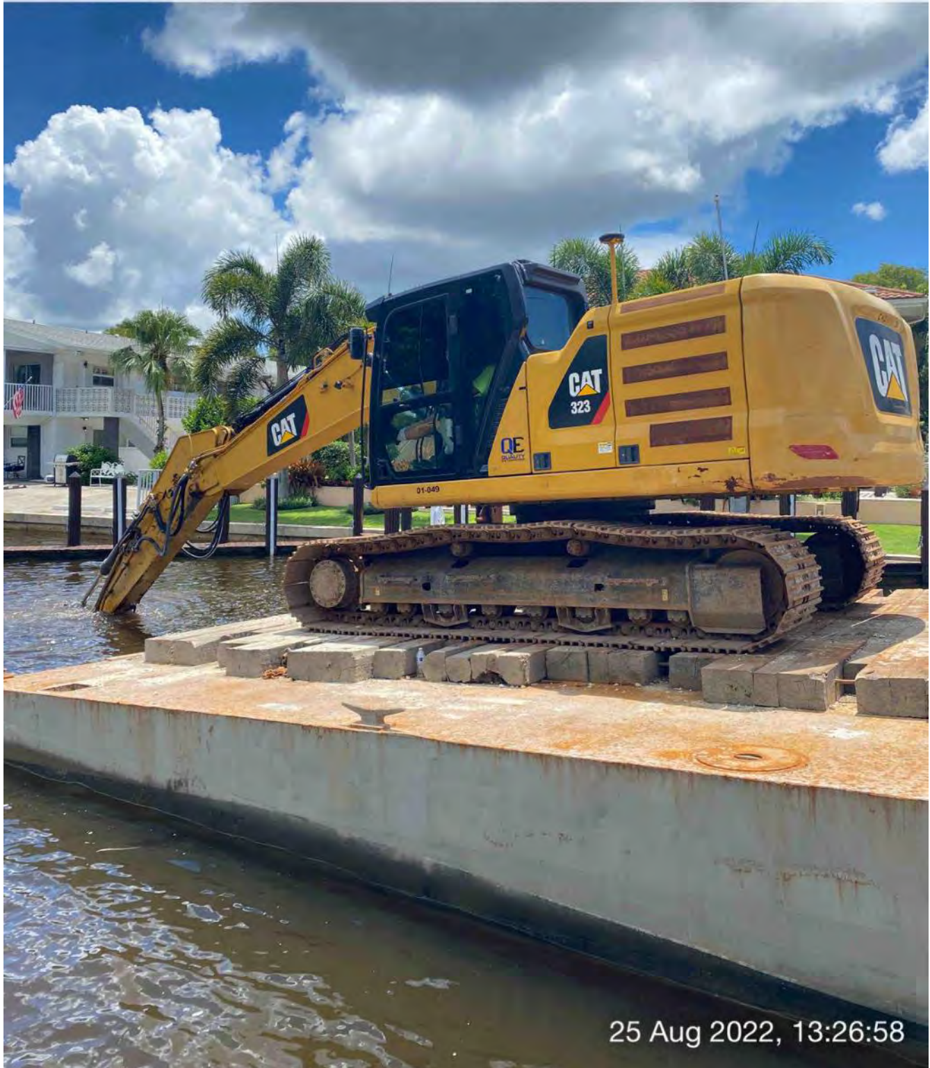
323 excavator grinding rock at station 16+75

☀ 148°SE (T) ● 26°7'58"N, 81°47'1"W ±32ft ▲ 8ft