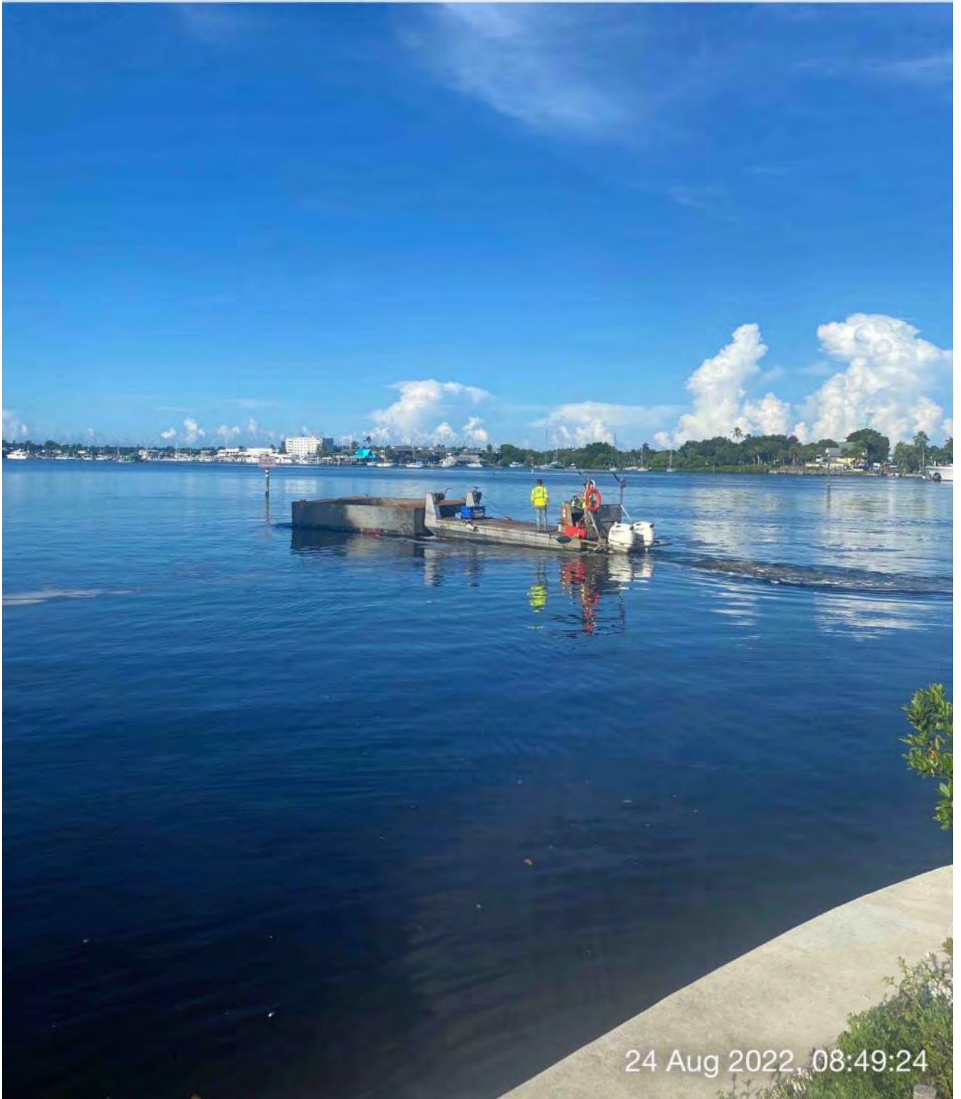
Push boat transporting hopper from Canal CC-CC to Canal W-W for Epiroc transport

S 180 SW 210 240 W 270 30 ☉ 230°SW (T) ● 26°8'13"N, 81°47'16"W ±39ft ▲ 9ft