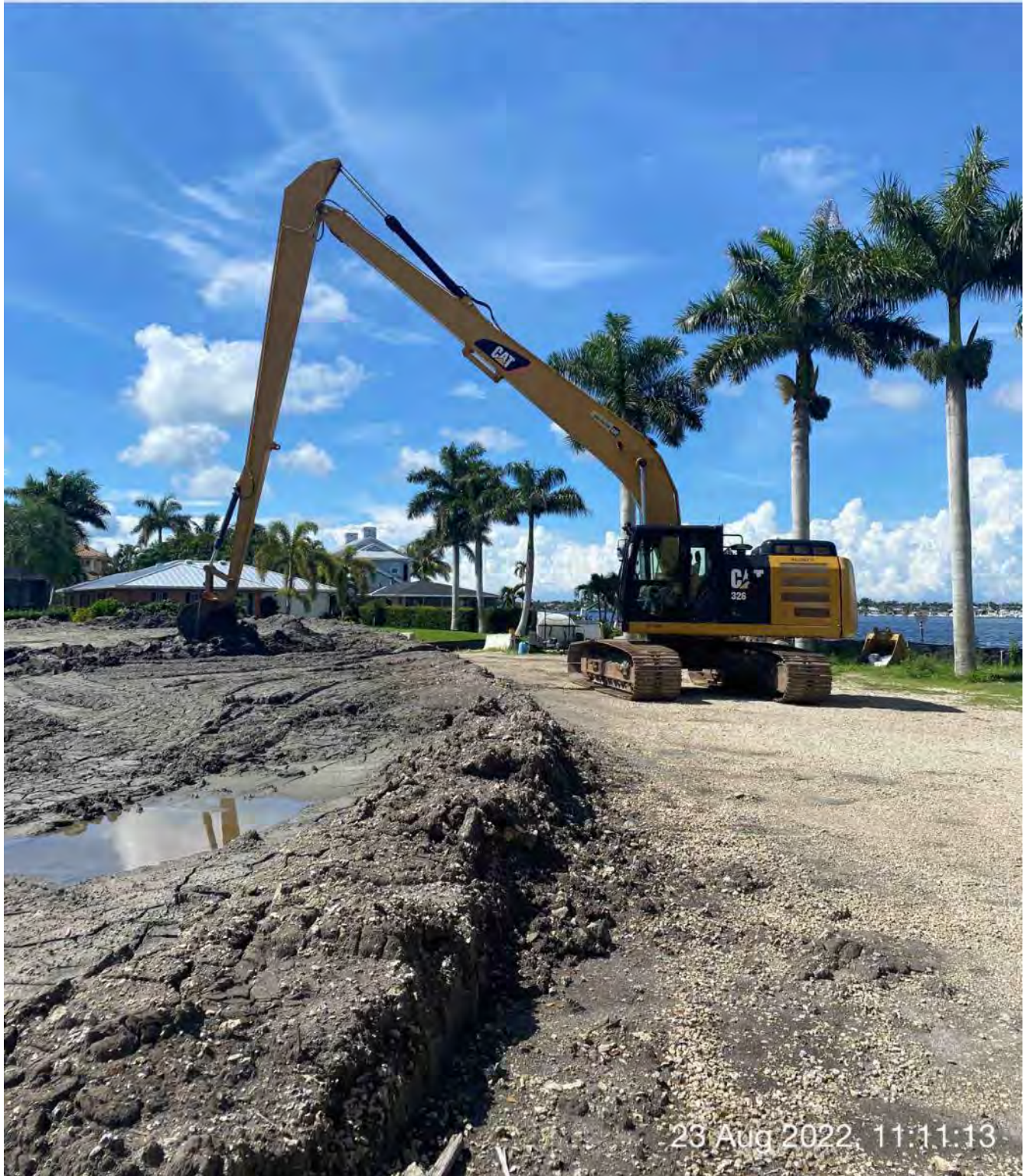
Contractor using 326 excavator to redistribute removed material at dewatering site at 1300 Curlew Avenue

☉ 190°S (T) ● 26°8'14"N, 81°47'15"W ±29ft ▲ 8ft