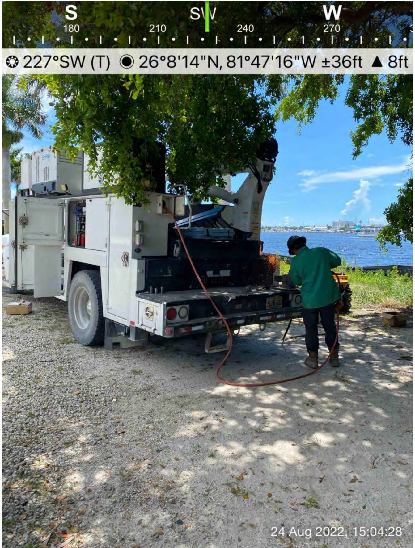
Mechanic welding bolt for Epiroc grinder