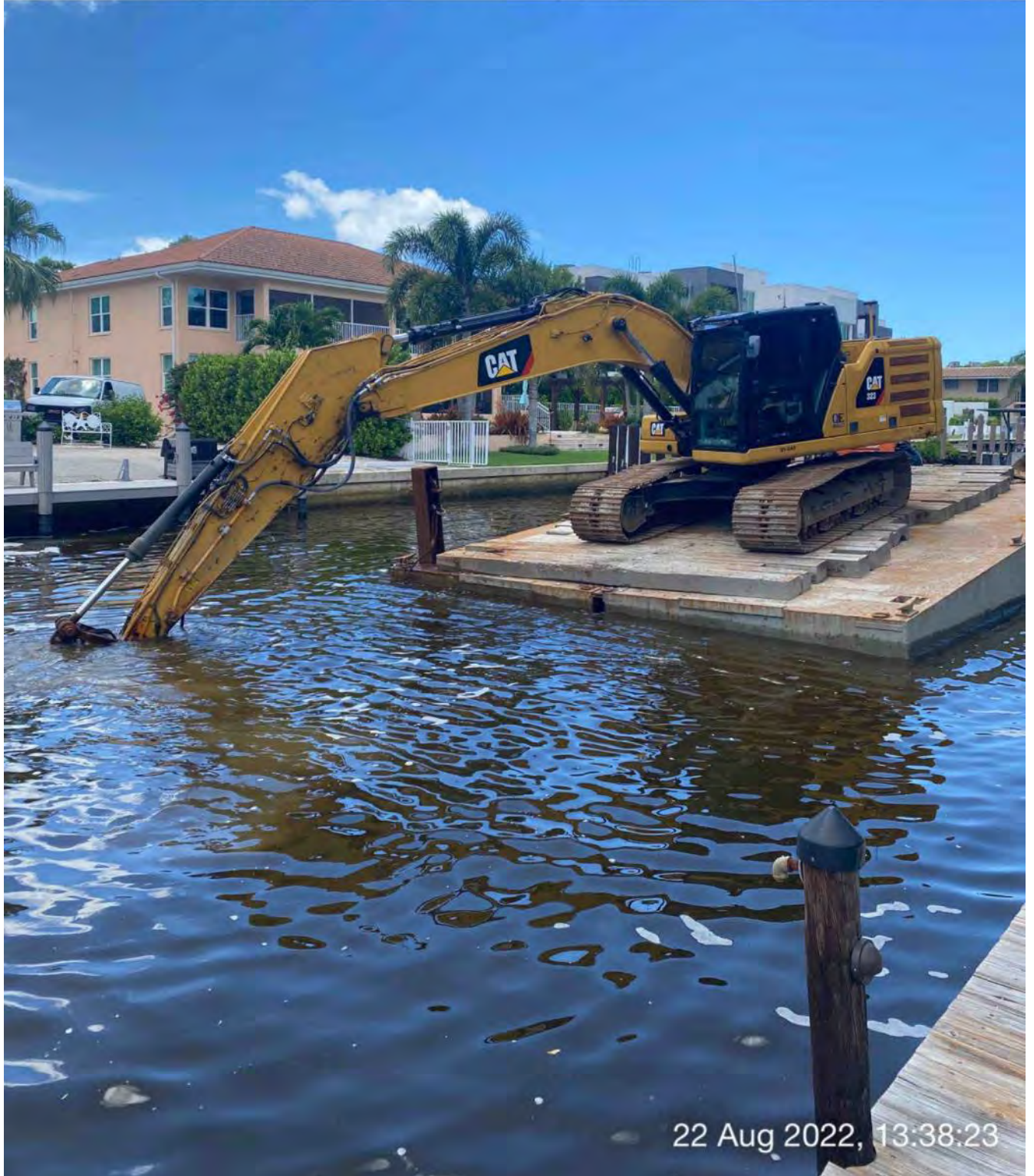
323 excavator grinding rock at station 17+00

S 180 210 SW 240 W 270 ☀ 223°SW (T) ☉ 26°7'58"N, 81°47'0"W ±29ft ▲ 9ft