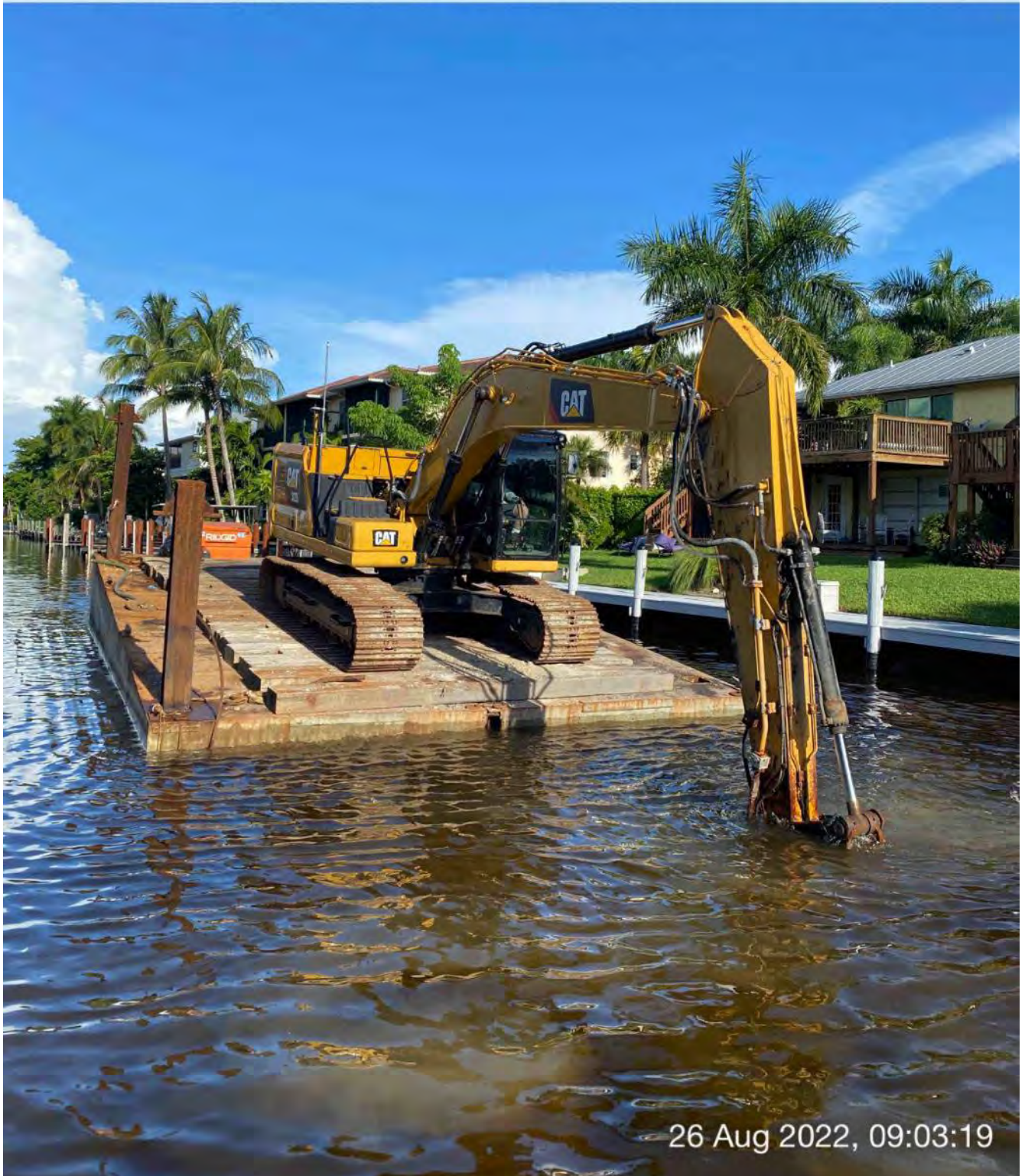
323 excavator grinding rock at station 16+50

W NW N 240 270 300 330 0 ☀ 305°NW (T) ☉ 26°7'58"N, 81°47'1"W ±36ft ▲ 8ft