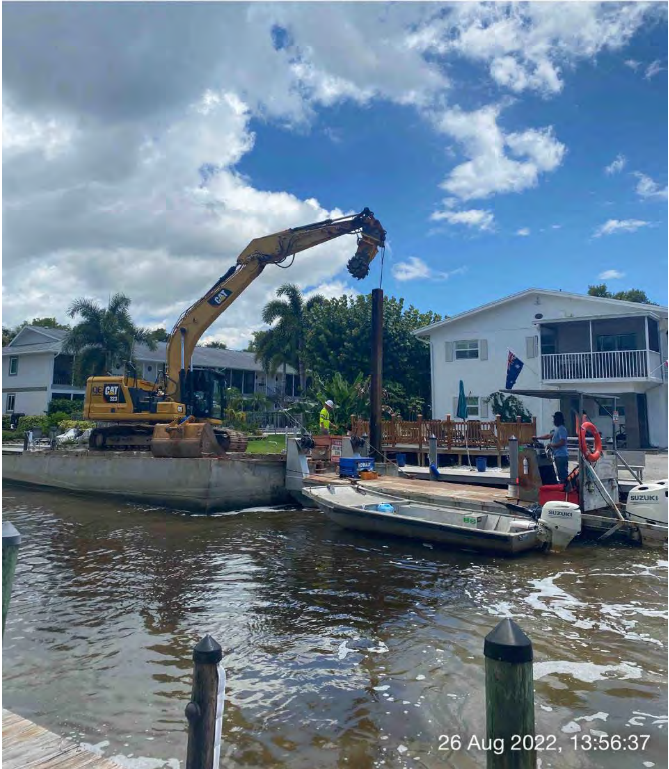
323 excavator lifting spud to allow push boat to mobilize barge at station 18+00

E 90 SE 150 S 180 210 ☀ 146°SE (T) ☉ 26°7'58"N, 81°47'0"W ±26ft ▲ 8ft