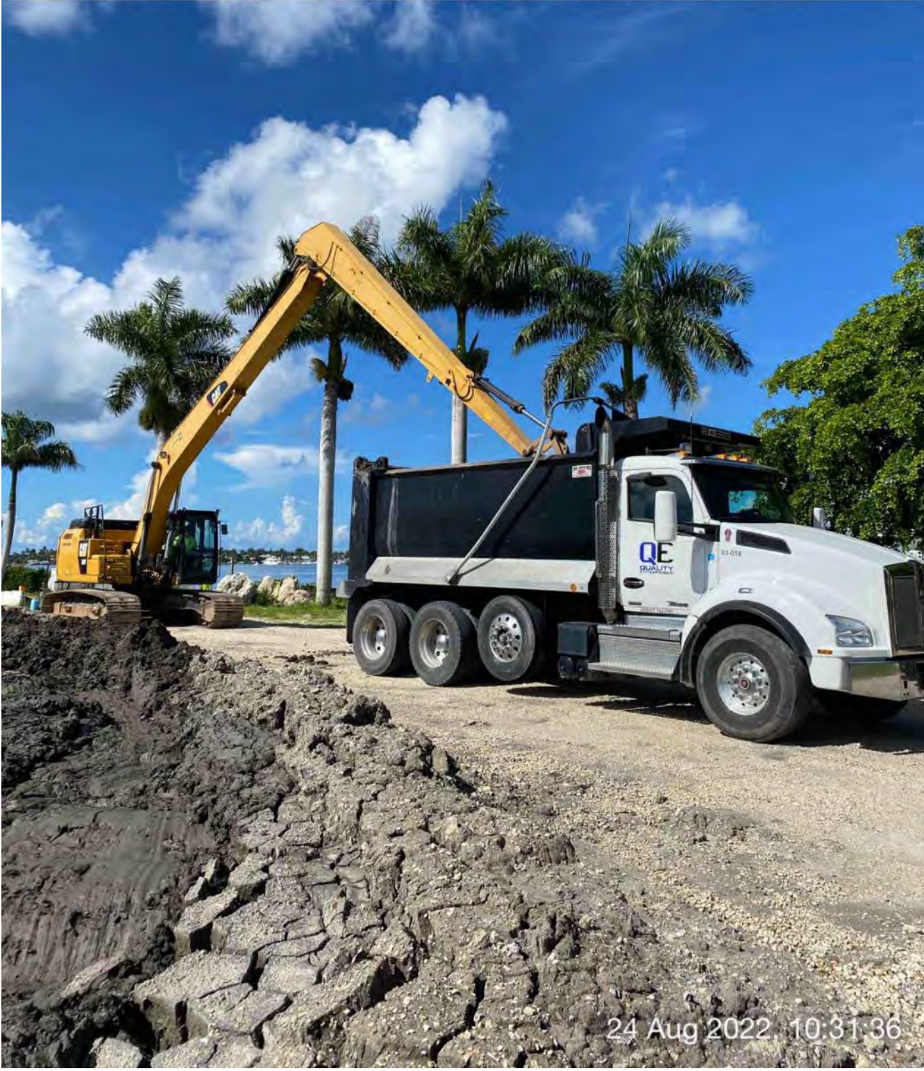
326 excavator transferring removed material from dewatering site to dump truck bed at 1300 Curlew Avenue

☉ 224°SW (T) ☉ 26°8'14"N, 81°47'15"W ±22ft ▲ 8ft