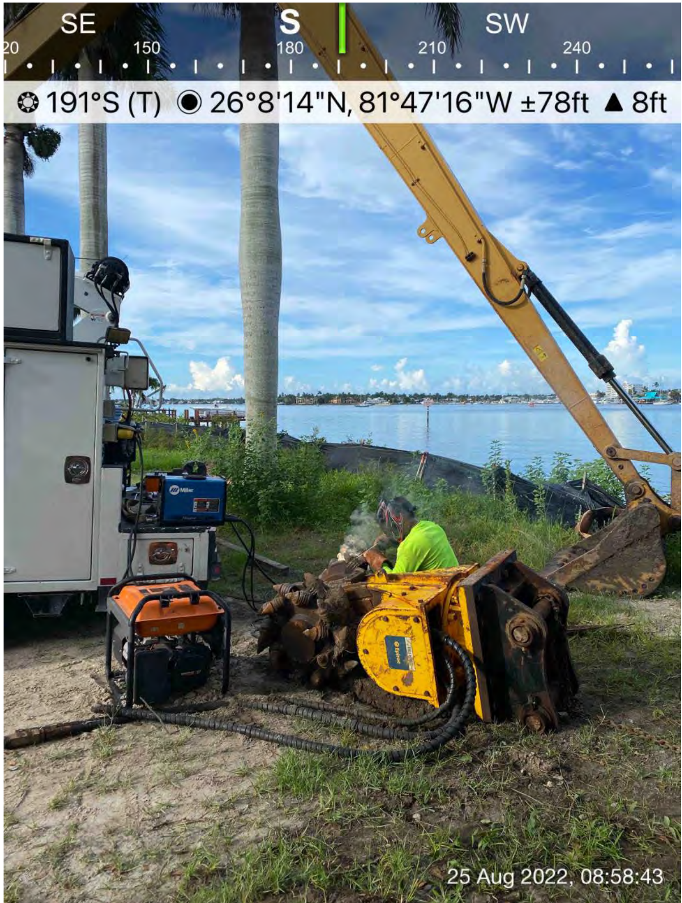
Mechanic welding Epiroc grinder sleeves on site at 1300 Curlew Avenue