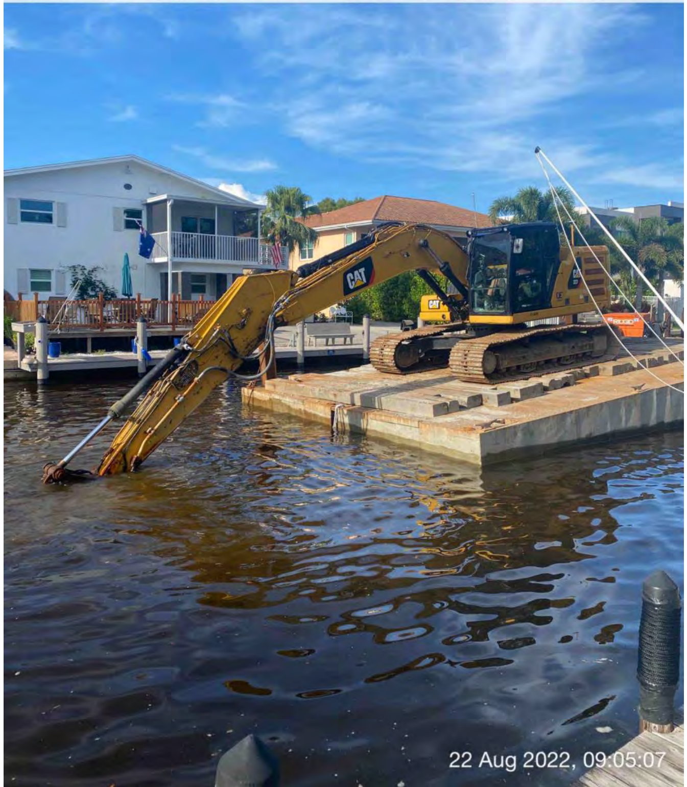
323 excavator grinding rock at station 18+00

☉ 208°SW (T) ● 26°7'58"N, 81°46'59"W ±29ft ▲ 8ft