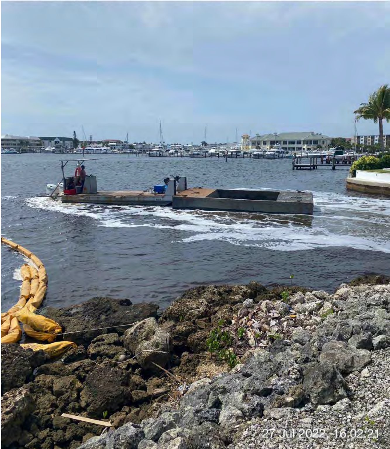
Push boat transporting full hopper of removed material from Canal BB-BB to Canal CC-CC

☉ 90°E (T) ● 26°8'8"N, 81°47'16"W ±36ft ▲ 8ft