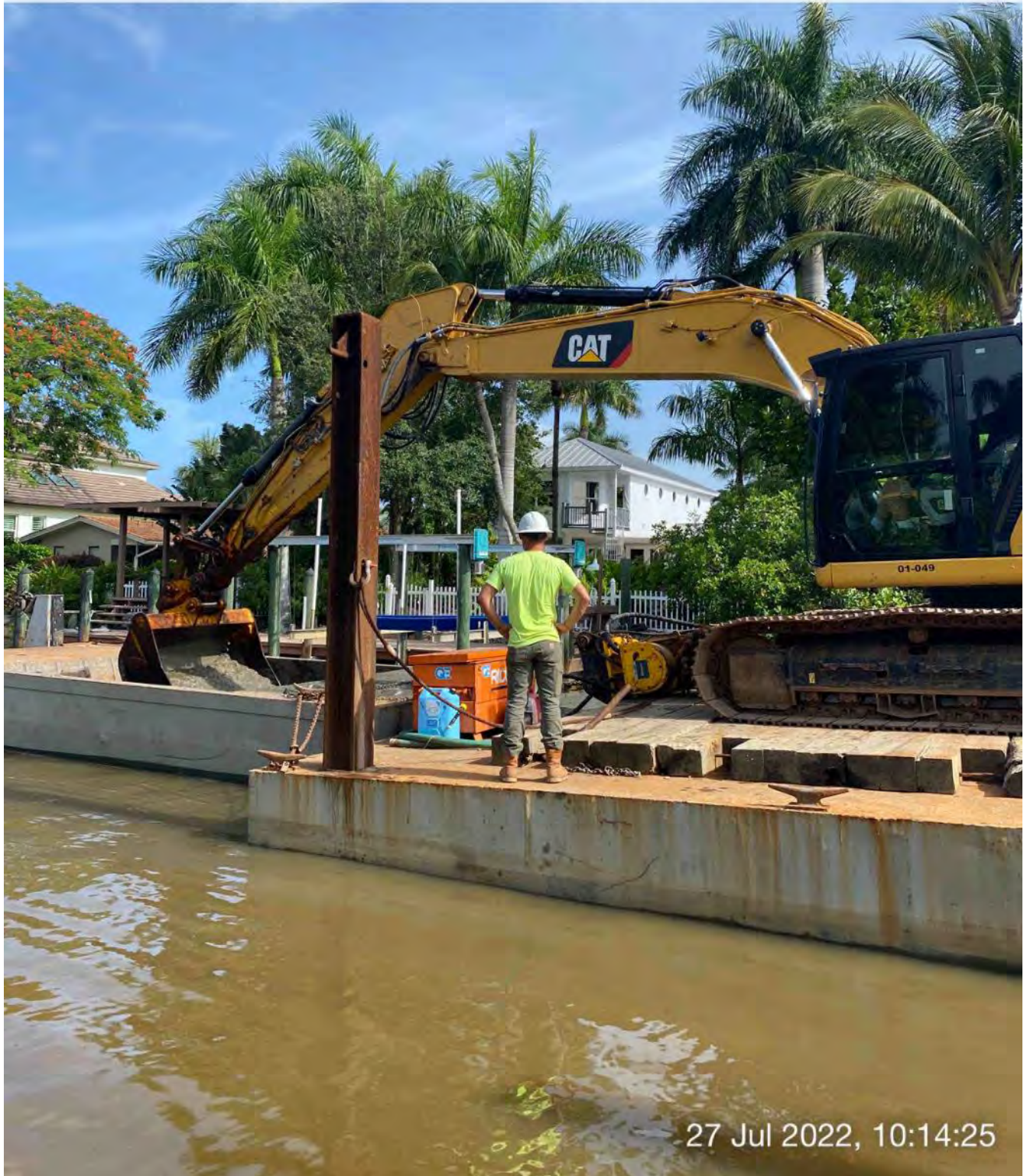
323 excavator removing material from station 8+25 and transferring to hopper

☉ 332°NW (T) ☉ 26°8'8"N, 81°47'9"W ±26ft ▲ 8ft