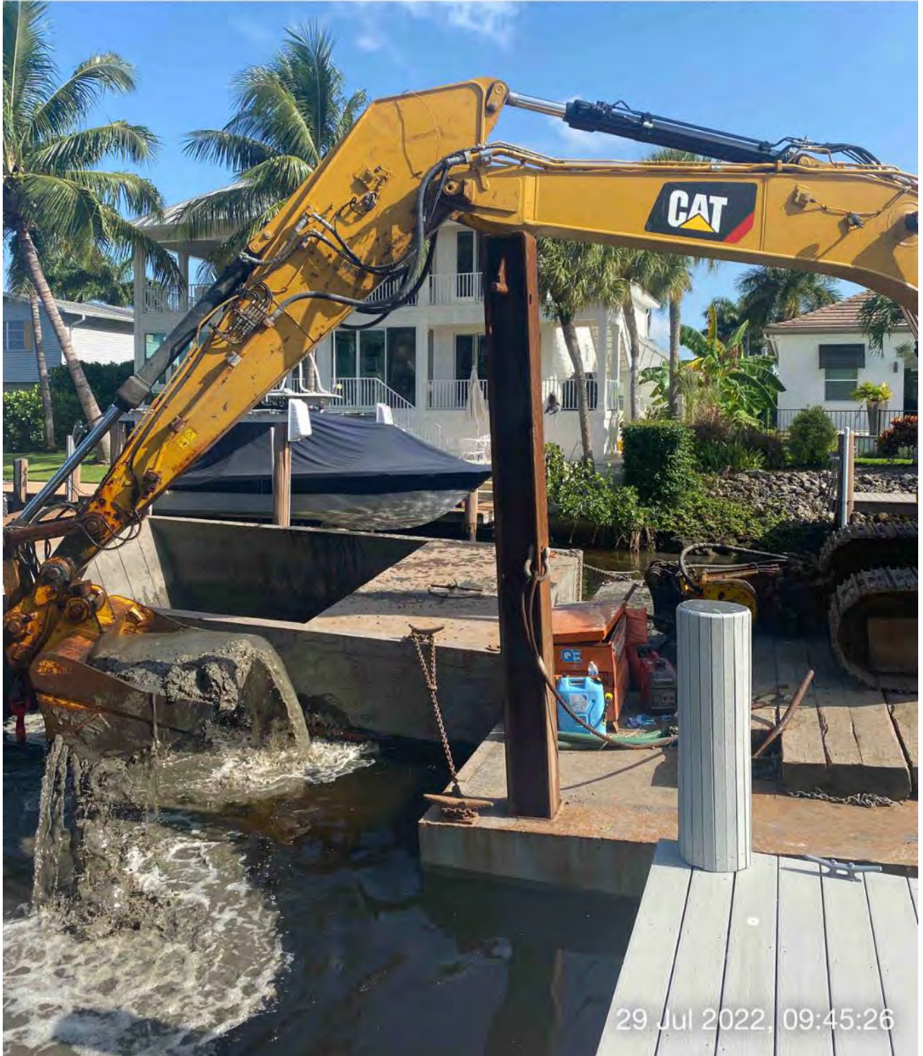
323 excavator removing material from station 5+00 and transferring to hopper

W 270 NW 300 33 N 0 30 ☉ 332°NW (T) ● 26°8'8"N, 81°47'12"W ±13ft ▲ 11ft