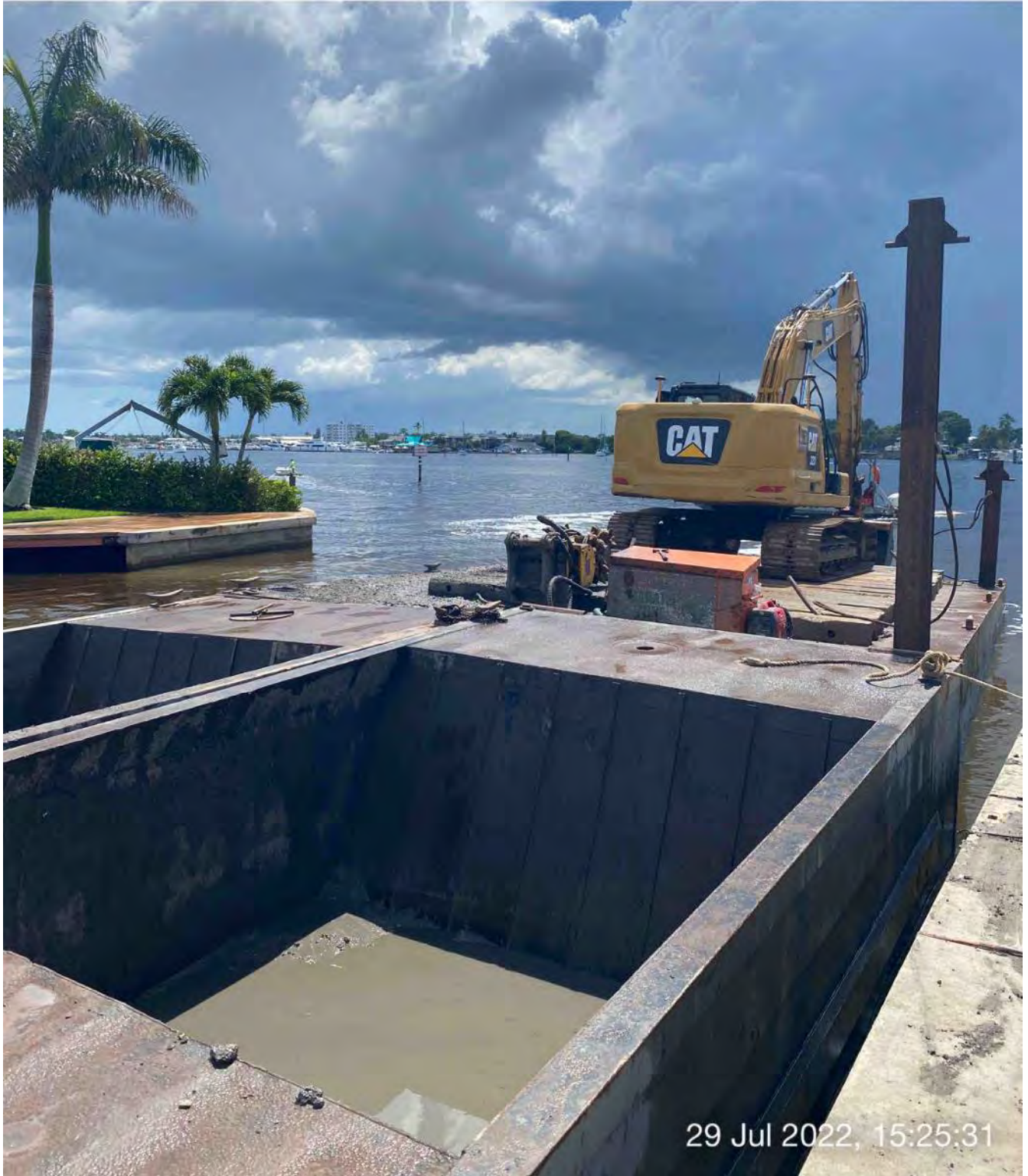
2 hoppers, barge, and 323 excavator staged in Canal CC-CC between stations 1+00 and 2+00

☉ 230°SW (T) ☉ 26°8'13"N, 81°47'16"W ±59ft ▲ 8ft