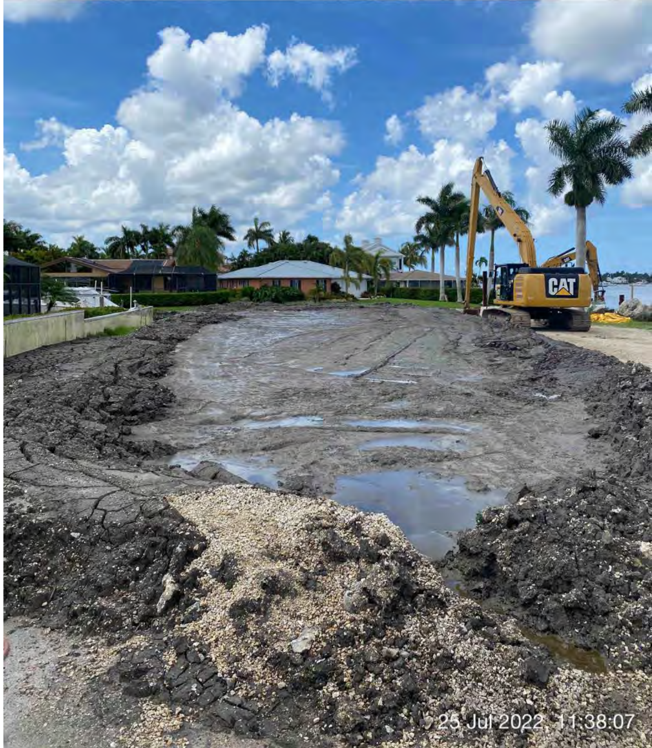
326 excavator and removed material at the dewatering site at 1300 Curlew Avenue

SE S SW 0 150 180 210 240 ☀ 192°S (T) ● 26°8'15"N, 81°47'15"W ±65ft ▲ 8ft