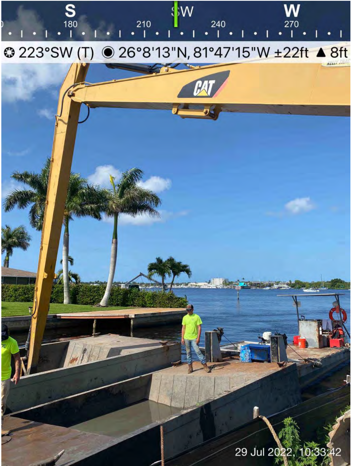
Push boat dropping off full hopper of material in Canal CC-CC and picking up empty hopper