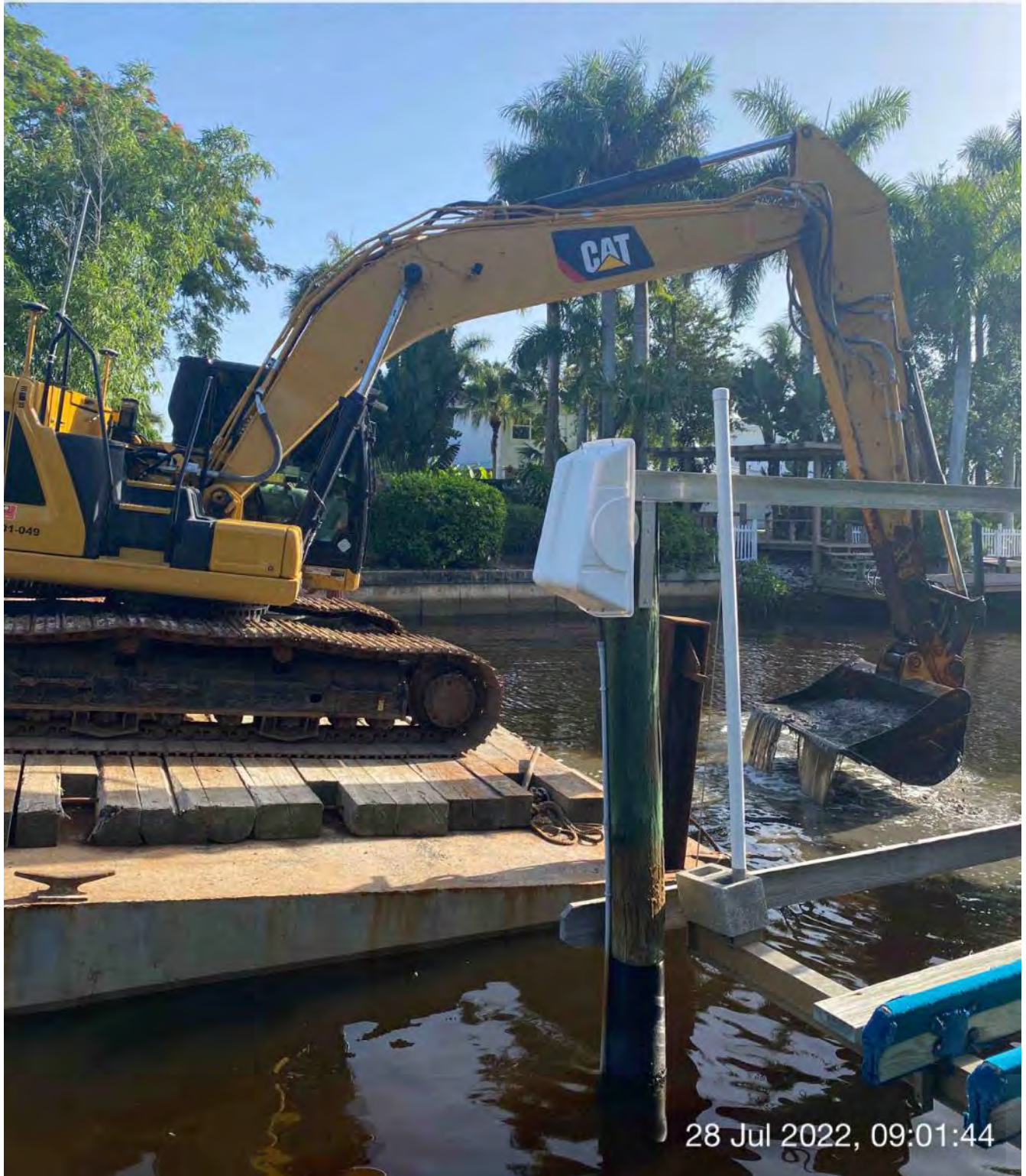
323 excavator removing material from station 7+50

☀ 25°NE (T) ● 26°8'8"N, 81°47'10"W ±22ft ▲ 8ft