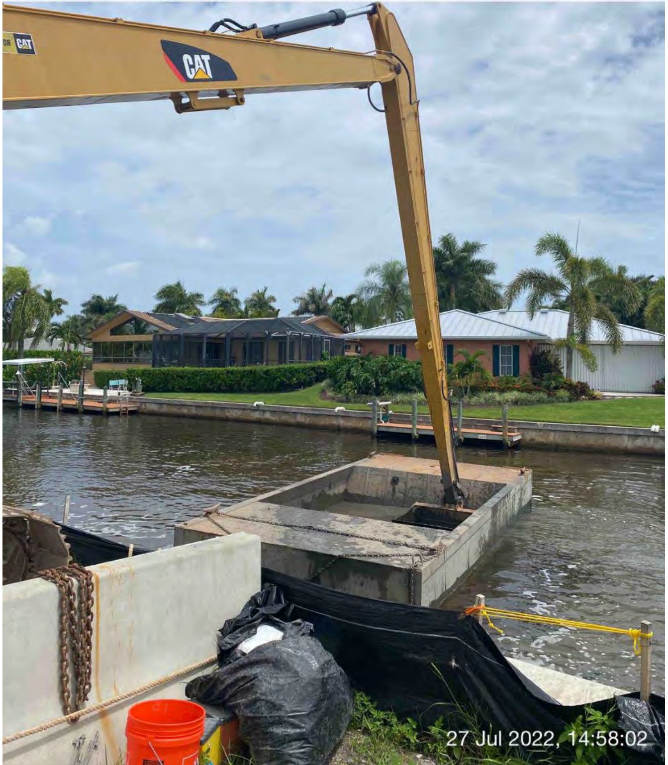
326 excavator transferring removed material from hopper to dewatering site at 1300 Curlew Avenue

☀ 150°SE (T) ☉ 26°8'13"N, 81°47'16"W ±13ft ▲ 9ft