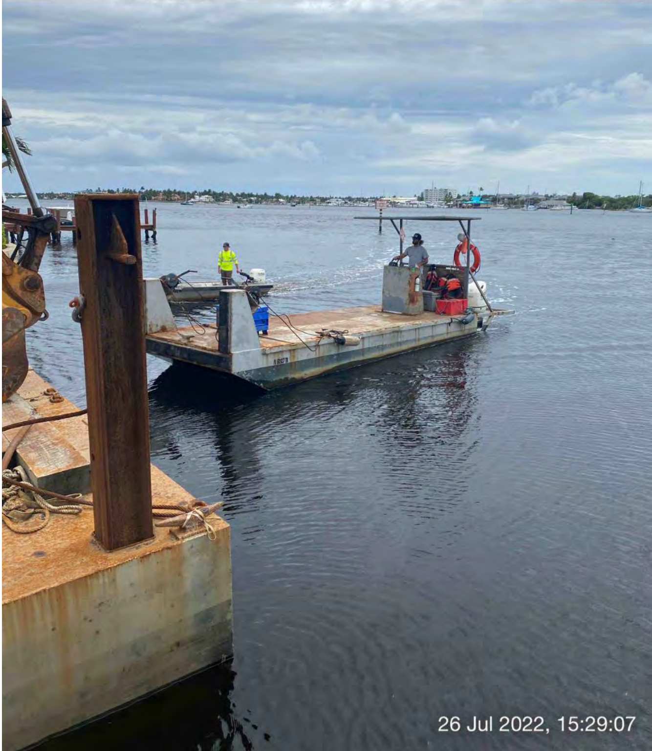
Contractor transporting push boat and support boat back from boat yard after servicing

☉ 223°SW (T) ☉ 26°8'13"N, 81°47'16"W ±16ft ▲ 8ft