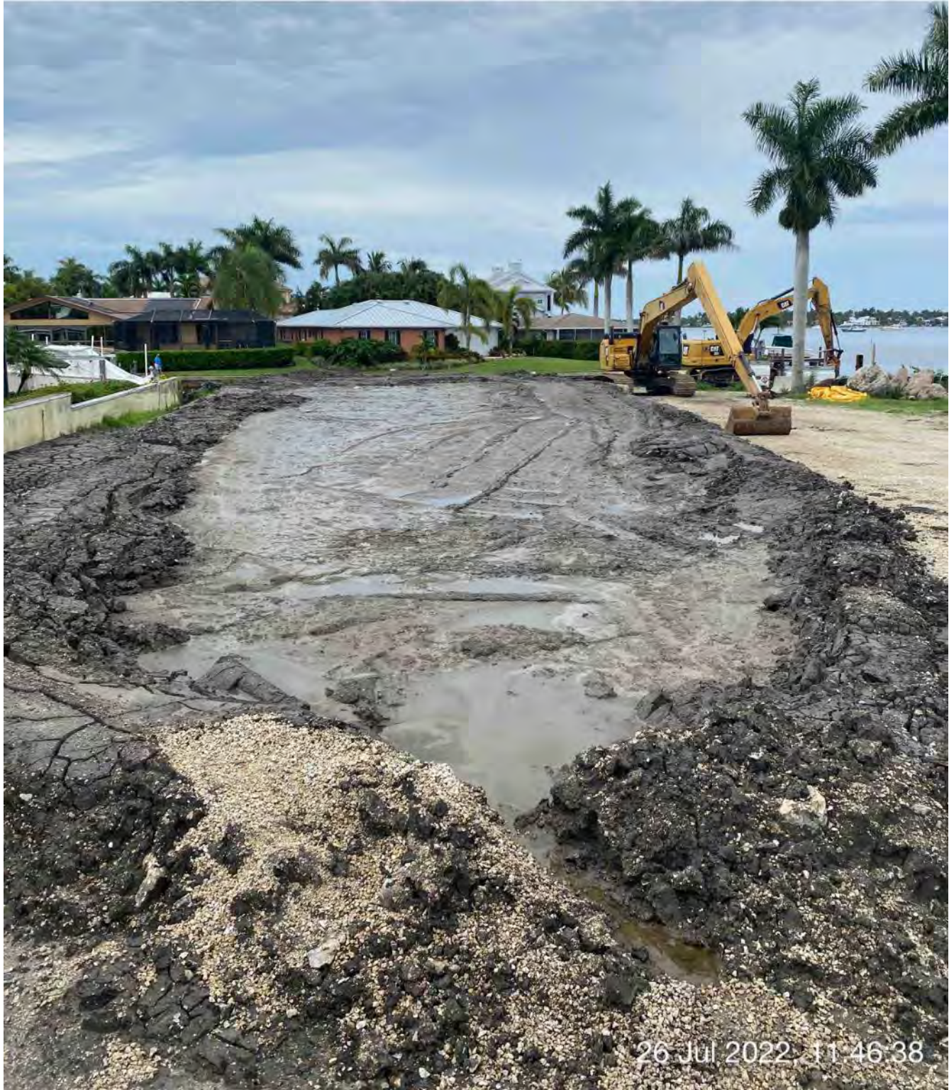
326 excavator and removed material at the dewatering site at 1300 Curlew Avenue

☀ 187°S (T) ● 26°8'15"N, 81°47'15"W ±62ft ▲ 8ft