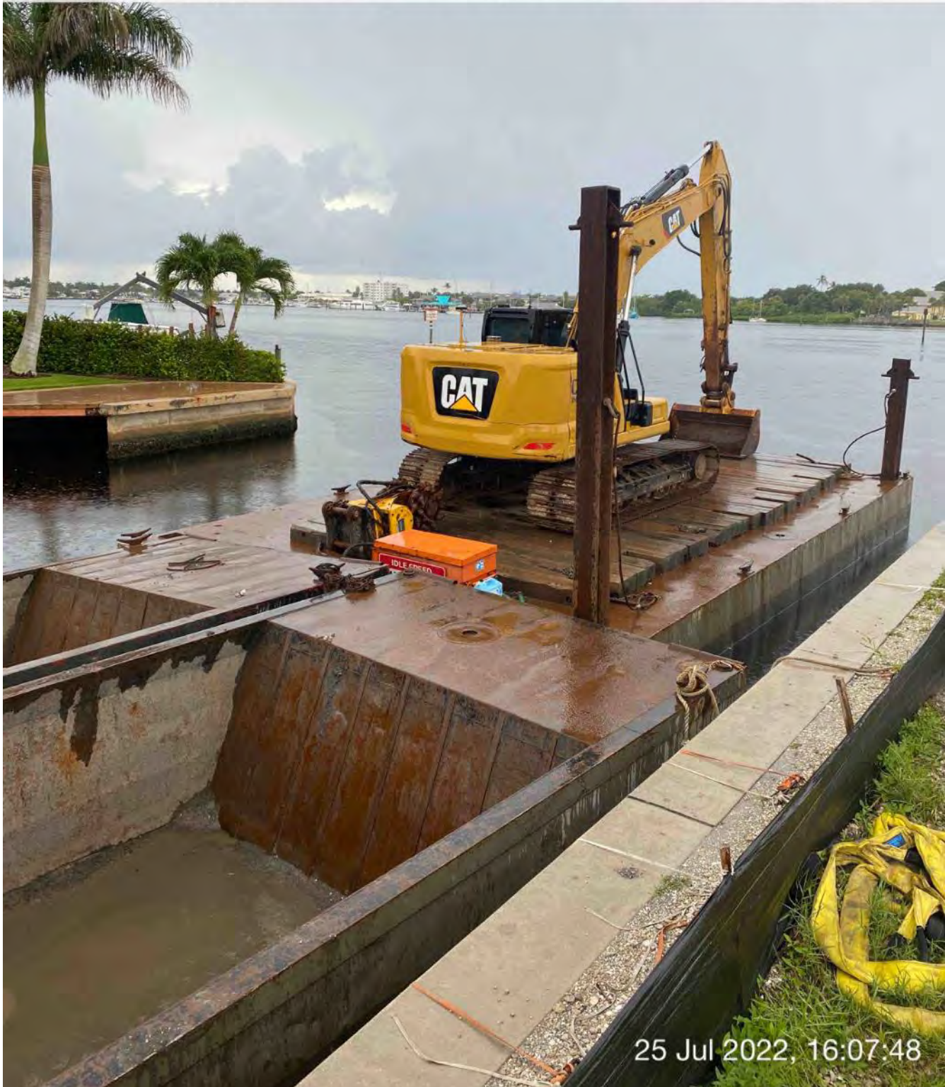
2 hoppers, barge, and 323 excavator staged in canal CC-CC between stations 1+00 and 2+00

☉ 236°SW (T) ☉ 26°8'13"N, 81°47'15"W ±85ft ▲ 9ft