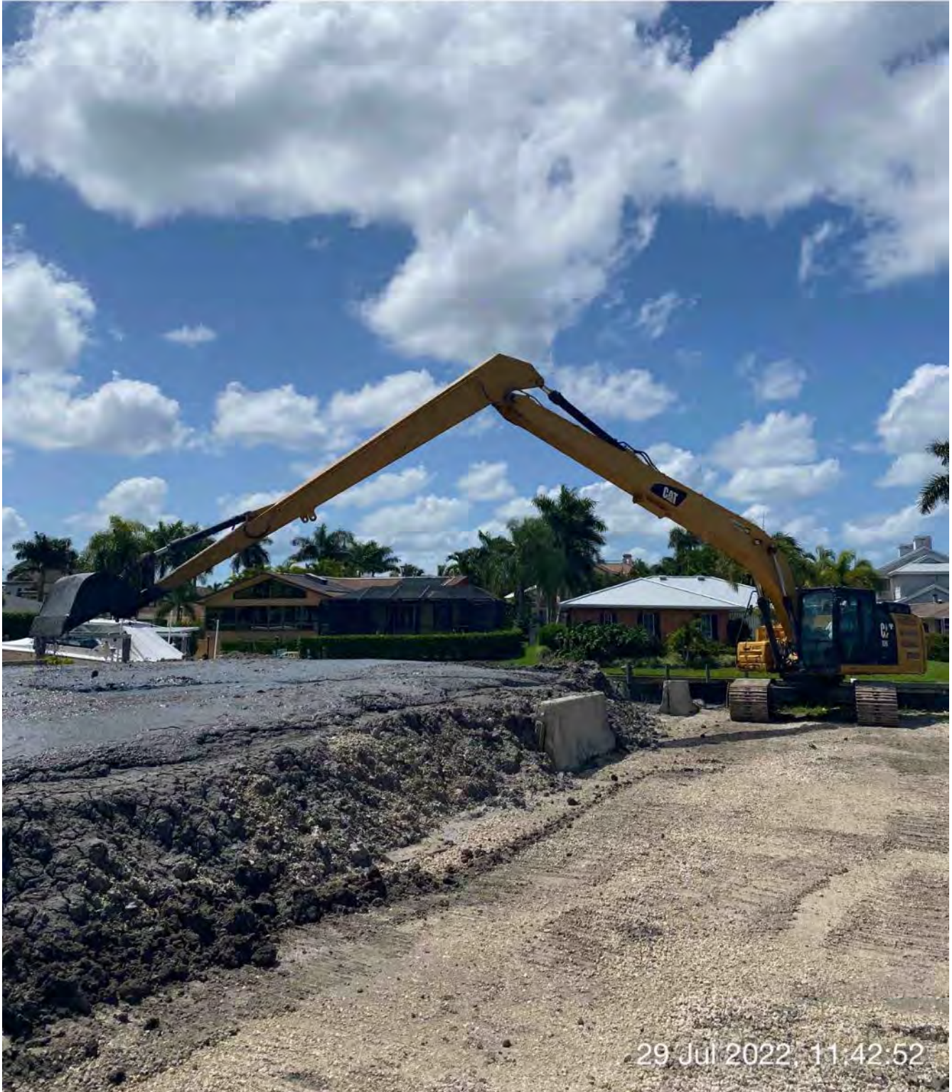
326 excavator transferring removed material from hopper to dewatering site at 1300 Curlew Avenue

☀ 163°S (T) ● 26°8'14"N, 81°47'16"W ±13ft ▲ 9ft