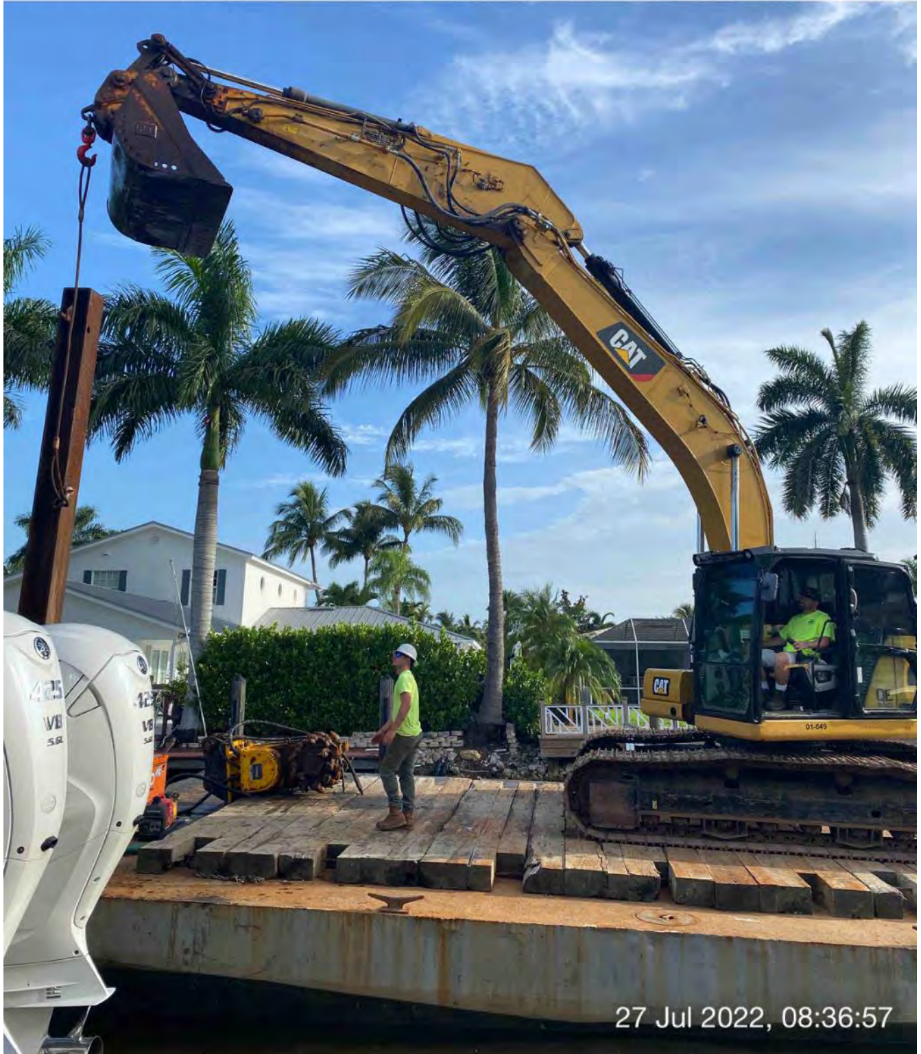
323 excavator lifting spud to allow push boat to mobilize barge at station 8+50

☀ 349°N (T) ● 26°8'8"N, 81°47'8"W ±42ft ▲ 9ft