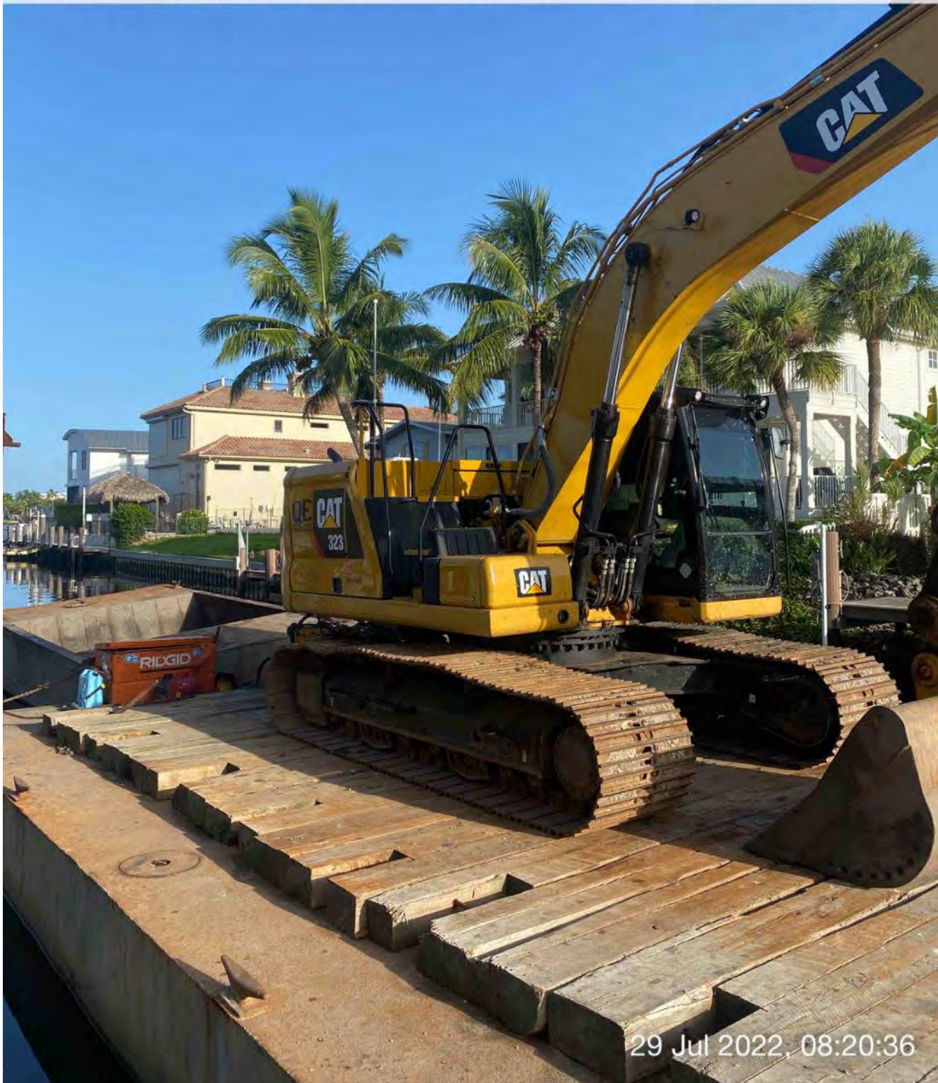
Barge, 323 excavator, and hopper staged between stations 4+50 and 5+00

W NW N 240 270 300 330 0 ☀ 301°NW (T) ● 26°8'8"N, 81°47'12"W ±13ft ▲ 8ft