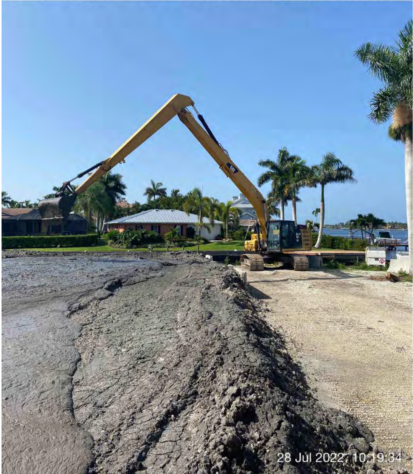
326 excavator transferring removed material from hopper to dewatering site at 1300 Curlew Avenue

☀ 187°S (T) ☉ 26°8'14"N, 81°47'16"W ±13ft ▲ 8ft