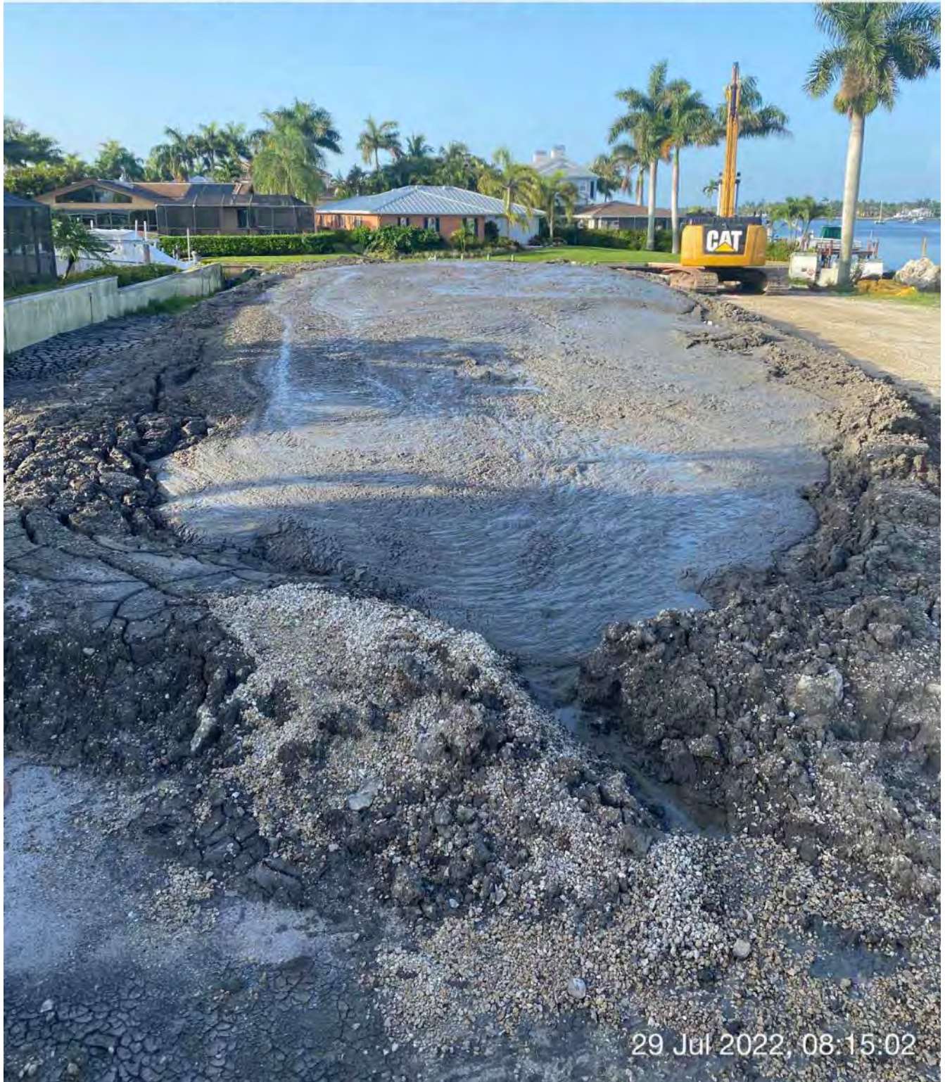
Removed material at dewatering site at 1300 Curlew Avenue

☀ 182°S (T) ● 26°8'15"N, 81°47'16"W ±65ft ▲ 8ft