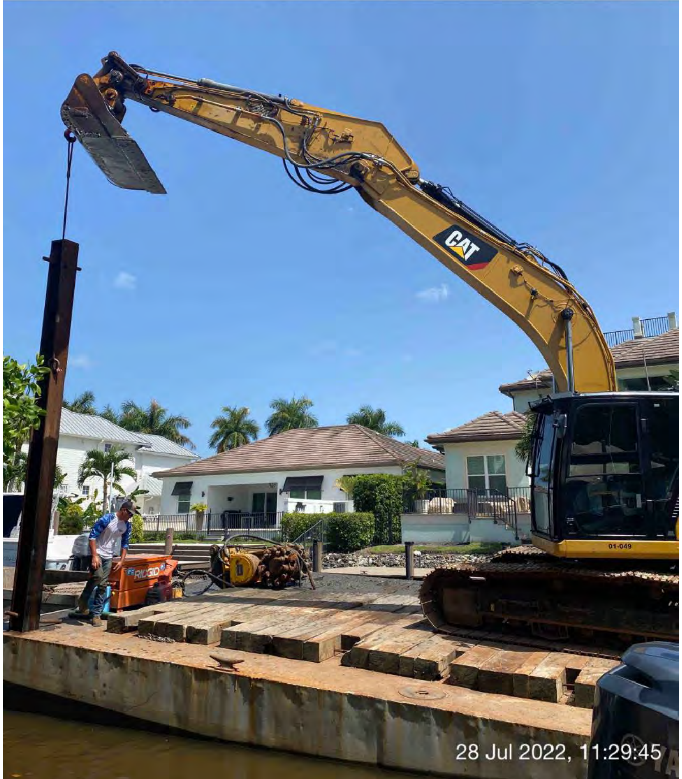
323 excavator lifting spud to allow push boat to mobilize barge at station 6+50