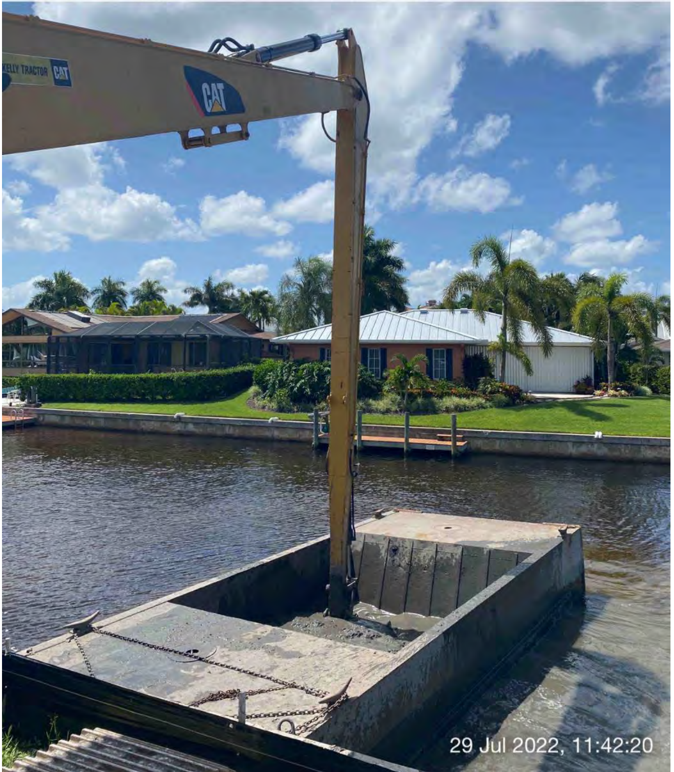
323 excavator transferring removed material from hopper to dewatering site at 1300 Curlew Avenue

☀ 155°SE (T) ● 26°8'13"N, 81°47'16"W ±19ft ▲ 8ft