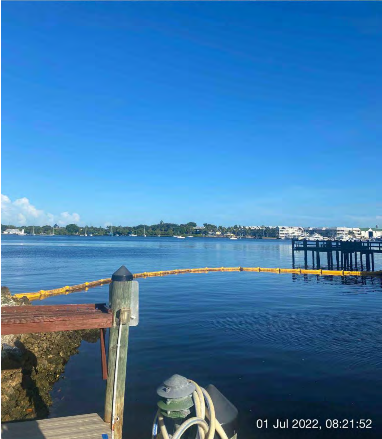
Turbidity Curtain installed across the mouth of Canal X-X

☉ 286°W (T) ☉ 26°8'4"N, 81°47'14"W ±19ft ▲ 8ft