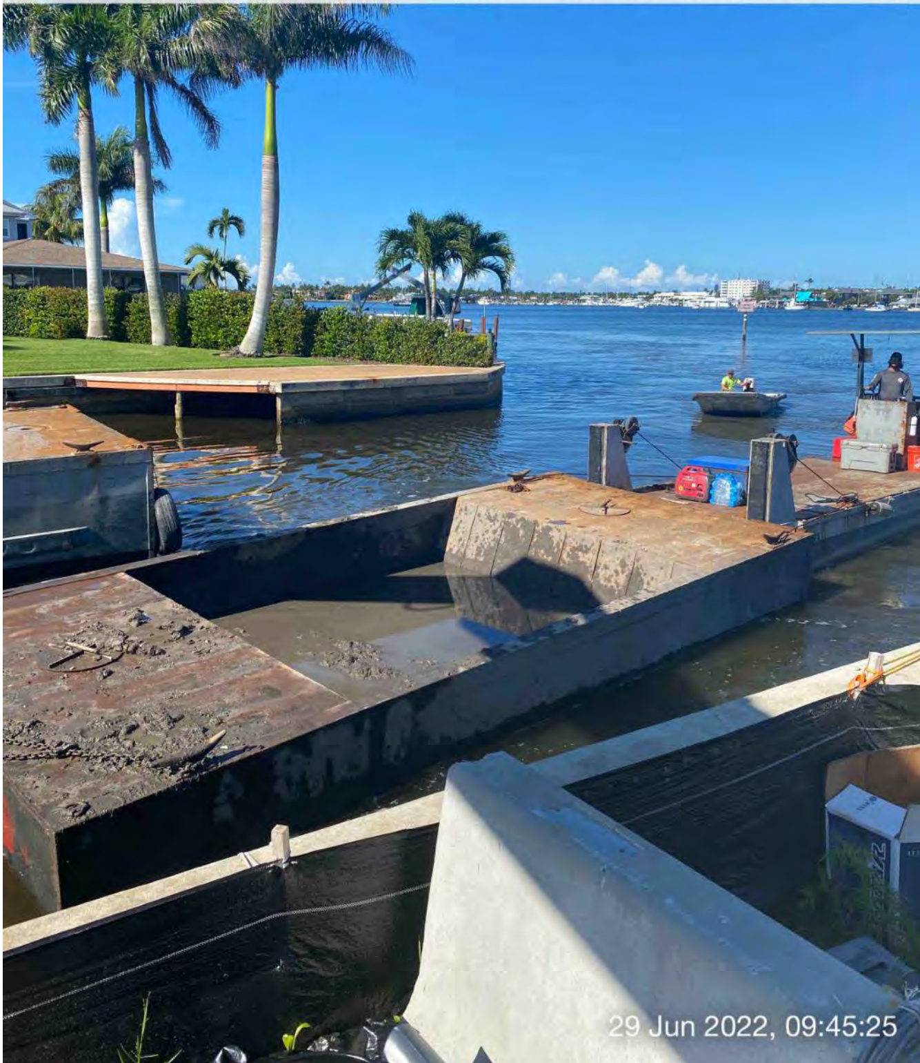
Push boat dropping off full hopper of material in Canal CC-CC

S 150 180 210 240 270 W 216°SW (T) 26°8'13"N, 81°47'16"W ±26ft ▲ 8ft