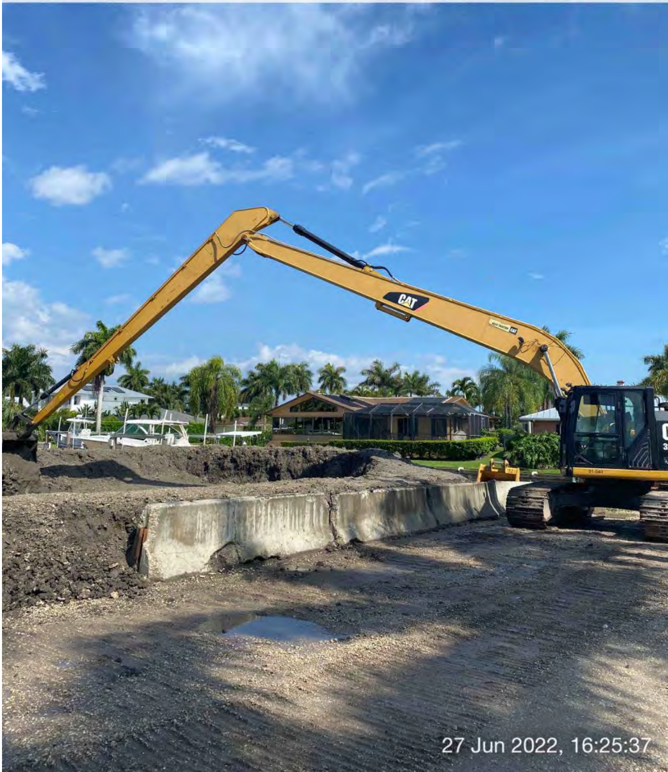
326 excavator transferring removed material from hopper to dewatering site at 1300 Curlew Avenue

☀ 145°SE (T) ● 26°8'14"N, 81°47'16"W ±13ft ▲ 8ft