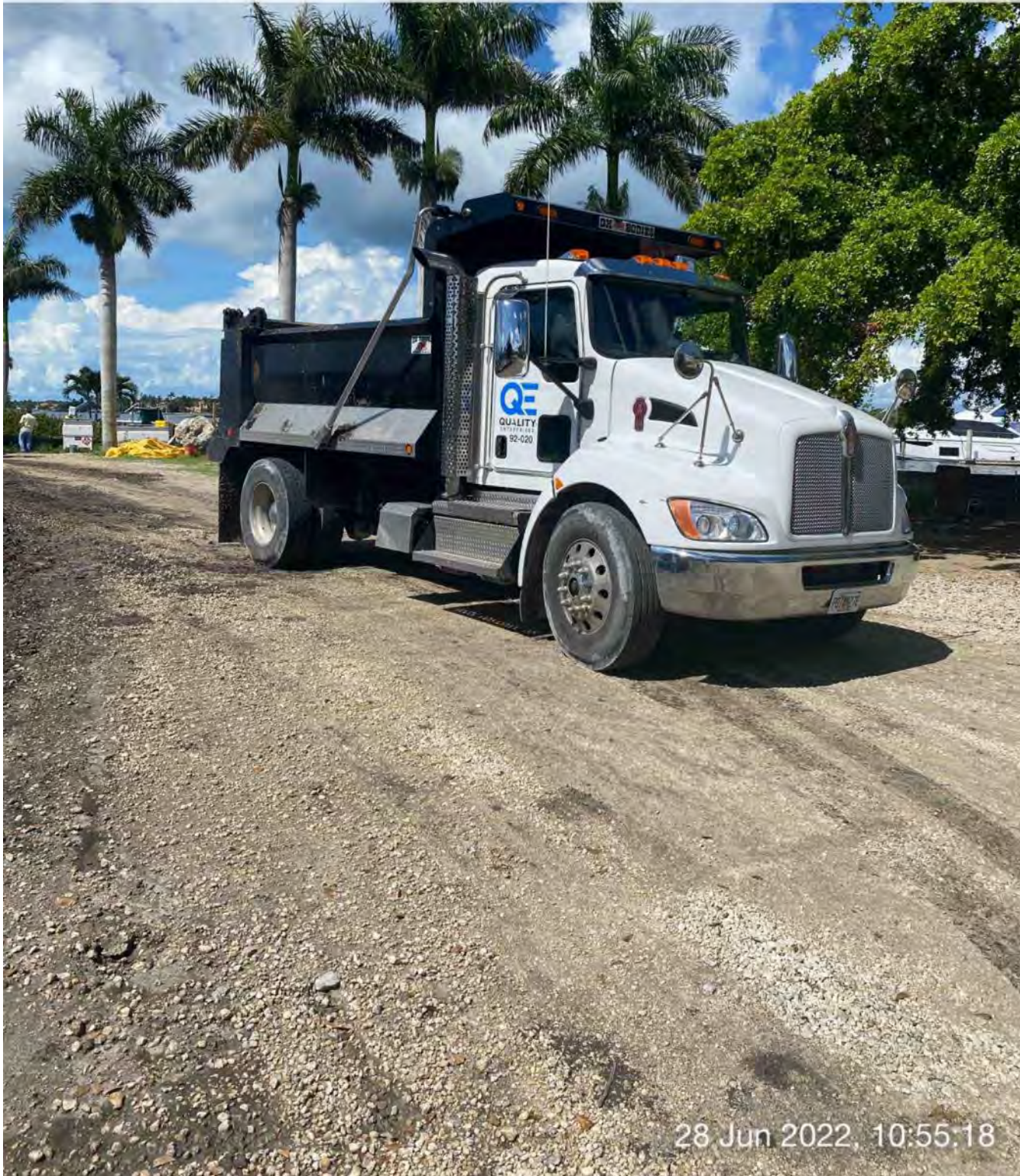
Dump truck on site at 1300 Curlew Avenue

☀ 218°SW (T) ☉ 26°8'14"N, 81°47'15"W ±13ft ▲ 10ft