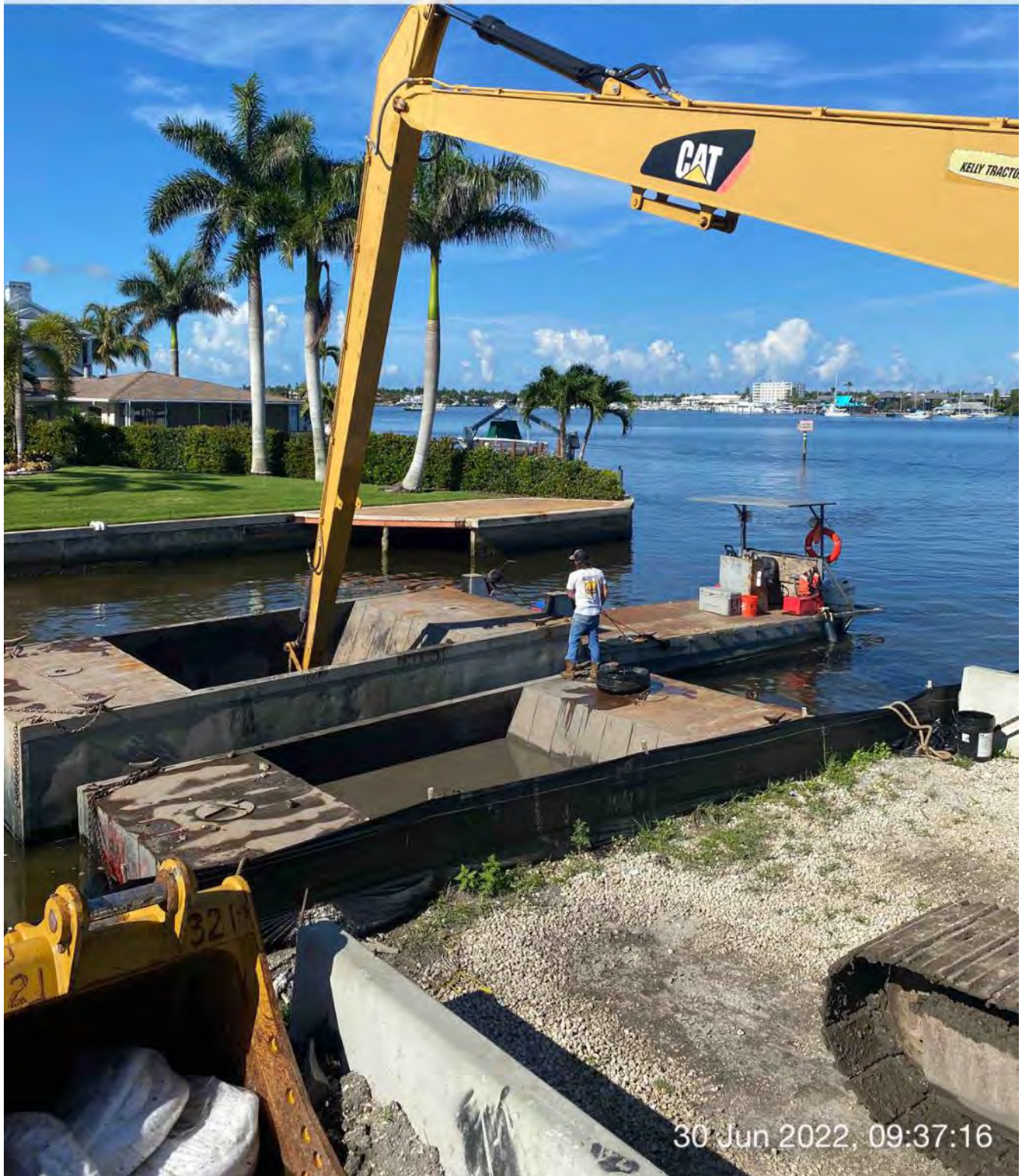
Push boat dropping off full hopper of material in Canal CC-CC and picking up empty hopper

S 150 180 210 240 270 W 219°SW (T) 26°8'13"N, 81°47'16"W ±32ft ▲ 10ft