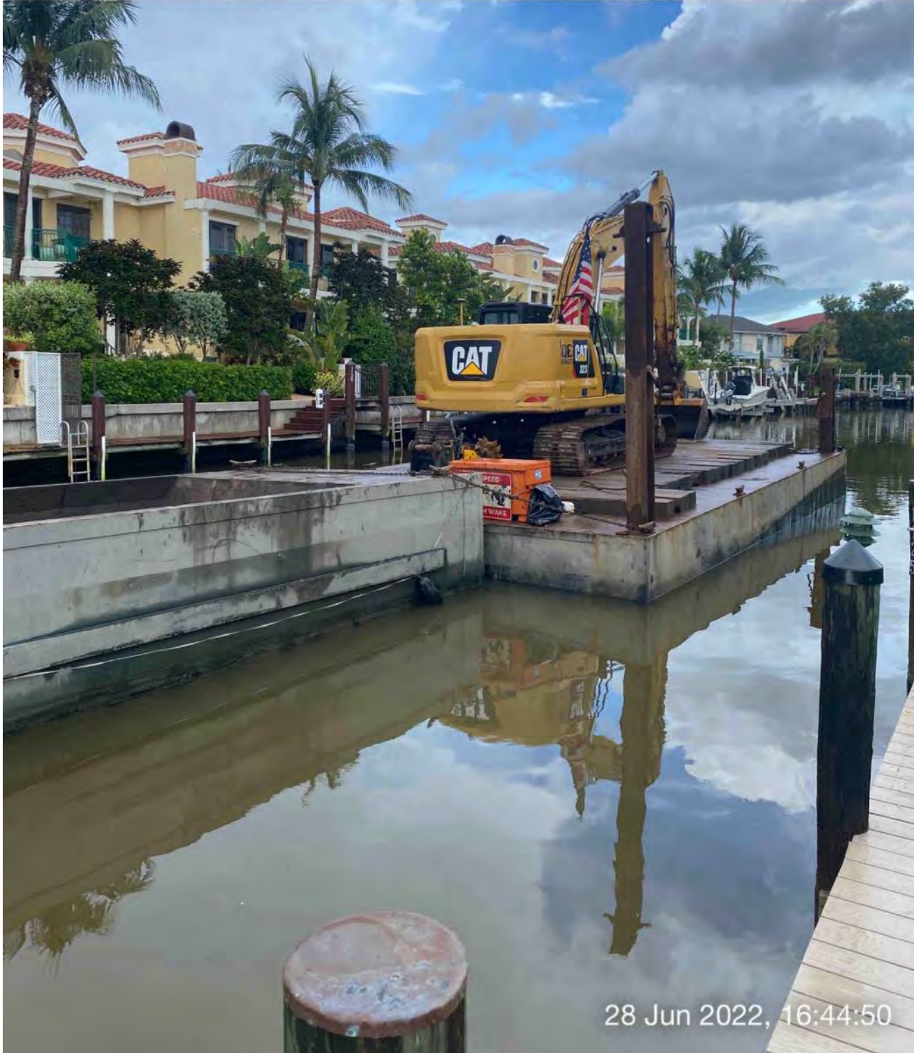
Hopper, barge, and 323 excavator staged in Canal Y-Y between stations 1+25 and 1+75

E 90 SE 120 150 S 180 210 ☀ 146°SE (T) ☉ 26°8'4"N, 81°47'10"W ±22ft ▲ 8ft