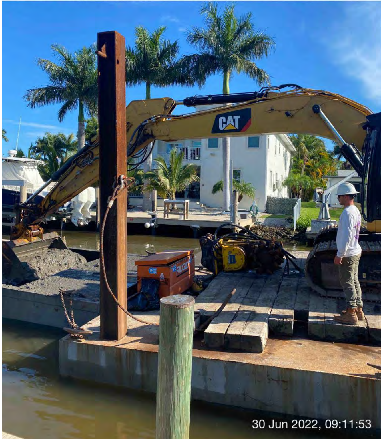
323 excavator transferring material to hopper at station 5+00

☀ 340°N (T) ● 26°8'4"N, 81°47'11"W ±29ft ▲ 8ft