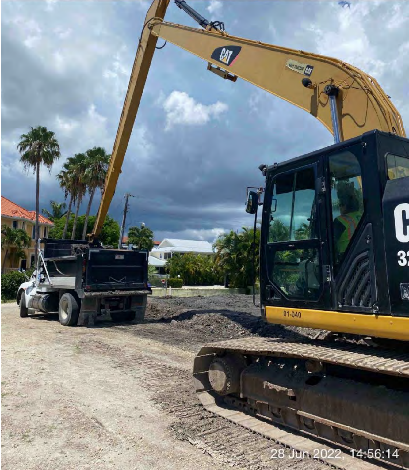
326 excavator transferring removed material from dewatering site to dump truck bed at 1300 Curlew Avenue

N 0 30 60 90 NE E 330 0 30 60 90 ☀ 33°NE (T) ☉ 26°8'14"N, 81°47'16"W ±19ft ▲ 8ft