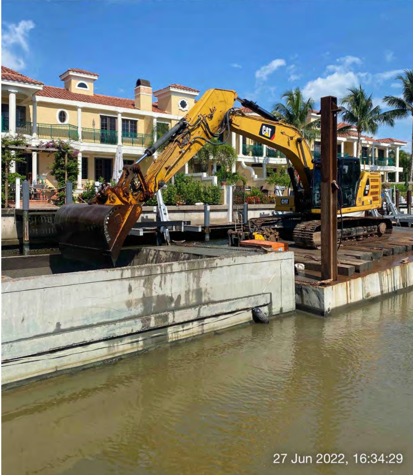
323 excavator transferring removed material to hopper at station 2+75

E 90 SE 120 150 S 180 ☀ 129°SE (T) ☉ 26°8'2"N, 81°47'10"W ±19ft ▲ 9ft