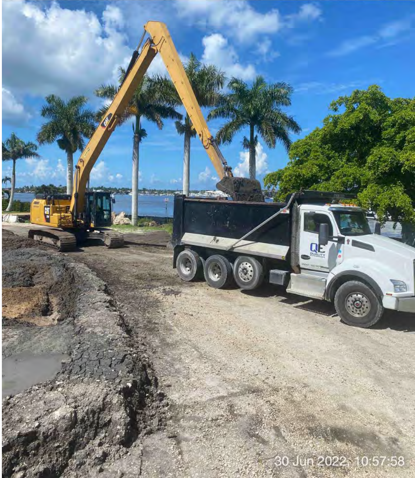
326 excavator transferring removed material from dewatering site to dump truck bed at 1300 Curlew Avenue

S 180 SW 210 240 W 270 ☉ 223°SW (T) ☉ 26°8'14"N, 81°47'15"W ±16ft ▲ 9ft