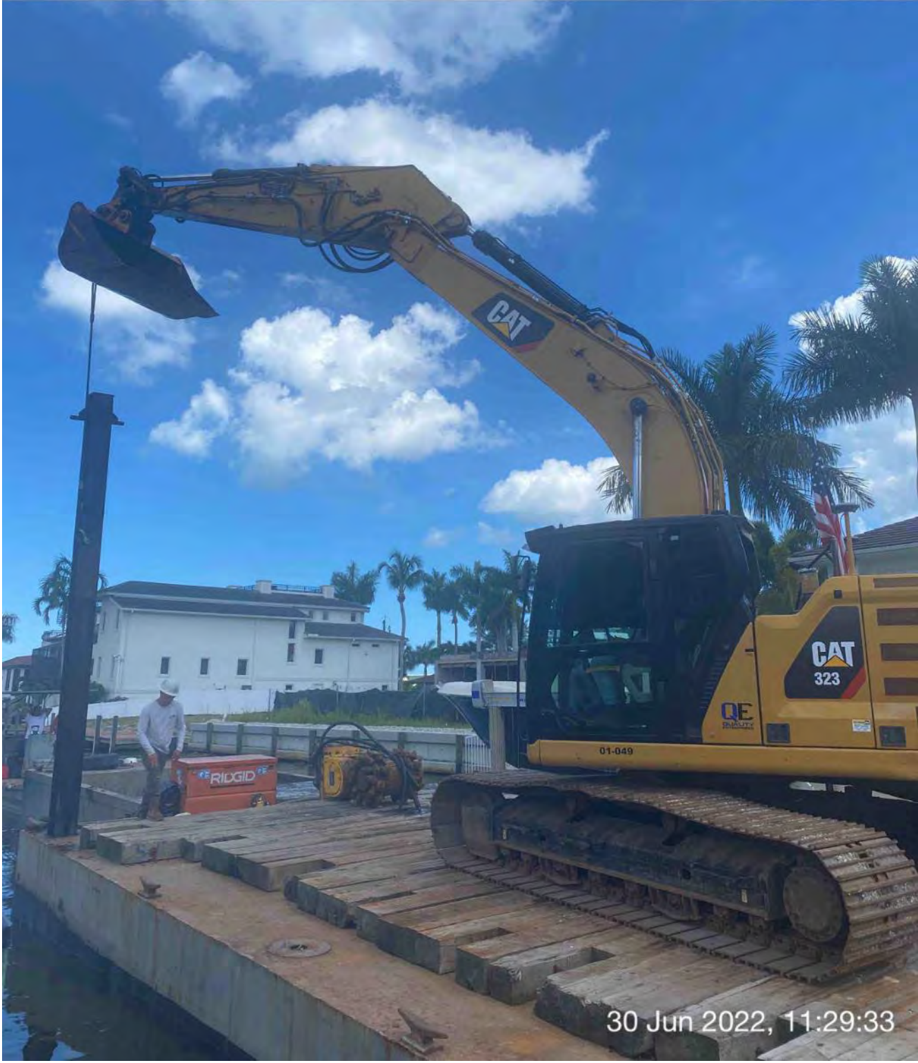
323 excavator lifting spud to allow push boat to mobilize barge at station 4+75

☀ 306°NW (T) ☉ 26°8'4"N, 81°47'11"W ±19ft ▲ 9ft