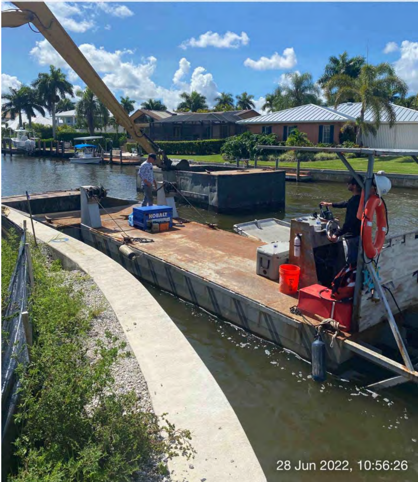
Push boat dropping off full hopper of material in Canal CC-CC

E 90 SE 120 150 S 180 127°SE (T) 26°8'13"N, 81°47'16"W ±13ft ▲ 11ft