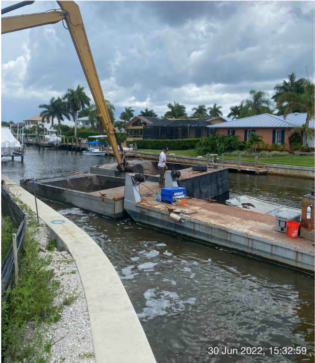
Push boat dropping off full hopper of material in Canal CC-CC and picking up empty hopper

☉ 115°SE (T) ● 26°8'13"N, 81°47'16"W ±13ft ▲ 9ft