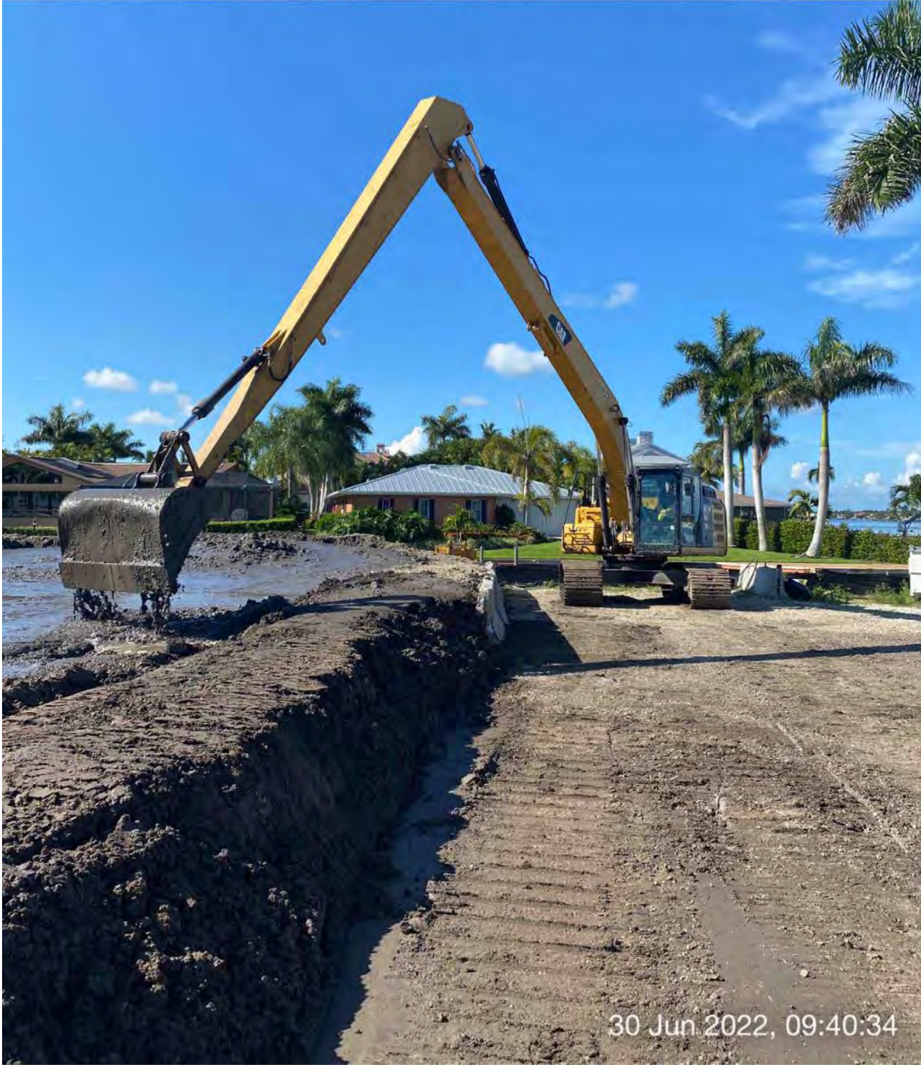
326 excavator transferring removed material from hopper to dewatering site at 1300 Curlew Avenue

☀ 172°S (T) ☉ 26°8'14"N, 81°47'16"W ±29ft ▲ 9ft