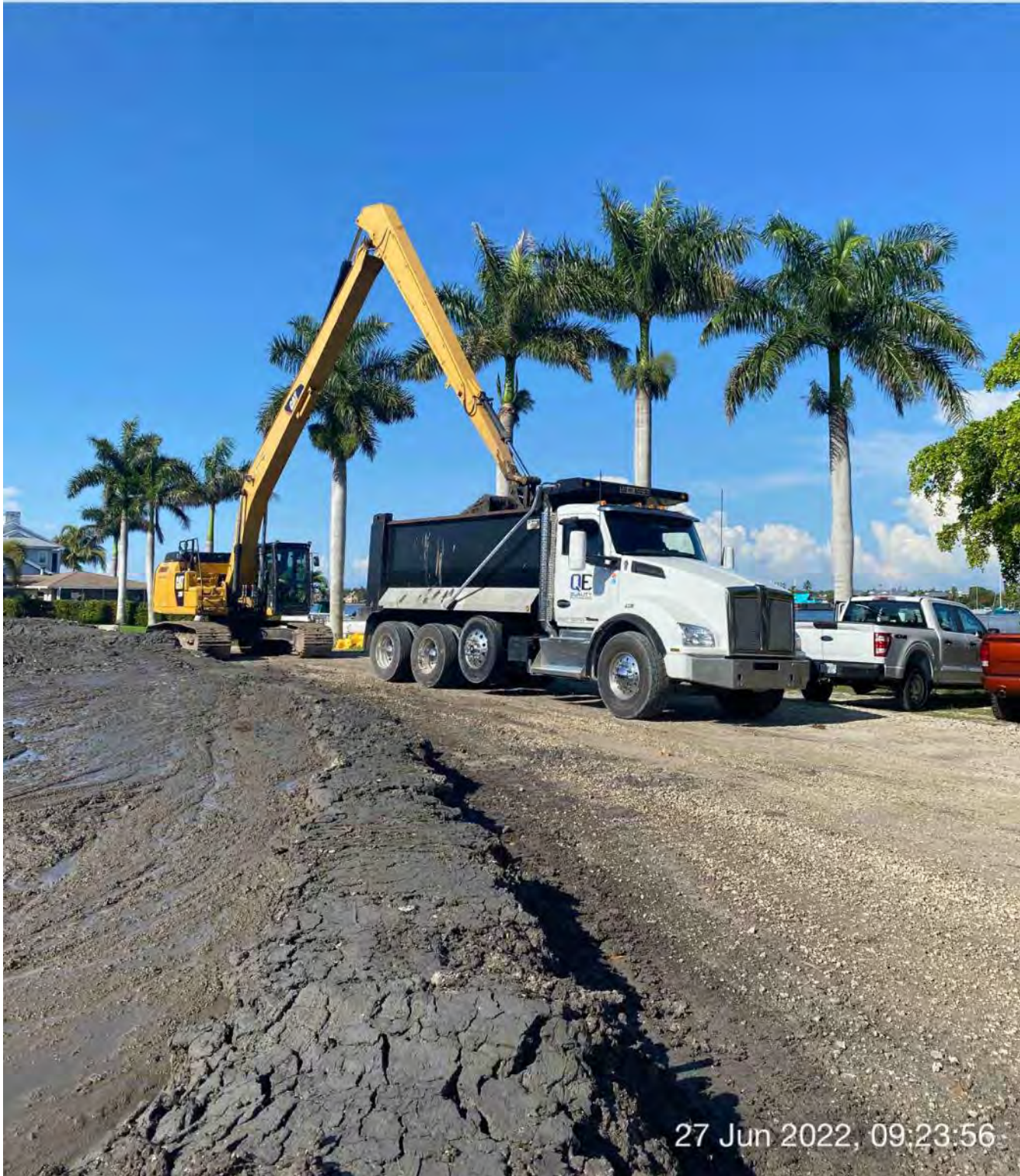
326 excavator transferring removed material from dewatering site to dump truck bed at 1300 Curlew Avenue

☉ 204°SW (T) ☉ 26°8'14"N, 81°47'15"W ±13ft ▲ 8ft