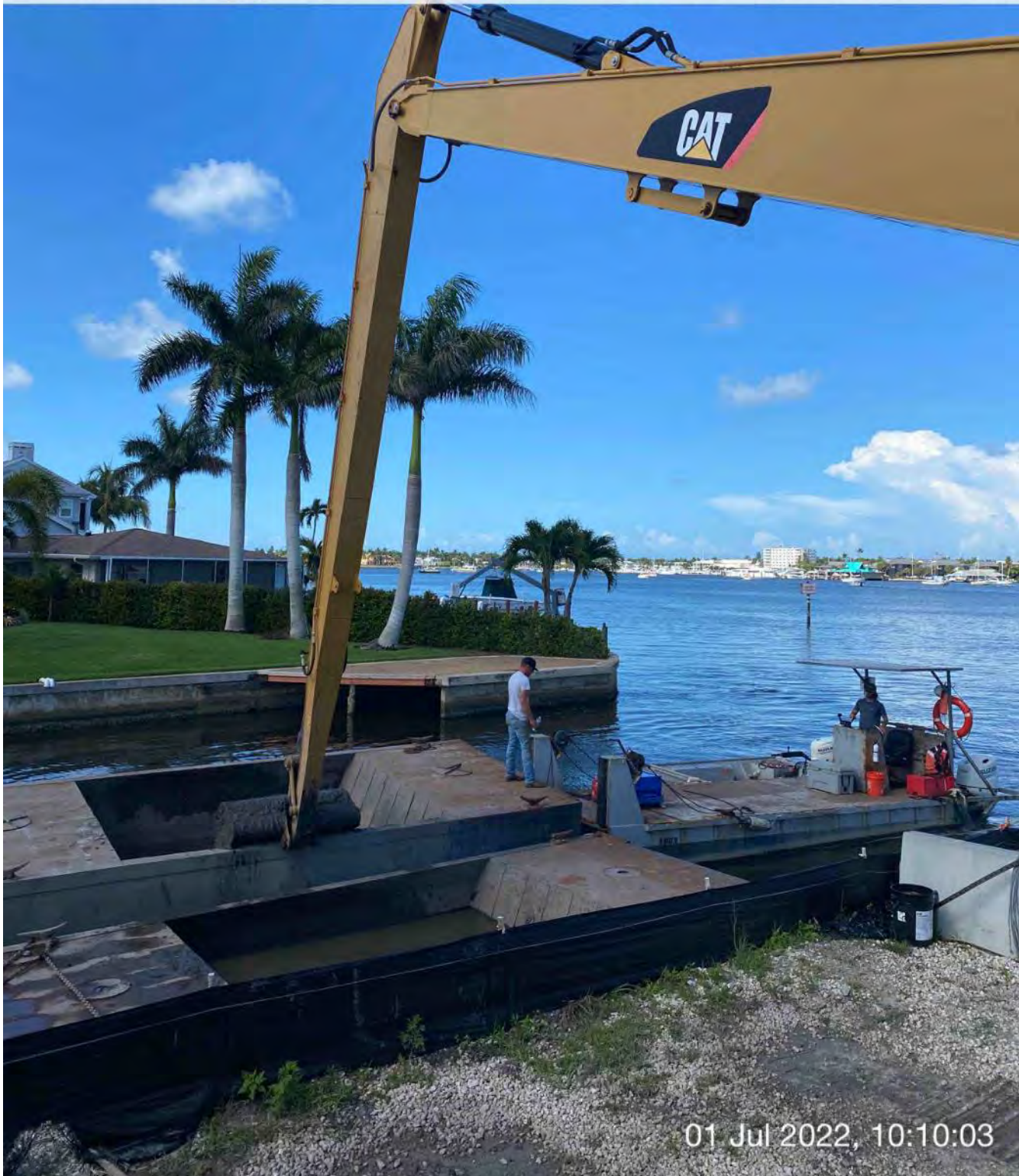
Push boat dropping off full hopper of material in Canal CC-CC and picking up empty hopper

S SW W 150 180 210 240 270 ☀ 218°SW (T) ☉ 26°8'13"N, 81°47'15"W ±16ft ▲ 8ft