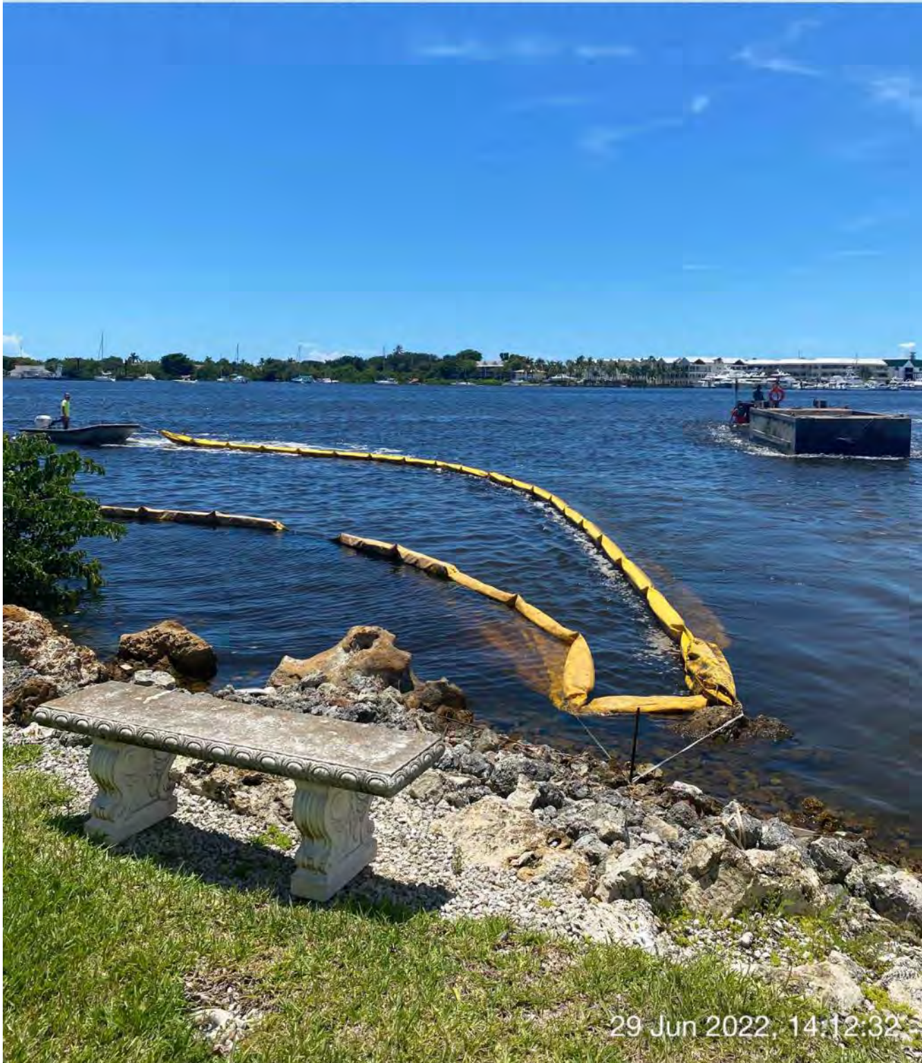
Support boat opening turbidity curtain to allow push boat to transport empty hopper back to Canal Y-Y

☀ 290°W (T) ● 26°8'4"N, 81°47'14"W ±22ft ▲ 8ft