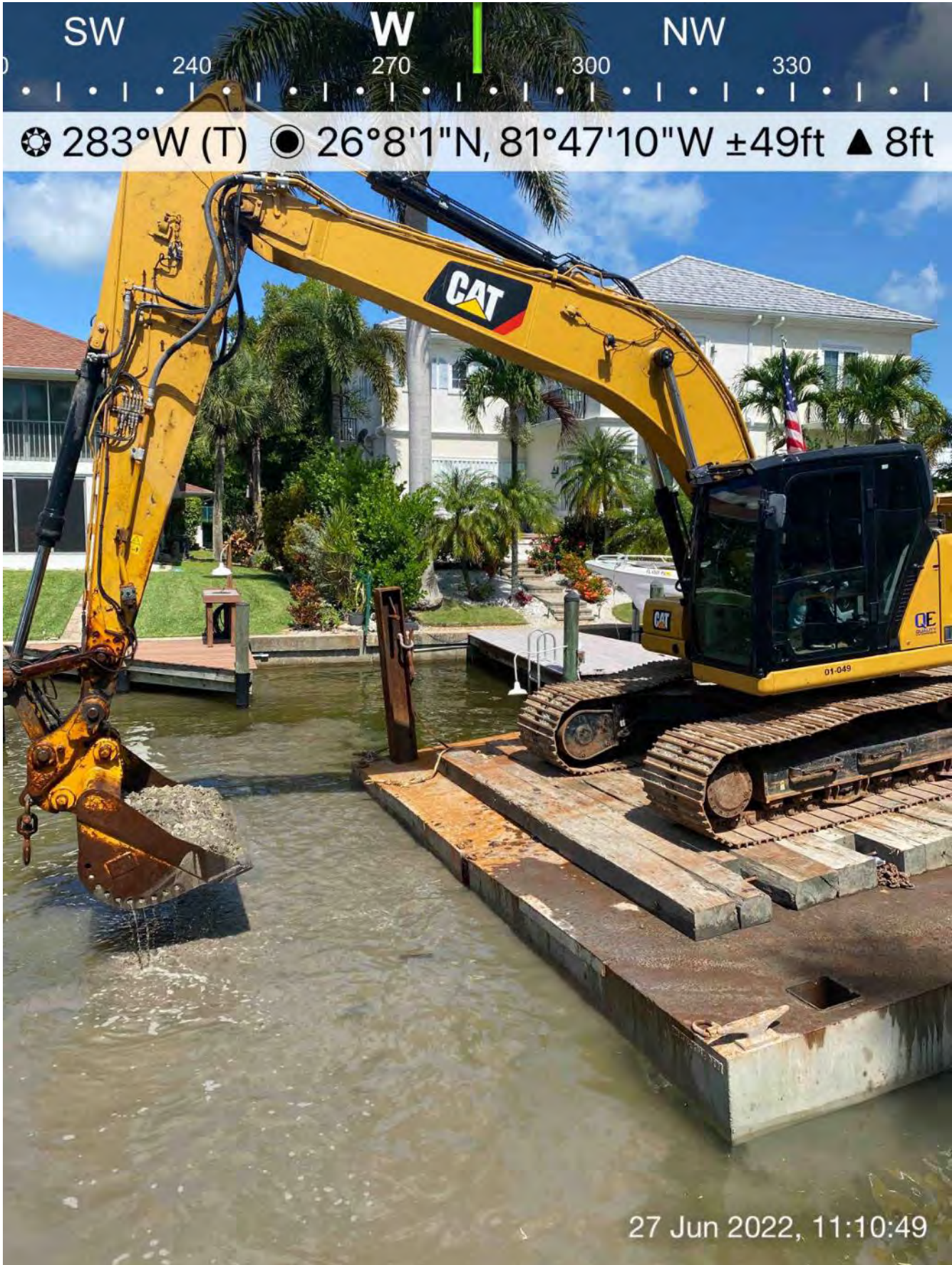
323 excavator removing material at station 3+50