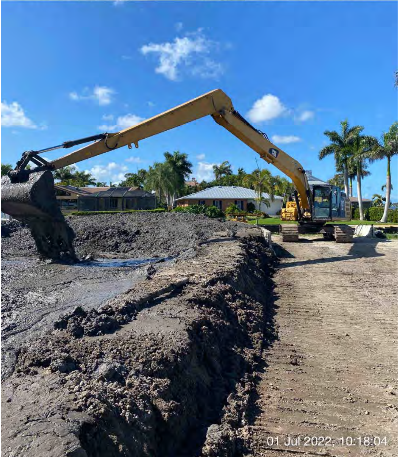
326 excavator transferring removed material from hopper to dewatering site at 1300 Curlew Avenue

☀ 170°S (T) ● 26°8'14"N, 81°47'16"W ±13ft ▲ 9ft