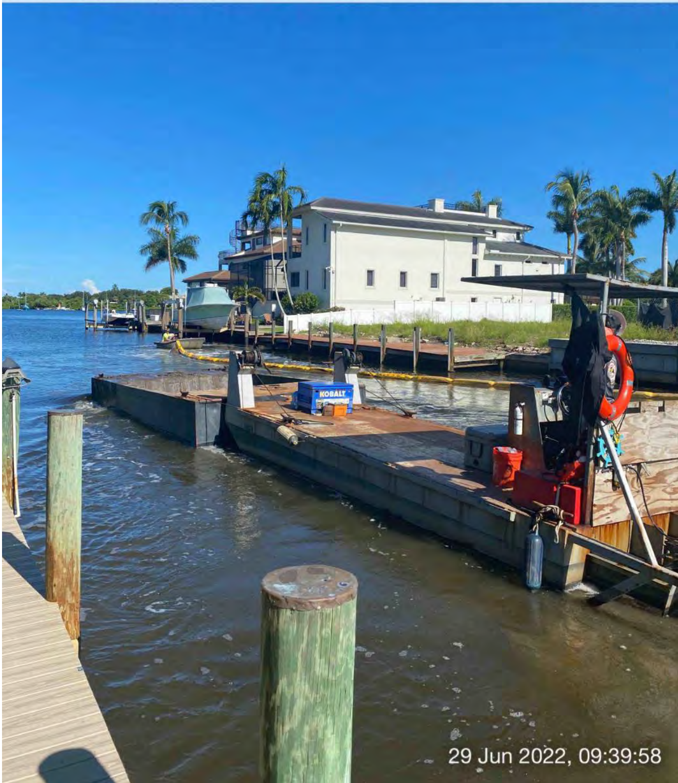
Support boat opening turbidity curtain to allow push boat to transport full hopper of material to Canal CC-CC

W NW N 240 270 300 330 0 ☀ 303°NW (T) ☉ 26°8'4"N, 81°47'12"W ±13ft ▲ 10ft