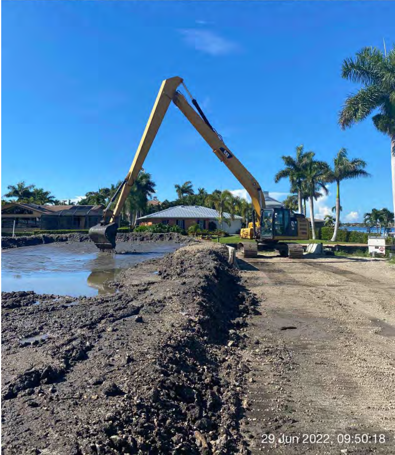
326 excavator transferring removed material from hopper to dewatering site at 1300 Curlew Avenue

☉ 176°S (T) ☉ 26°8'14"N, 81°47'15"W ±19ft ▲ 9ft