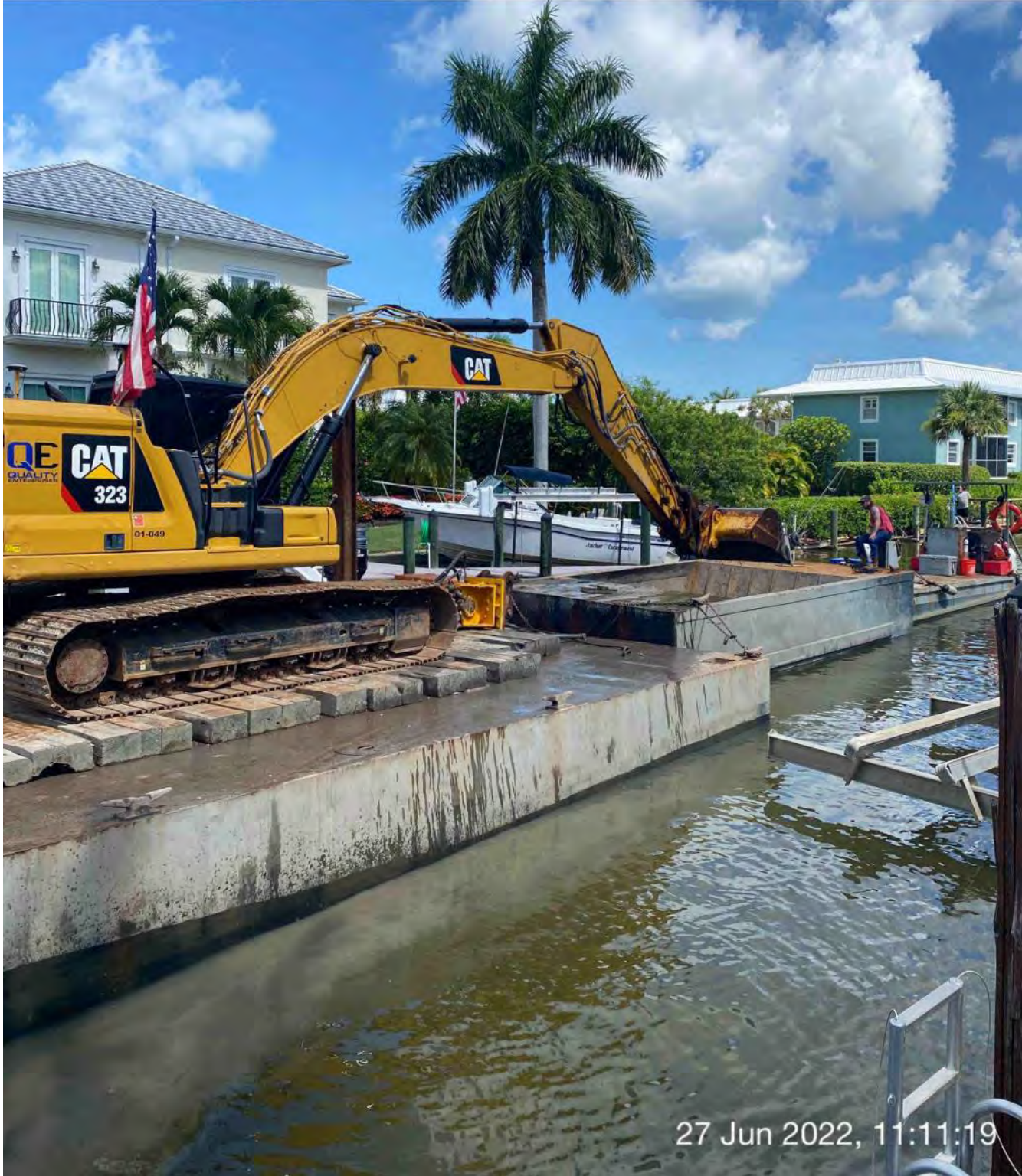
323 excavator transferring removed material to hopper at station 3+00

W NW N 240 270 300 330 0 308°NW (T) 26°8'1"N, 81°47'10"W ±13ft ▲ 12ft