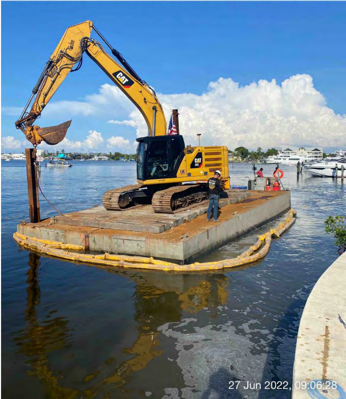
323 excavator lifting spud to allow push boat to transport barge from Canal CC-CC to Canal Y-Y

S 180 SW 210 240 W 270 N 300 ☉ 243°SW (T) ☉ 26°8'13"N, 81°47'16"W ±26ft ▲ 8ft