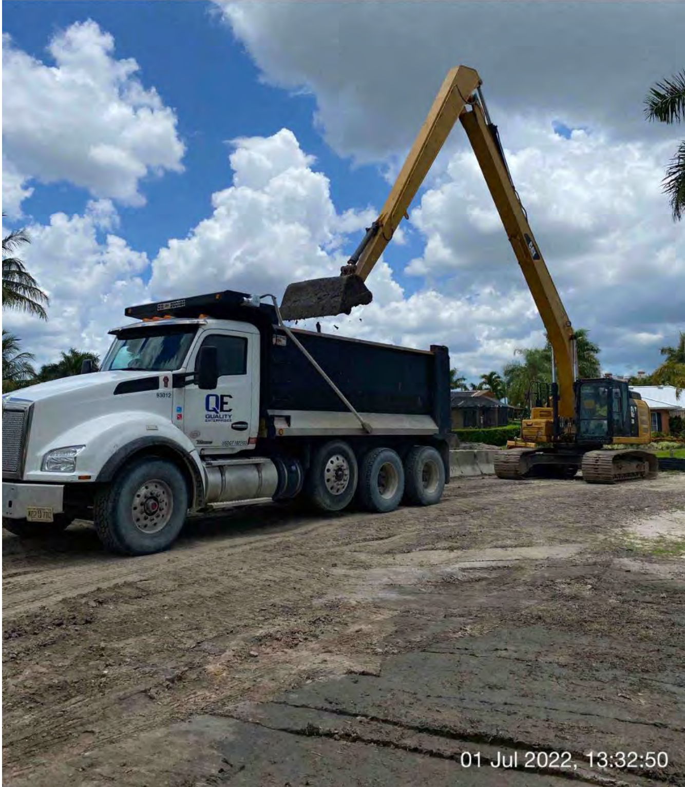
326 excavator transferring removed material from dewatering site to dump truck bed at 1300 Curlew Avenue

E 90 SE 120 50 S 180 210 ☀ 147°SE (T) ☉ 26°8'14"N, 81°47'16"W ±26ft ▲ 8ft