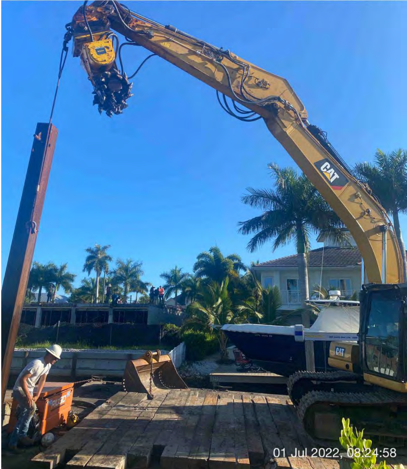
323 excavator lifting spud to allow push boat to mobilize barge at station 4+00

☉ 344°N (T) ● 26°8'4"N, 81°47'11"W ±39ft ▲ 8ft