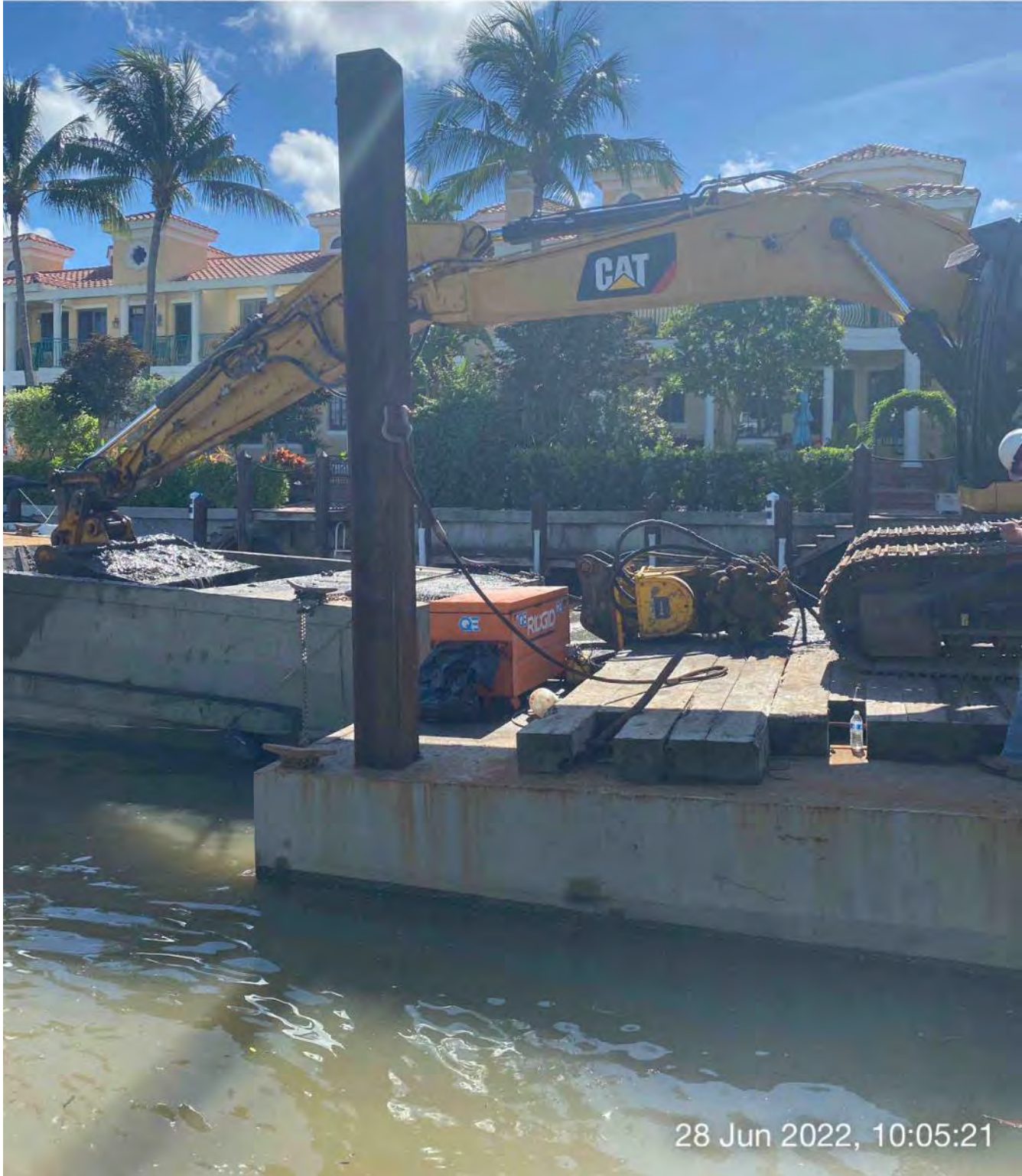
323 excavator transferring removed material to hopper at station 2+50

☀ 75°E (T) ● 26°8'2"N, 81°47'10"W ±22ft ▲ 8ft