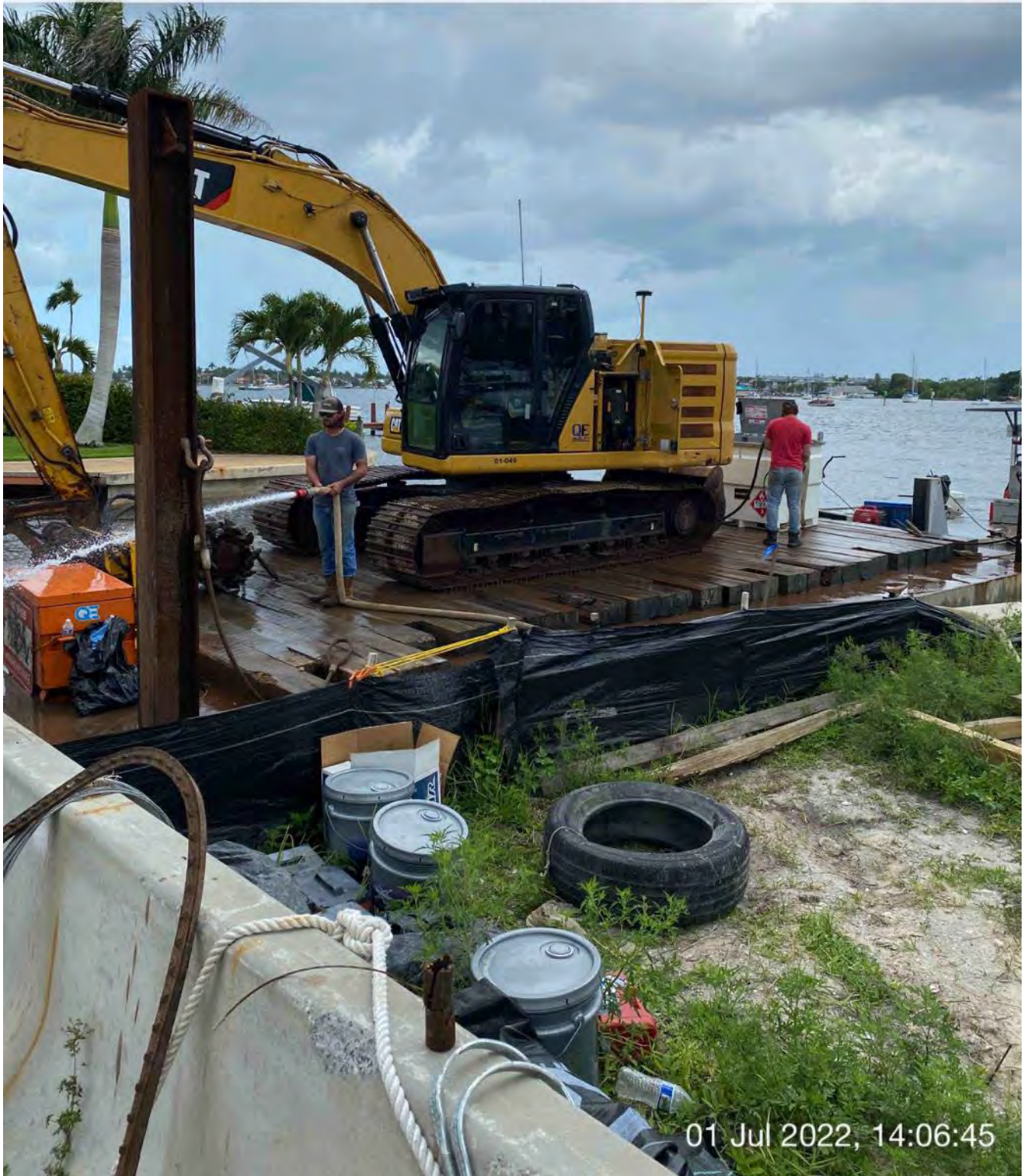
Contactor using water tank to clean equipment

☀ 227°SW (T) ☉ 26°8'13"N, 81°47'16"W ±22ft ▲ 8ft