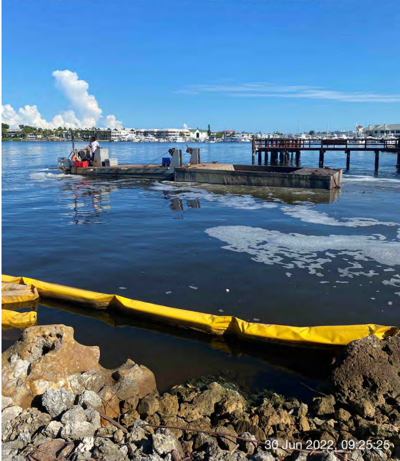
Support boat opening turbidity curtain to allow push boat to transport full hopper of material to Canal CC-CC

W 270 300 NW 330 N 0 ☀ 312°NW (T) ● 26°8'4"N, 81°47'15"W ±13ft ▲ 9ft