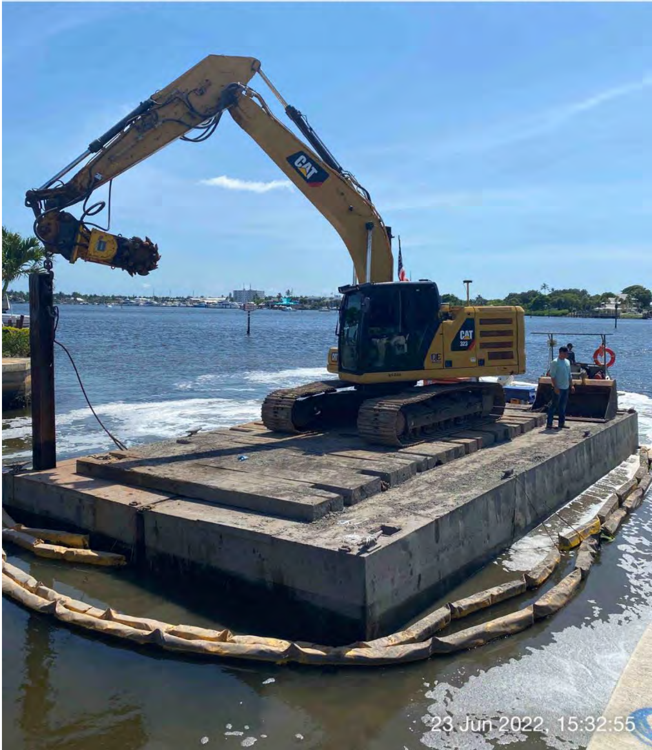
323 excavator lifting spud to allow push boat to transport barge from Canal CC-CC to Canal X-X

☉ 234°SW (T) ● 26°8'13"N, 81°47'16"W ±13ft ▲ 10ft