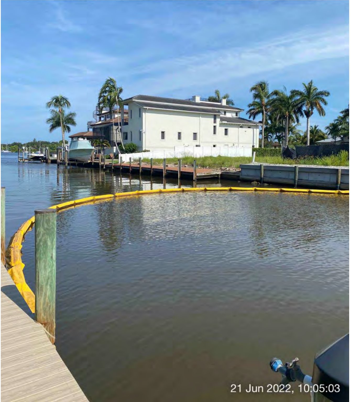
Turbidity curtain installed across Canal X-X at station 3+75