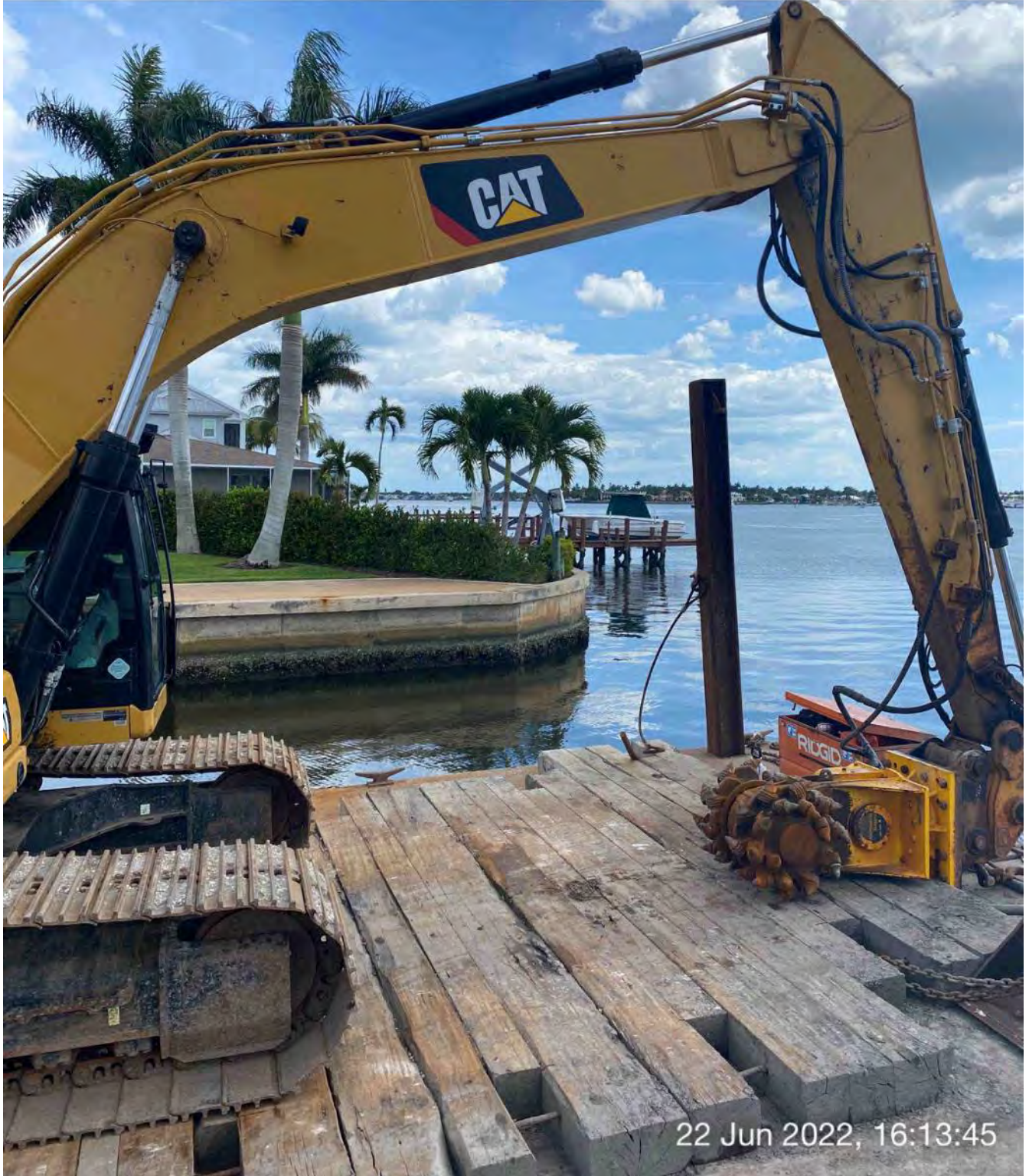
323 excavator on barge with Epiroc grinder

SE S SW 120 150 180 210 240 ☀ 183°S (T) ☉ 26°8'13"N, 81°47'16"W ±118ft ▲ 8ft