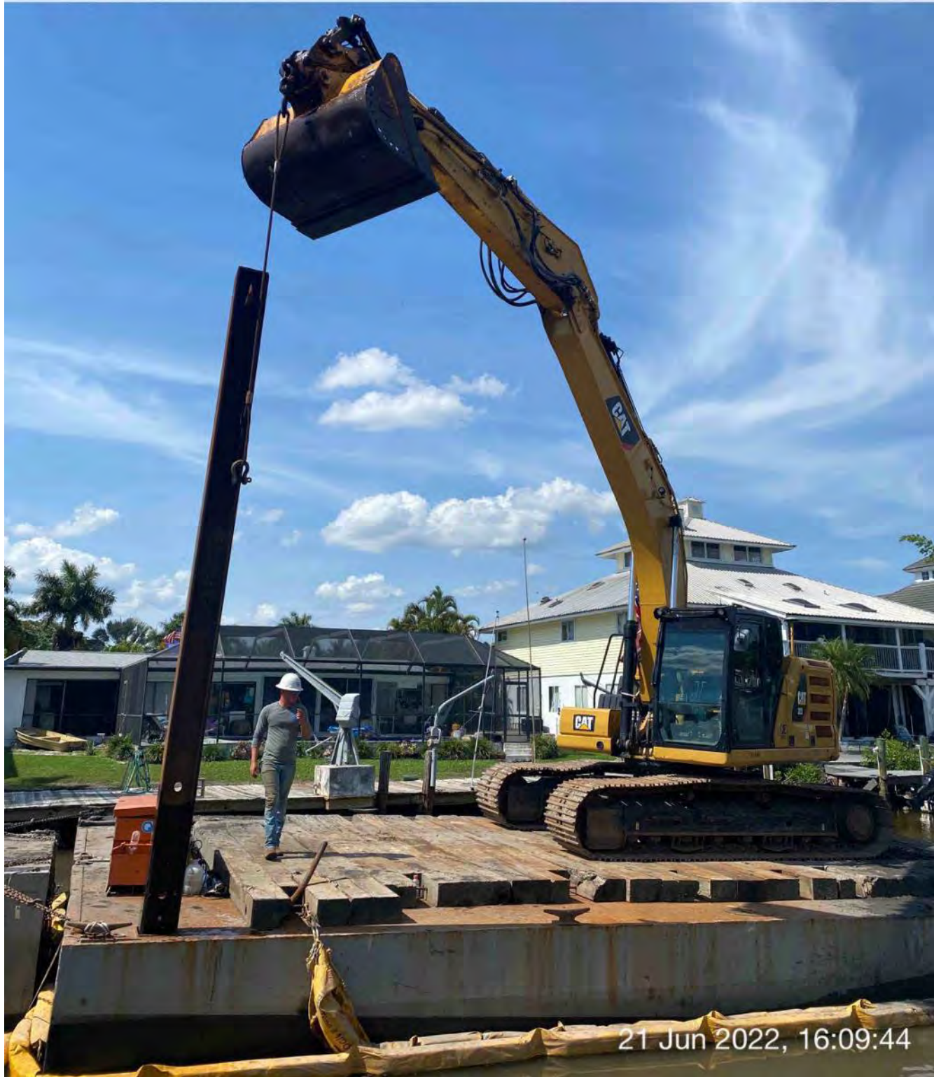
323 excavator lifting spud to allow push boat to mobilize barge at station 5+00

☀ 26°NE (T) ● 26°8'4"N, 81°47'11"W ±22ft ▲ 8ft