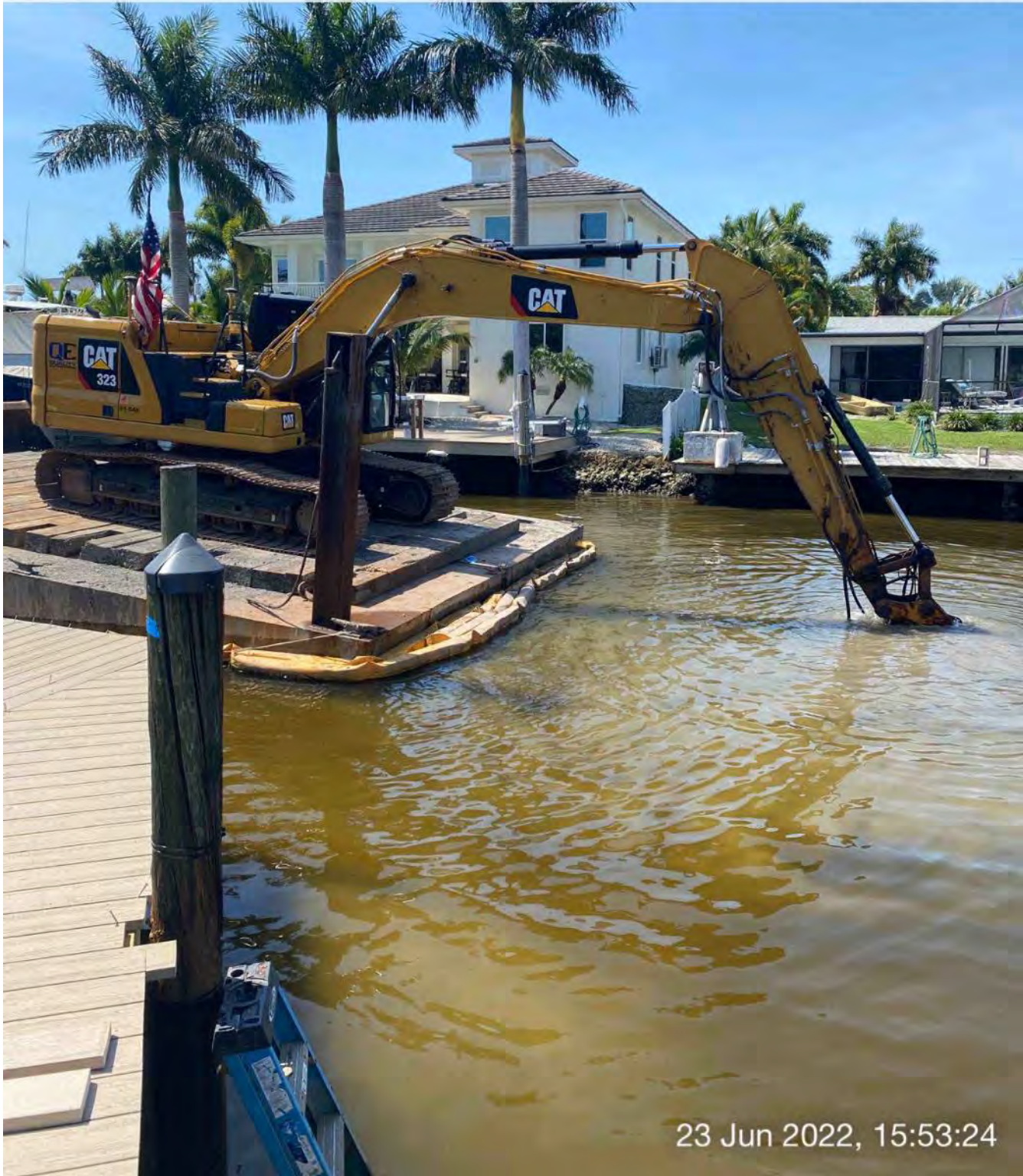
323 excavator grinding rock at station 5+00

☉ 342°N (T) ● 26°8'4"N, 81°47'10"W ±26ft ▲ 8ft