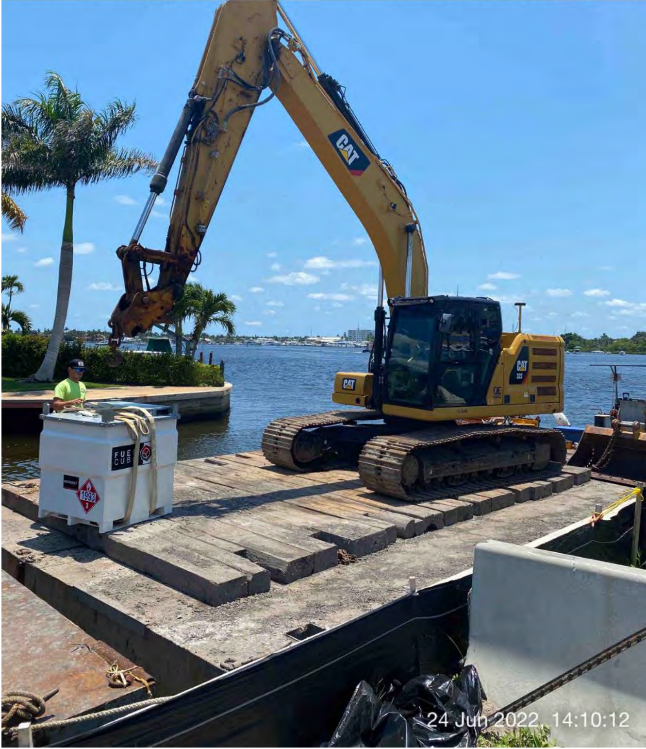
Contractor transporting fuel cube to barge to refuel 323 excavator

☉ 226°SW (T) ● 26°8'13"N, 81°47'16"W ±26ft ▲ 8ft