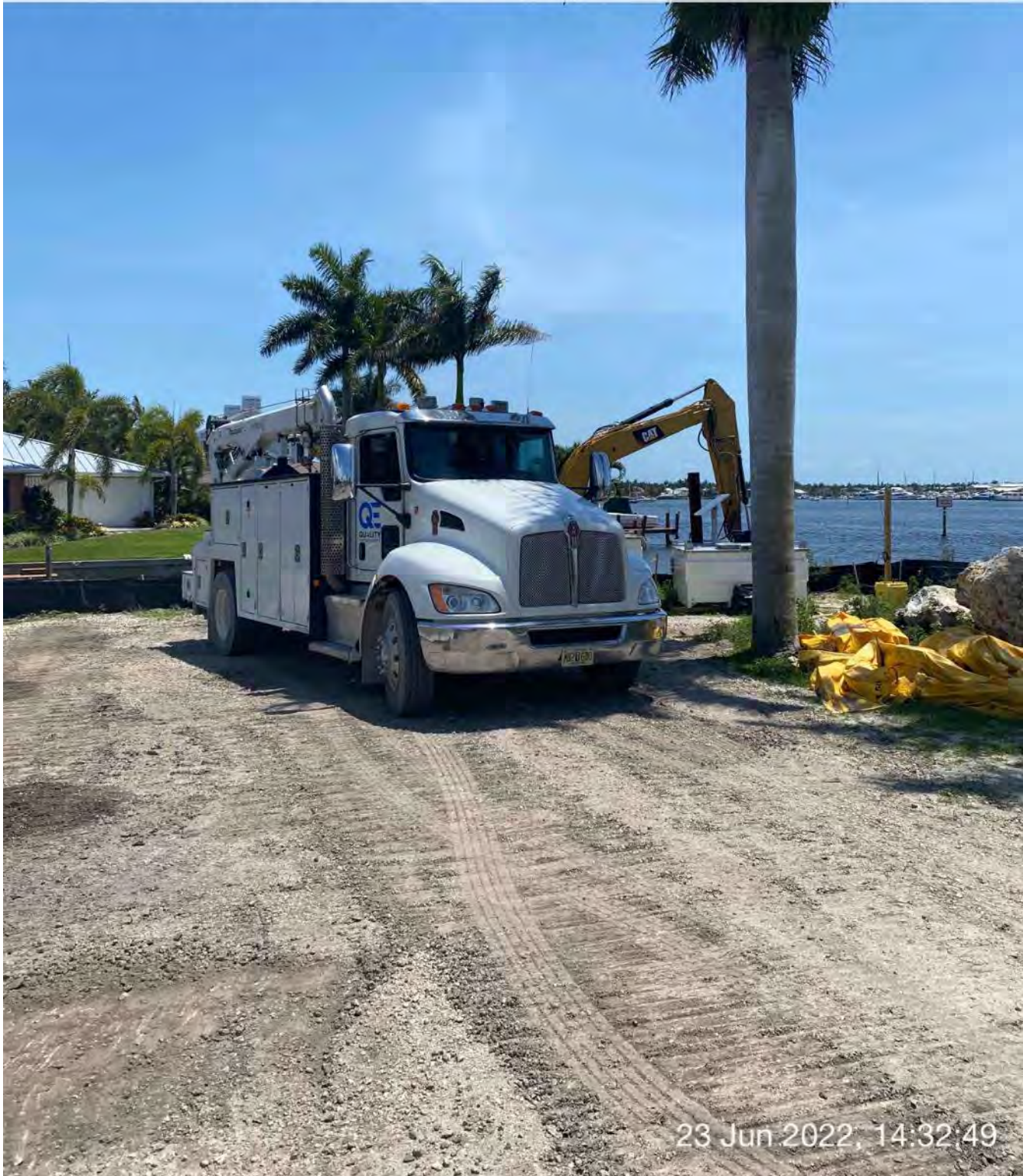
Mechanic truck on site at 1300 Curlew Avenue

E S SW W 150 180 10 240 270 208°SW (T) 26°8'14"N, 81°47'16"W ±19ft ▲ 8ft