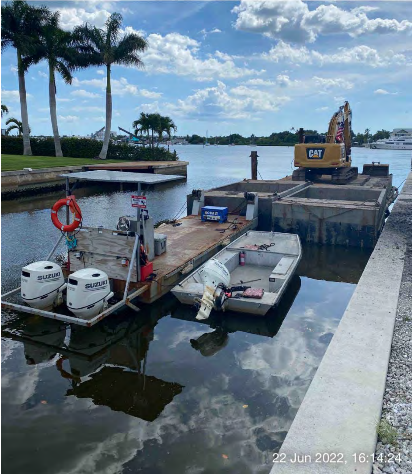
Push boat, support boat, 2 hoppers, barge, and 323 excavator in Canal CC-C between stations 1+00 and 2+00

☀ 251°W (T) ☉ 26°8'13"N, 81°47'15"W ±13ft ▲ 9ft