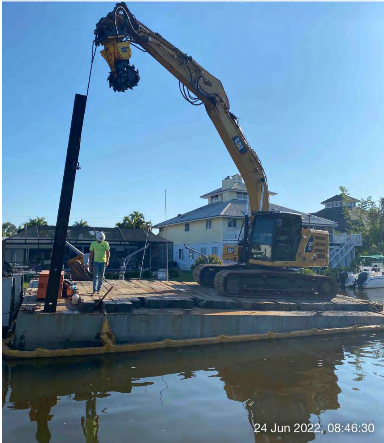
323 excavator lifting spud to allow push boat to mobilize barge at station 5+00

☀ 28°NE (T) ● 26°8'4"N, 81°47'10"W ±13ft ▲ 8ft