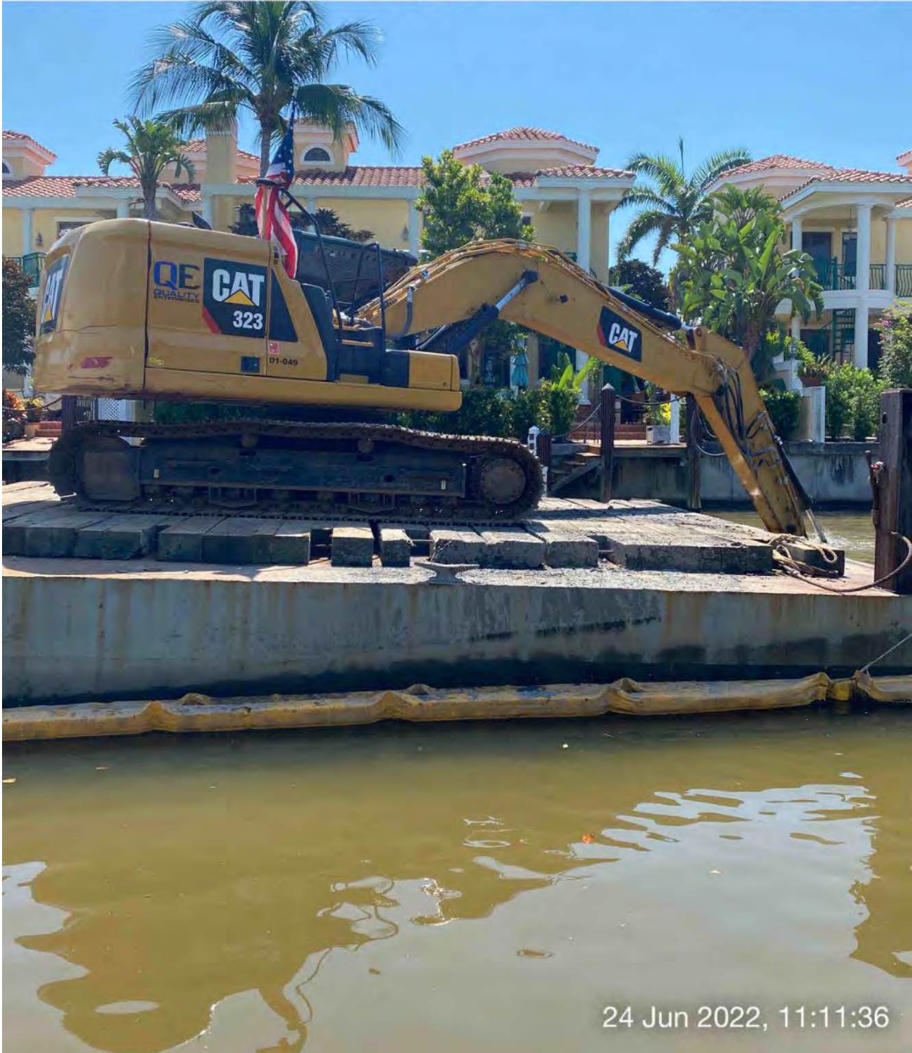
323 excavator grinding rock at station 2+00 in Canal Y-Y

☉ 91°E (T) ☉ 26°8'3"N, 81°47'10"W ±26ft ▲ 8ft