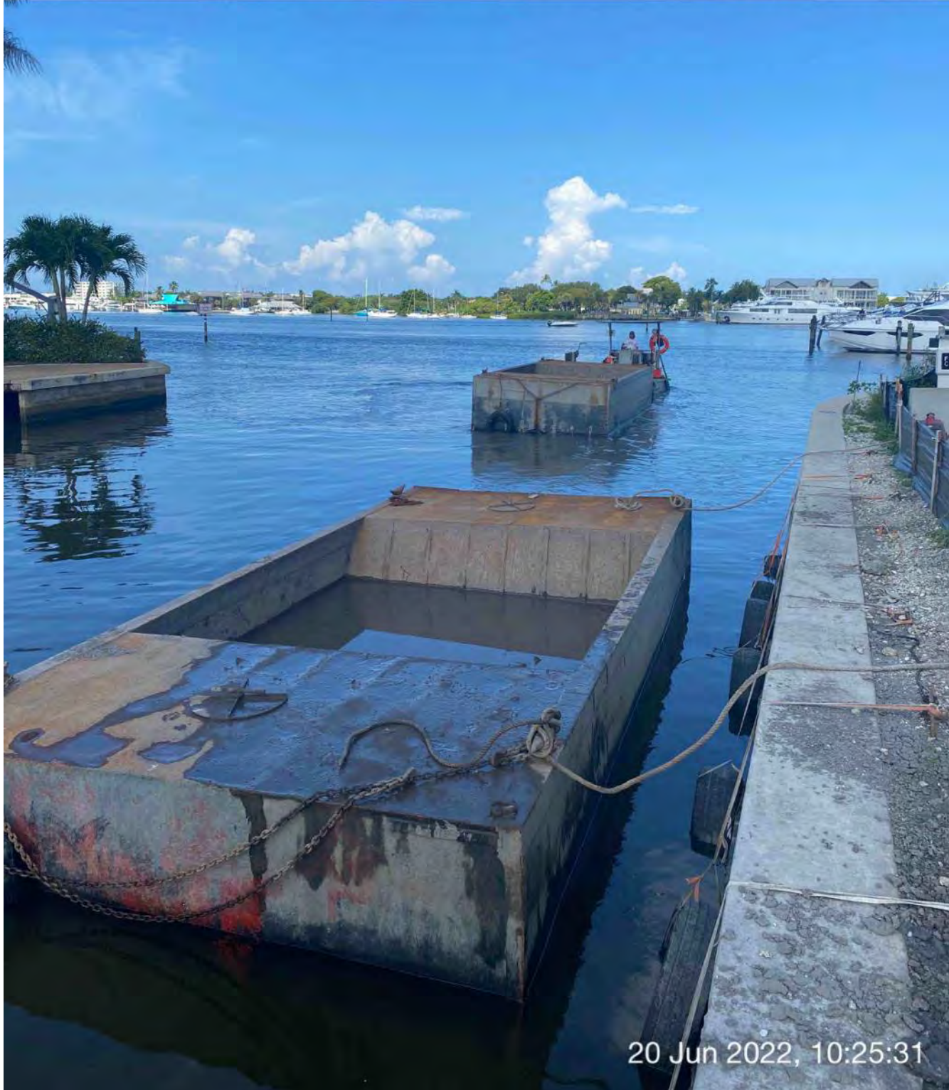
Push boat transporting empty hopper from Canal CC-CC to Canal X-X

SW W NW 210 240 270 300 ☉ 257°W (T) ☉ 26°8'13"N, 81°47'15"W ±13ft ▲ 9ft