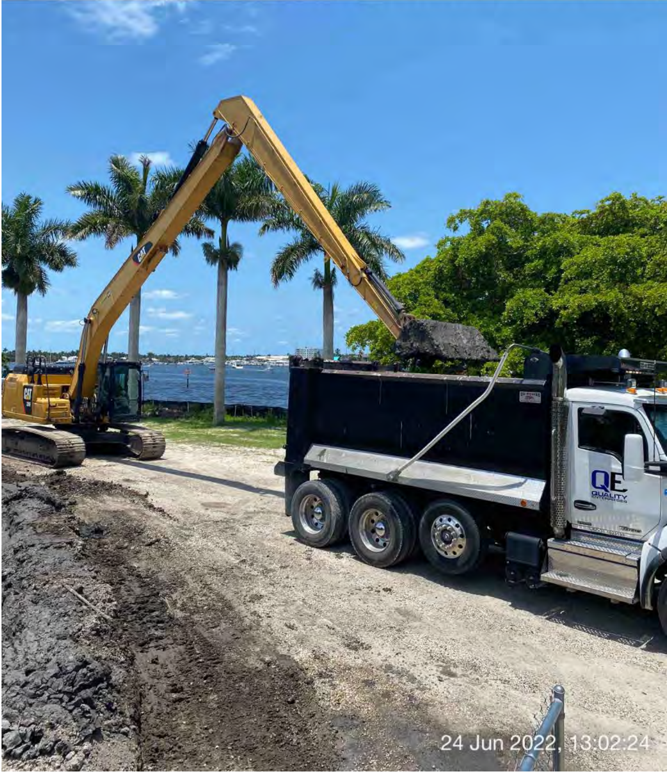
326 excavator transferring removed material from dewatering site to dump truck bed at 1300 Curlew Avenue

S 180 SW 210 W 270 ● 226°SW (T) ● 26°8'15"N, 81°47'15"W ±26ft ▲ 9ft