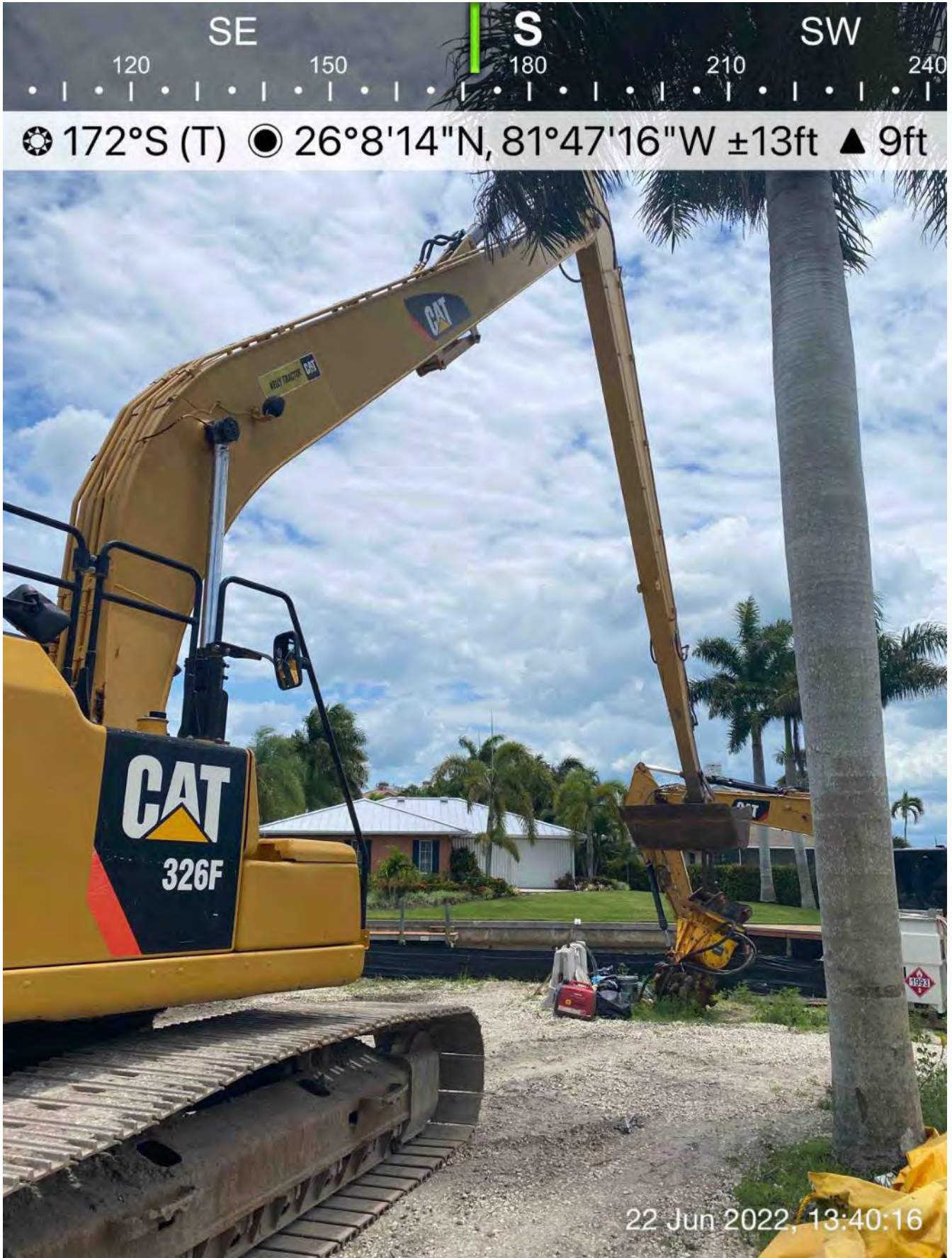
326 excavator lifting Epiroc grinder