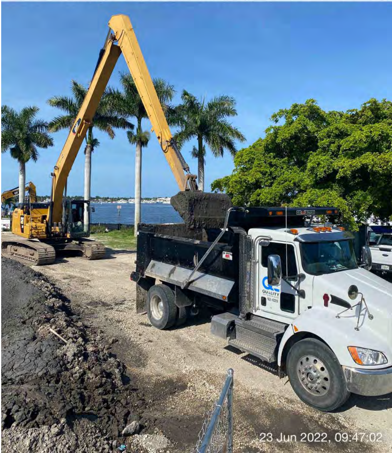
326 excavator transporting removed material from dewatering site to dump truck bed at 1300 Curlew Avenue

S 180 SW 210 240 W 270 300 ☉ 237°SW (T) ☉ 26°8'15"N, 81°47'15"W ±13ft ▲ 9ft