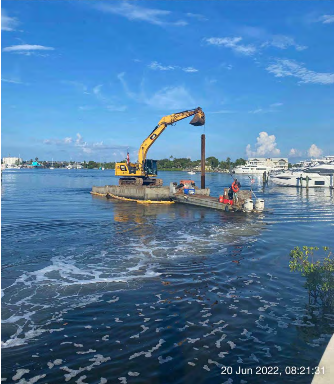
323 excavator lifting spud to allow push boat to transport barge from Canal CC-CC to Canal X-X

S 80 210 SW 240 W 270 NW 300 ☉ 250°W (T) ☉ 26°8'13"N, 81°47'16"W ±16ft ▲ 10ft