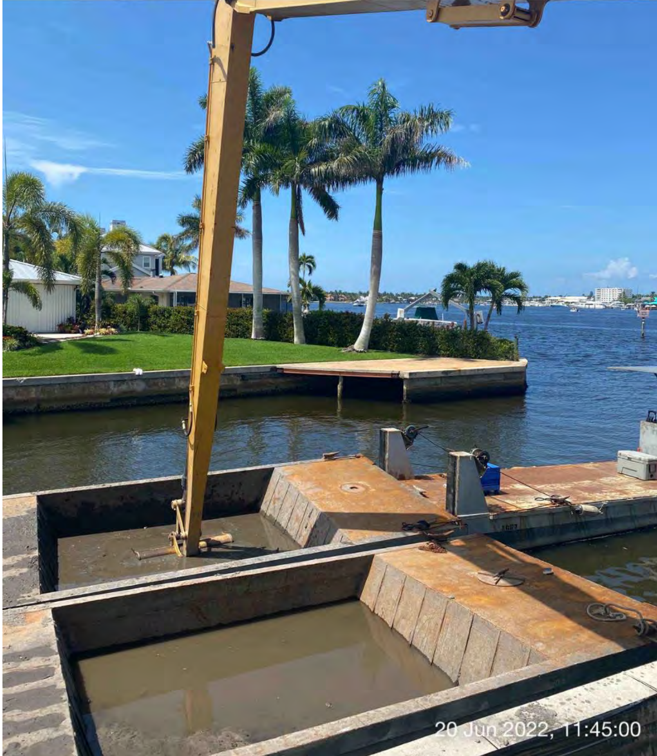
2 full hoppers of material at station 1+50 in Canal CC-CC

SE 150 S 180 SW 210 W 270 203°S (T) 26°8'13"N, 81°47'16"W ±26ft ▲ 9ft