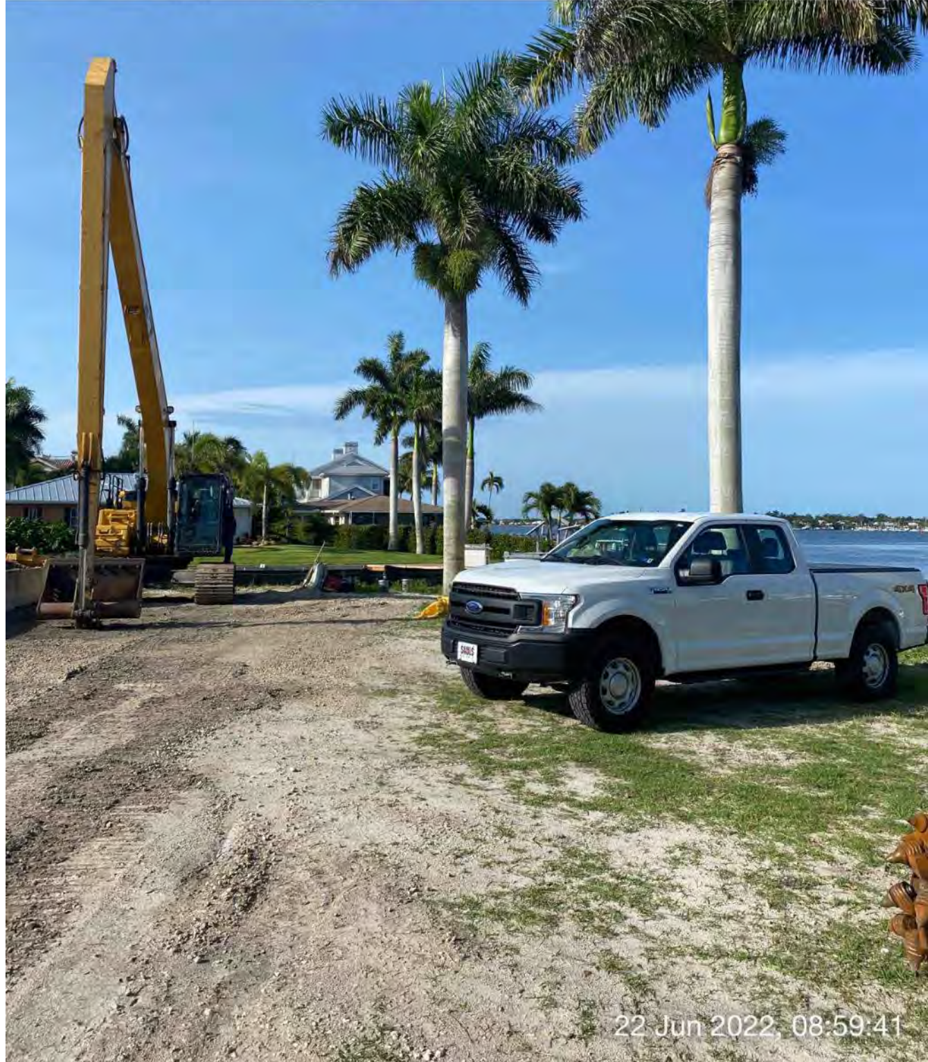
Seismic Surveys truck on site at 1300 Curlew Avenue

SE S SW 20 150 180 210 240 ☉ 191°S (T) ☉ 26°8'14"N, 81°47'16"W ±13ft ▲ 10ft