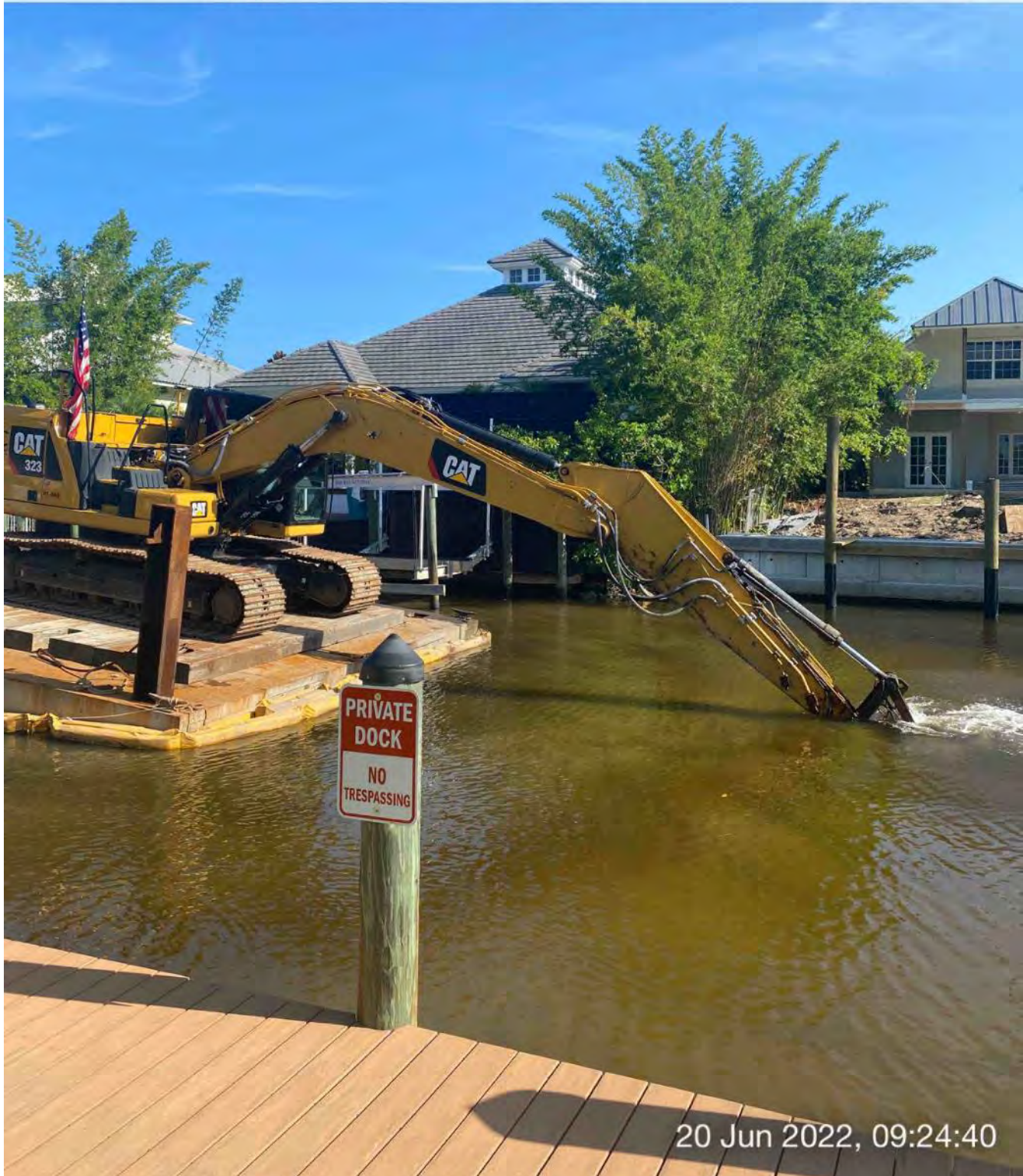
323 excavator removing material from station 7+00

☉ 342°N (T) ☉ 26°8'4"N, 81°47'8"W ±13ft ▲ 9ft