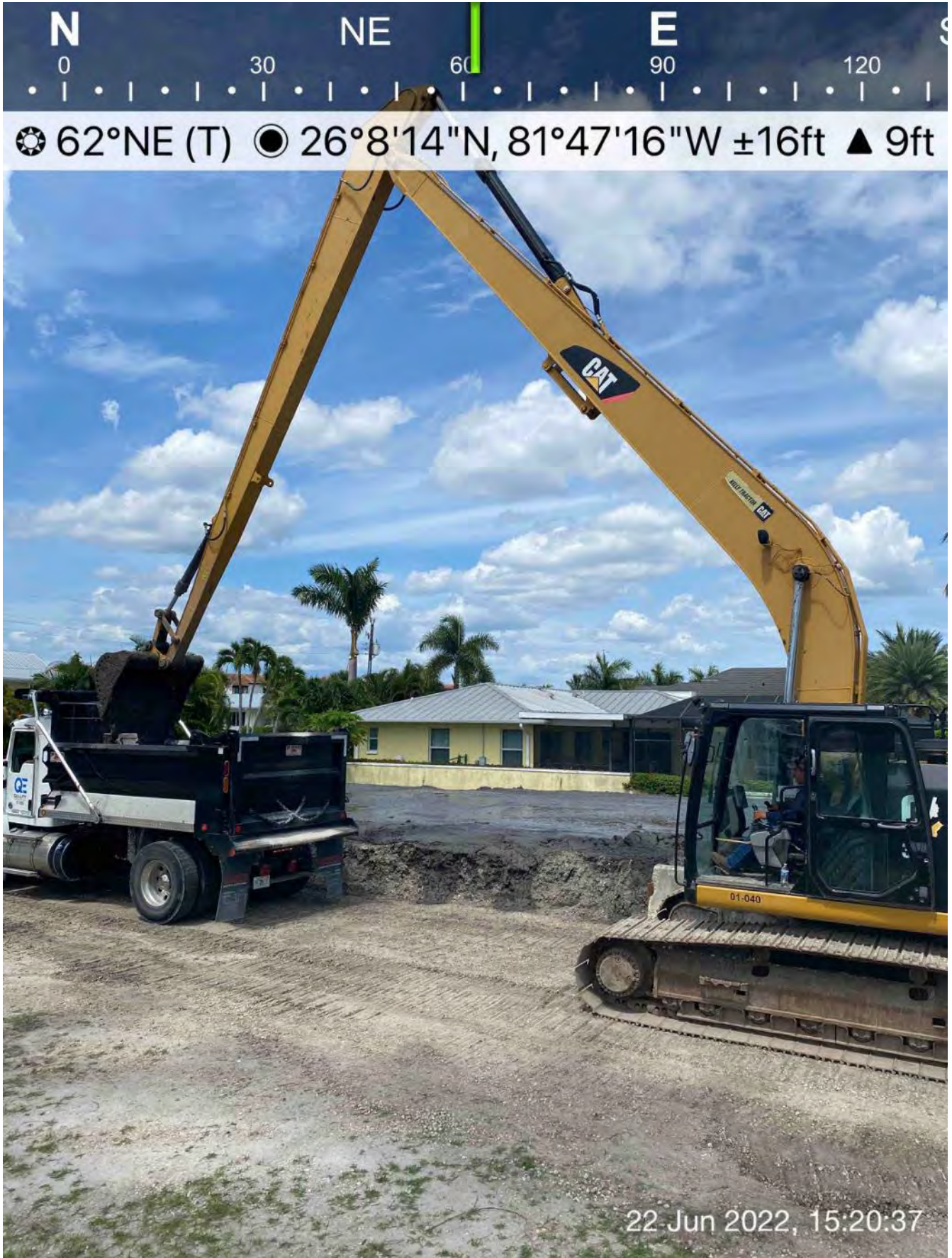
326 excavator transferring removed material from the dewatering site to dump truck bed at 1300 Curlew Avenue