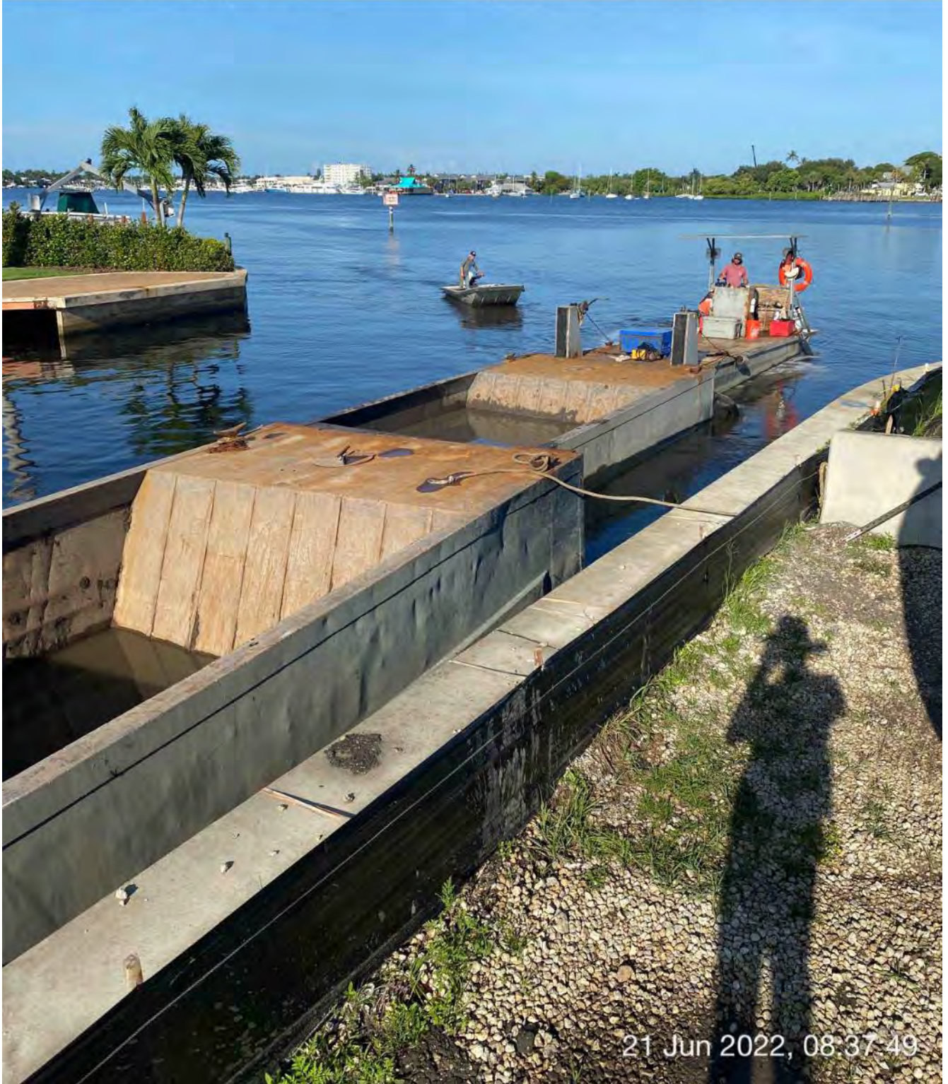
Push boat transporting full hopper of material from Canal X-X to Canal CC-CC

SW W NW 210 240 270 300 330 ☉ 262°W (T) ● 26°8'13"N, 81°47'16"W ±16ft ▲ 8ft