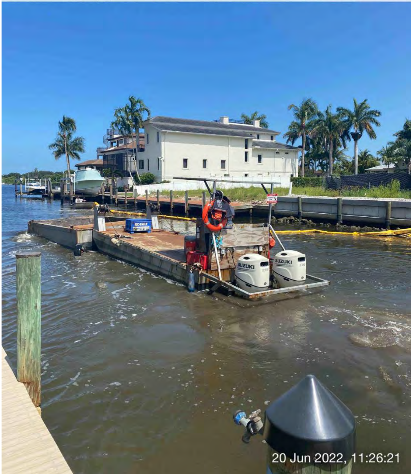
Support boat opening turbidity curtain to allow push boat to transport full hopper from Canal X-X to Canal CC-CC

W NW N 240 270 300 330 0 ☀ 308°NW (T) ☉ 26°8'4"N, 81°47'12"W ±22ft ▲ 8ft