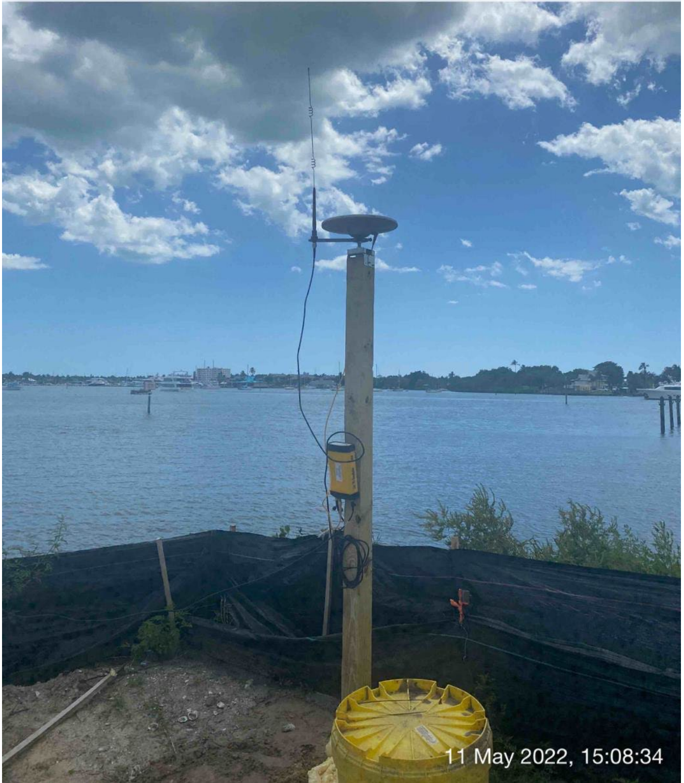
Base station installed on southwest corner of 1300 Curlew Avenue

☉ 238°SW (T) ● 26°8'13"N, 81°47'16"W ±13ft ▲ 8ft