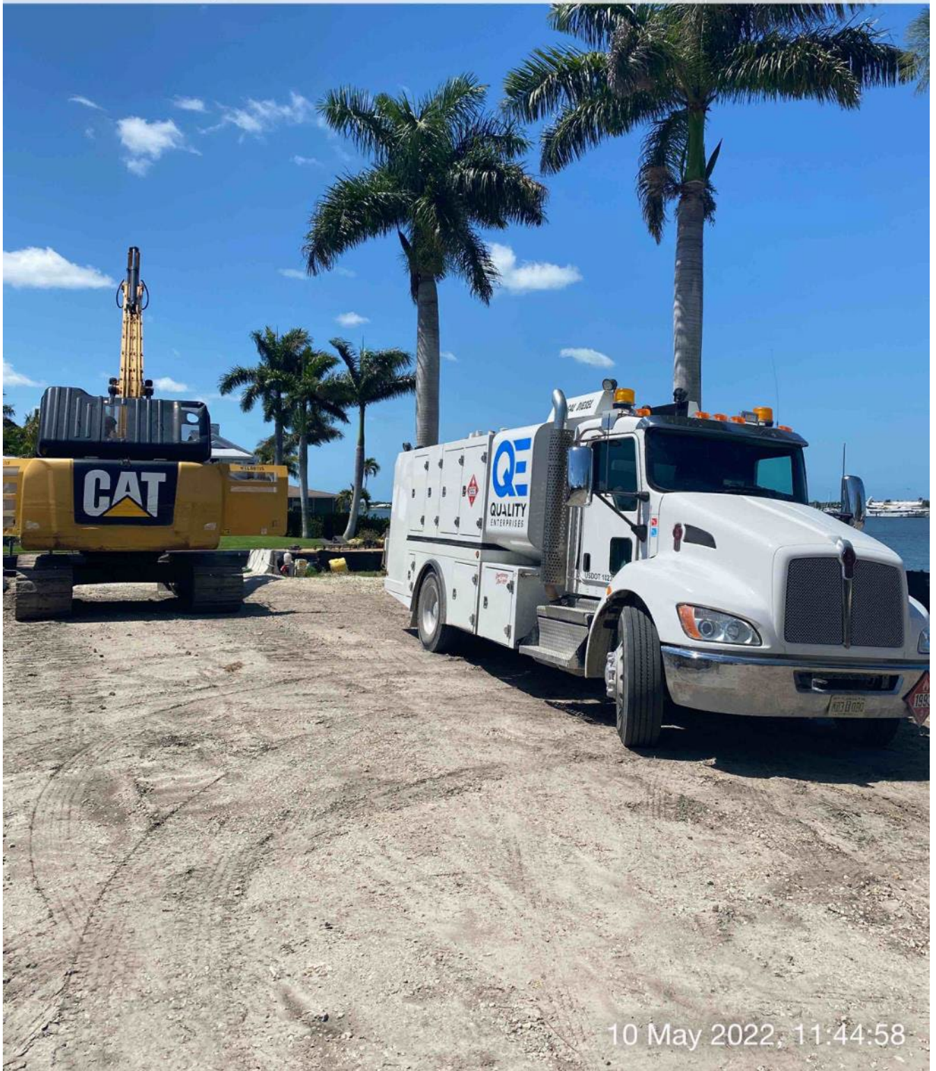
Utility truck on site and mechanic servicing 326 excavator at 1300 Curlew Avenue

SE 150 S 180 SW 240 W 270 ☀ 202°S (T) ☉ 26°8'14"N, 81°47'16"W ±49ft ▲ 8ft