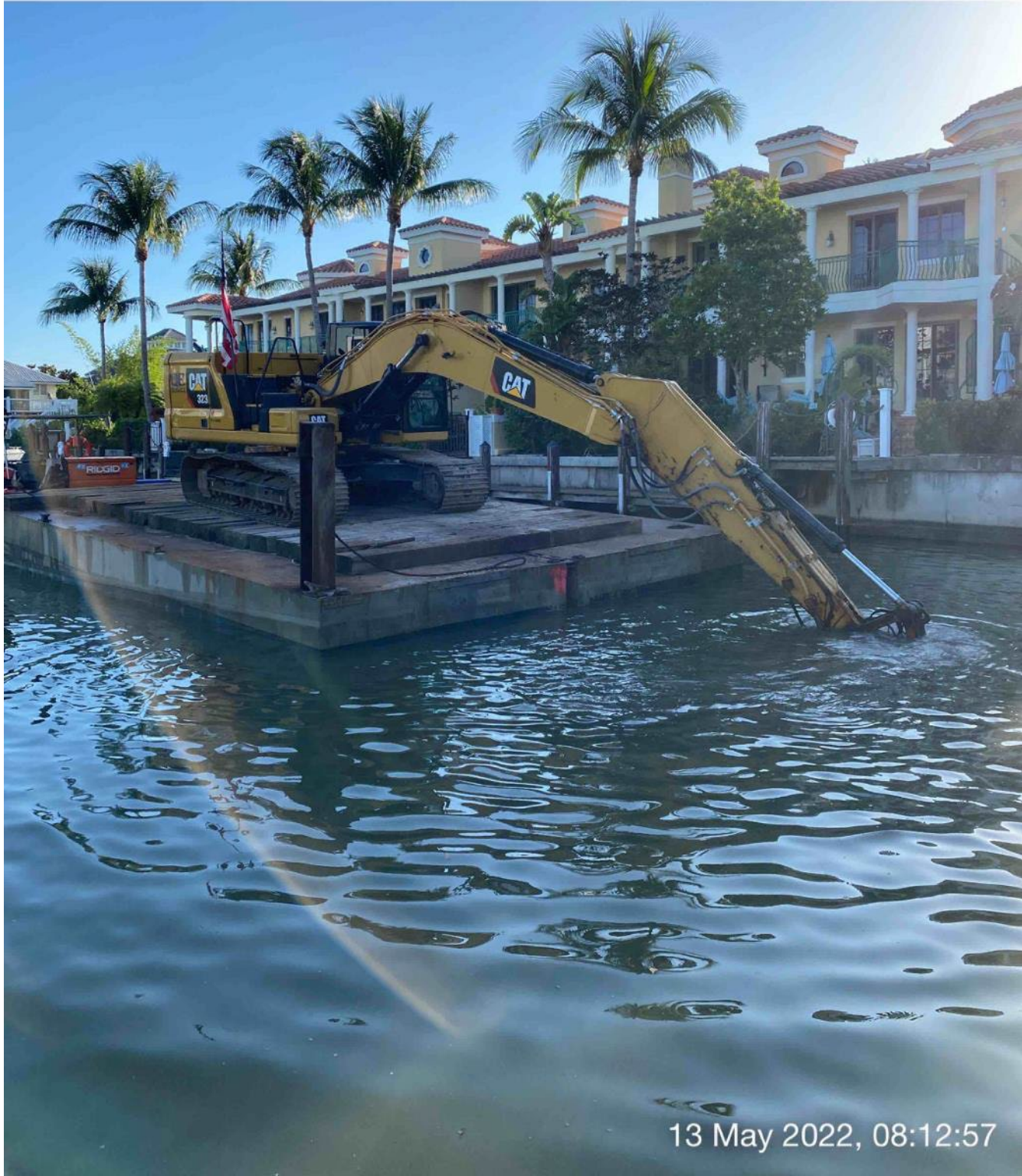
323 excavator grinding rock at station 2+25

☉ 42°NE (T) ● 26°8'2"N, 81°47'10"W ±42ft ▲ 9ft