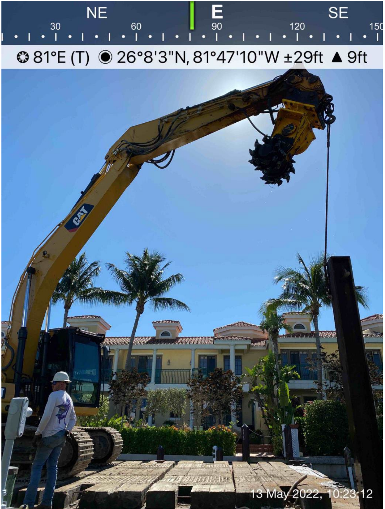
323 excavator lifting spud to allow push boat to mobilize barge at station 2+00