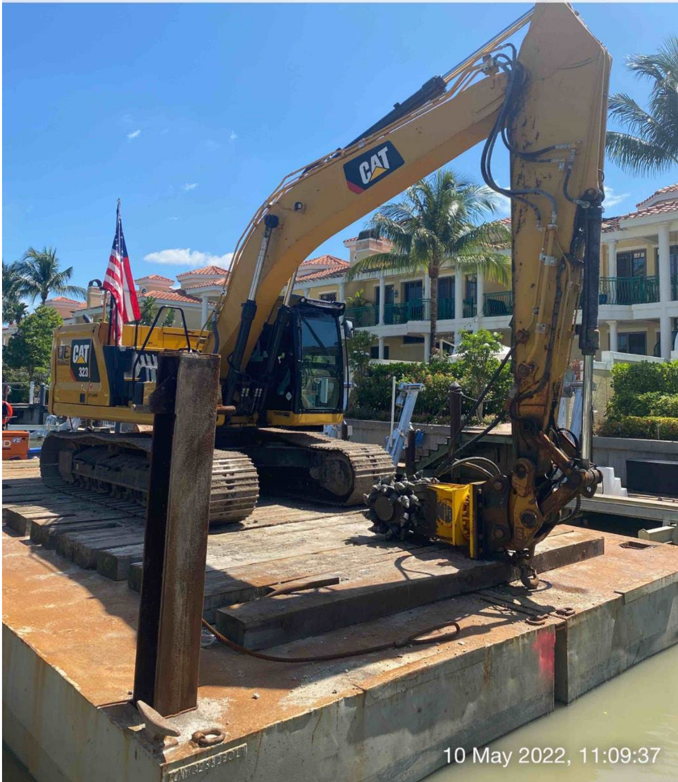
323 excavator on barge at station 3+75

☀ 40°NE (T) ☉ 26°8'1"N, 81°47'10"W ±13ft ▲ 9ft