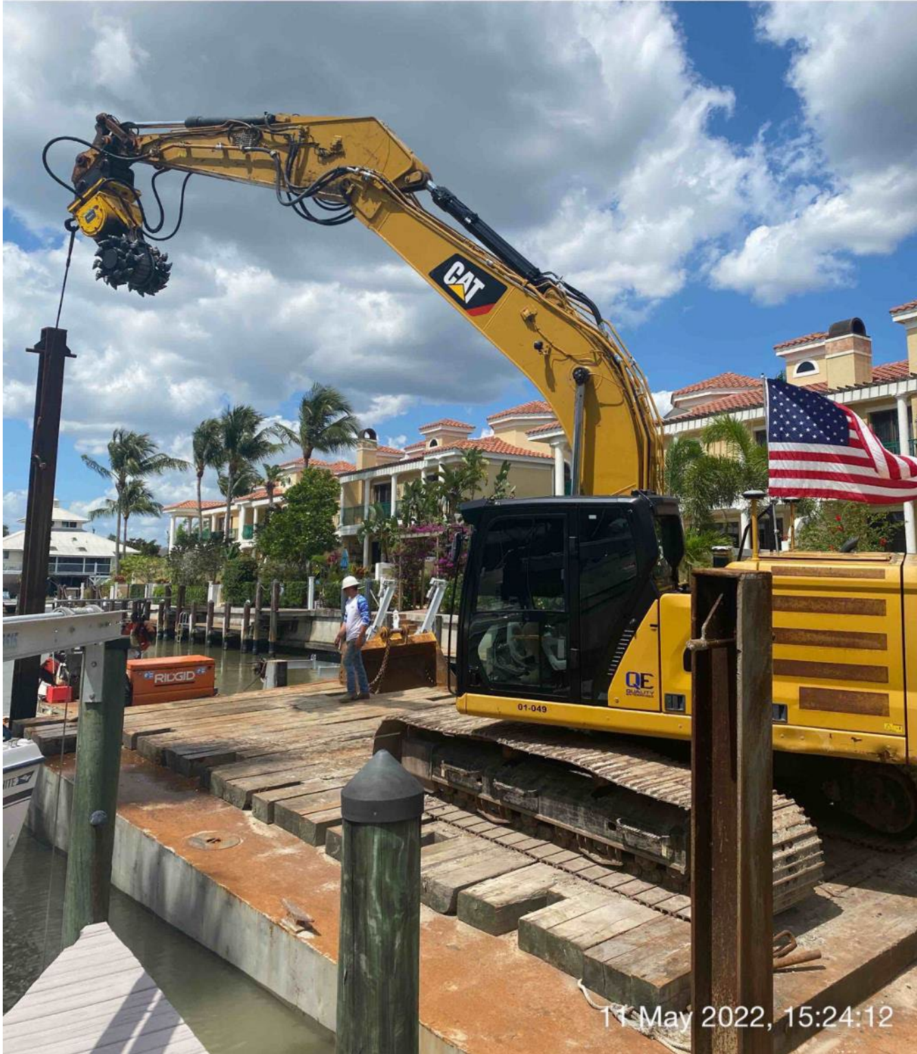
323 excavator lifting spud to allow push boat to mobilize barge at station 3+50

☉ 30°NE (T) ● 26°8'1"N, 81°47'10"W ±49ft ▲ 9ft