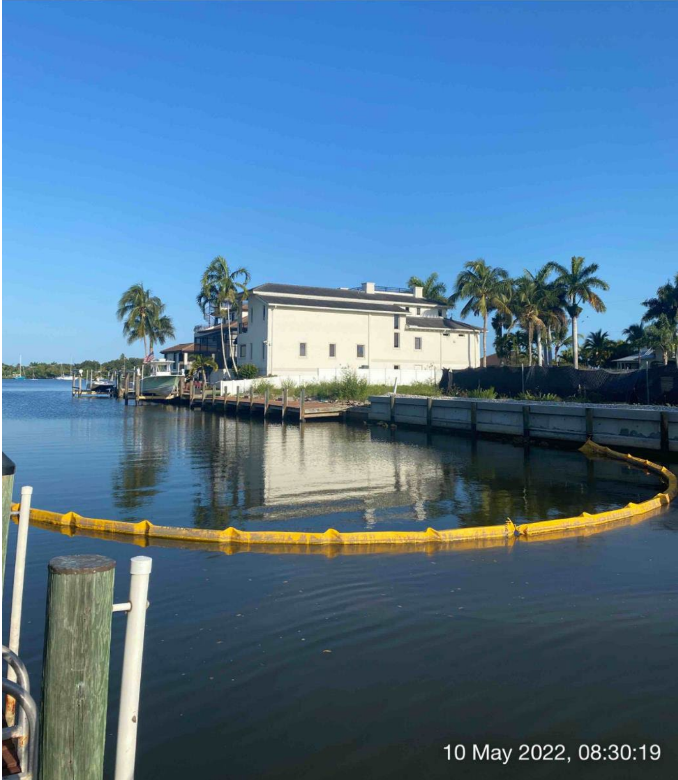
Turbidity curtain installed across Canal X-X at station 3+75