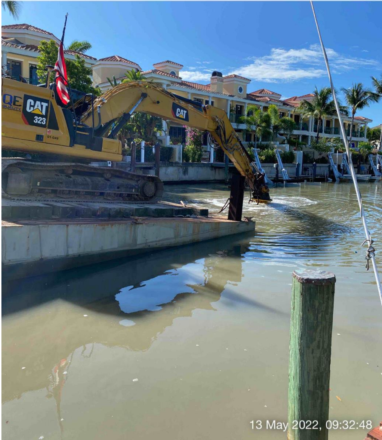
323 excavator grinding rock at station 2+00

☉ 138°SE (T) ☉ 26°8'3"N, 81°47'11"W ±16ft ▲ 8ft