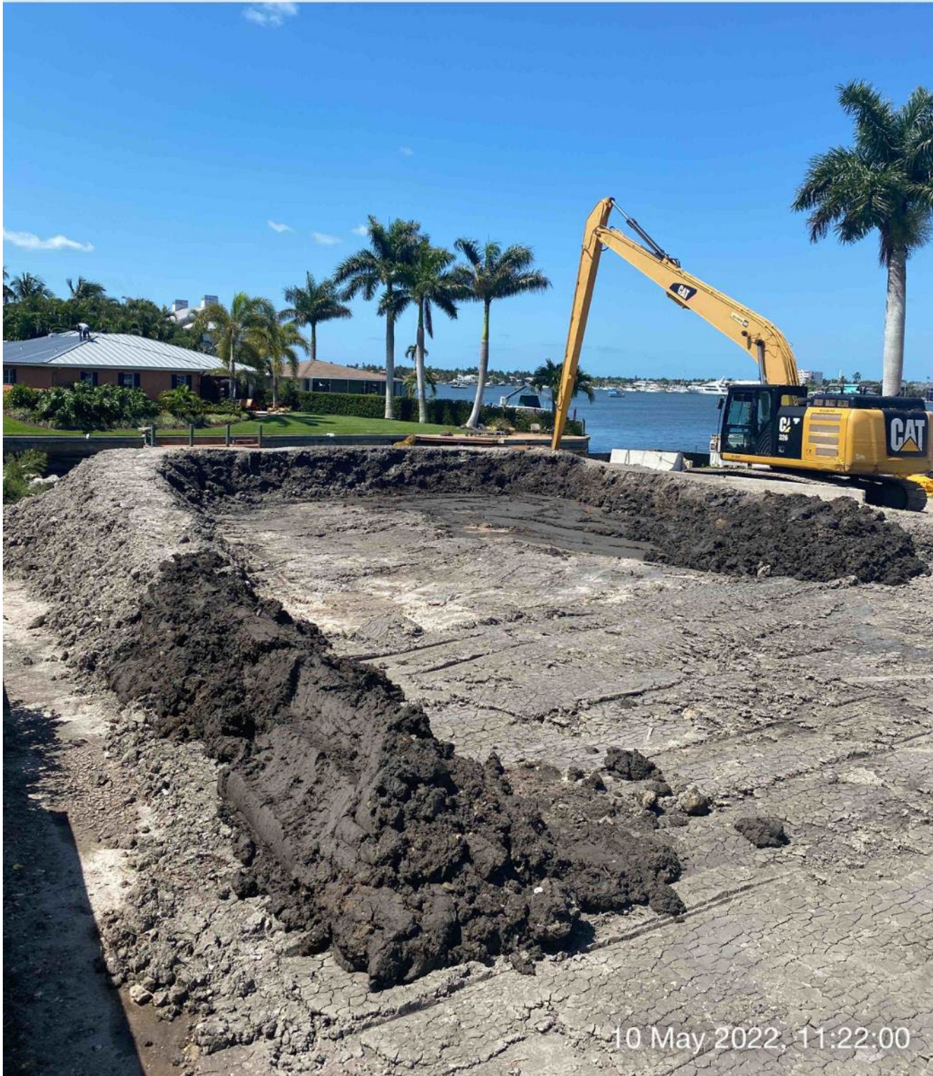
Removed material at 1300 Curlew Avenue

S SW W 150 180 210 240 270 ☀ 217°SW (T) ☉ 26°8'14"N, 81°47'15"W ±13ft ▲ 9ft