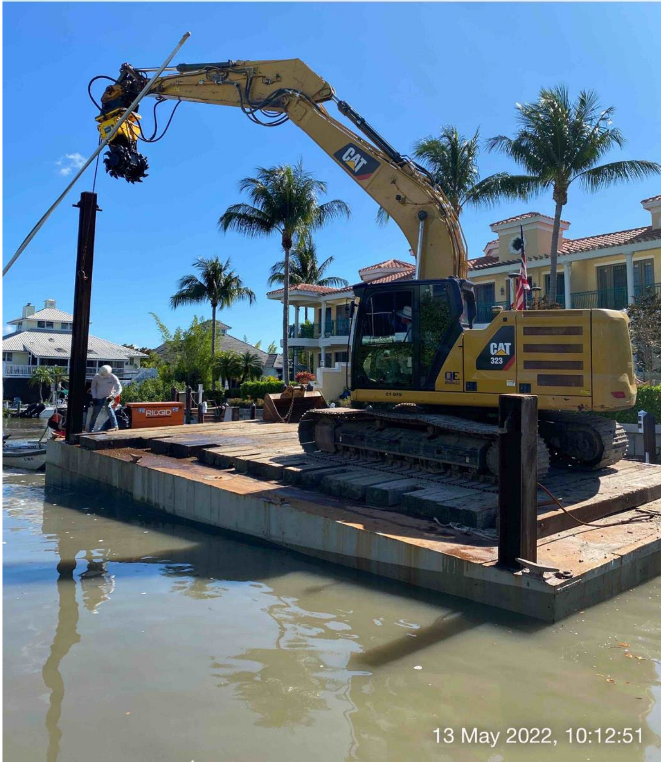
323 excavator lifting spud to allow push boat to mobilize barge at station 2+00

☀ 39°NE (T) ☉ 26°8'3"N, 81°47'10"W ±32ft ▲ 9ft