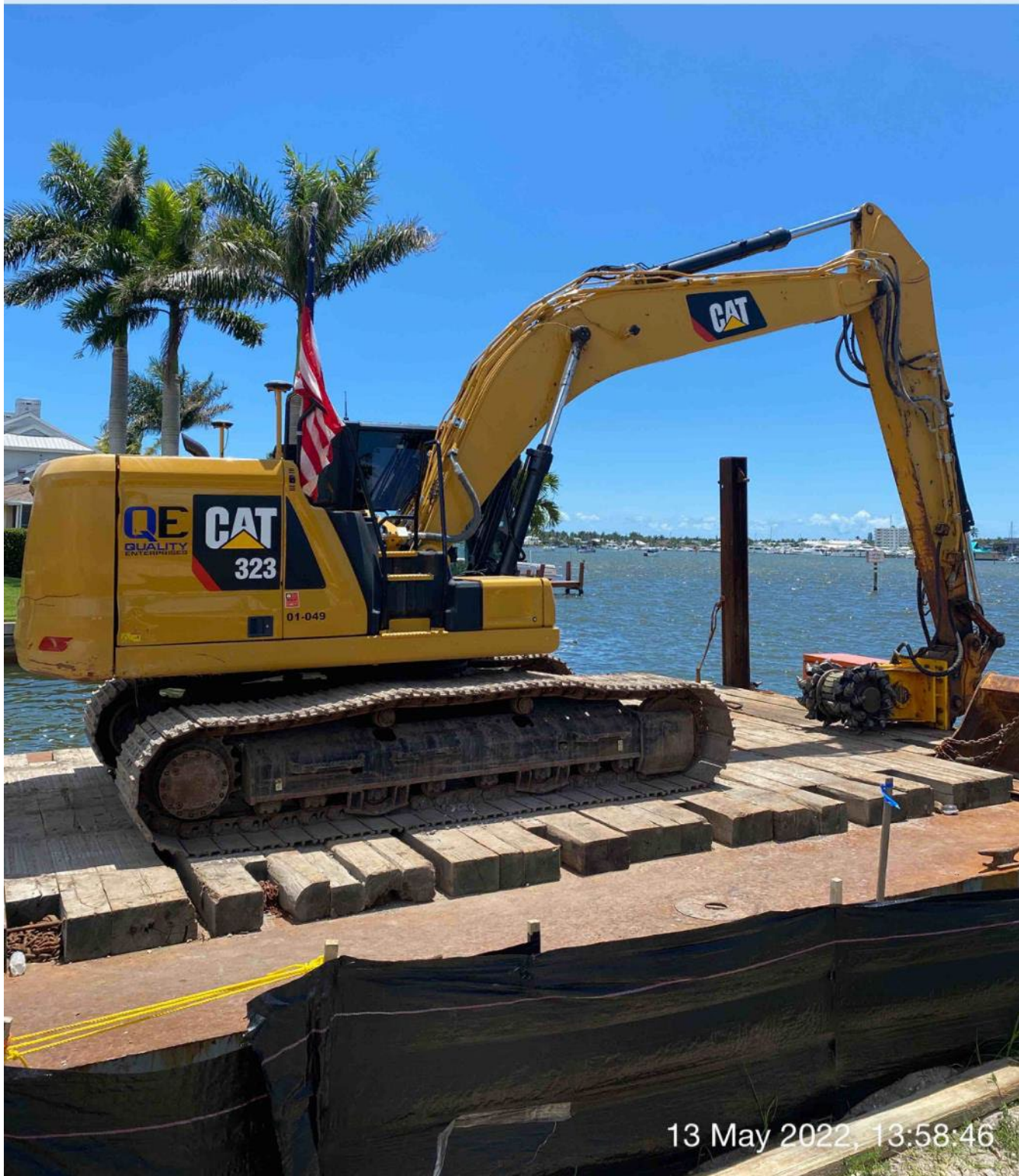
323 excavator on barge at station 1+00 in Canal CC-CC

E S SW W 150 180 10 240 270 ☉ 208°SW (T) ☉ 26°8'14"N, 81°47'16"W ±29ft ▲ 8ft