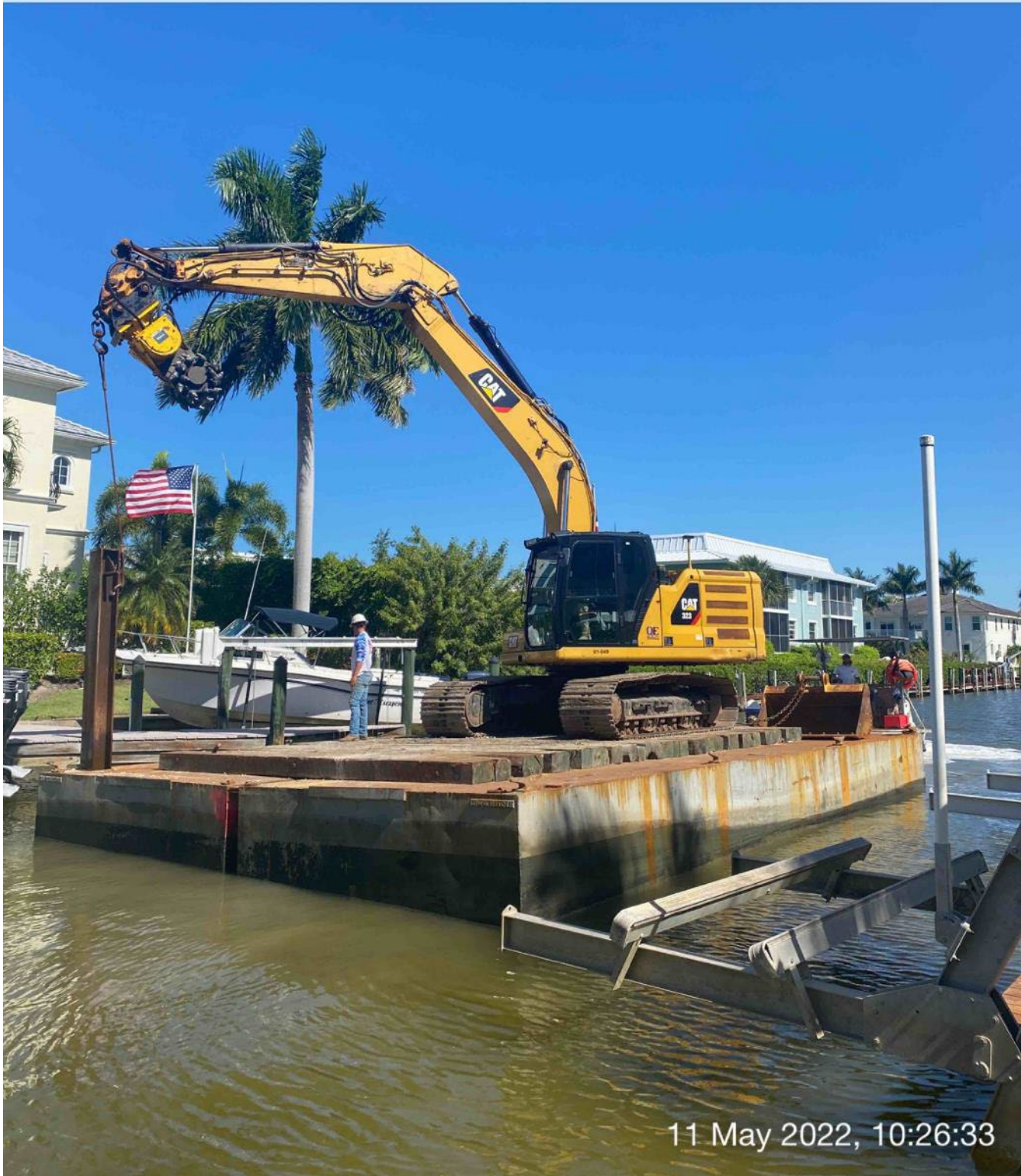
323 excavator lifting spud to allow push boat to mobilize barge at station 3+50