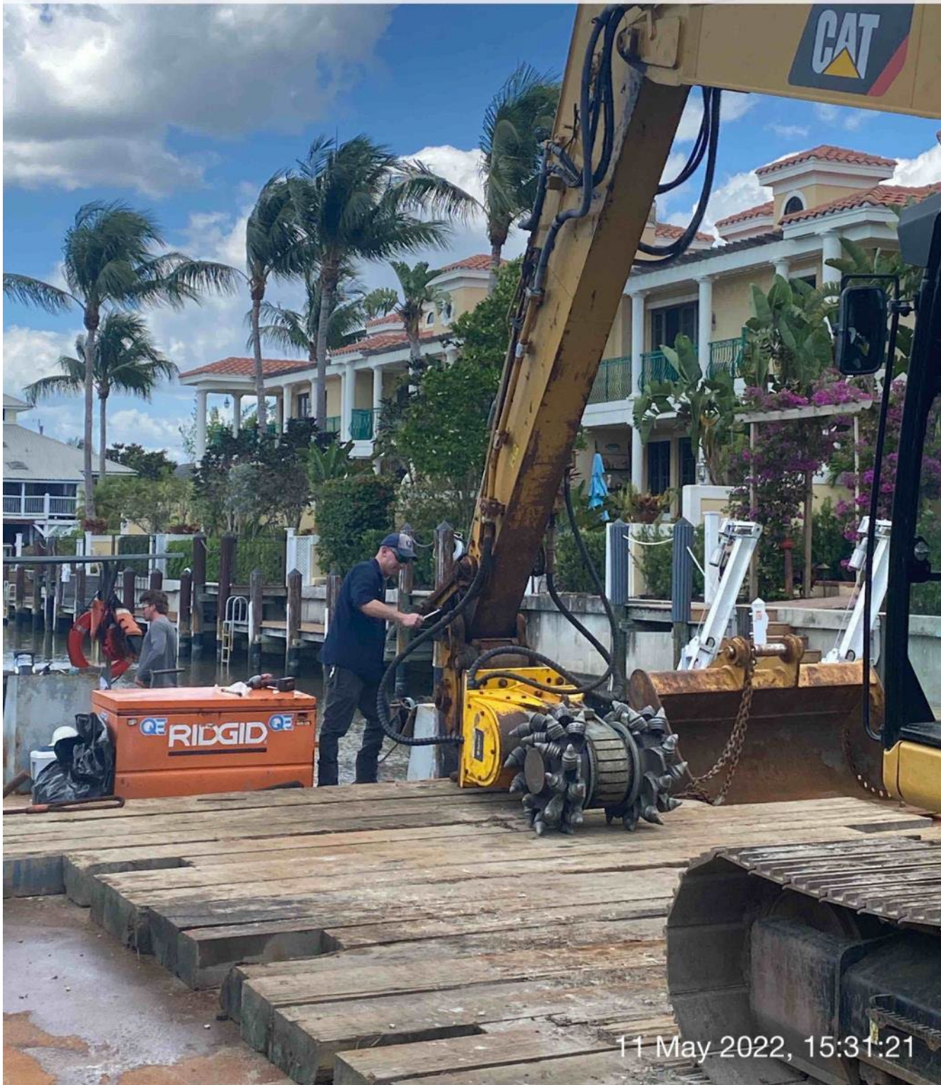
Mechanic fixing bolt on 323 excavator

☀ 12°N (T) ☉ 26°8'2"N, 81°47'10"W ±32ft ▲ 9ft