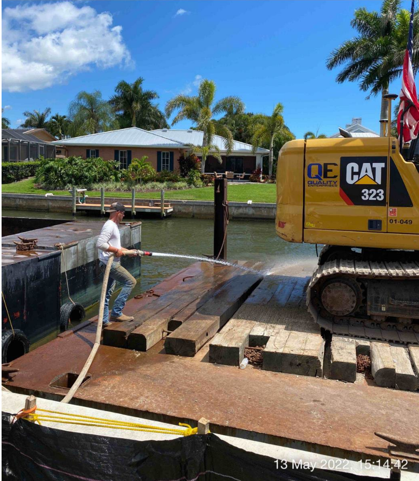
Contractor using water tank to clean barge at station 1+00 in Canal CC-CC

E 0 SE 120 150 180 210 SW ☀ 162°S (T) ☉ 26°8'13"N, 81°47'16"W ±16ft ▲ 9ft