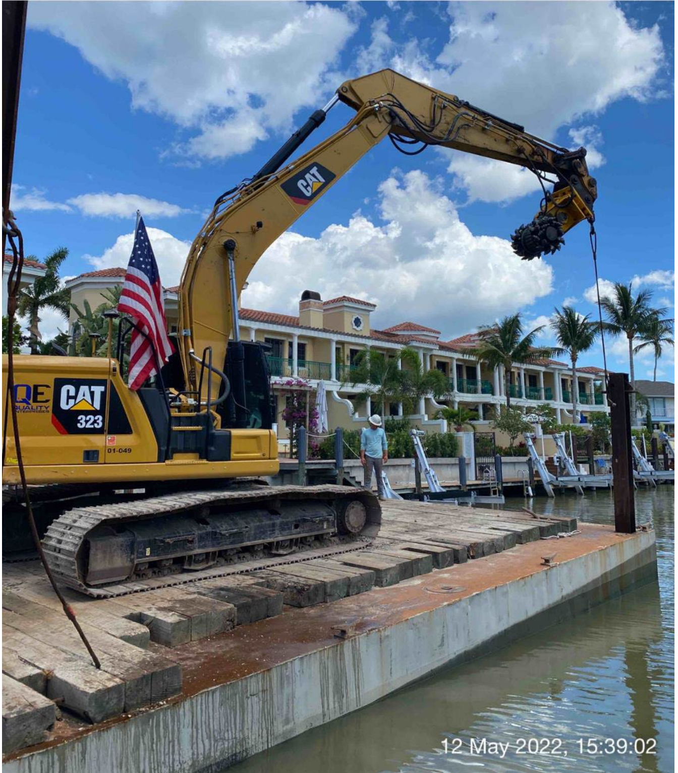
323 excavator lifting spud to allow push boat to mobilize barge at station 2+50

E 90 SE 120 150 S 180 210 140°SE (T) 26°8'3"N, 81°47'10"W ±13ft ▲ 10ft