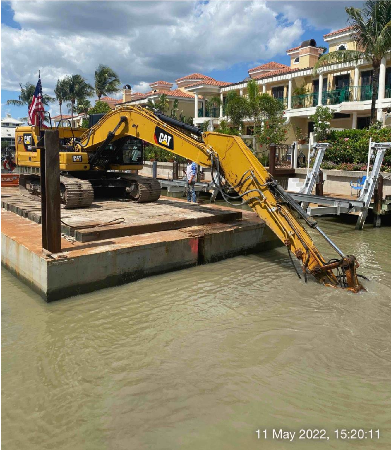
323 excavator grinding rock at station 3+25

☀ 42°NE (T) ☉ 26°8'1"N, 81°47'10"W ±22ft ▲ 8ft