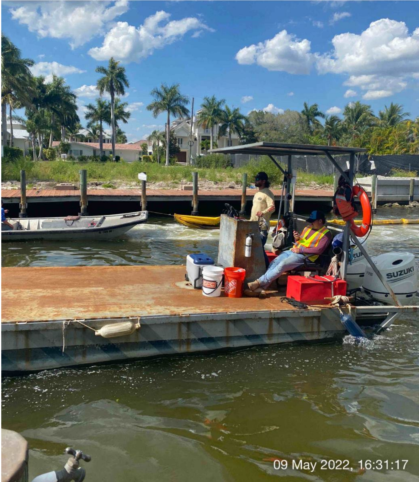
Support boat opening turbidity curtain to allow push boat to exit Canal X-X

☀ 18°N (T) ● 26°8'4"N, 81°47'13"W ±16ft ▲ 9ft