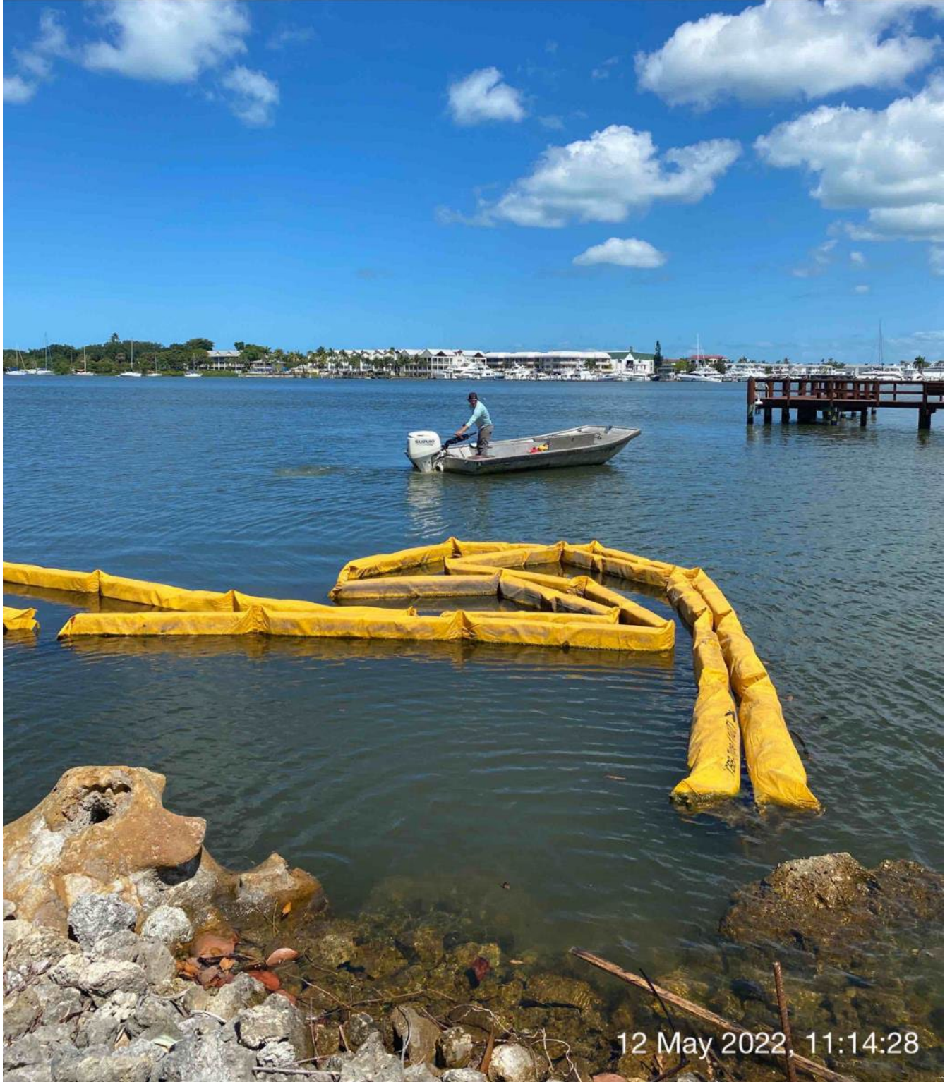
Contractor using support boat to check turbidity levels in the mouth of Canal X-X