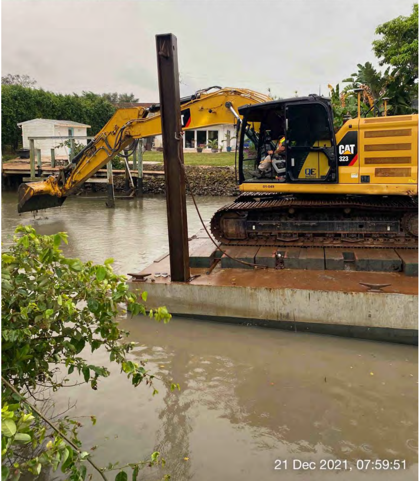
323 excavator checking elevations at station 13+50

☀ 162°S (T) ● 26°8'13"N, 81°47'4"W ±13ft ▲ 11ft