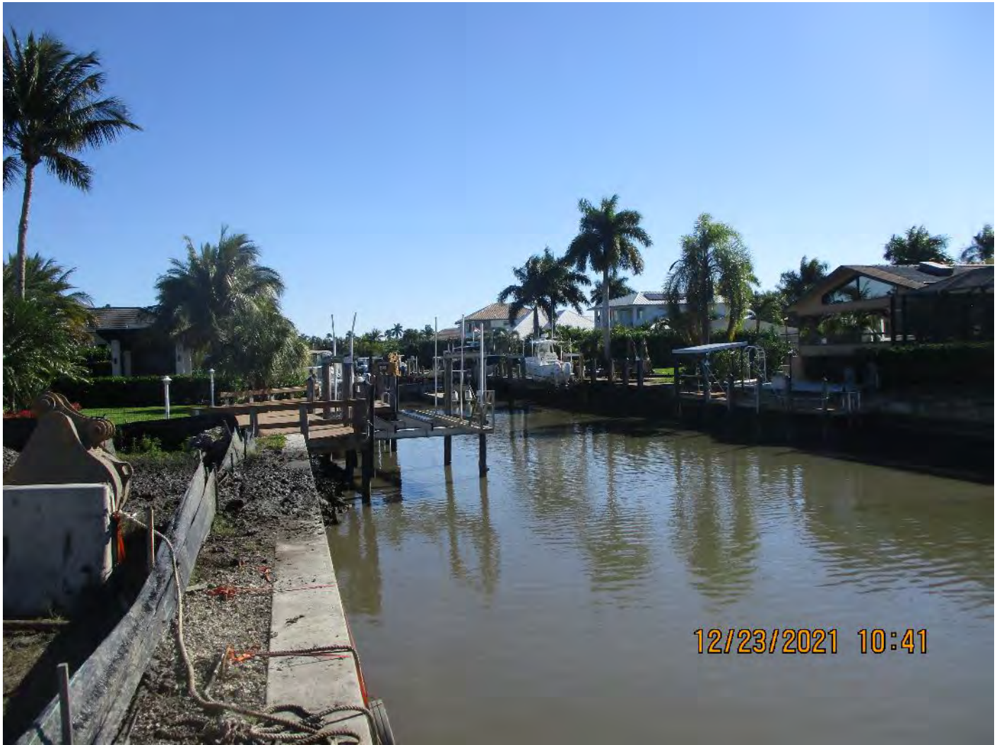
South end seawall of 1300 Curlew Avenue