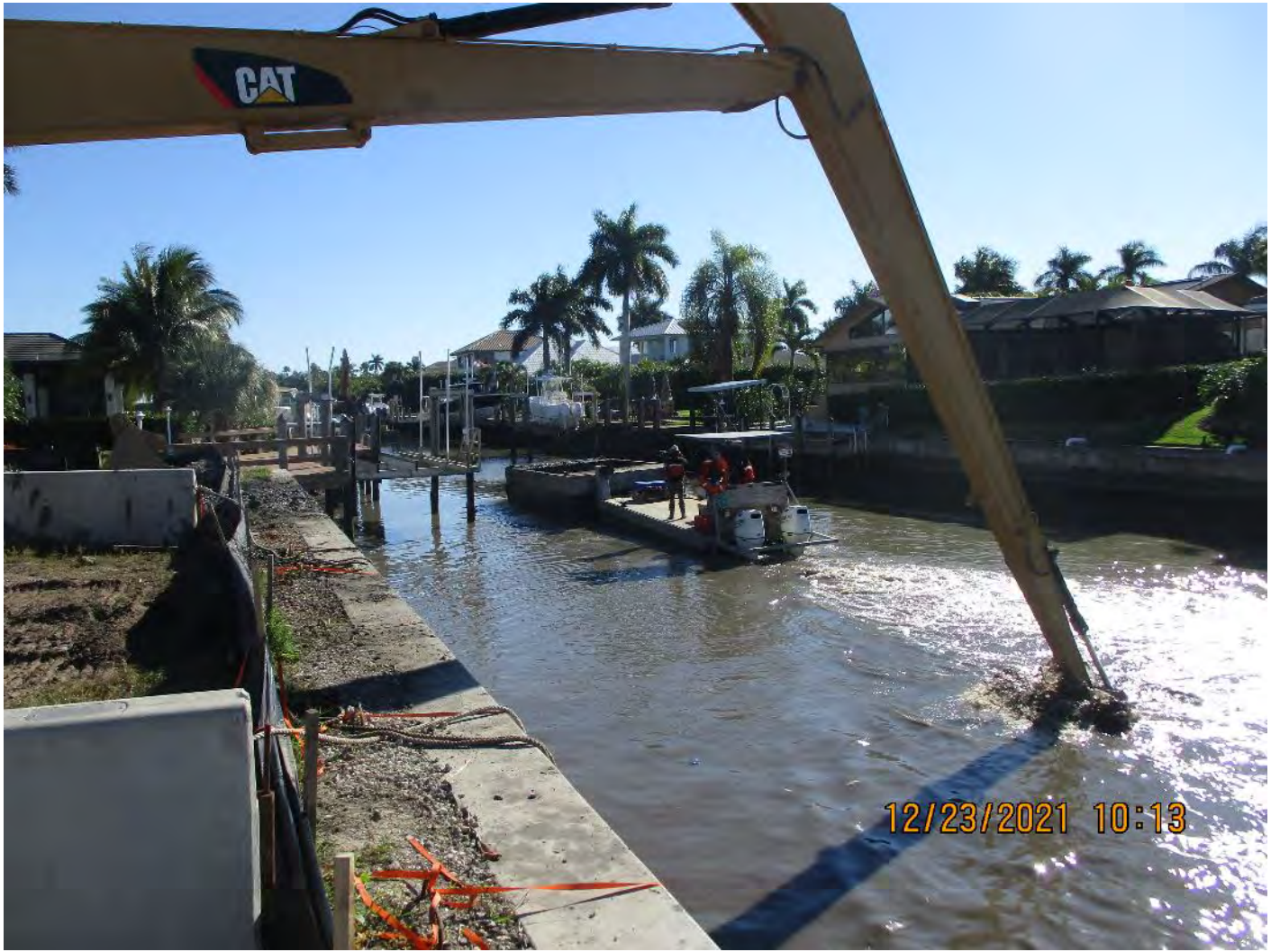
326 excavator removing material from station 1+50 and transferring to dewatering site at 1300 Curlew Avenue