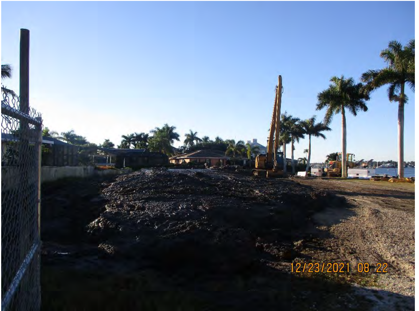
Removed material on dewatering site at 1300 Curlew Avenue