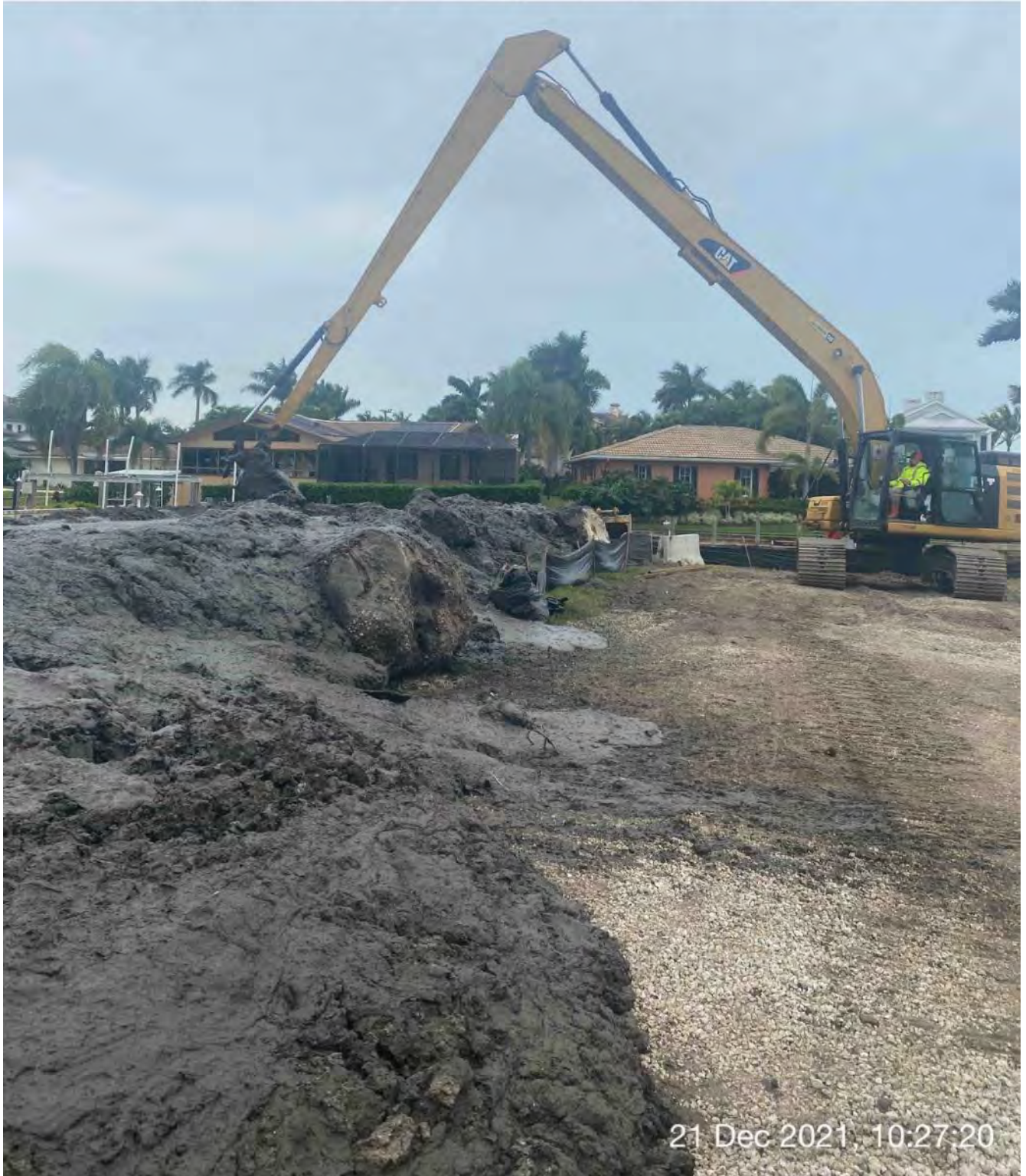
326 excavator transferring material from hopper to dewatering site at 1300 Curlew Avenue

☀ 168°S (T) ● 26°8'14"N, 81°47'15"W ±32ft ▲ 9ft