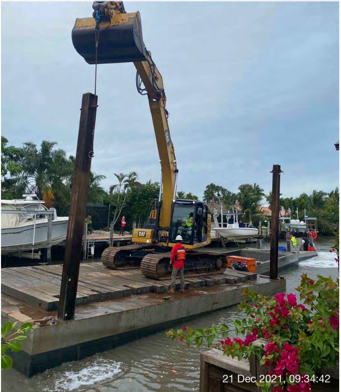
323 excavator lifting spud to allow push boat to move barge at station 13+00

☉ 227°SW (T) ● 26°8'13"N, 81°47'3"W ±13ft ▲ 12ft