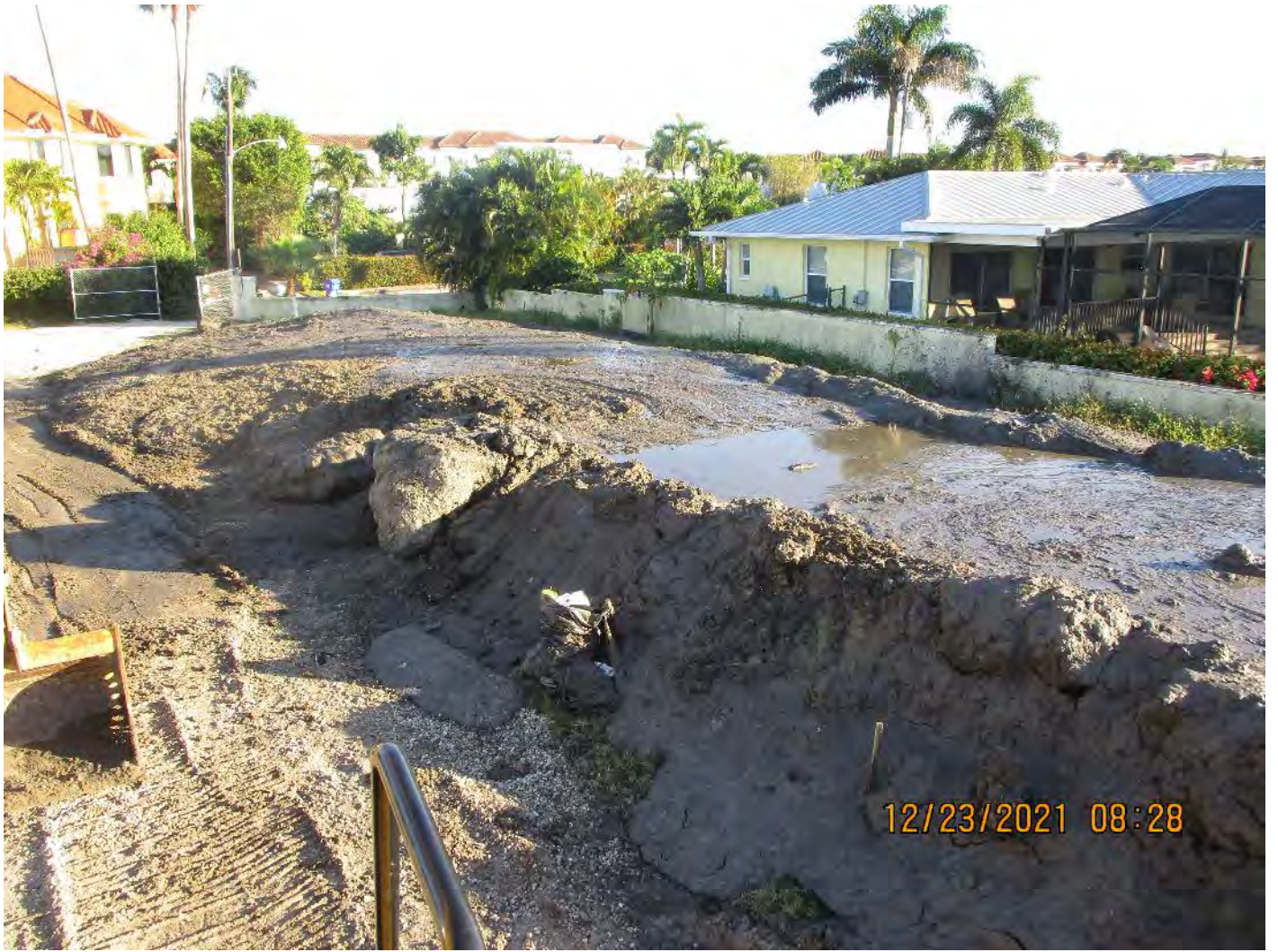
Removed material on dewatering site at 1300 Curlew Avenue