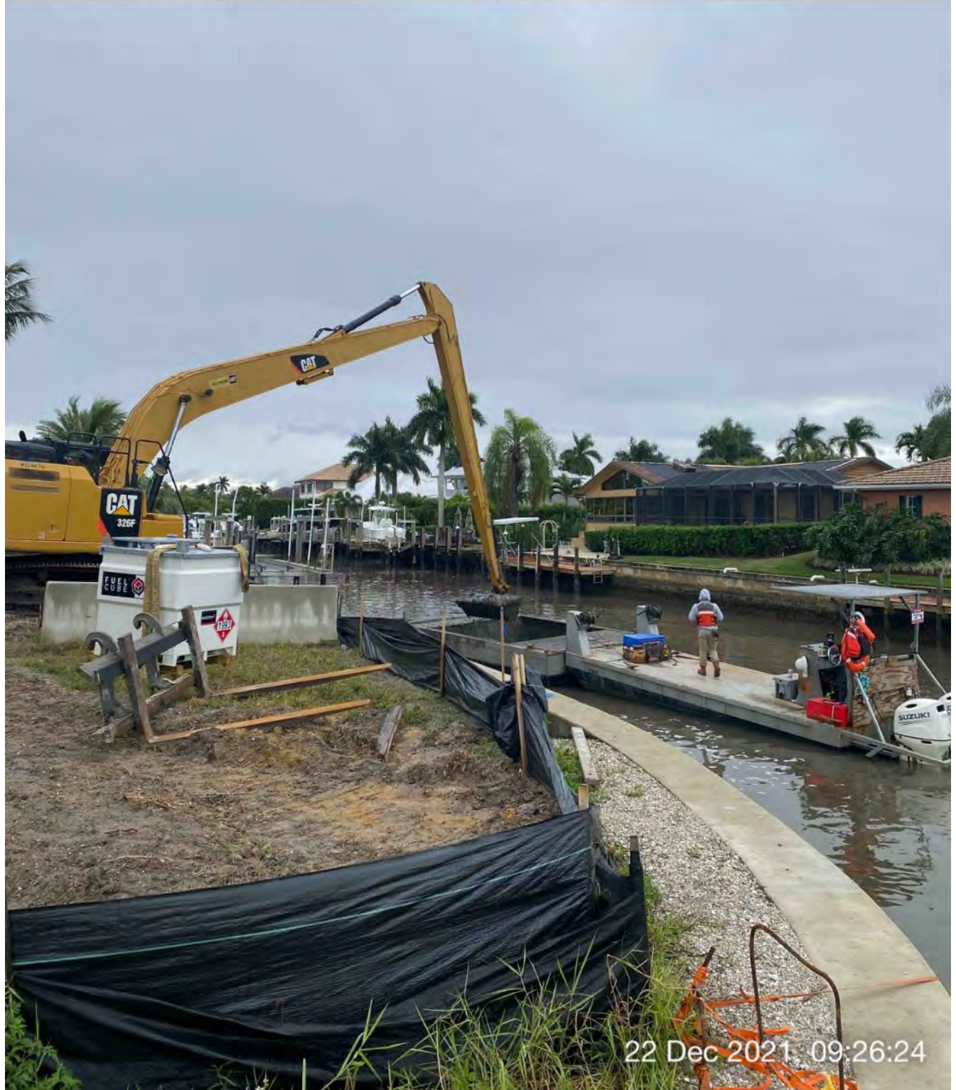
326 excavator transferring material from hopper to dewatering site at 1300 Curlew Avenue

E 60 90 120 150 180 S 119°SE (T) 26°8'13"N, 81°47'16"W ±13ft ▲ 6ft