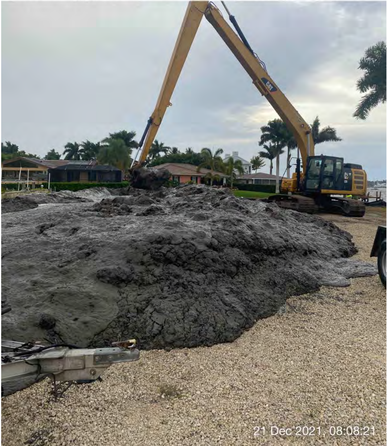
326 excavator transferring material from hopper to dewatering site at 1300 Curlew Avenue

☉ 182°S (T) ● 26°8'15"N, 81°47'16"W ±32ft ▲ 9ft