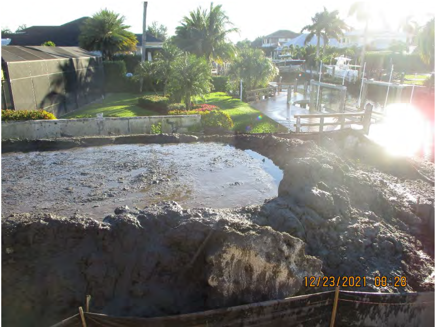
Removed material on dewatering site at 1300 Curlew Avenue