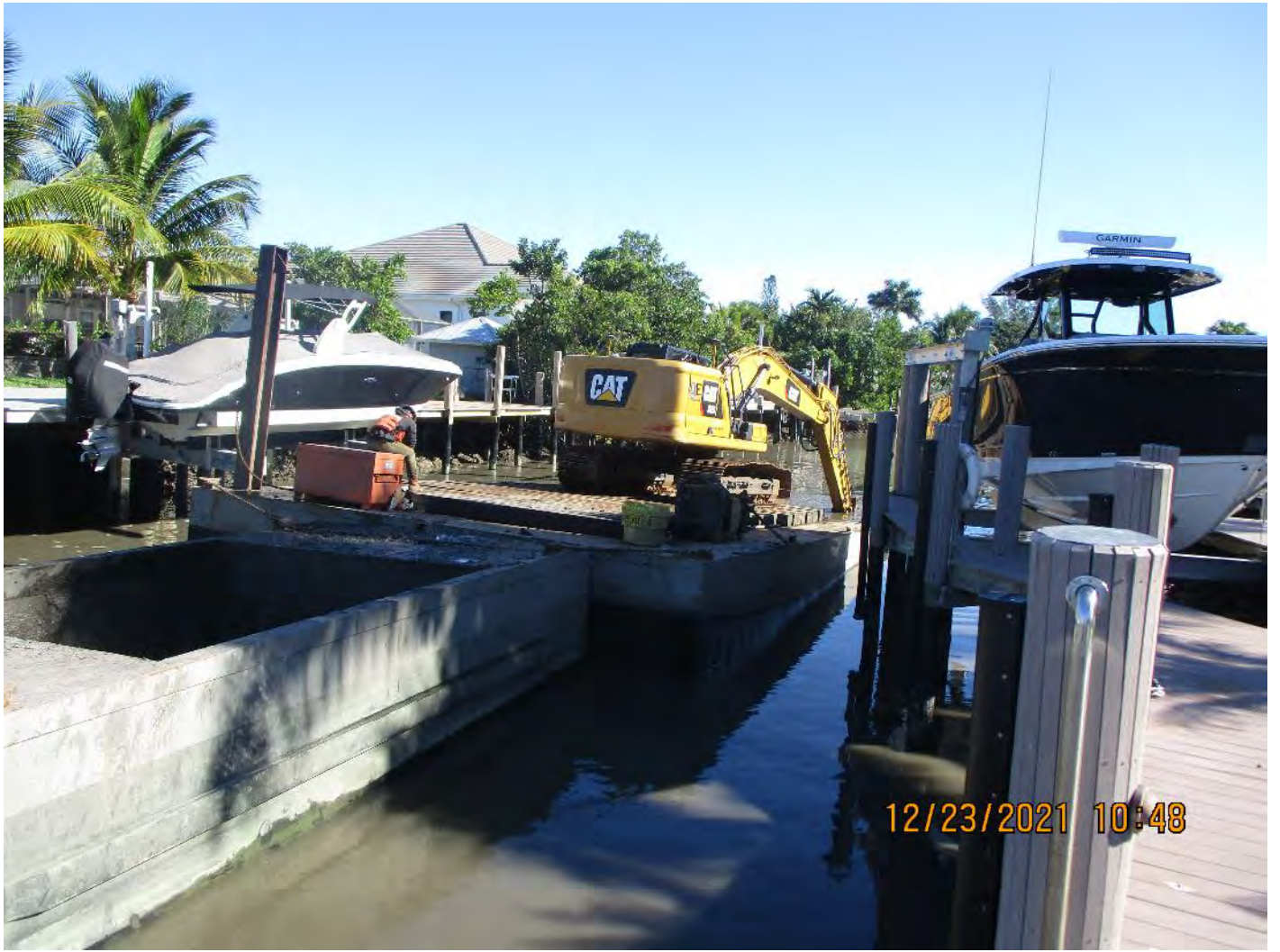
323 excavator removing material from station 4+00 and transferring to hopper