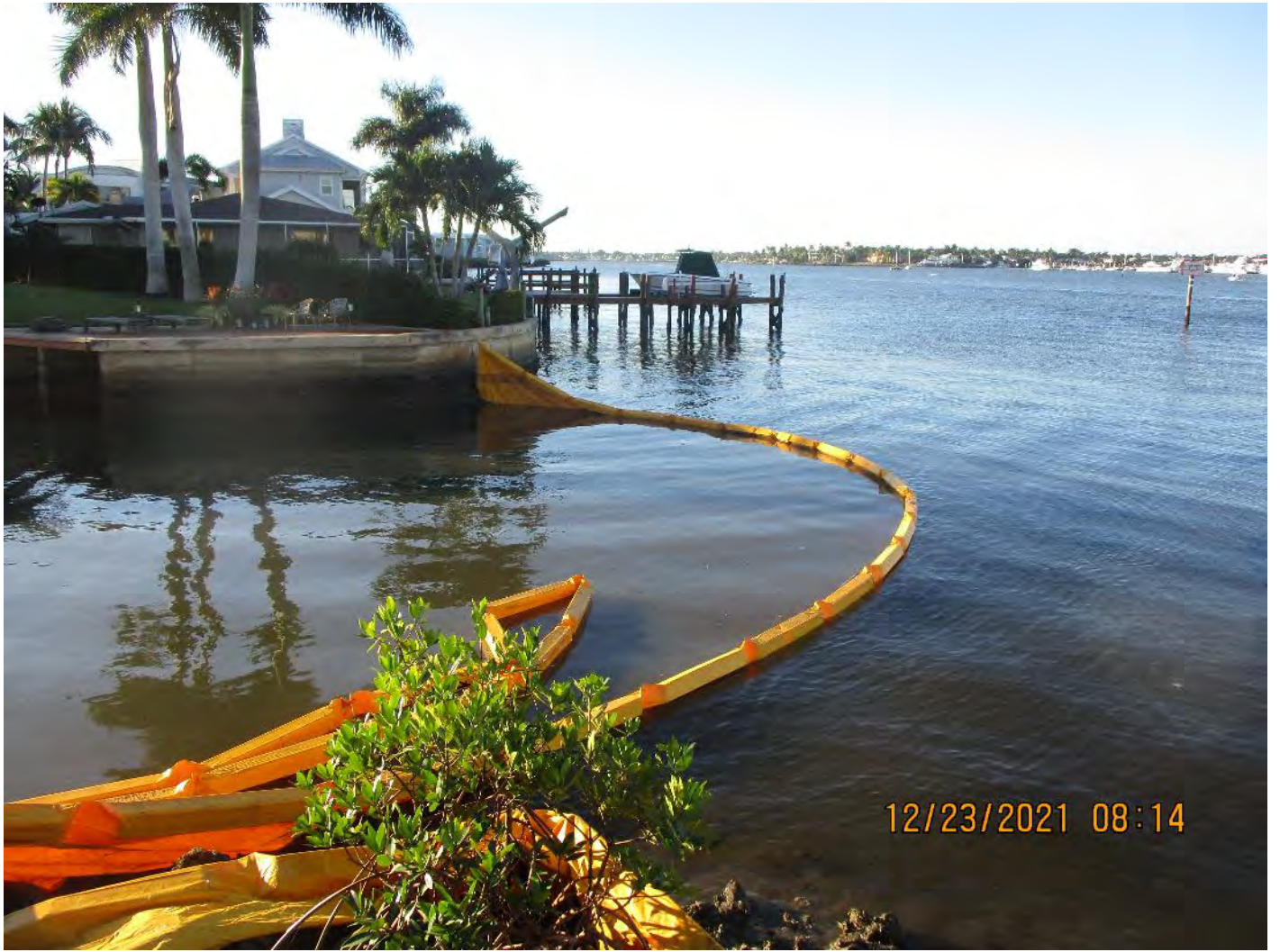
Turbidity curtain across the mouth of Canal CC-CC