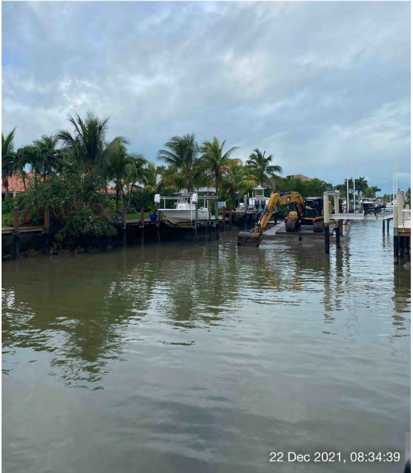
323 excavator checking depths and removing material at station 10+50

S 180 SW 210 24 W 270 300 N ☉ 242°SW (T) ☉ 26°8'13"N, 81°47'5"W ±32ft ▲ 8ft