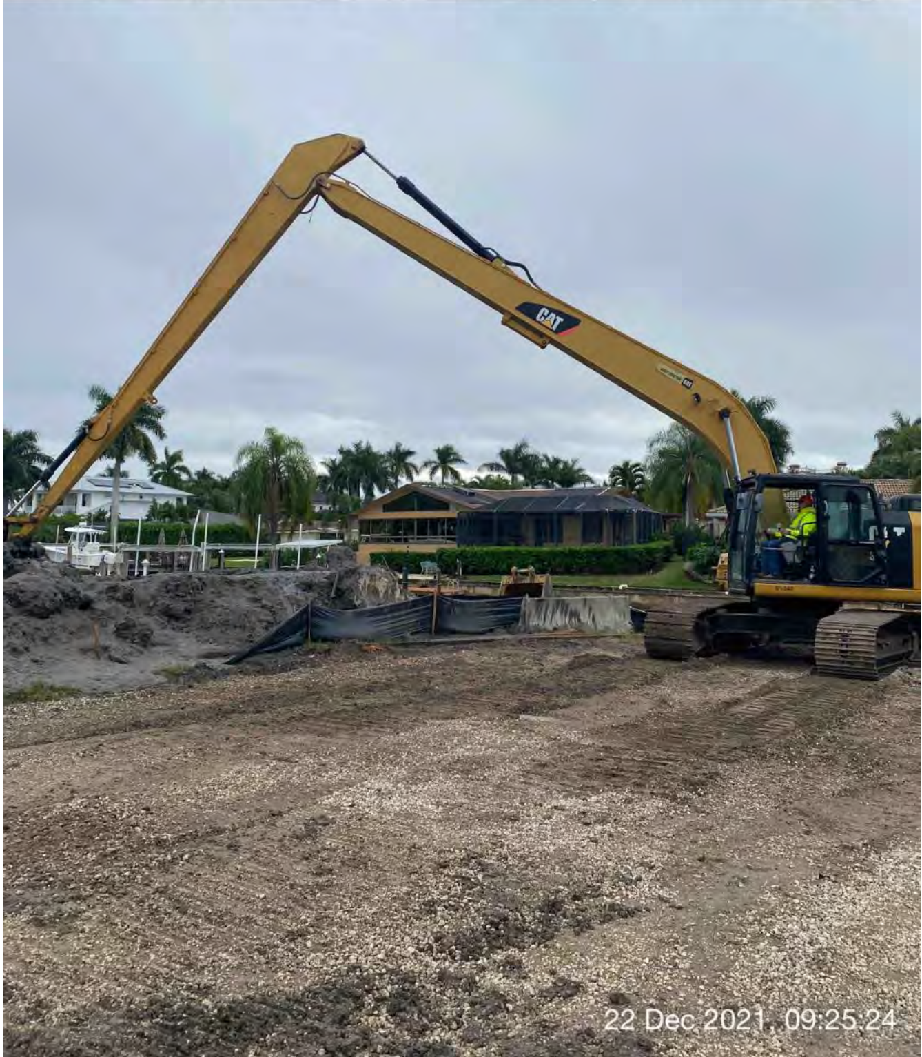
326 excavator transferring material from hopper to dewatering site at 1300 Curlew Avenue

E 90 SE 120 50 S 180 210 ☉ 148°SE (T) ☉ 26°8'13"N, 81°47'16"W ±22ft ▲ 8ft