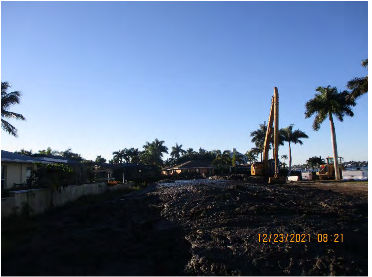
Removed material on dewatering site at 1300 Curlew Avenue