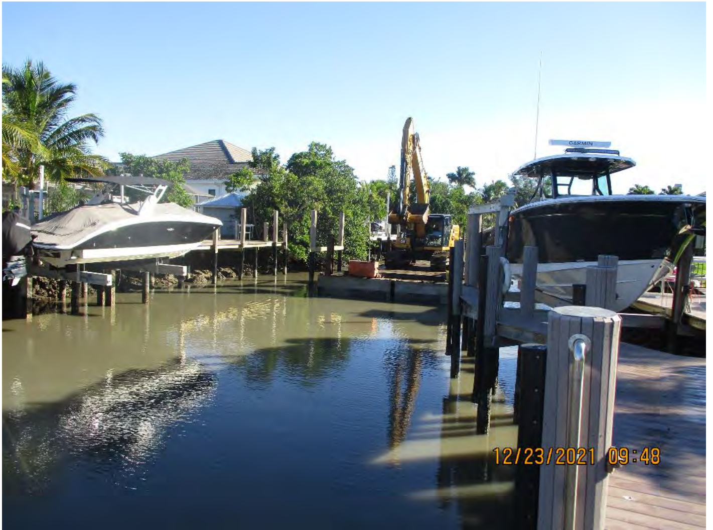
323 excavator checking bottom elevations at station 4+50