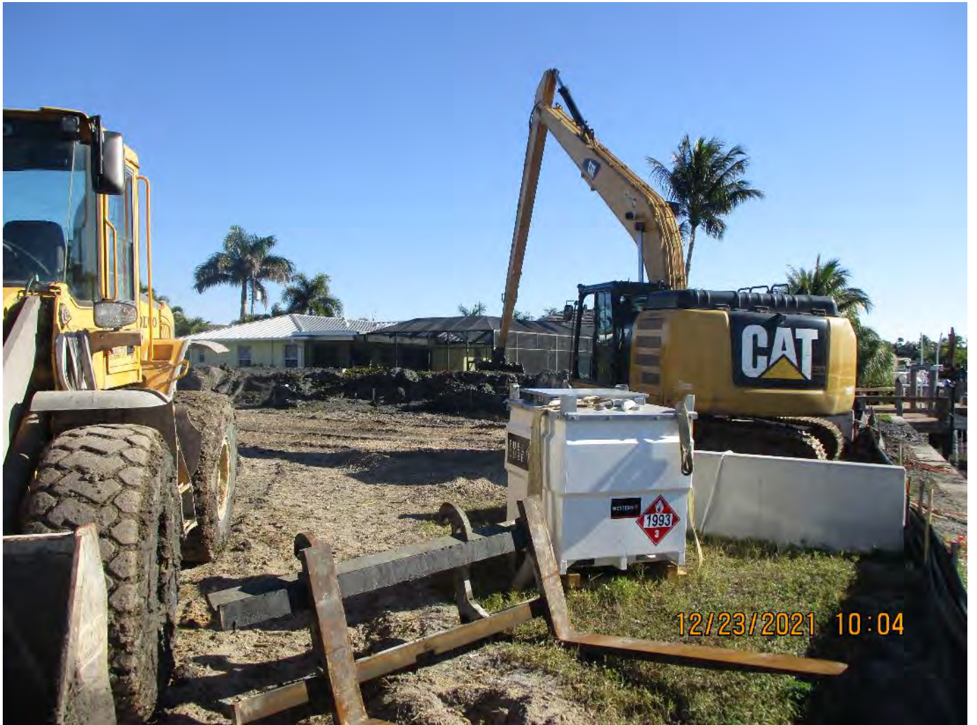
326 excavator transferring material from hopper to dewatering site at 1300 Curlew Avenue