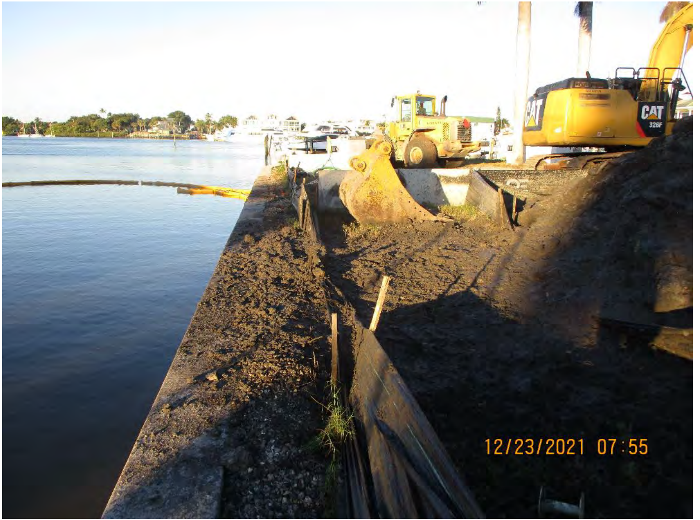
South end seawall of 1300 Curlew Avenue