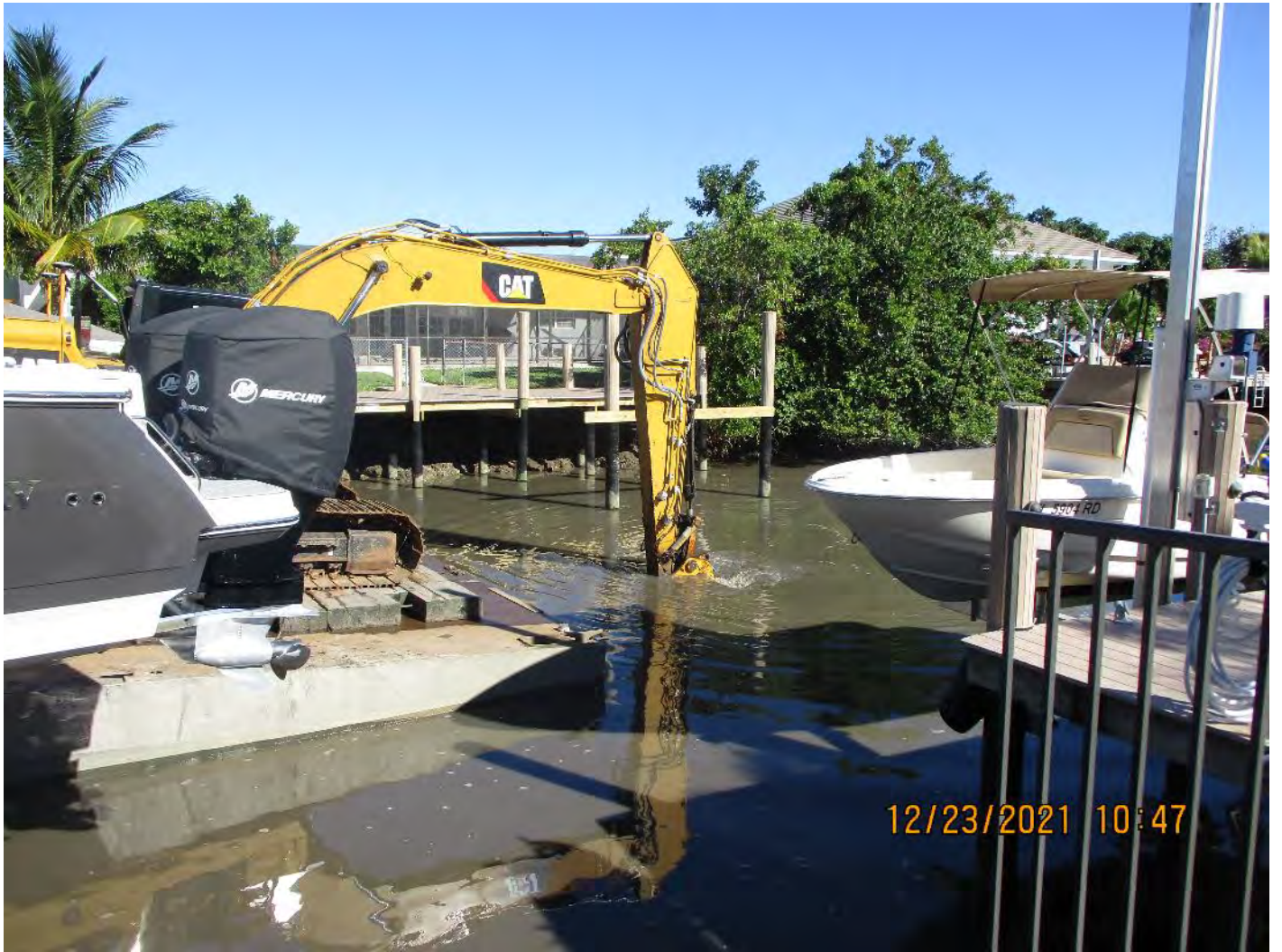
323 excavator removing material from station 4+00 and transferring to hopper