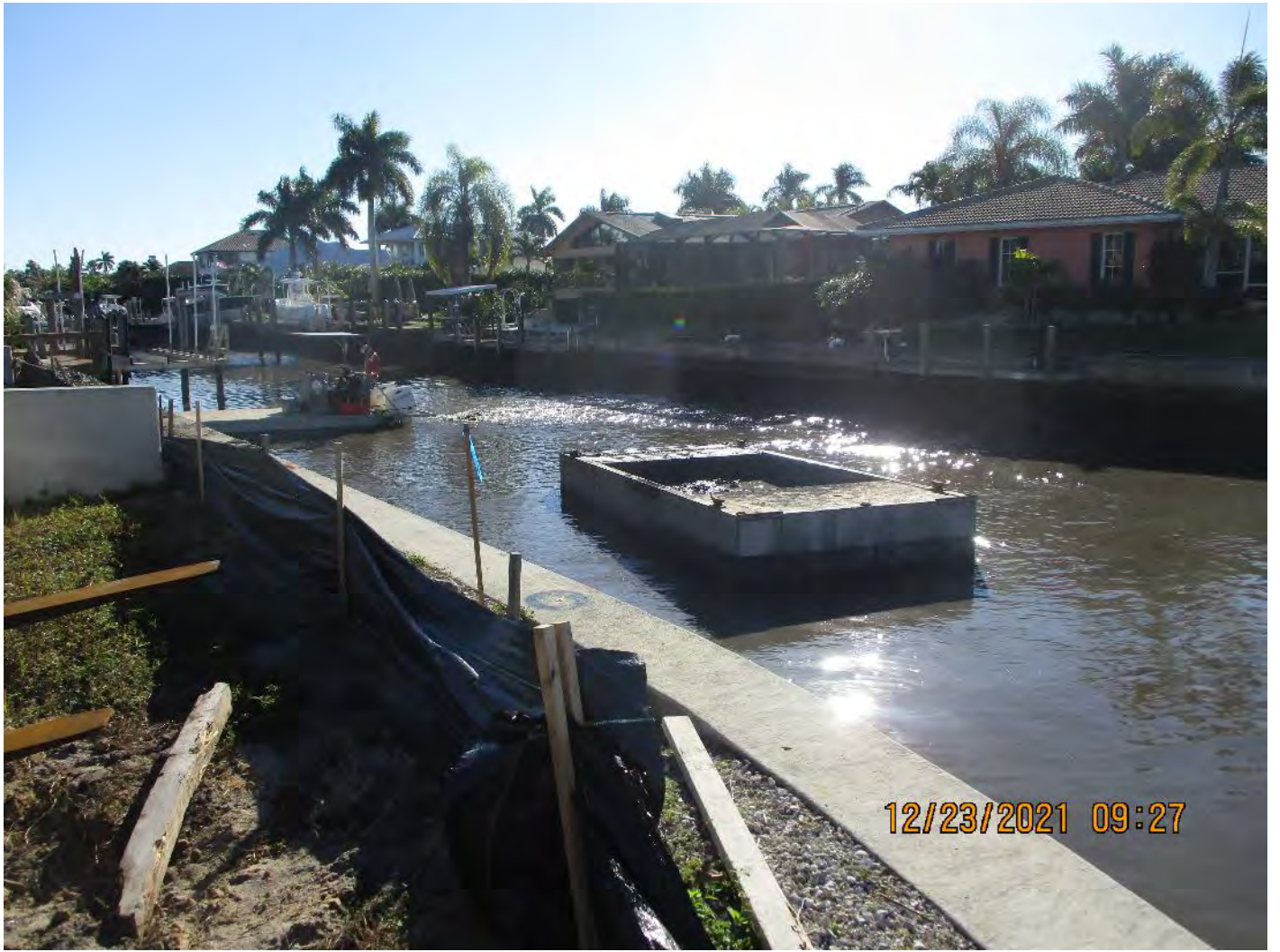
Full hopper of removed material at station 1+50