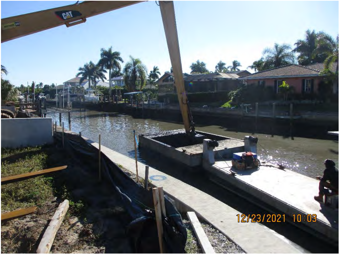
326 excavator transferring material from hopper to dewatering site at 1300 Curlew Avenue