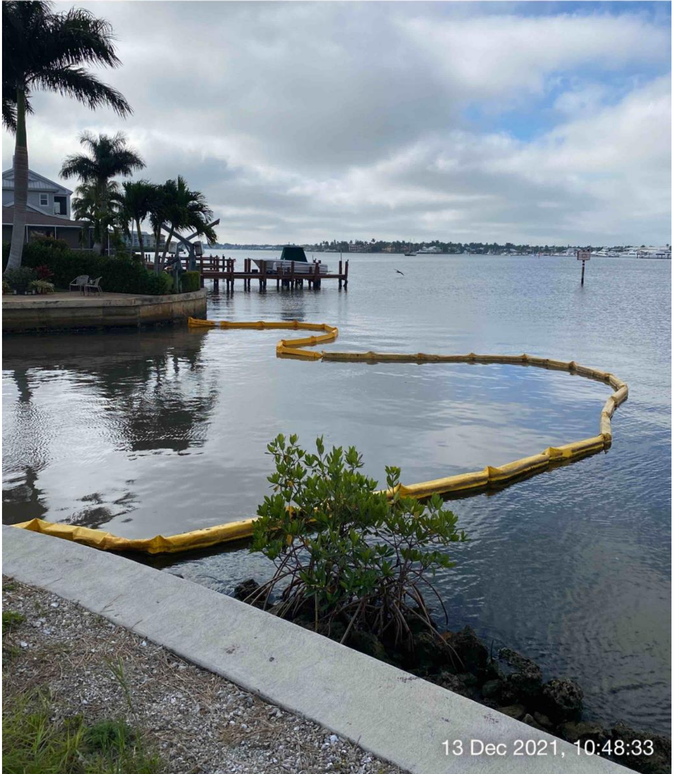
Turbidity curtain across the mouth of Canal CC-CC

☉ 205°SW (T) ● 26°8'13"N, 81°47'16"W ±39ft ▲ 9ft