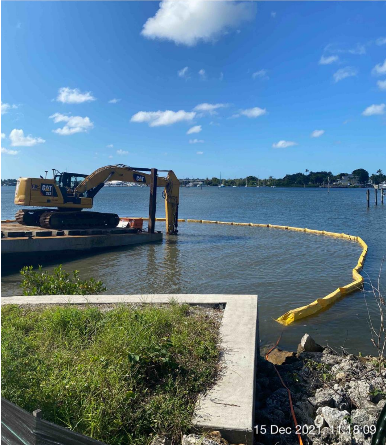
323 excavator grinding rock at station 0+50

☉ 236°SW (T) ☉ 26°8'13"N, 81°47'16"W ±22ft ▲ 8ft