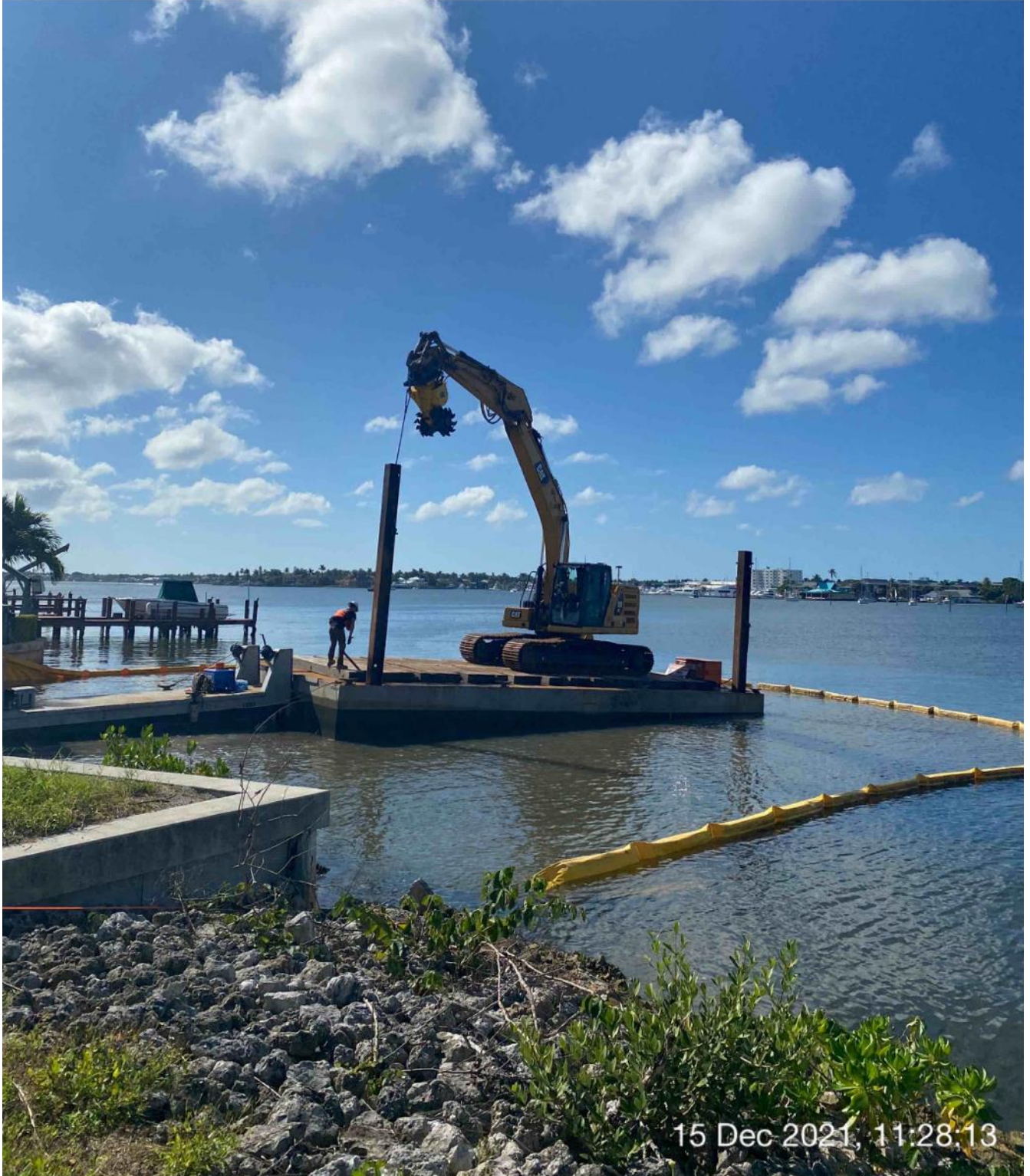
323 excavator lifting spud to allow push boat to move barge from station 1+00 to 0+50

S SW W 150 180 210 240 270 ☉ 213°SW (T) ☉ 26°8'13"N, 81°47'16"W ±13ft ▲ 7ft