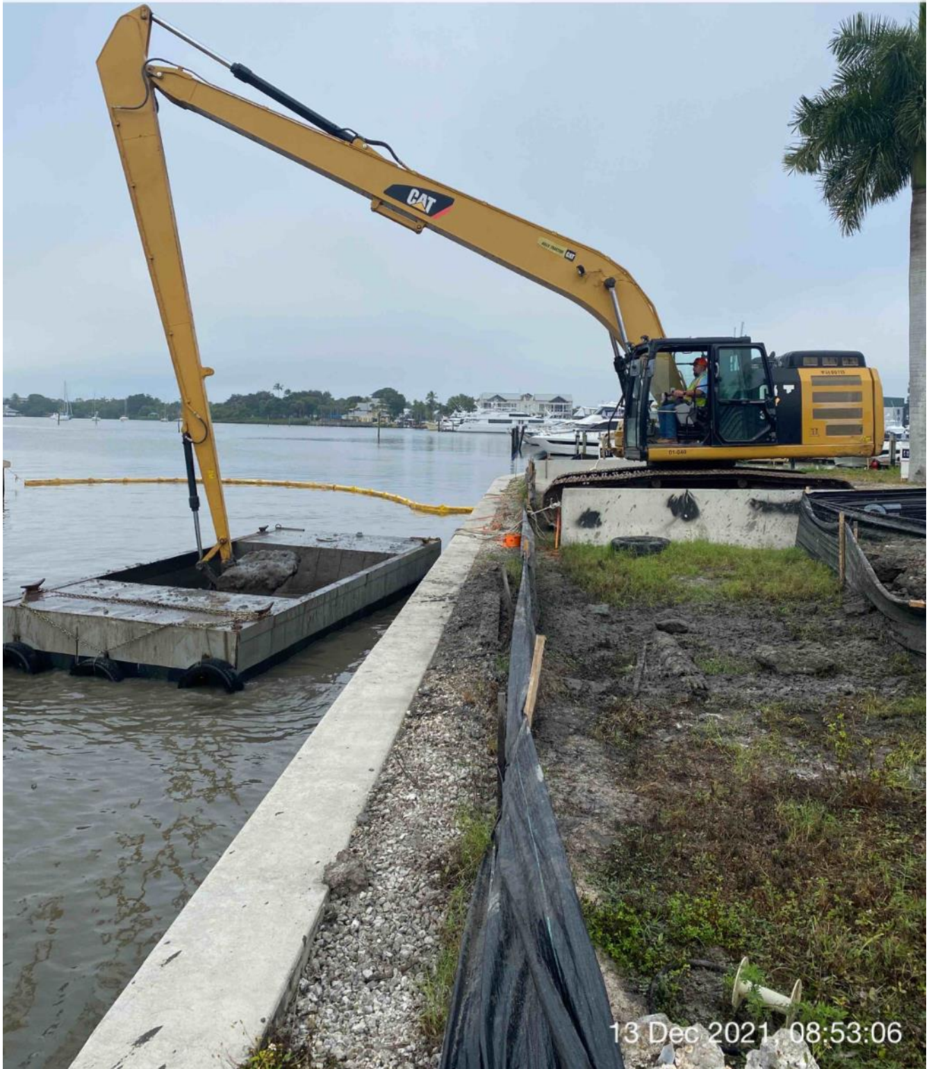
326 excavator transferring material from hopper to dewatering site at 1300 Curlew Avenue

SW W NW 210 240 270 300 330 ☉ 270°W (T) ☉ 26°8'13"N, 81°47'16"W ±118ft ▲ 8ft