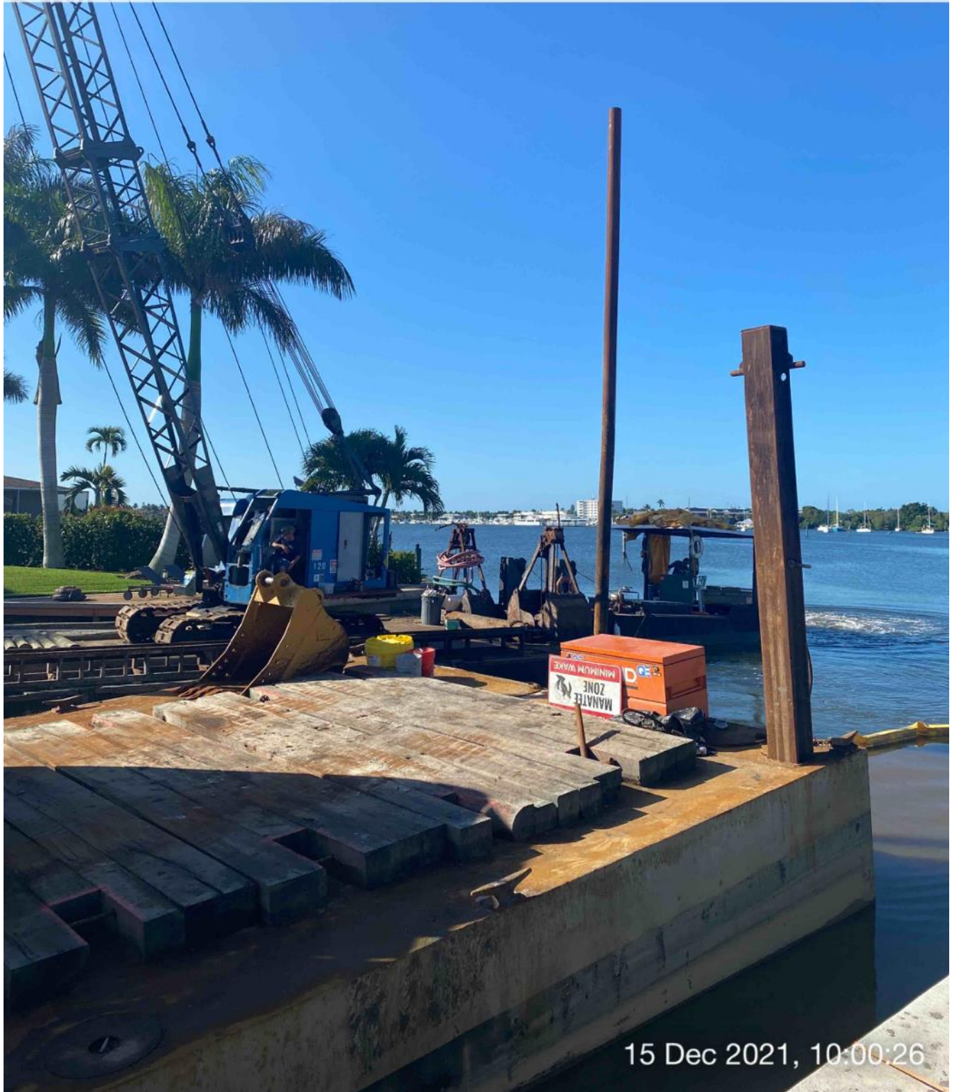
Collier Seawall and Dock passing by the barge exiting Canal CC-CC

☉ 228°SW (T) ● 26°8'13"N, 81°47'16"W ±13ft ▲ 12ft