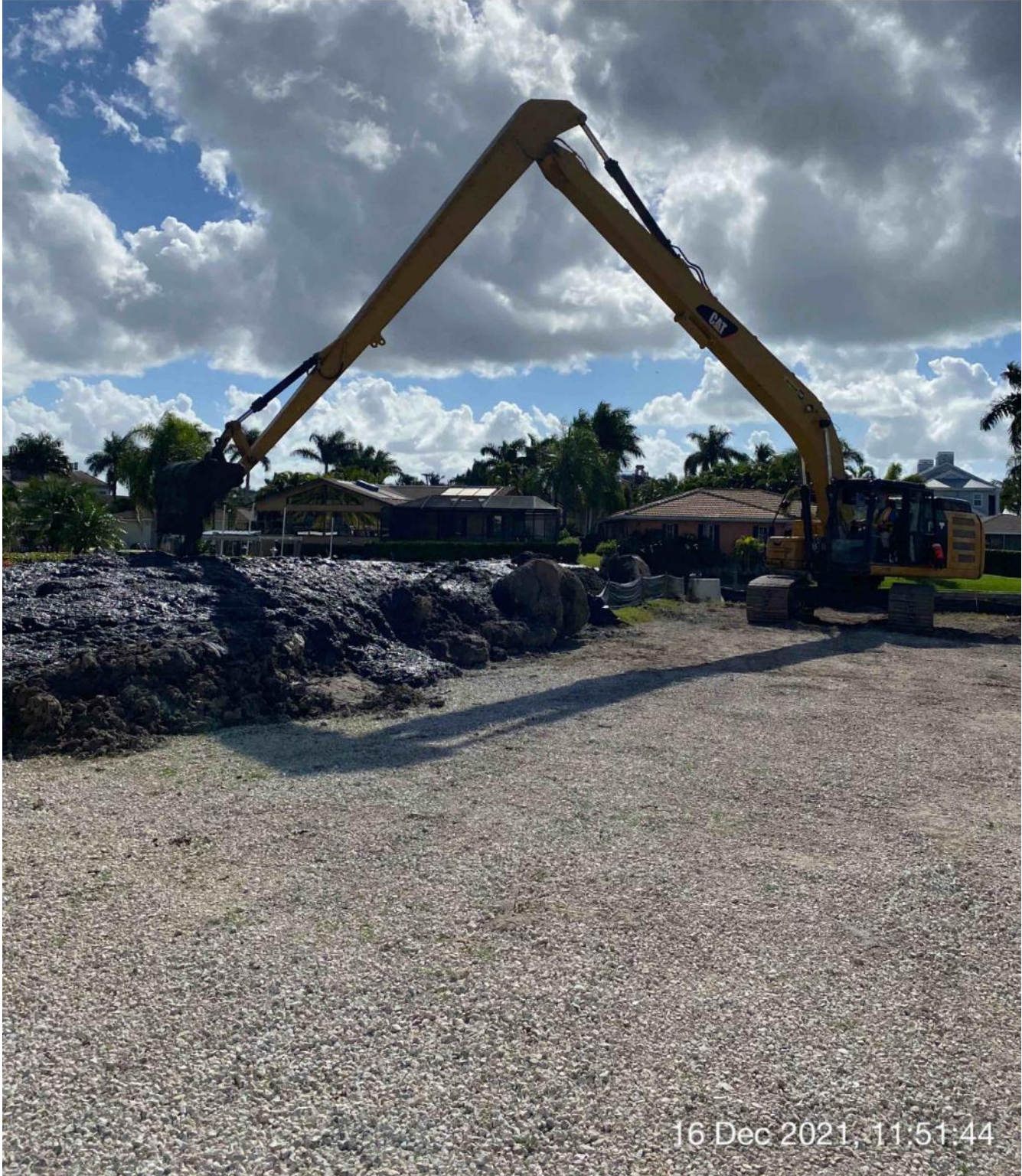
326 excavator transferring material from hopper to dewatering site at 1300 Curlew Avenue

☀ 164°S (T) ● 26°8'14"N, 81°47'16"W ±13ft ▲ 8ft