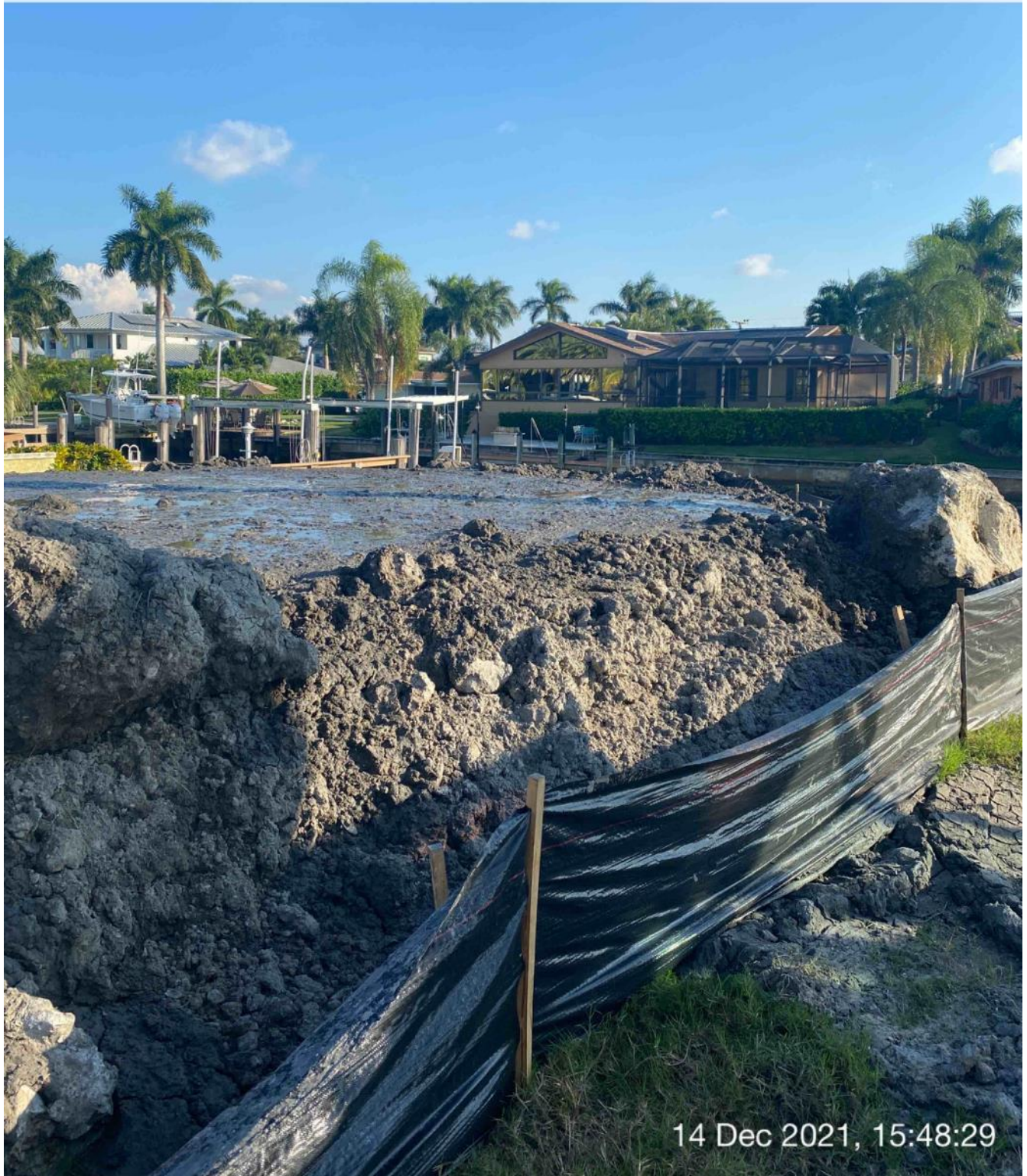
Removed material at dewatering site at 1300 Curlew Avenue

☉ 144°SE (T) ● 26°8'13"N, 81°47'15"W ±13ft ▲ 10ft