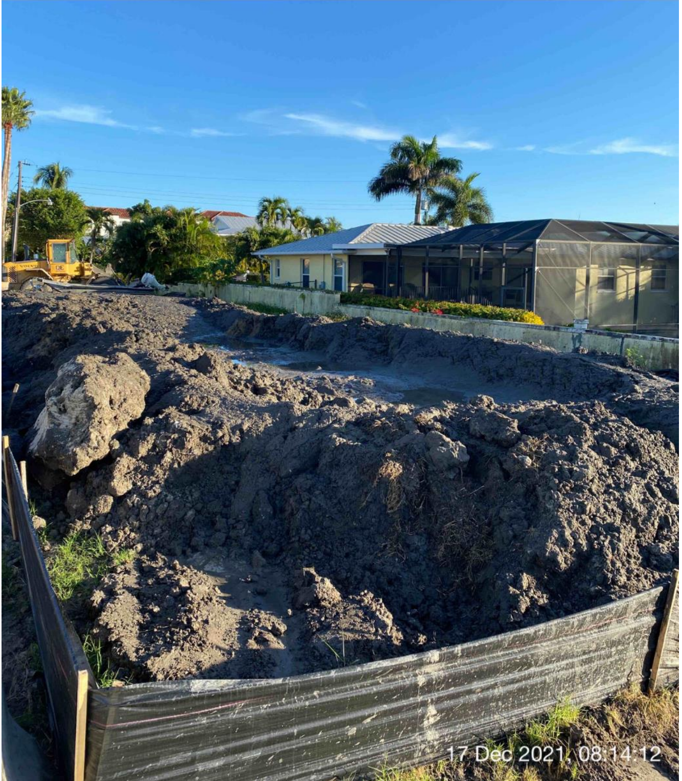
Removed material at the dewatering site at 1300 Curlew Avenue