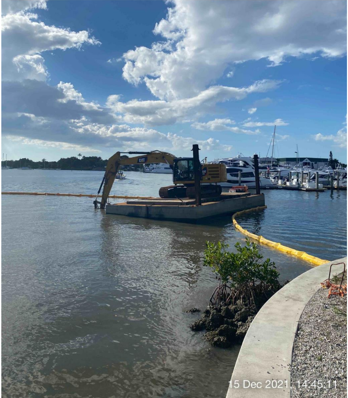
323 excavator grinding rock at station 0+50

SW W NW 210 240 270 300 330 ☉ 271°W (T) ☉ 26°8'13"N, 81°47'16"W ±13ft ▲ 8ft