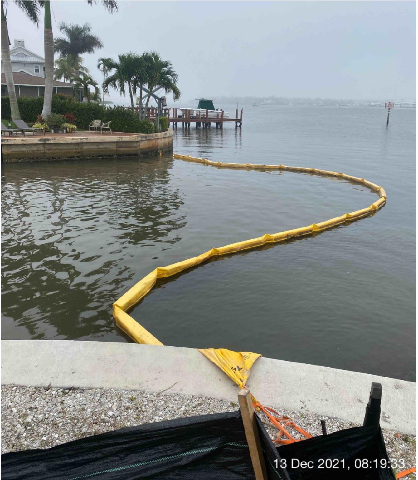
Turbidity Curtain across the mouth of Canal CC-CC

☉ 208°SW (T) ☉ 26°8'13"N, 81°47'16"W ±26ft ▲ 8ft