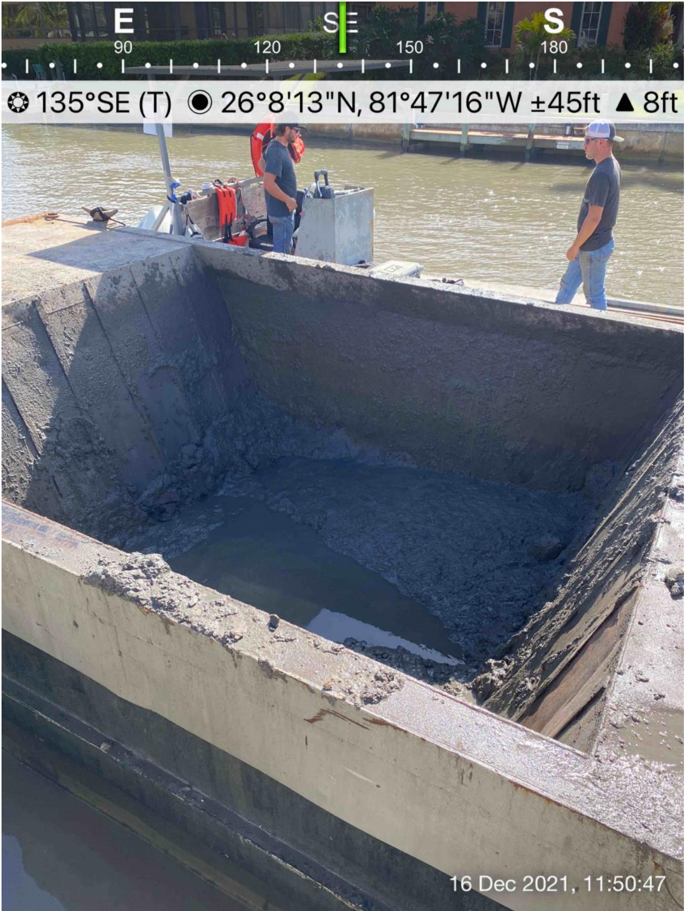
Hopper after 326 excavator has removed most of the material