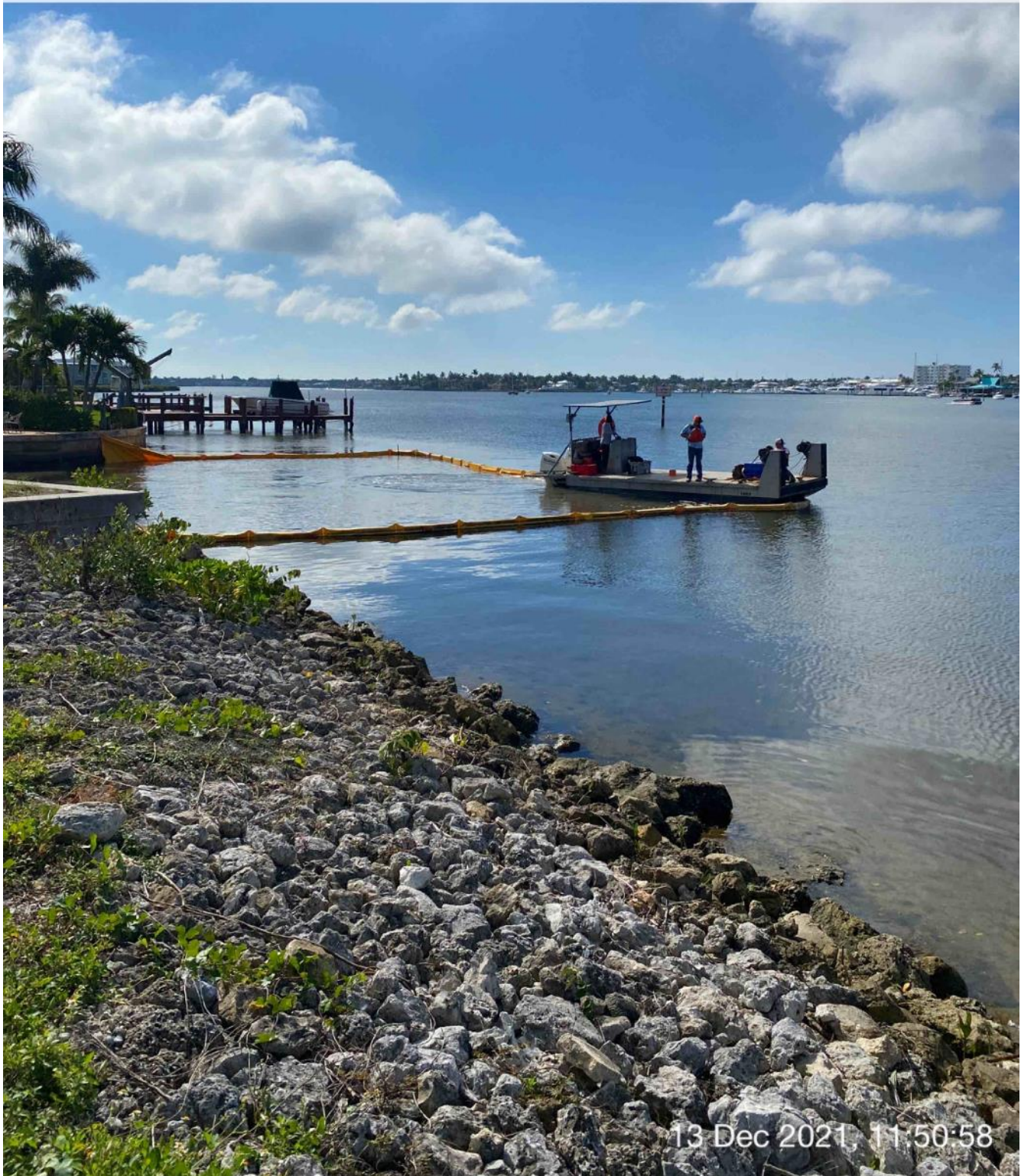
Turbidity curtain across the mouth of Canal CC-CC extended to station 0+50

E S SW W 150 180 210 240 270 ☉ 206°SW (T) ☉ 26°8'14"N, 81°47'16"W ±22ft ▲ 8ft