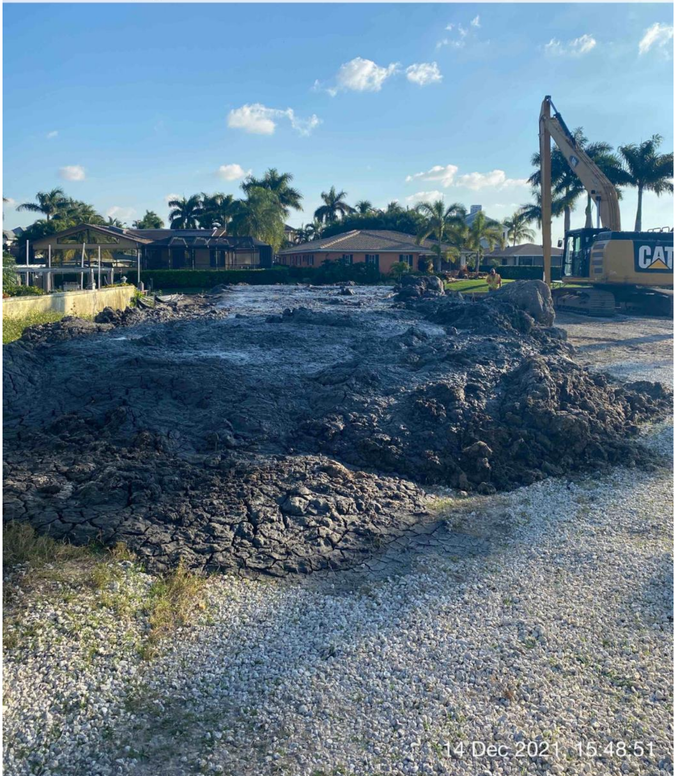
Removed material at dewatering site at 1300 Curlew Avenue

SE S SW 120 150 180 210 240 ☀ 179°S (T) ☉ 26°8'14"N, 81°47'15"W ±13ft ▲ 9ft