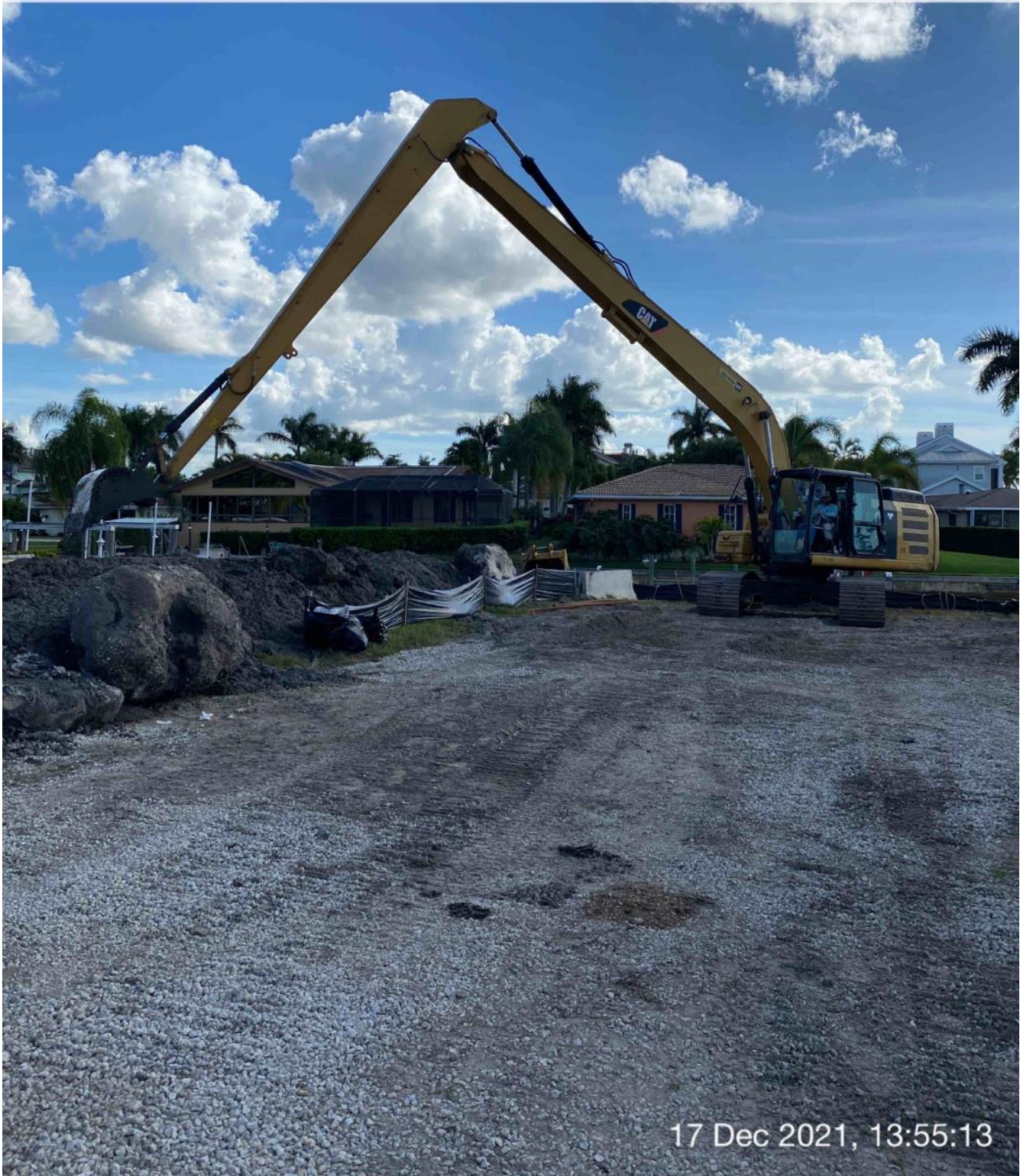
326 excavator transferring material from hopper to dewatering site at 1300 Curlew Avenue

☀ 179°S (T) ☉ 26°8'14"N, 81°47'16"W ±26ft ▲ 9ft