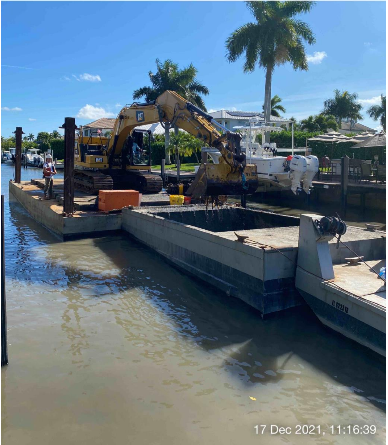
323 excavator removing material from station 3+50 and transferring it to hopper

E SE S 60 90 120 150 180 ☀ 122°SE (T) ☉ 26°8'13"N, 81°47'14"W ±22ft ▲ 8ft