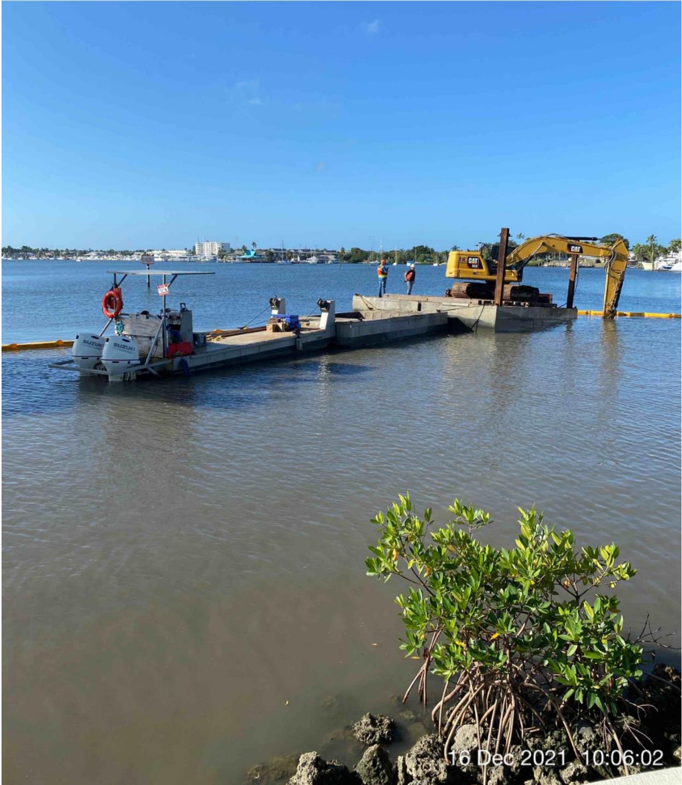
323 excavator removing material from station 0+00 and transferring it to hopper

S 180 SW 210 40 W 270 300 ☉ 238°SW (T) ☉ 26°8'13"N, 81°47'16"W ±36ft ▲ 9ft