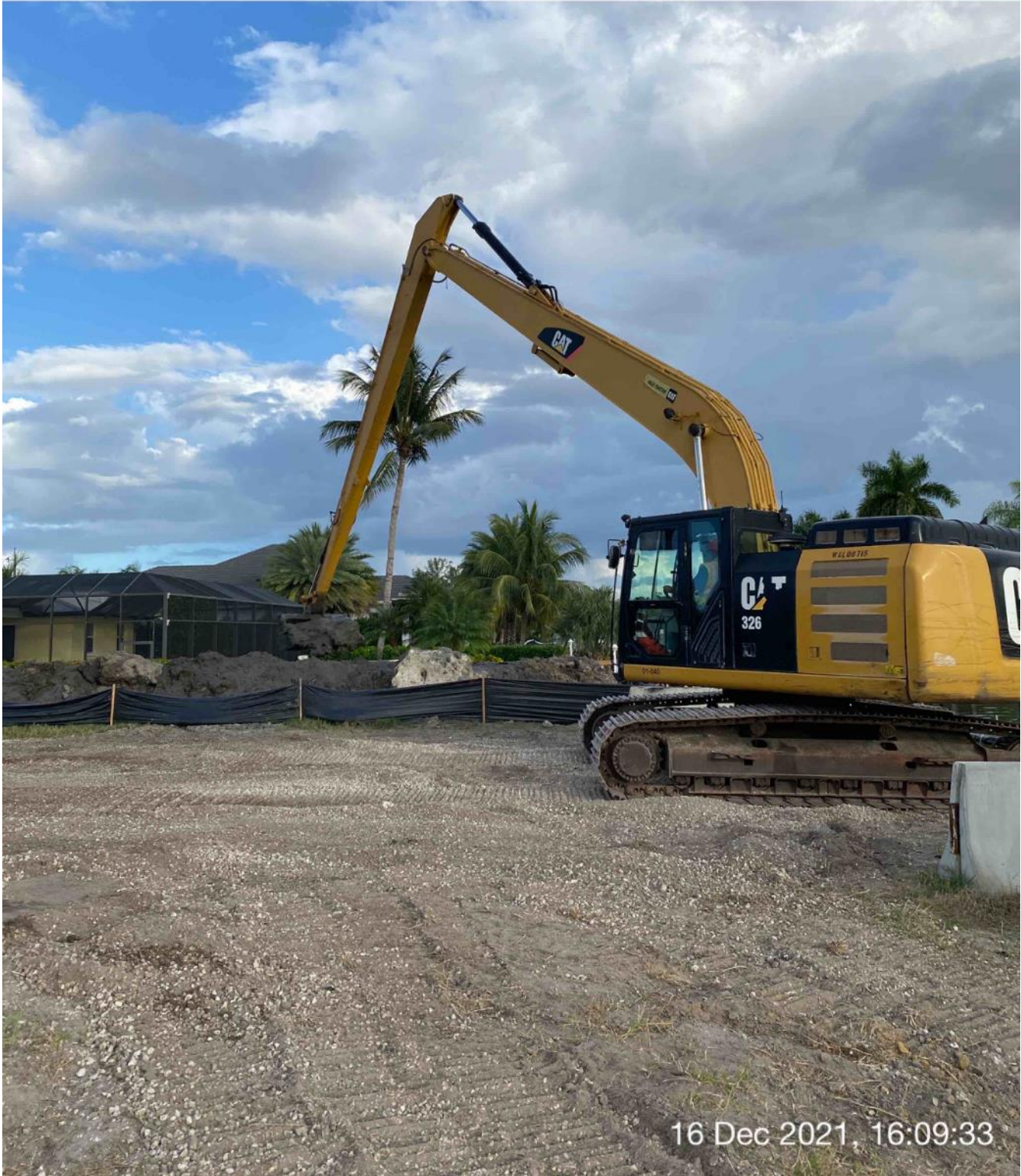
326 excavator transferring material from hopper to dewatering site at 1300 Curlew Avenue

☀ 92°E (T) ☉ 26°8'13"N, 81°47'16"W ±16ft ▲ 8ft