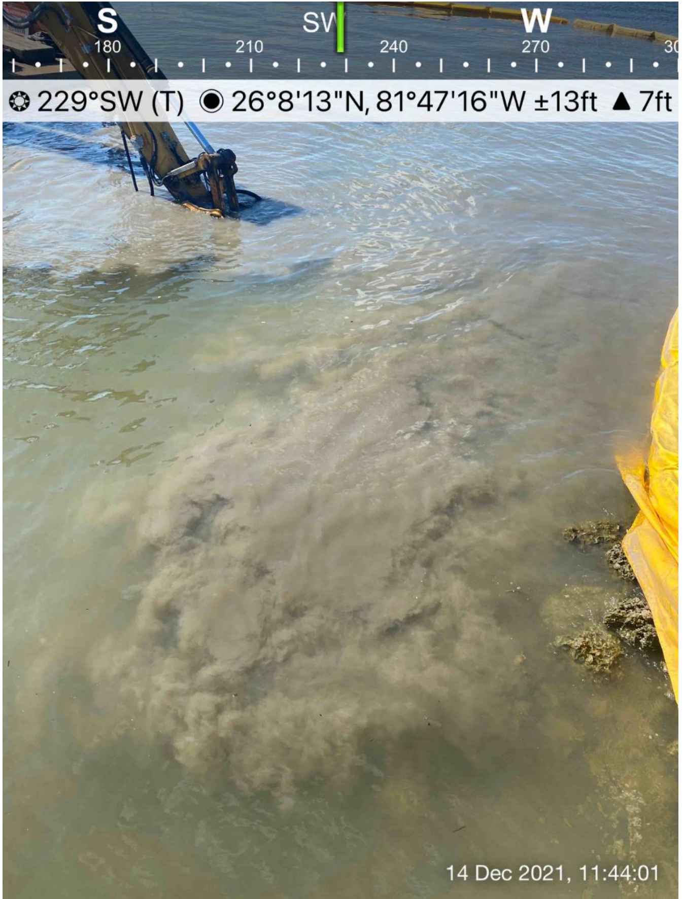
323 excavator grinding rock at station 1+50