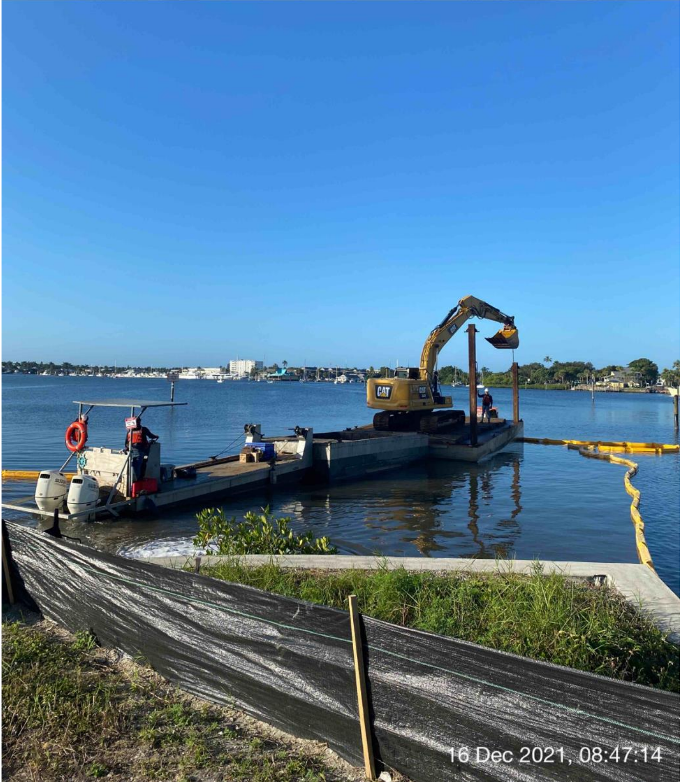
323 excavator lifting spud to allow push boat to move barge at station 0+00