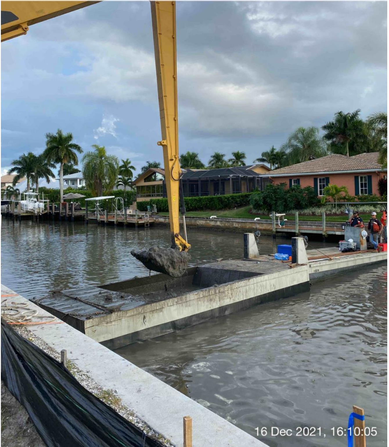
326 excavator transferring material from hopper to dewatering site at 1300 Curlew Avenue

E SE S 60 90 120 150 180 ☉ 129°SE (T) ☉ 26°8'13"N, 81°47'16"W ±29ft ▲ 8ft