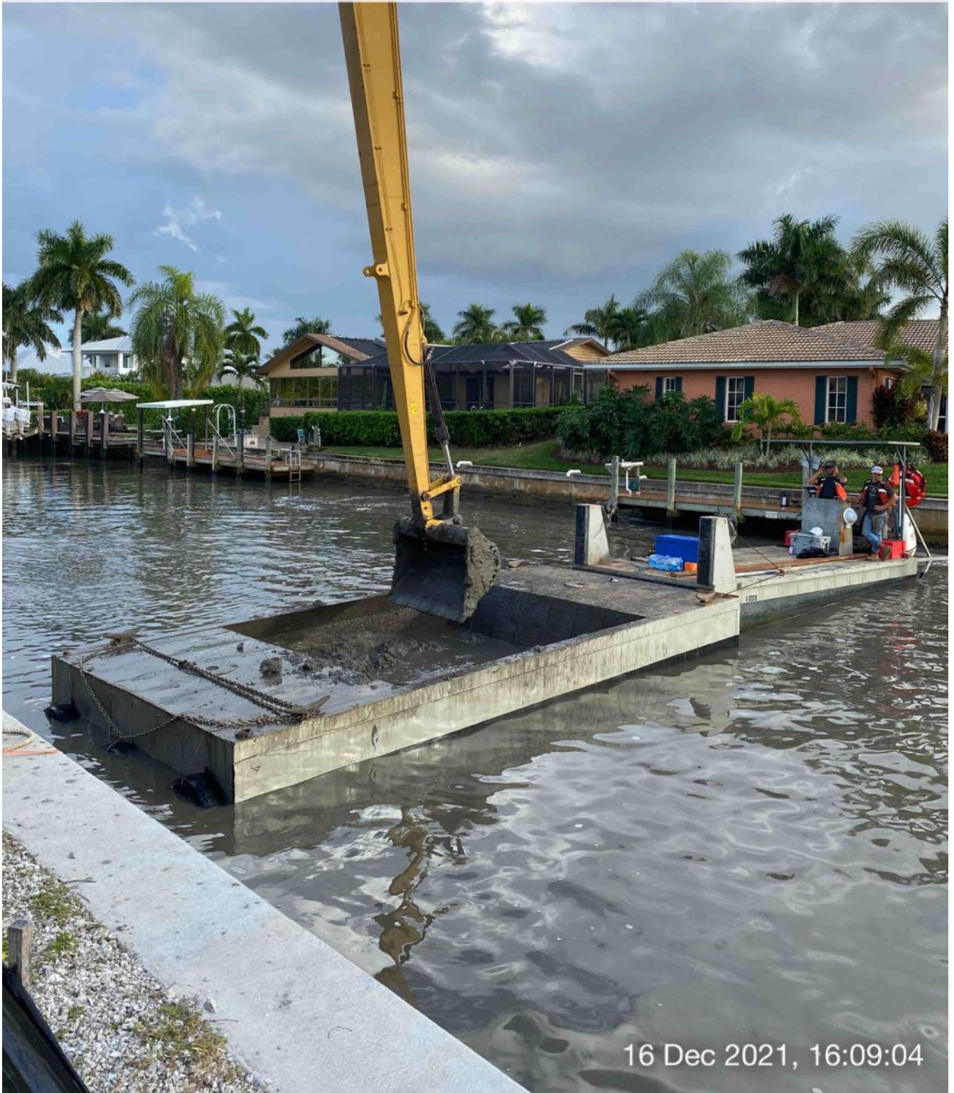
326 excavator transferring material from hopper to dewatering site at 1300 Curlew Avenue

E 90 SE 120 150 S 180 ☀ 133°SE (T) ☉ 26°8'13"N, 81°47'16"W ±19ft ▲ 8ft