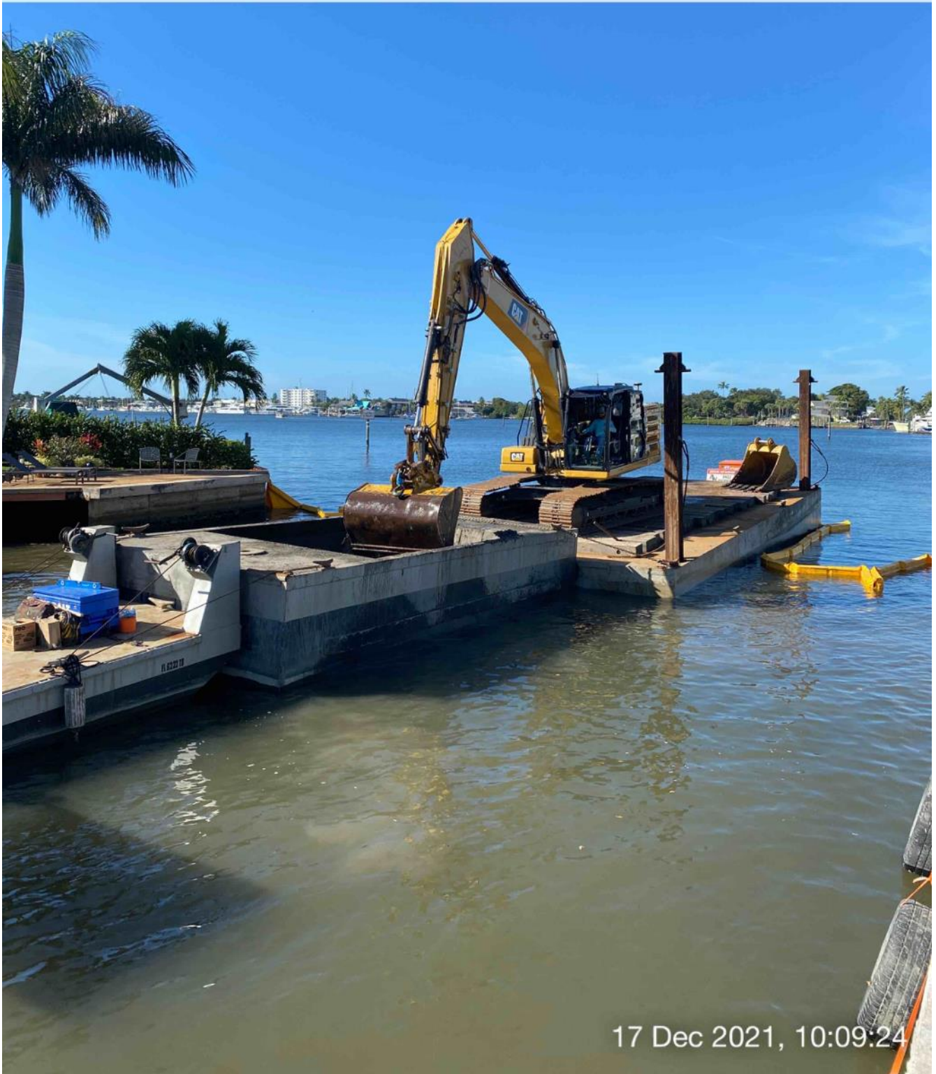
323 excavator removing material from station 1+00 and transferring it to hopper

☉ 226°SW (T) ☉ 26°8'13"N, 81°47'16"W ±13ft ▲ 9ft