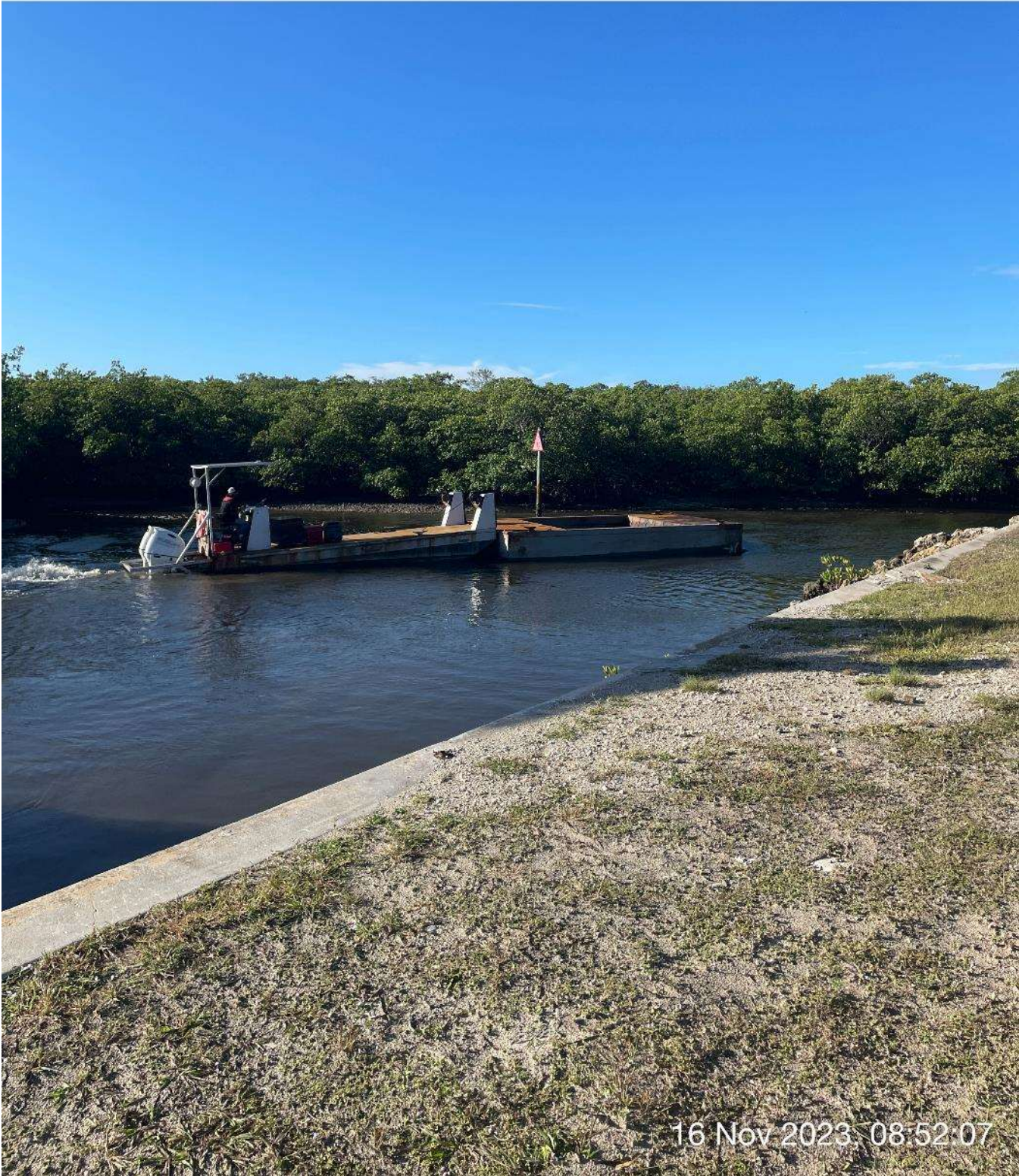
Push boat taking hopper to staging area.

☉ 212°SW (T) ☉ 26°7'20"N, 81°46'58"W ±13ft ▲ 12ft