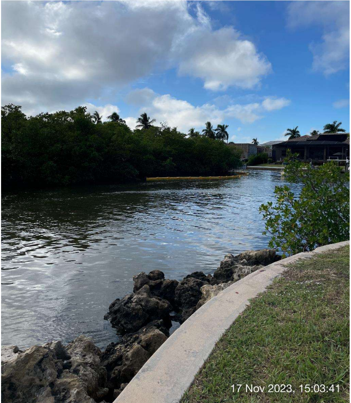
Turbidity curtain staged in Canal Main B1.

SW W NW 210 240 270 300 330 ☉ 266°W (T) ☉ 26°7'19"N, 81°46'59"W ±13ft ▲ 10ft