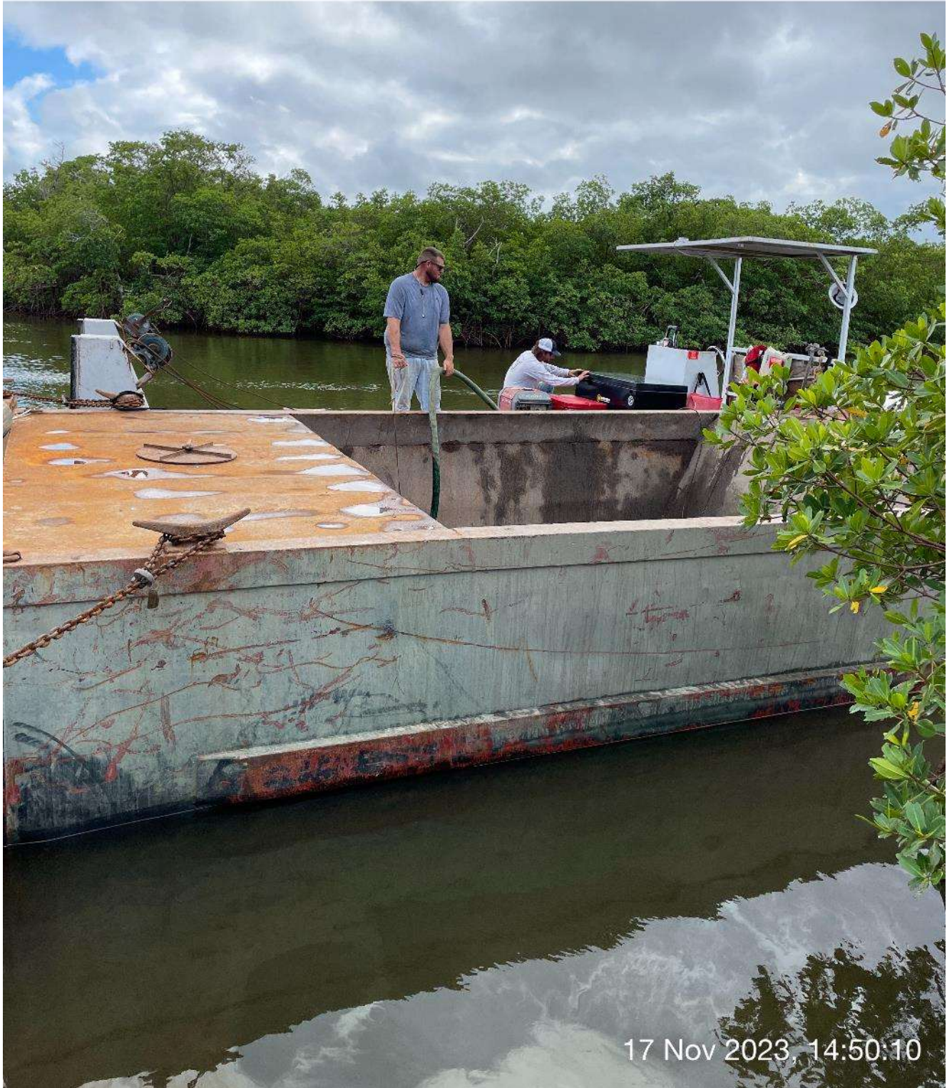
Contractor pumping water out of hopper.

☀ 184°S (T) ☉ 26°7'20"N, 81°46'57"W ±19ft ▲ 9ft