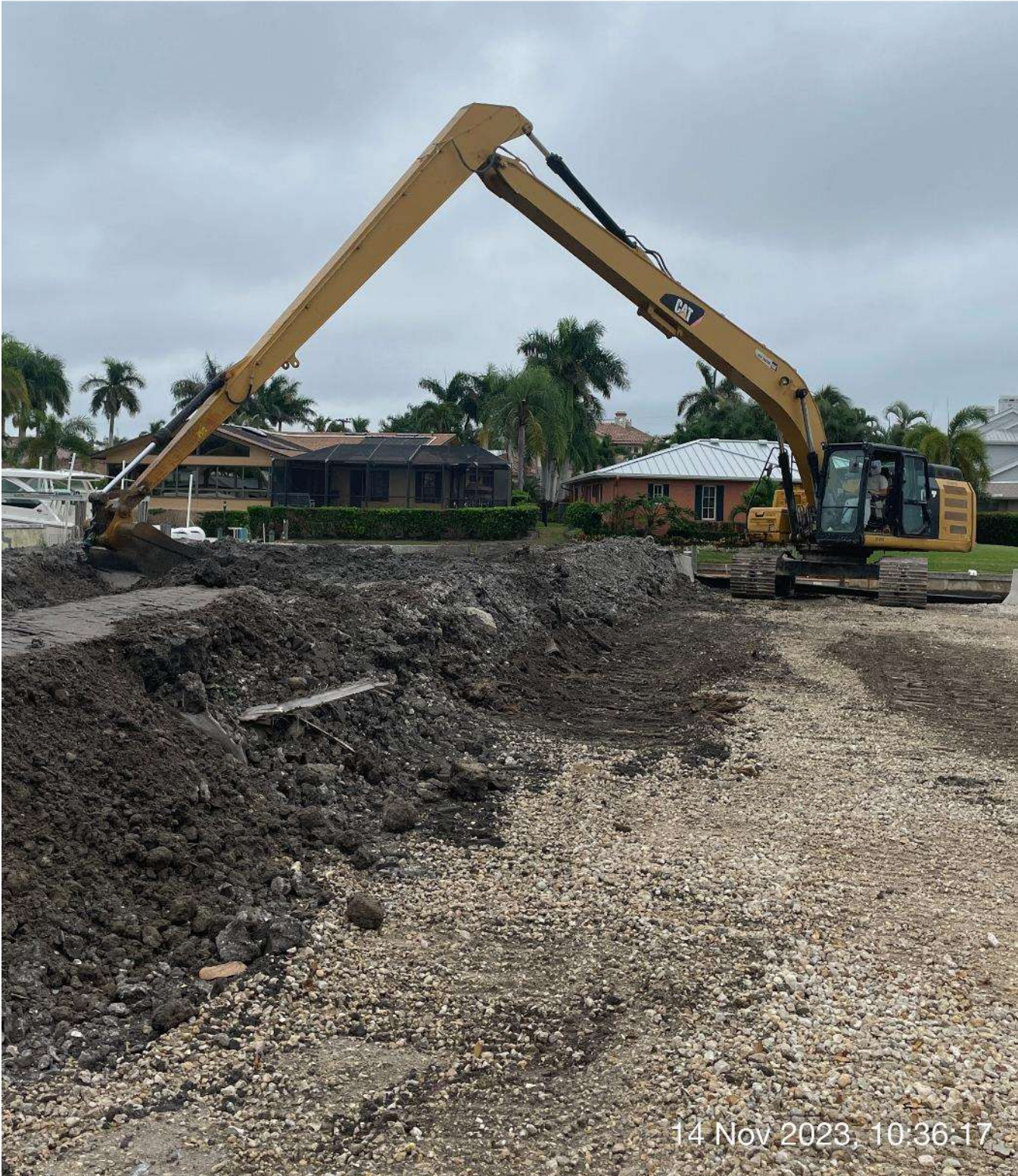
Long reach excavator spreading sediment onto staging area.

☉ 164°S (T) ● 26°8'14"N, 81°47'16"W ±13ft ▲ 9ft