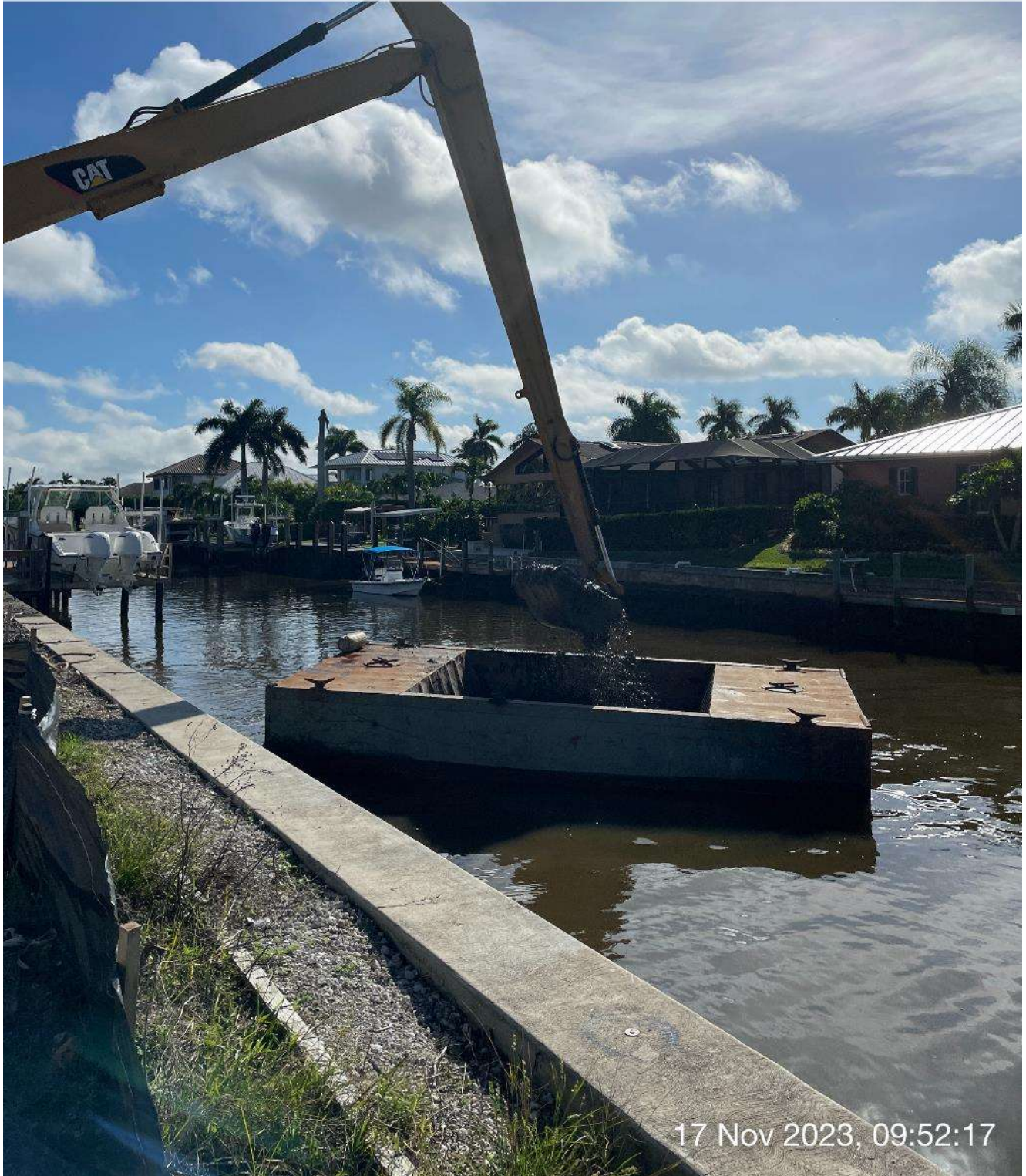
Long reach excavator removing sediment from hopper.

E SE S 60 90 120 150 180 122°SE (T) 26°8'13"N, 81°47'16"W ±13ft ▲ 17ft