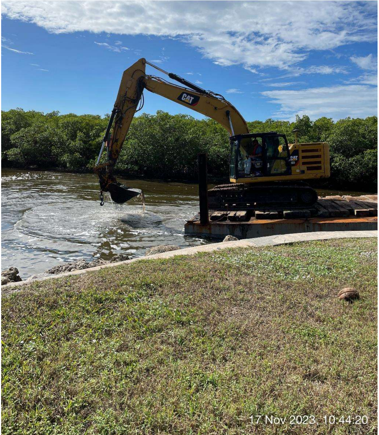
323 excavator removing sediment at station 2+00 in Canal Main B1.

☉ 194°S (T) ☉ 26°7'20"N, 81°46'58"W ±13ft ▲ 21ft