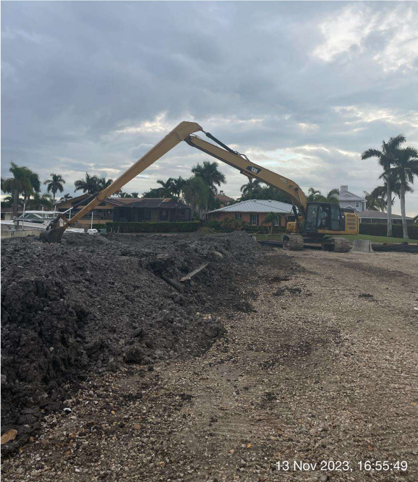
Long reach excavator spreading sediment onto staging area.

☉ 165°S (T) ● 26°8'14"N, 81°47'16"W ±13ft ▲ 9ft