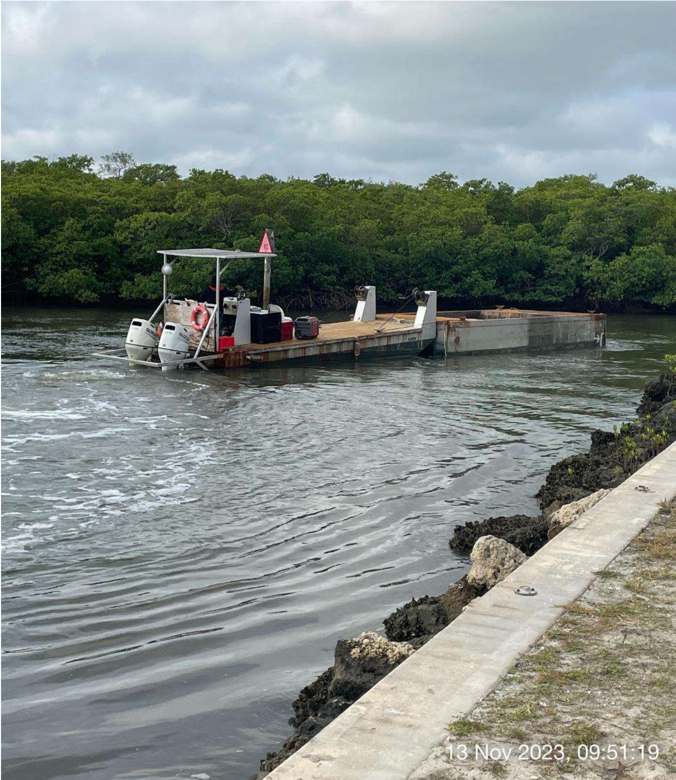
Push boat taking hopper to staging area.

☀ 227°SW (T) ☉ 26°7'20"N, 81°46'57"W ±13ft ▲ 18ft