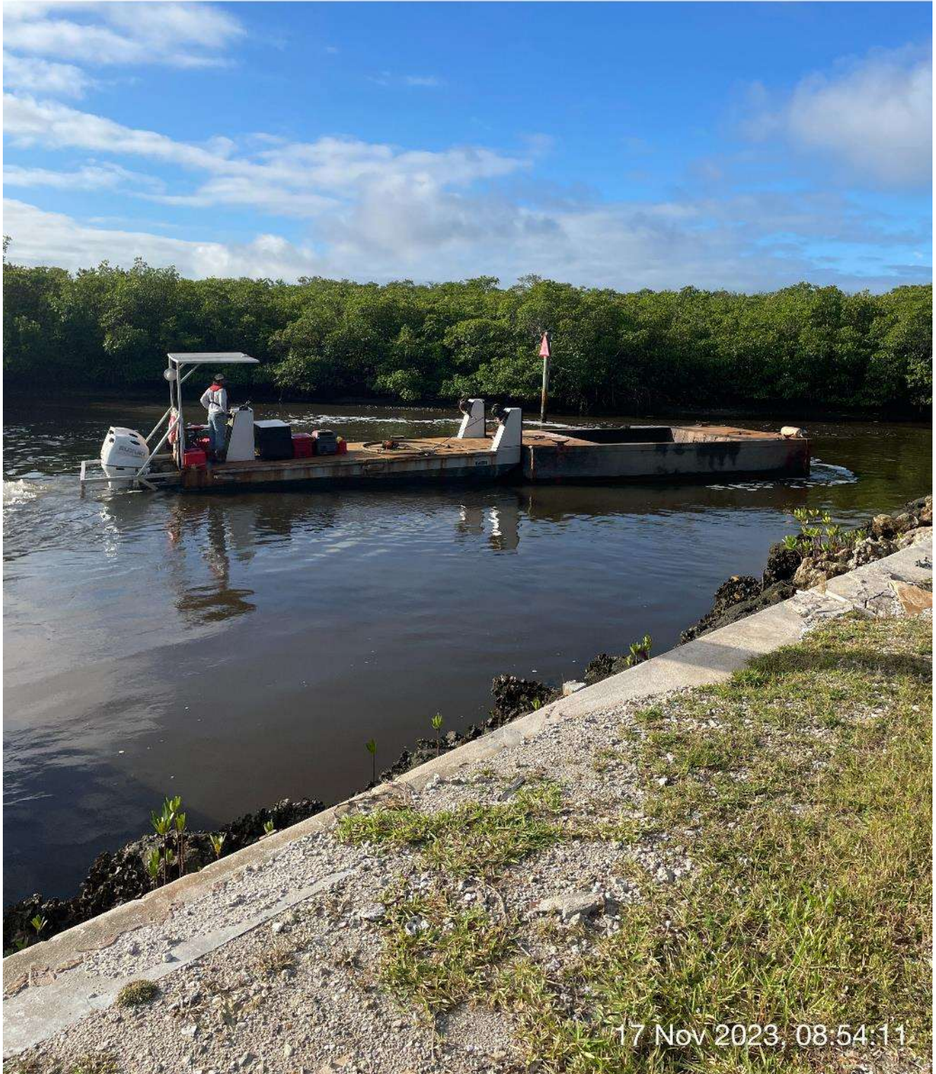
Push boat taking hopper to staging area.

☀ 206°SW (T) ● 26°7'20"N, 81°46'58"W ±13ft ▲ 16ft