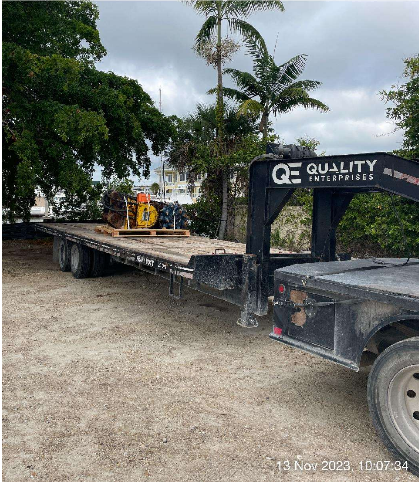
Epiroc grinder arriving on site.

W NW N 240 270 300 330 0 ☀ 303°NW (T) ☉ 26°8'14"N, 81°47'15"W ±13ft ▲ 21ft