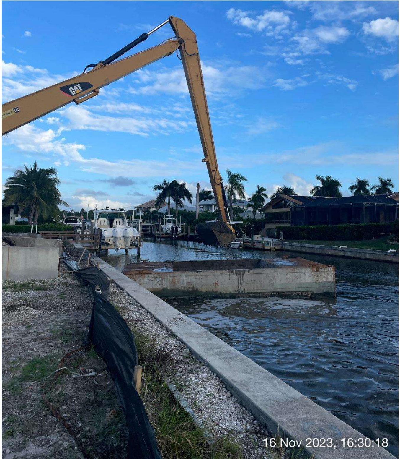
Long reach excavator removing sediment from hopper.

NE 60 E 90 120 SE 150 S 180 ☀ 113°SE (T) ☉ 26°8'13"N, 81°47'16"W ±13ft ▲ 14ft