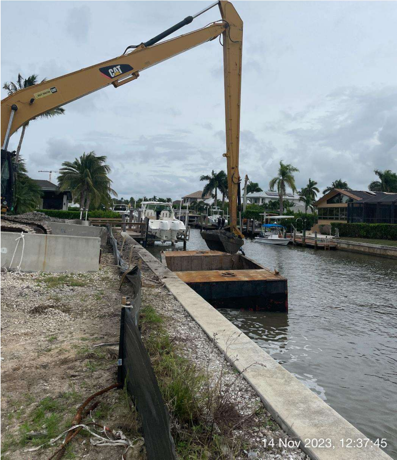
Long reach excavator removing sediment from hopper.

☀ 107°E (T) ● 26°8'13"N, 81°47'16"W ±13ft ▲ 37ft