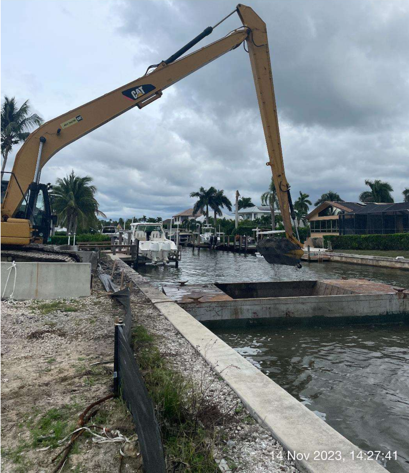
Long reach excavator removing sediment from hopper.

☀ 110°E (T) ● 26°8'13"N, 81°47'16"W ±9ft ▲ -8ft