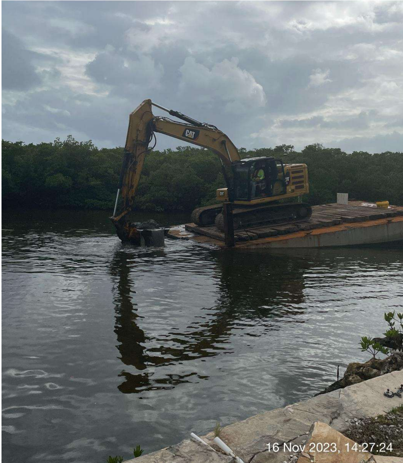
323 excavator removing sediment at station 2+00 in Canal Main B1.

☀ 207°SW (T) ● 26°7'20"N, 81°46'58"W ±13ft ▲ 9ft