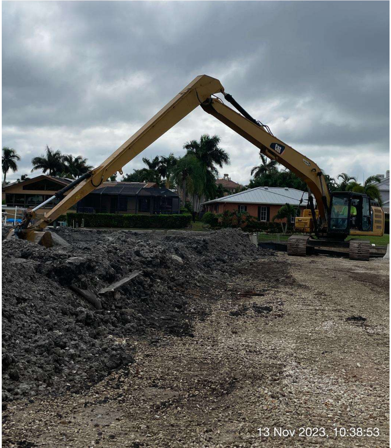
Long reach excavator spreading sediment onto staging area.

☀ 176°S (T) ☉ 26°8'14"N, 81°47'15"W ±13ft ▲ 11ft