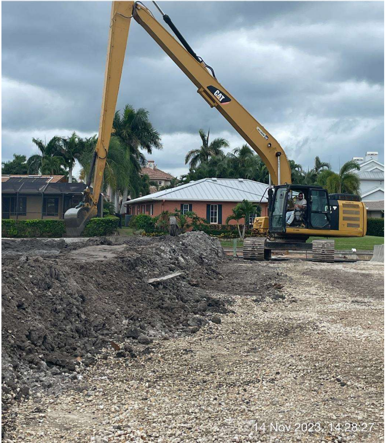
Long reach excavator spreading sediment onto staging area.

☉ 171°S (T) ☉ 26°8'14"N, 81°47'16"W ±13ft ▲ 11ft