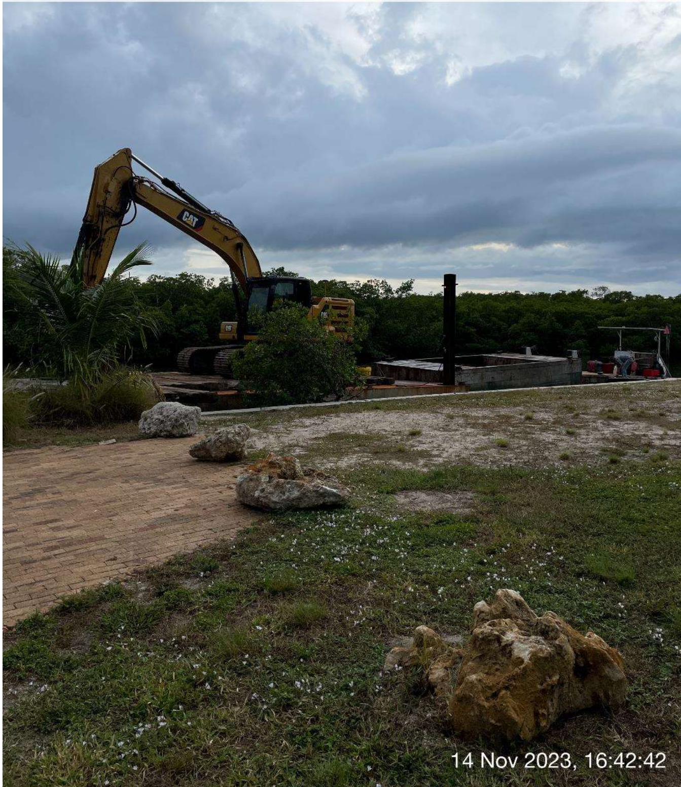
Equipment staged at station 4+00 in Canal Main B1.

☀ 200°S (T) ● 26°7'20"N, 81°46'57"W ±13ft ▲ 3ft