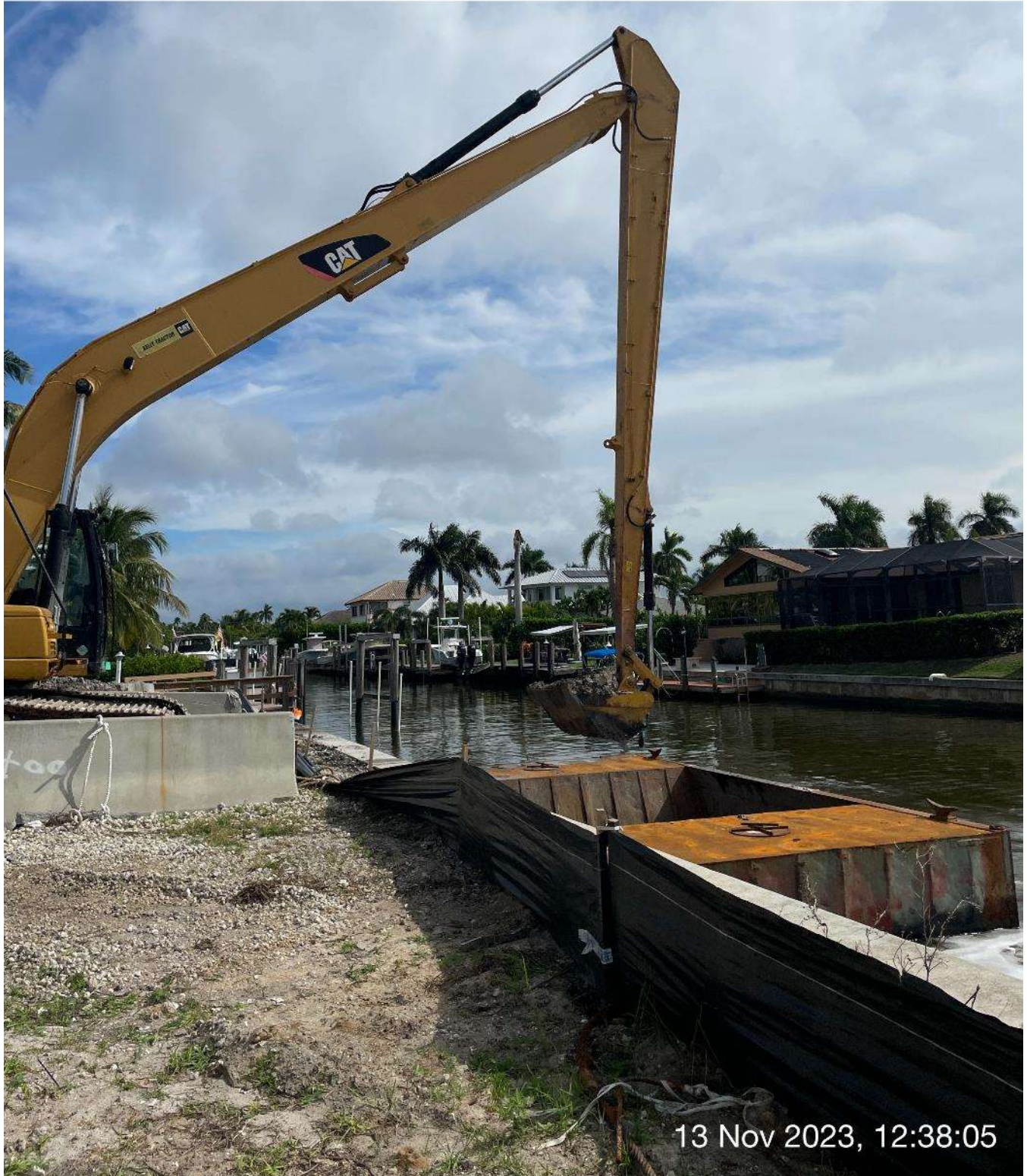
Long reach excavator removing sediment from hopper.

☉ 120°SE (T) ● 26°8'13"N, 81°47'16"W ±9ft ▲ 31ft