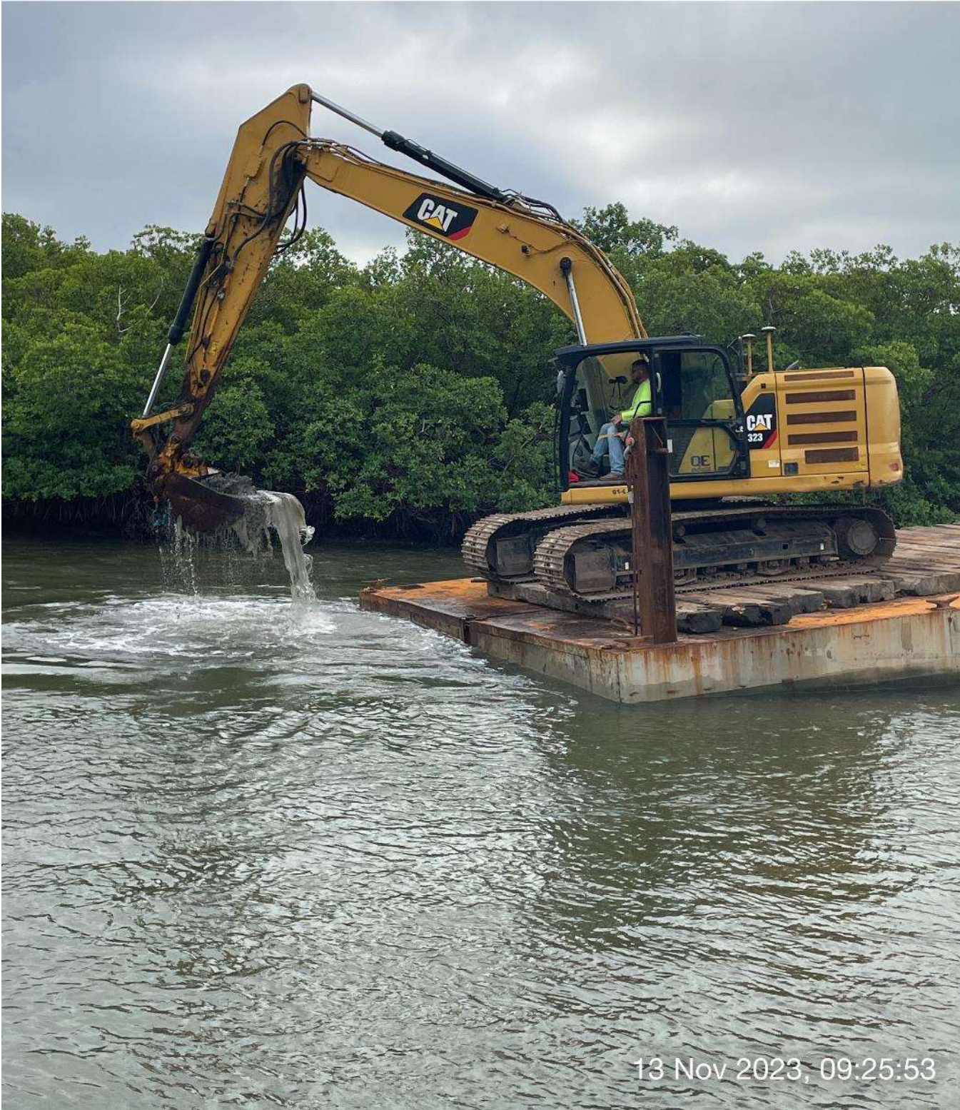
323 excavator removing sediment at station 3+00 in Canal Main B1.

☀ 142°SE (T) ● 26°7'20"N, 81°46'57"W ±13ft ▲ 9ft