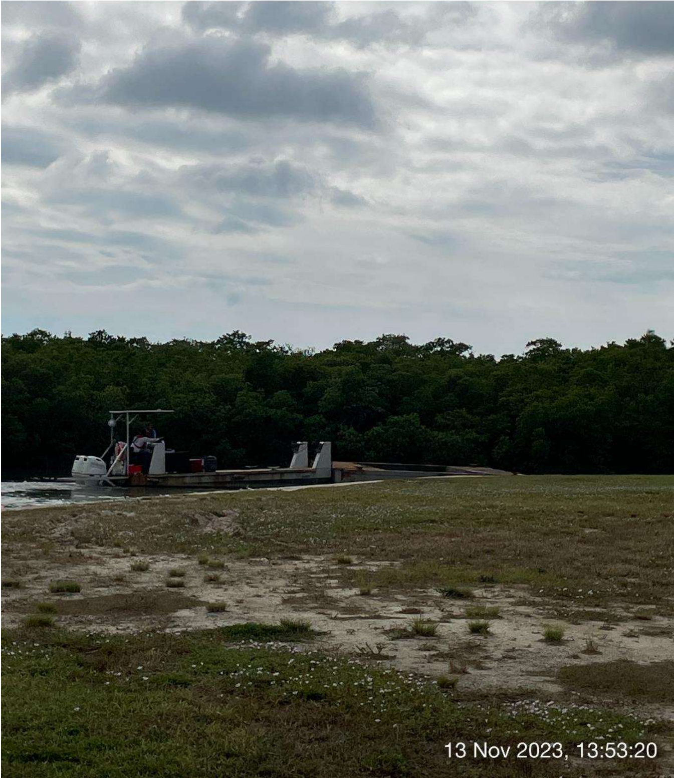
Push boat taking hopper to staging area.

☀ 229°SW (T) ● 26°7'20"N, 81°46'57"W ±9ft ▲ 12ft