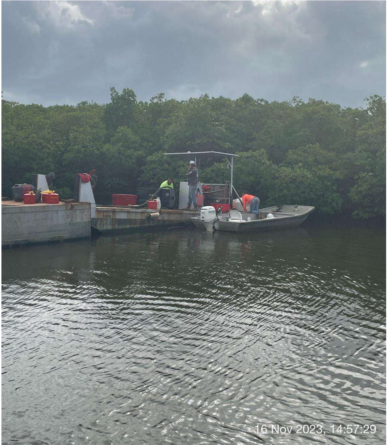
Contractor pumping water out of push boat.

☉ 232°SW (T) ☉ 26°7'19"N, 81°46'59"W ±13ft ▲ 21ft