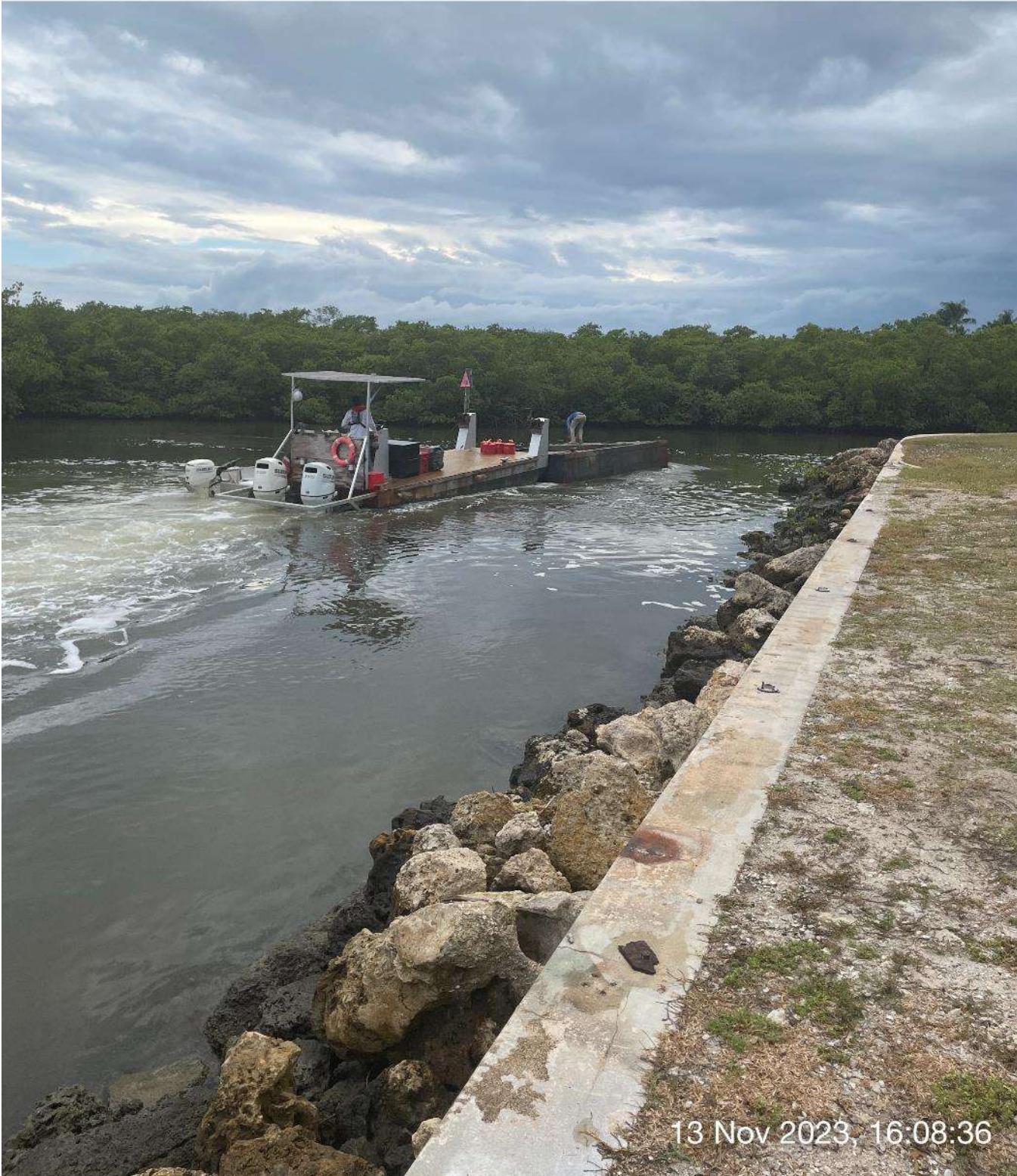
Push boat taking hopper to staging area.

☀ 225°SW (T) ● 26°7'20"N, 81°46'57"W ±13ft ▲ 6ft