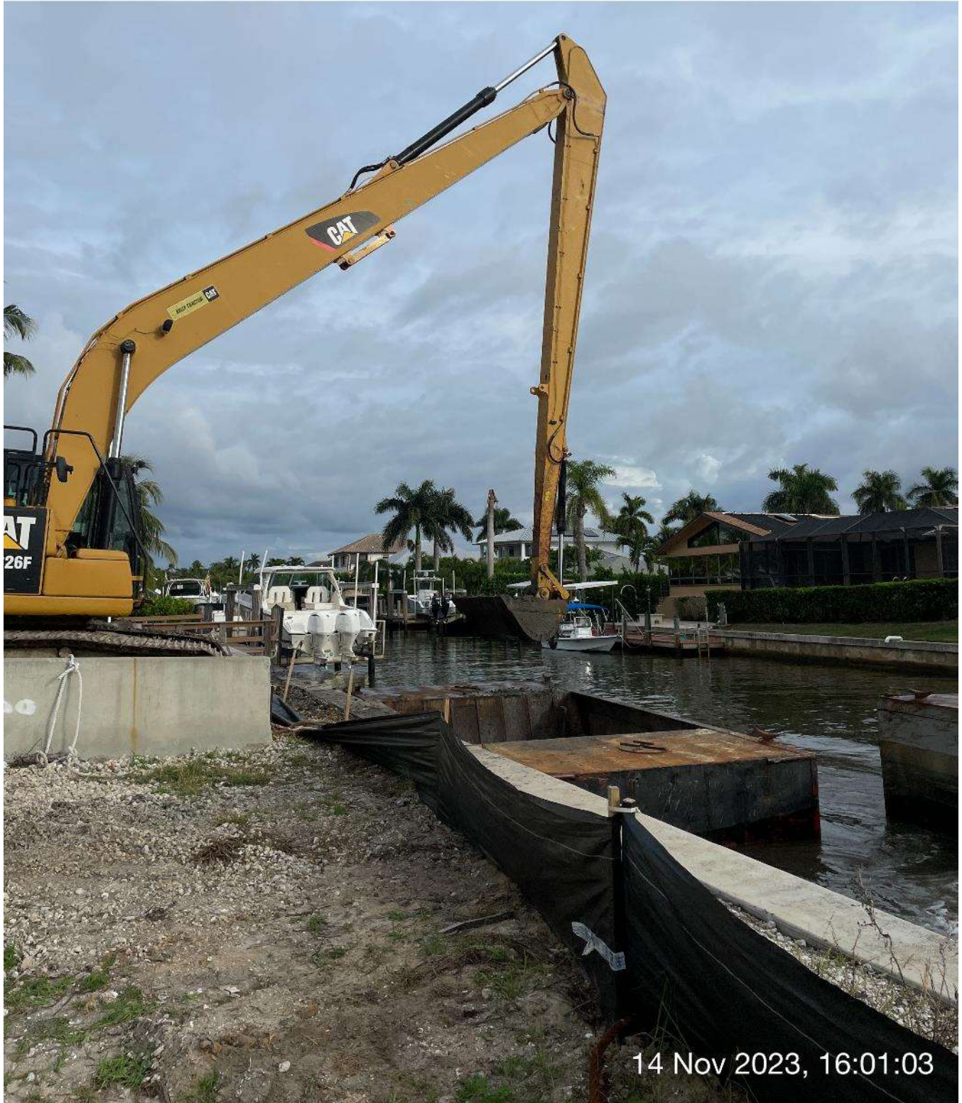
Long reach excavator removing sediment from hopper.

☉ 120°SE (T) ● 26°8'13"N, 81°47'16"W ±9ft ▲ 3ft