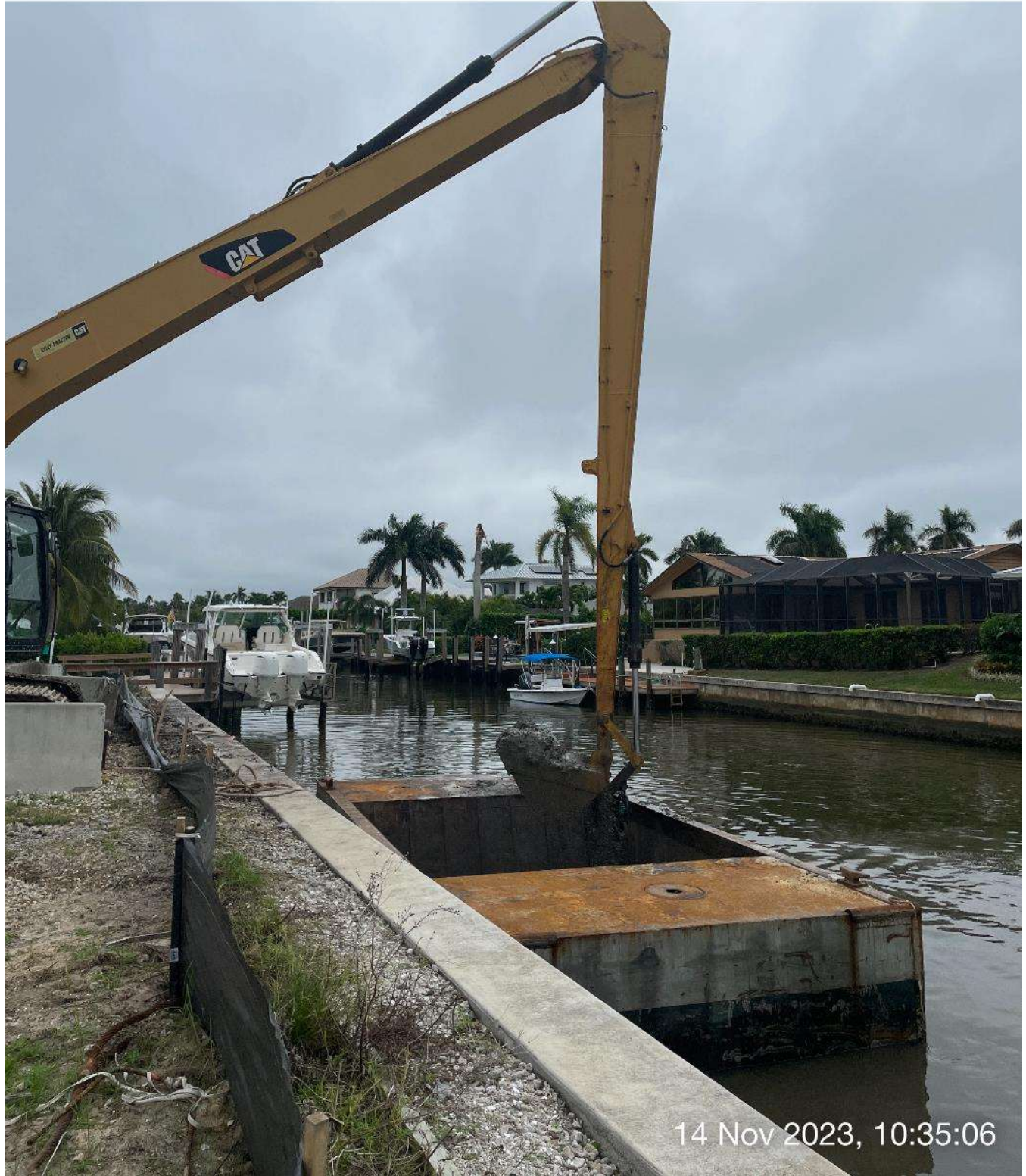
Long reach excavator removing sediment from hopper.

☀ 115°SE (T) ● 26°8'13"N, 81°47'16"W ±13ft ▲ 12ft