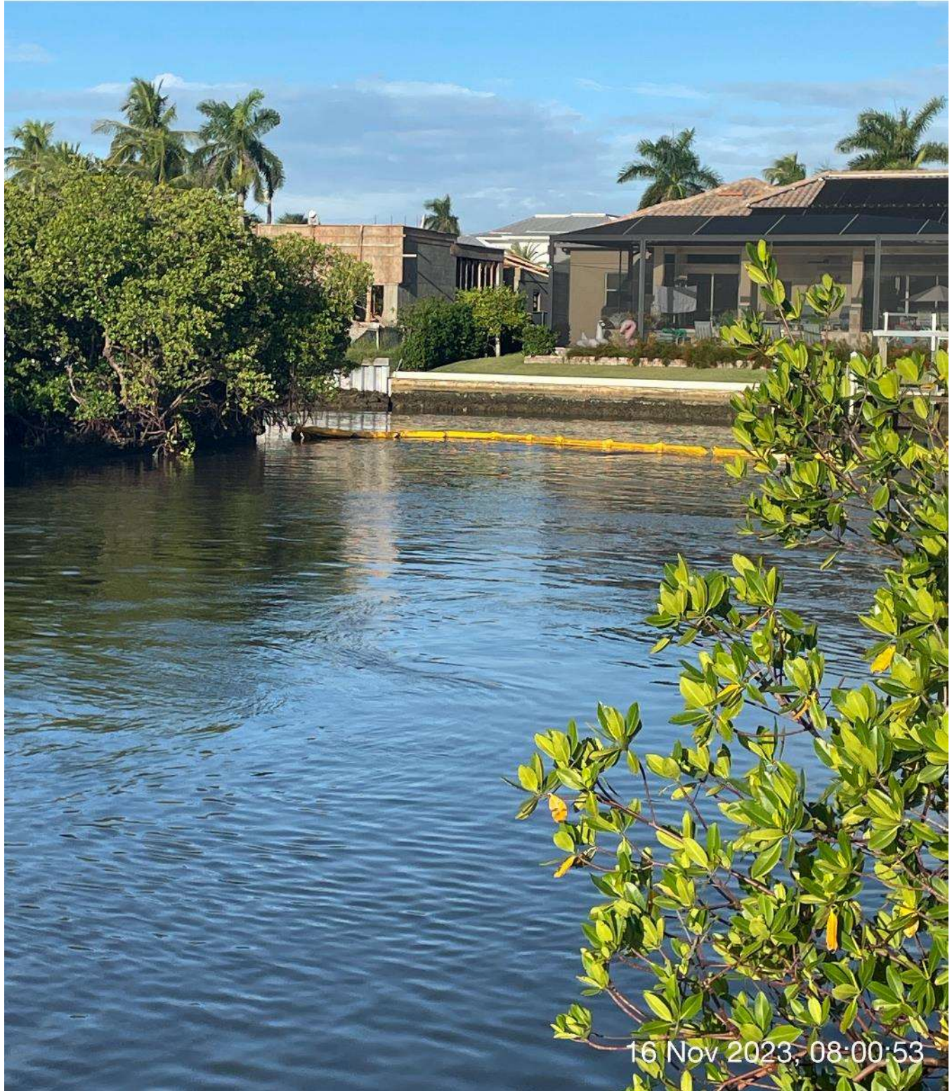
Turbidity curtain in place at station 8+50 in Canal Main B.

☀ 282°W (T) ● 26°7'19"N, 81°46'59"W ±13ft ▲ 14ft