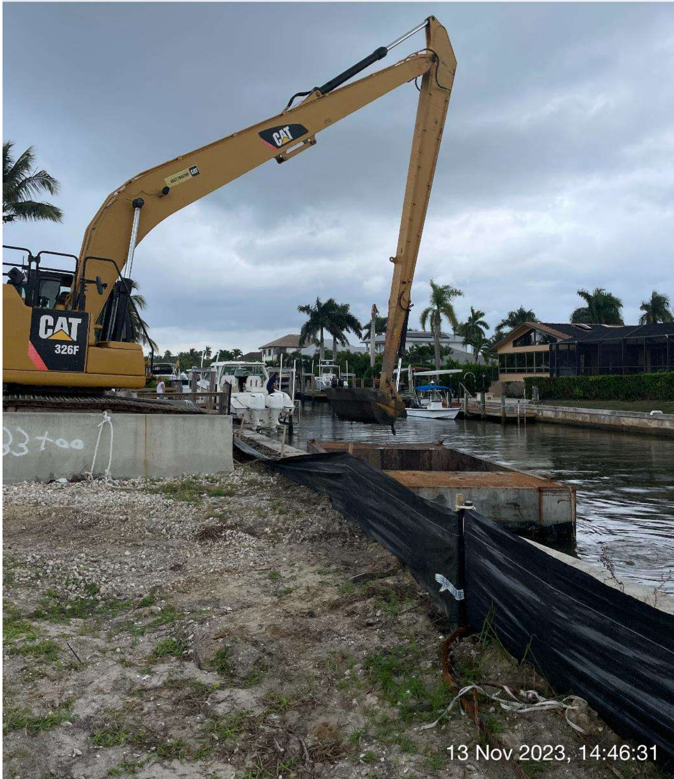
Long reach excavator removing sediment from hopper.

☉ 111°E (T) ☉ 26°8'13"N, 81°47'16"W ±9ft ▲ 8ft