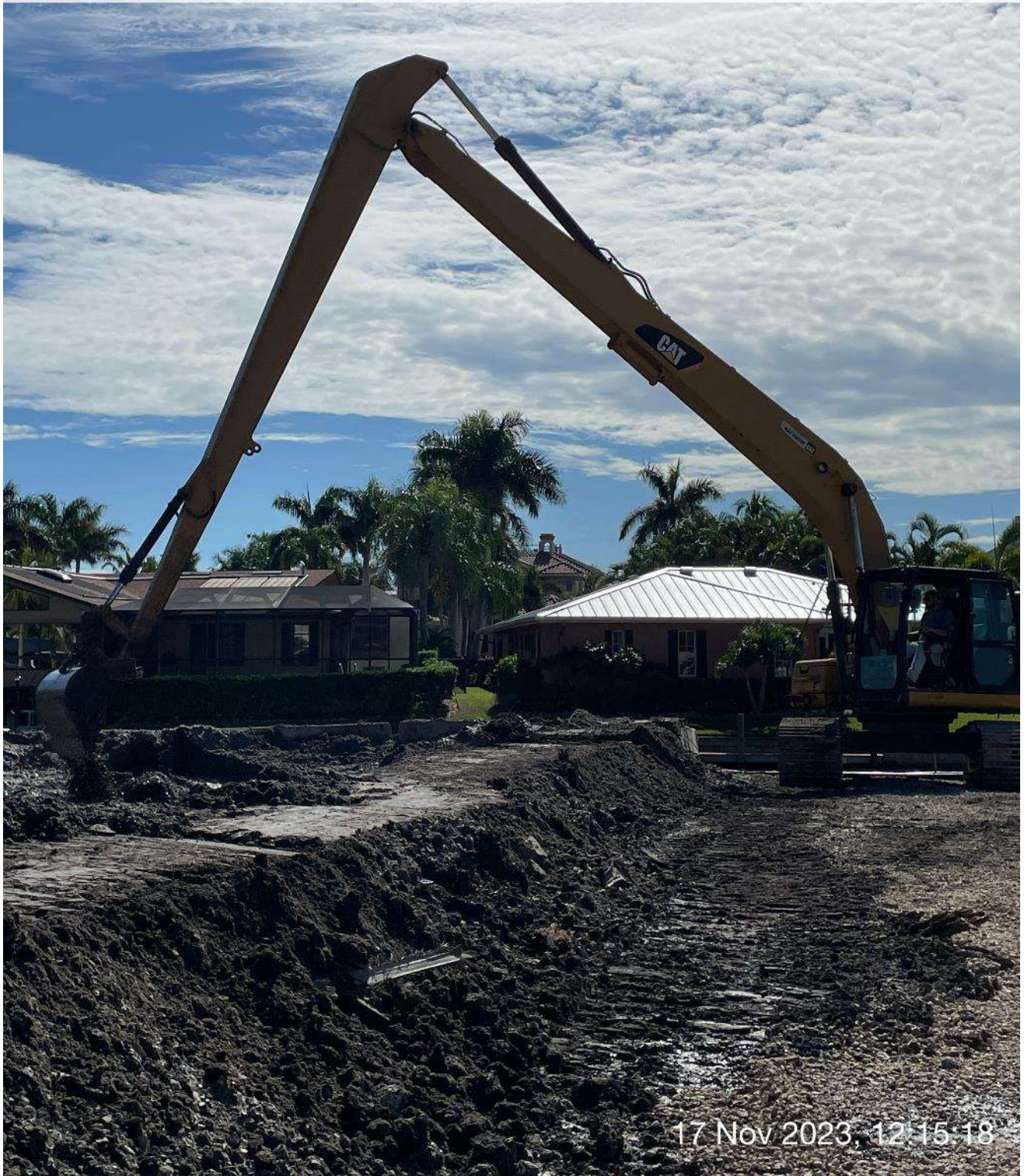
Long reach excavator spreading sediment onto staging area.

☉ 196°S (T) ☉ 26°8'14"N, 81°47'16"W ±13ft ▲ 12ft