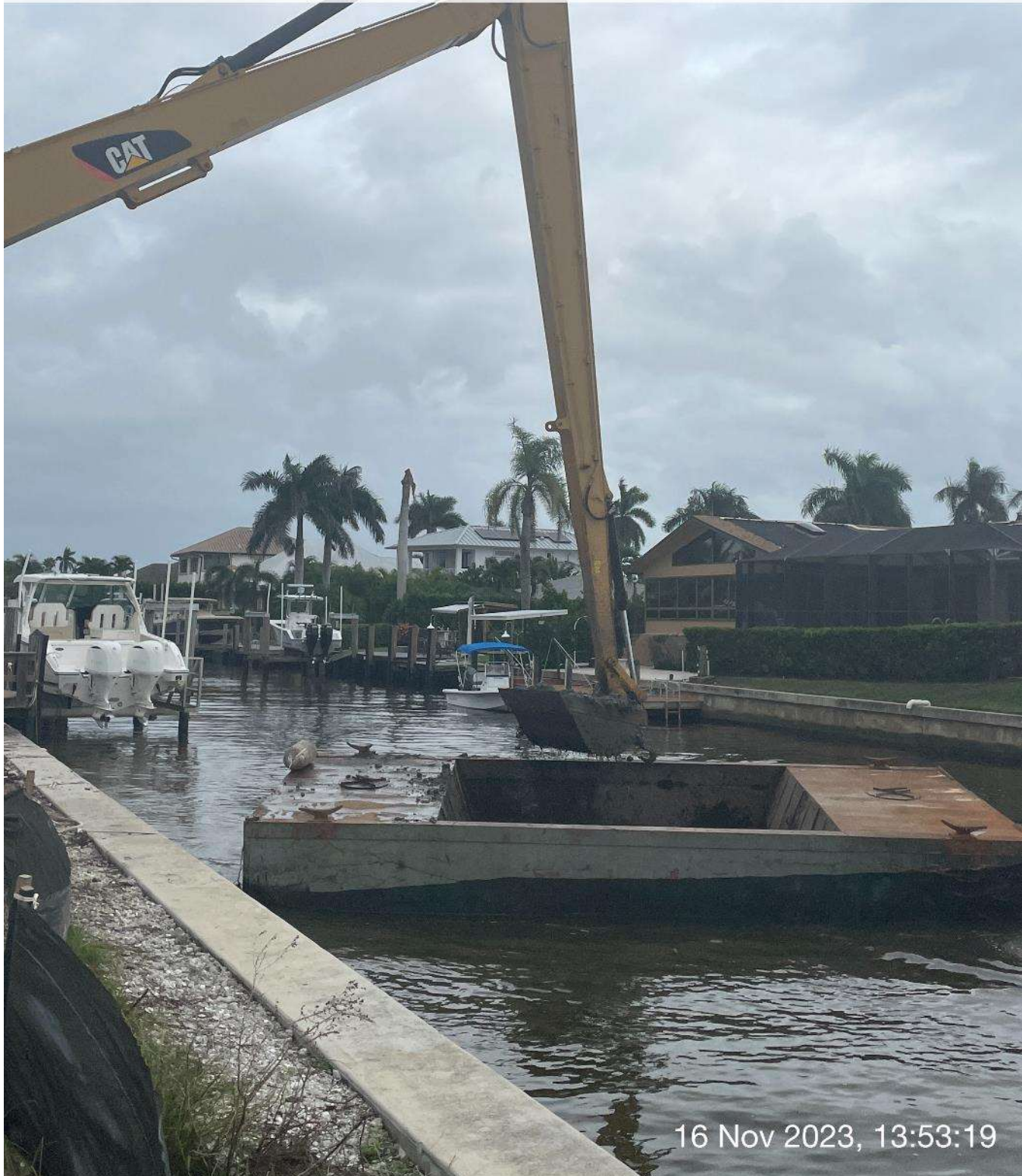
Long reach excavator removing sediment from hopper.

☉ 117°SE (T) ● 26°8'13"N, 81°47'16"W ±13ft ▲ 20ft