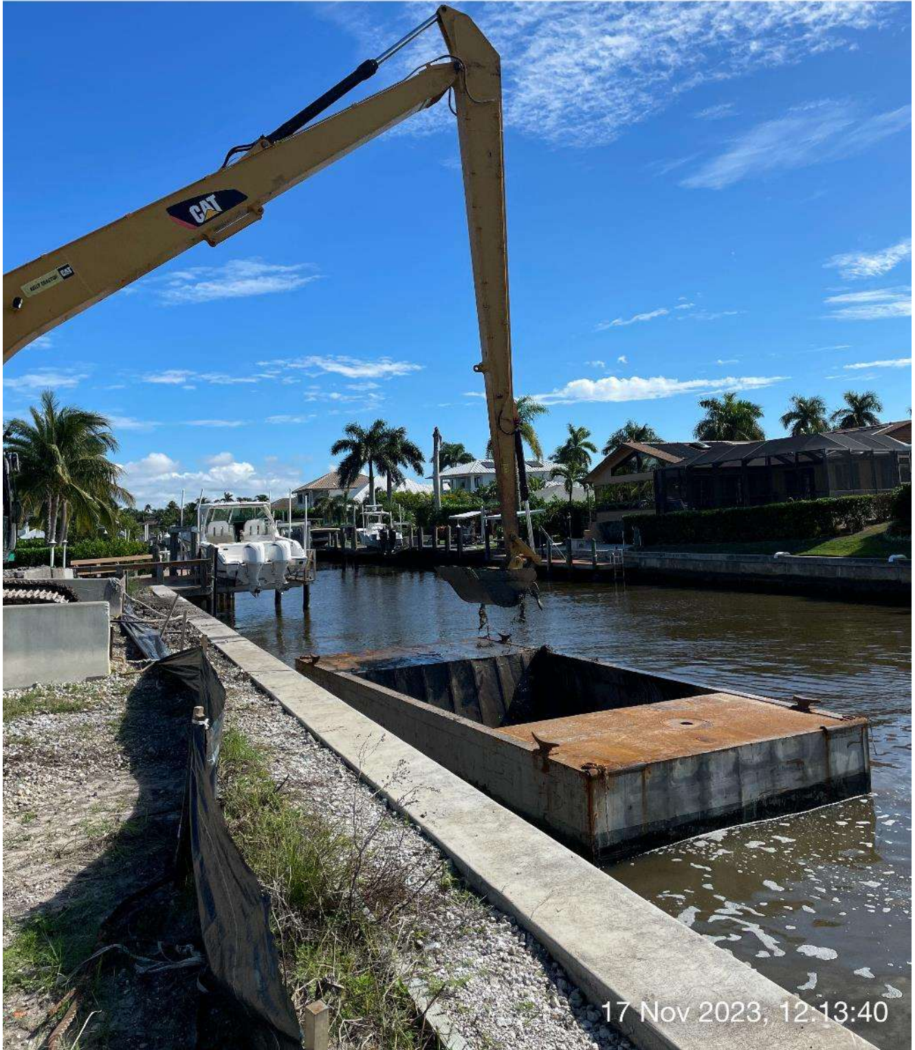
Long reach excavator removing sediment from hopper.

E 90 SE 120 150 S 180 ☀ 136°SE (T) ☉ 26°8'13"N, 81°47'16"W ±13ft ▲ 33ft