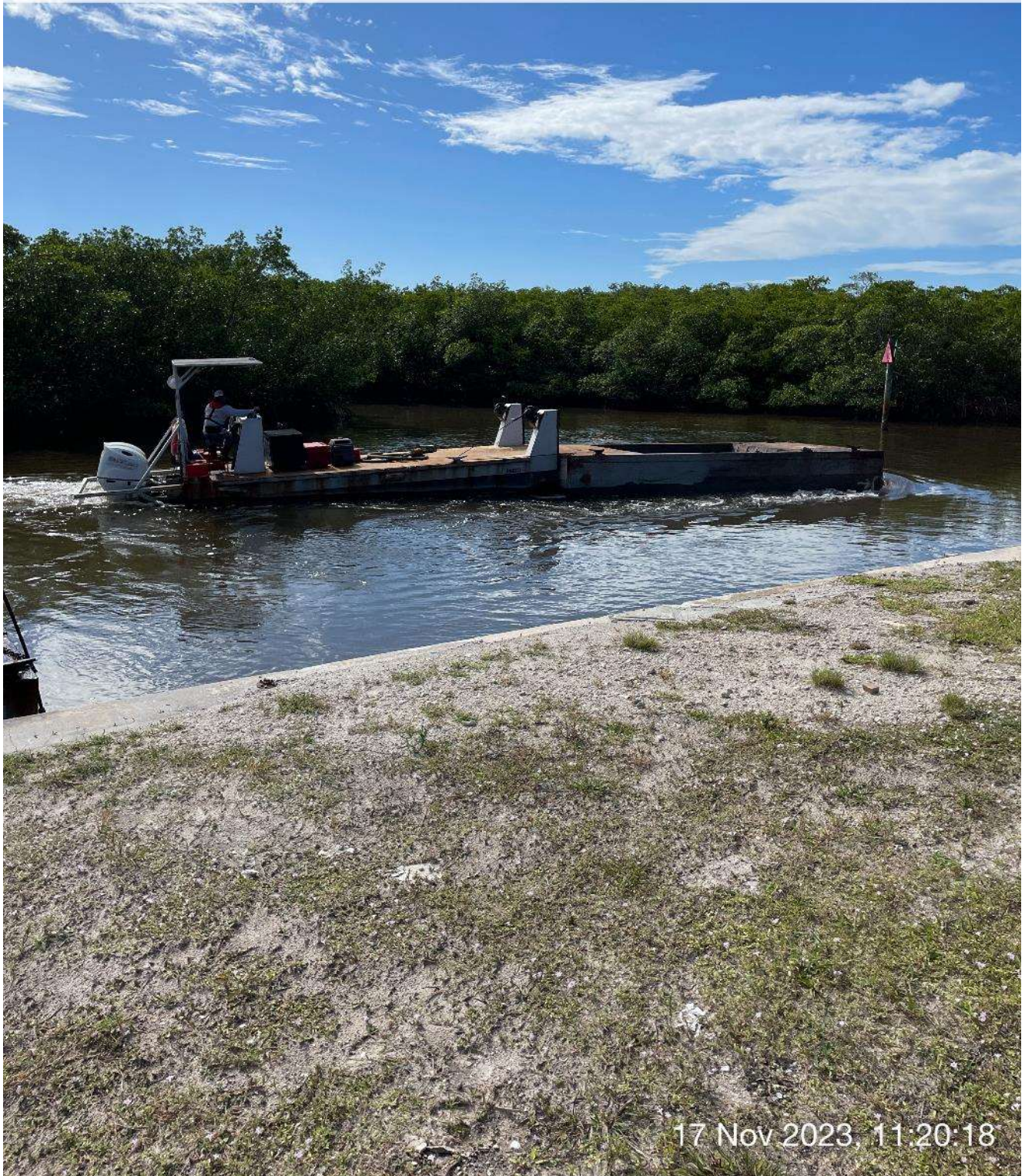
Push boat taking hopper to staging area.

SE S SW 120 150 180 210 240 ☉ 188°S (T) ☉ 26°7'20"N, 81°46'58"W ±85ft ▲ -4ft