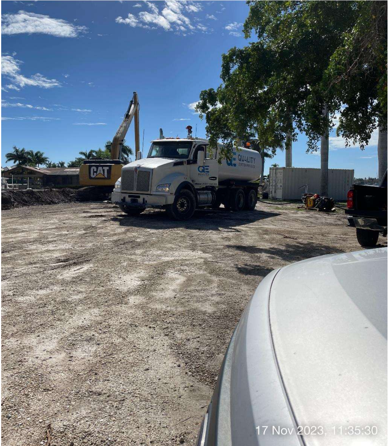
Water truck refilling water tank on trailer.

☉ 173°S (T) ☉ 26°8'15"N, 81°47'16"W ±9ft ▲ 8ft