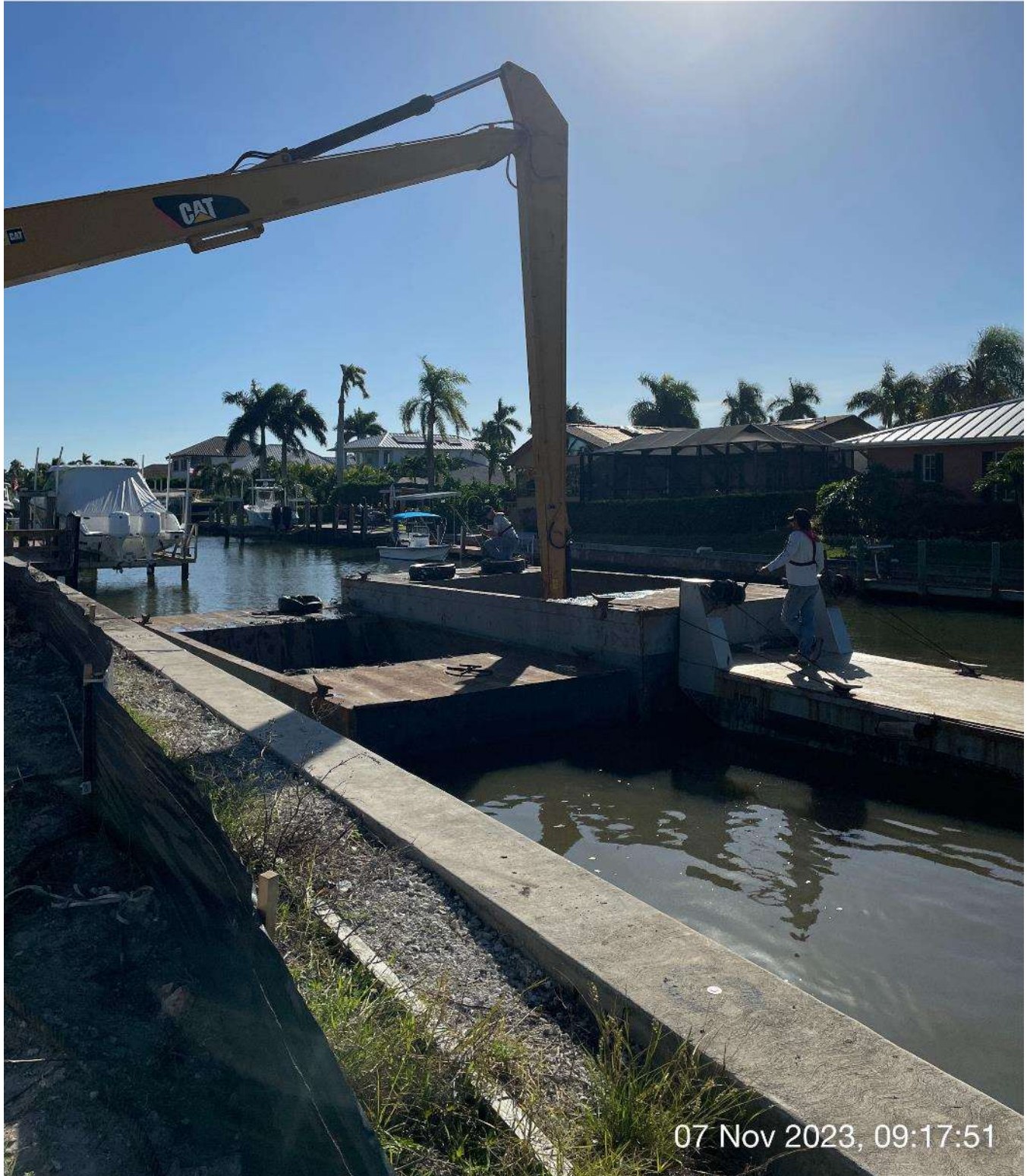
Hopper arriving at staging area.

E SE S 60 90 120 150 180 ☀ 121°SE (T) ☉ 26°8'13"N, 81°47'16"W ±13ft ▲ 10ft