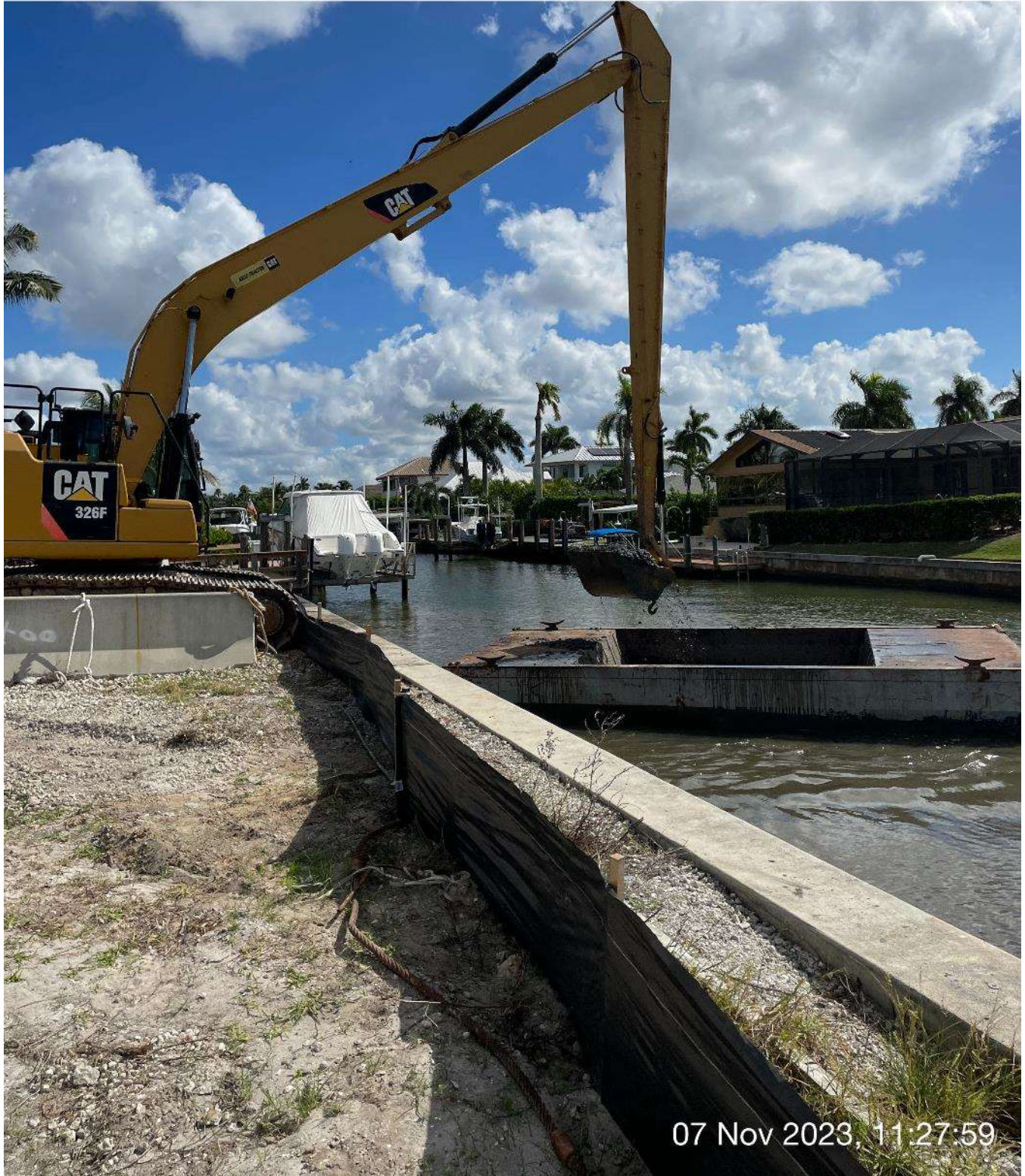
Long reach excavator removing sediment from hopper.

NE 60 E 90 SE 120 150 180 108°E (T) 26°8'13"N, 81°47'16"W ±13ft ▲ 18ft