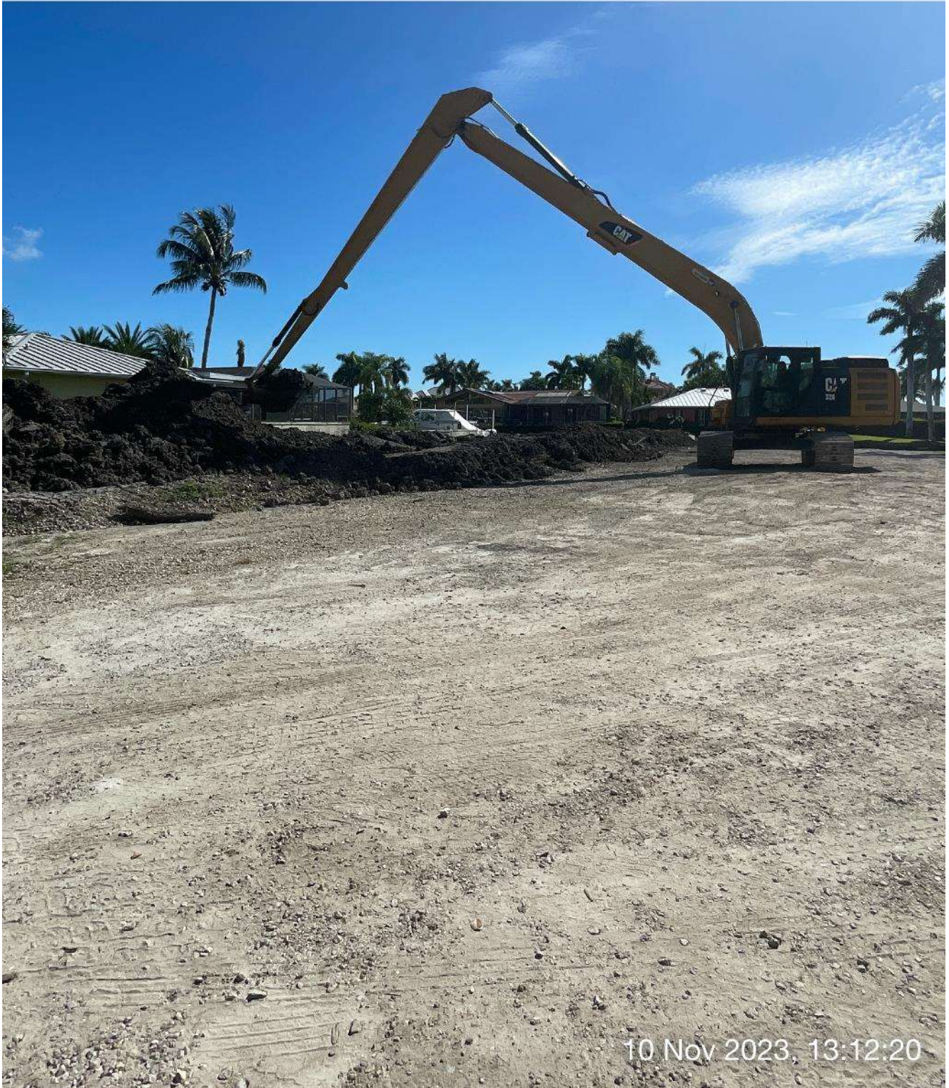
Long reach excavator separating wet and dry material onto staging area.

☉ 160°S (T) ☉ 26°8'15"N, 81°47'16"W ±9ft ▲ 11ft