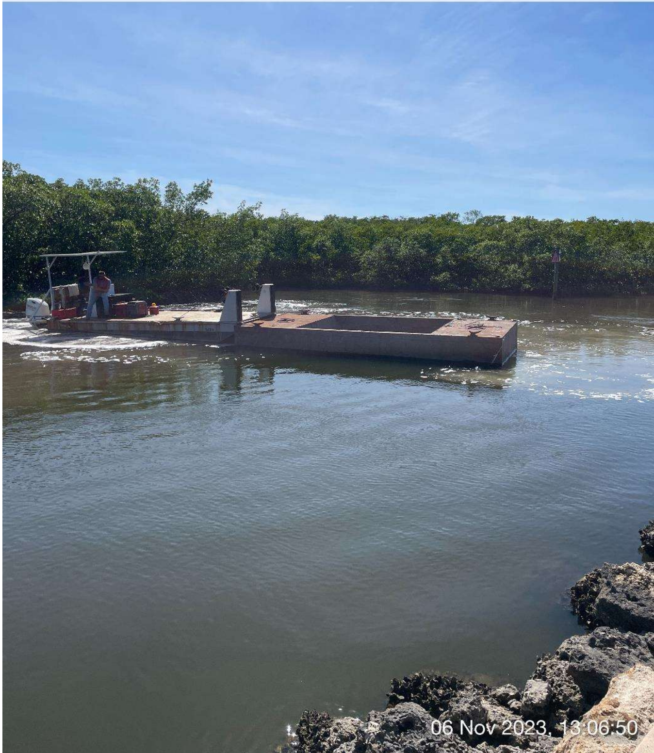
Push boat taking hopper to staging area.

☀ 209°SW (T) ● 26°7'20"N, 81°46'57"W ±13ft ▲ 18ft