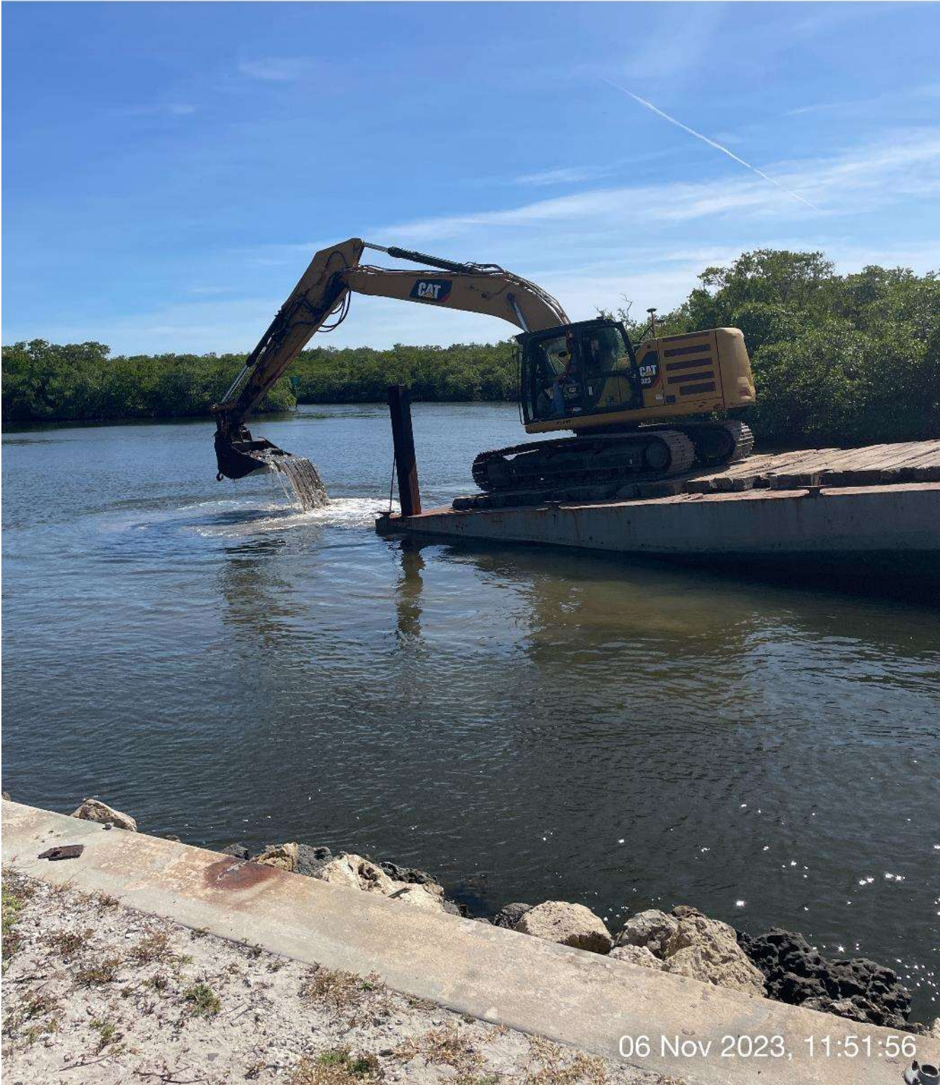
323 excavator removing sediment at station 3+75 in Canal Main B1.

☀ 136°SE (T) ● 26°7'20"N, 81°46'57"W ±13ft ▲ 30ft