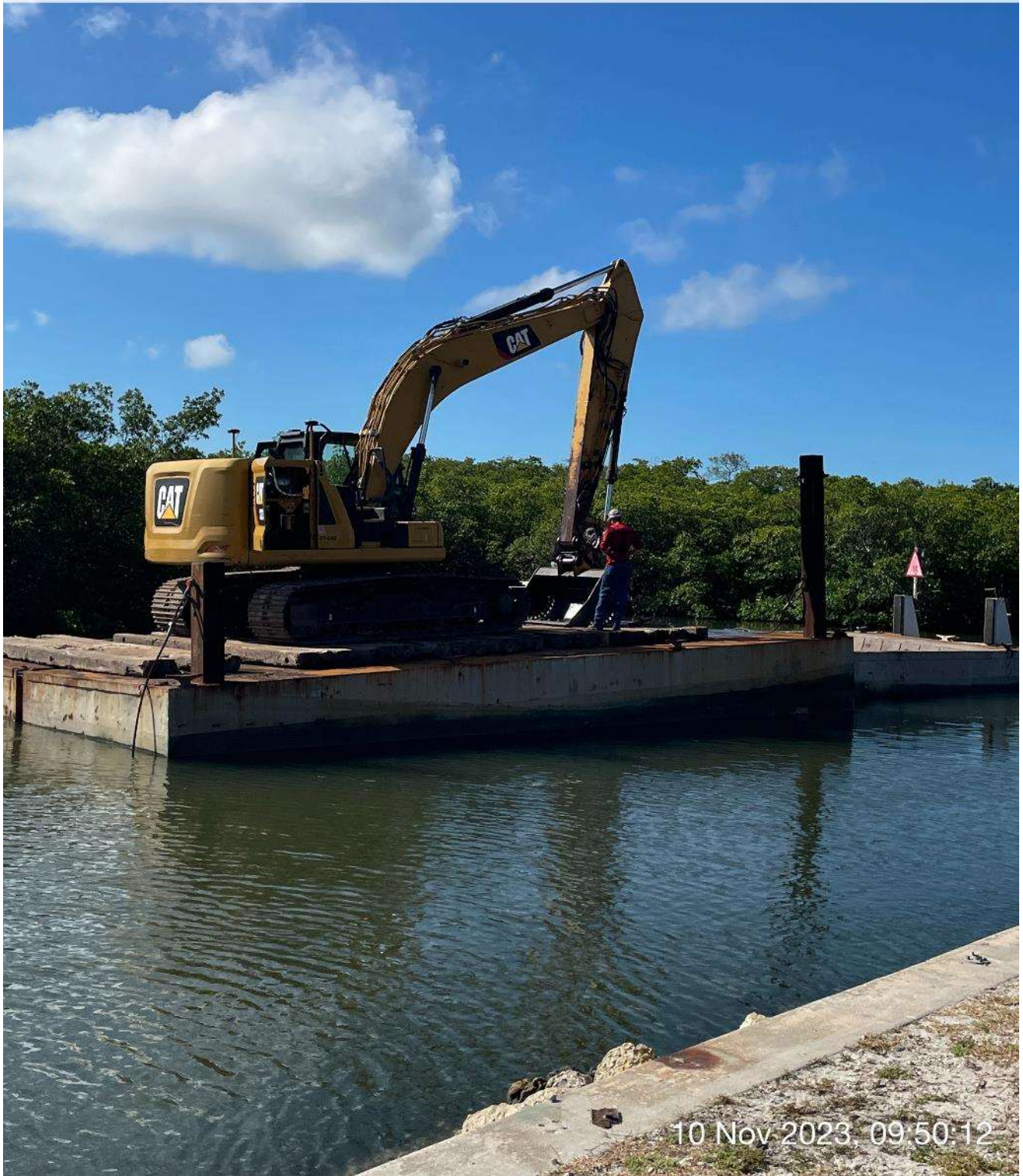
Contractor looking at hydraulic line on 323 excavator.

SE 150 S 180 SW 240 2 198°S (T) 26°7'20"N, 81°46'57"W ±32ft ▲ 10ft