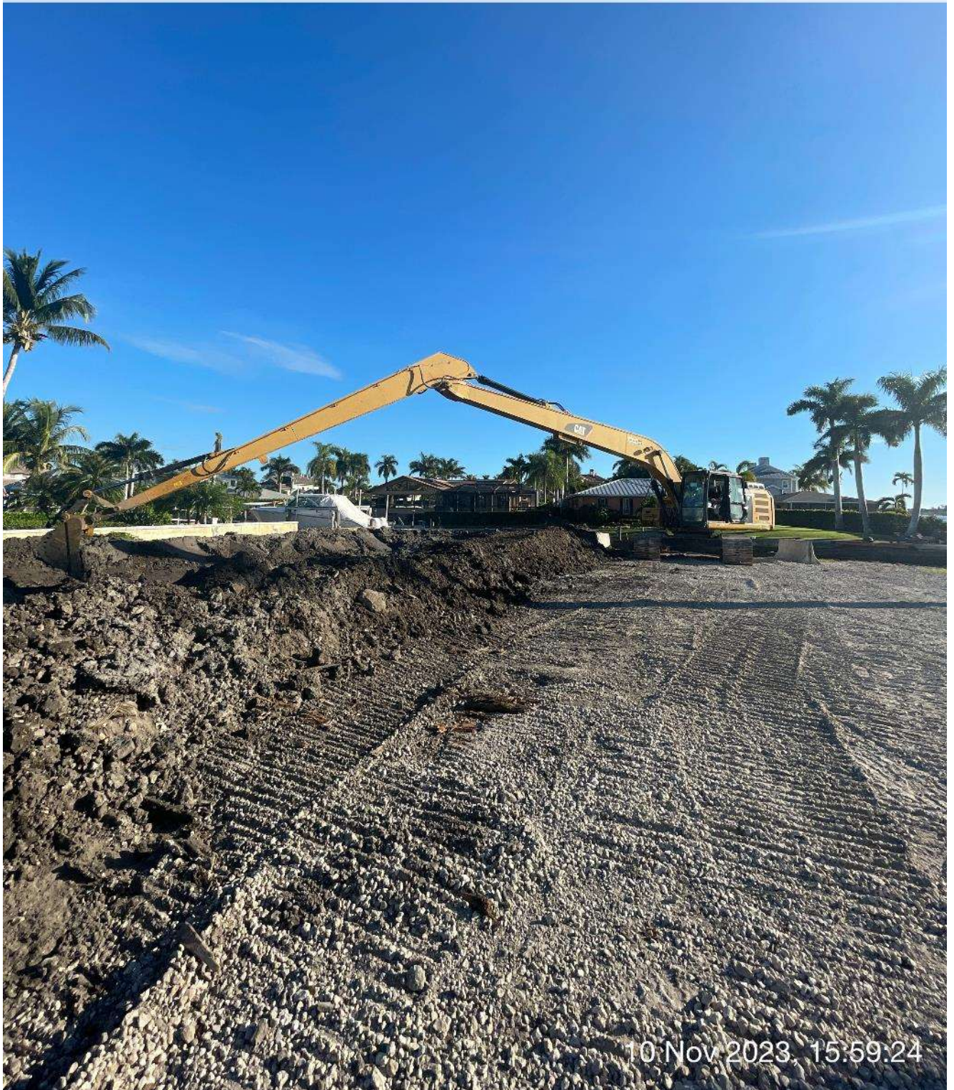
Long reach excavator spreading sediment onto staging area.

E 90 SE 120 150 S 180 SW 210 ☀ 155°SE (T) ☉ 26°8'14"N, 81°47'16"W ±13ft ▲ 12ft