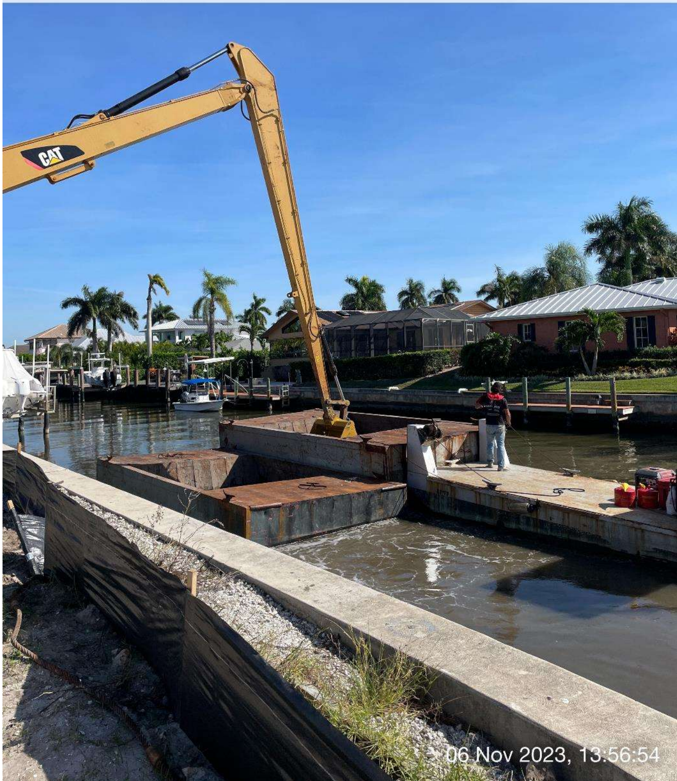
Push boat and hopper arriving at staging area.

E SE S 60 90 120 150 180 ☀ 126°SE (T) ☉ 26°8'13"N, 81°47'16"W ±13ft ▲ 23ft