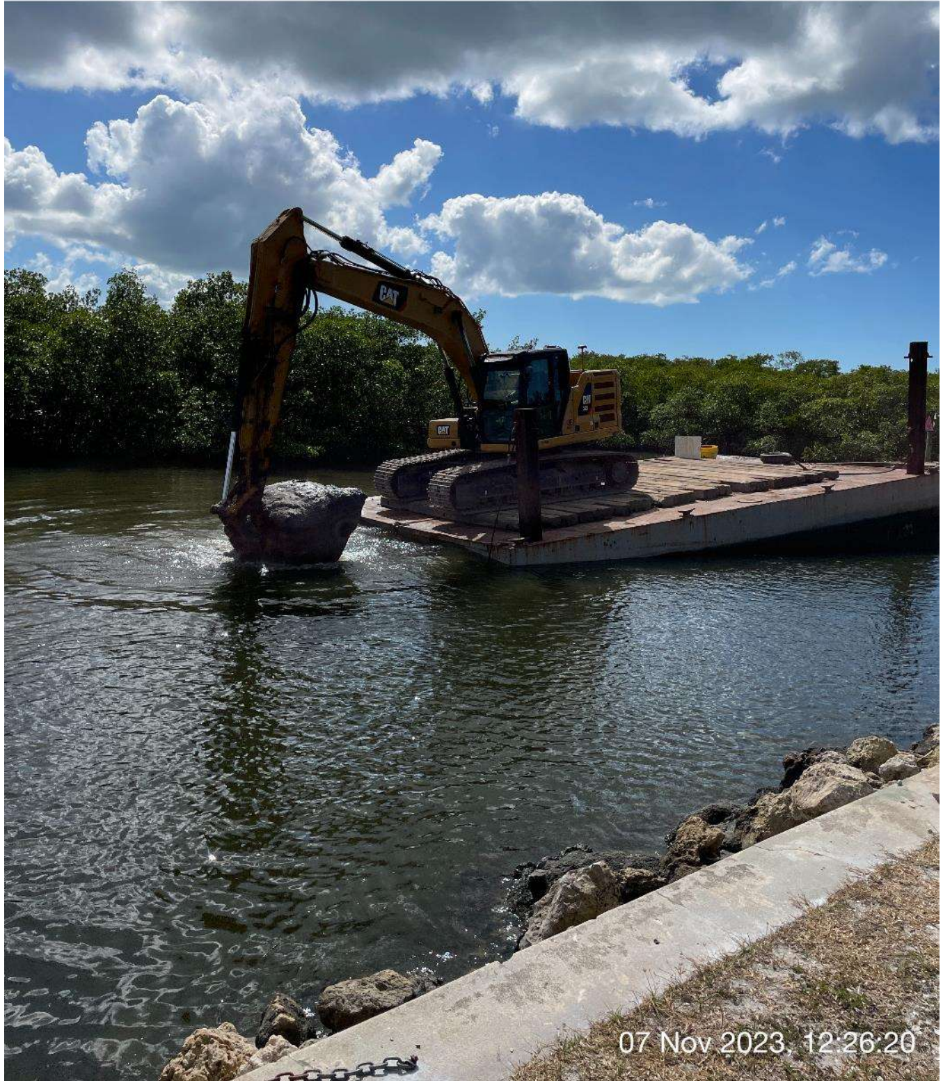
323 excavator removing sediment from station 3+00 in Canal Main B1.

SE 150 S 180 210 SW 240 W 270 ☀ 203°SW (T) ☉ 26°7'20"N, 81°46'57"W ±13ft ▲ 12ft