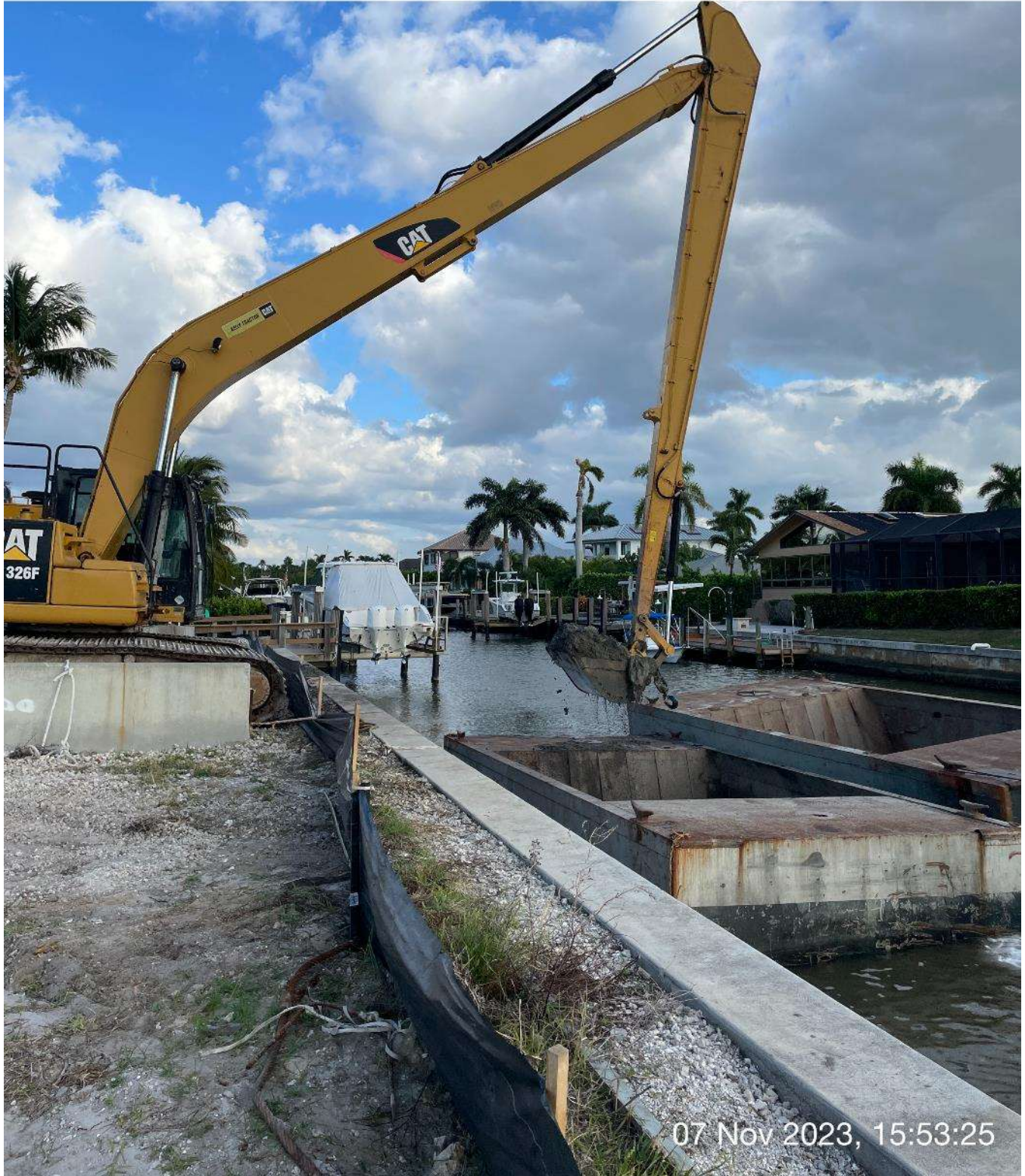
Long reach excavator removing sediment from hopper.

NE 60 E 90 SE 150 S 180 110°E (T) 26°8'13"N, 81°47'16"W ±9ft ▲ 25ft