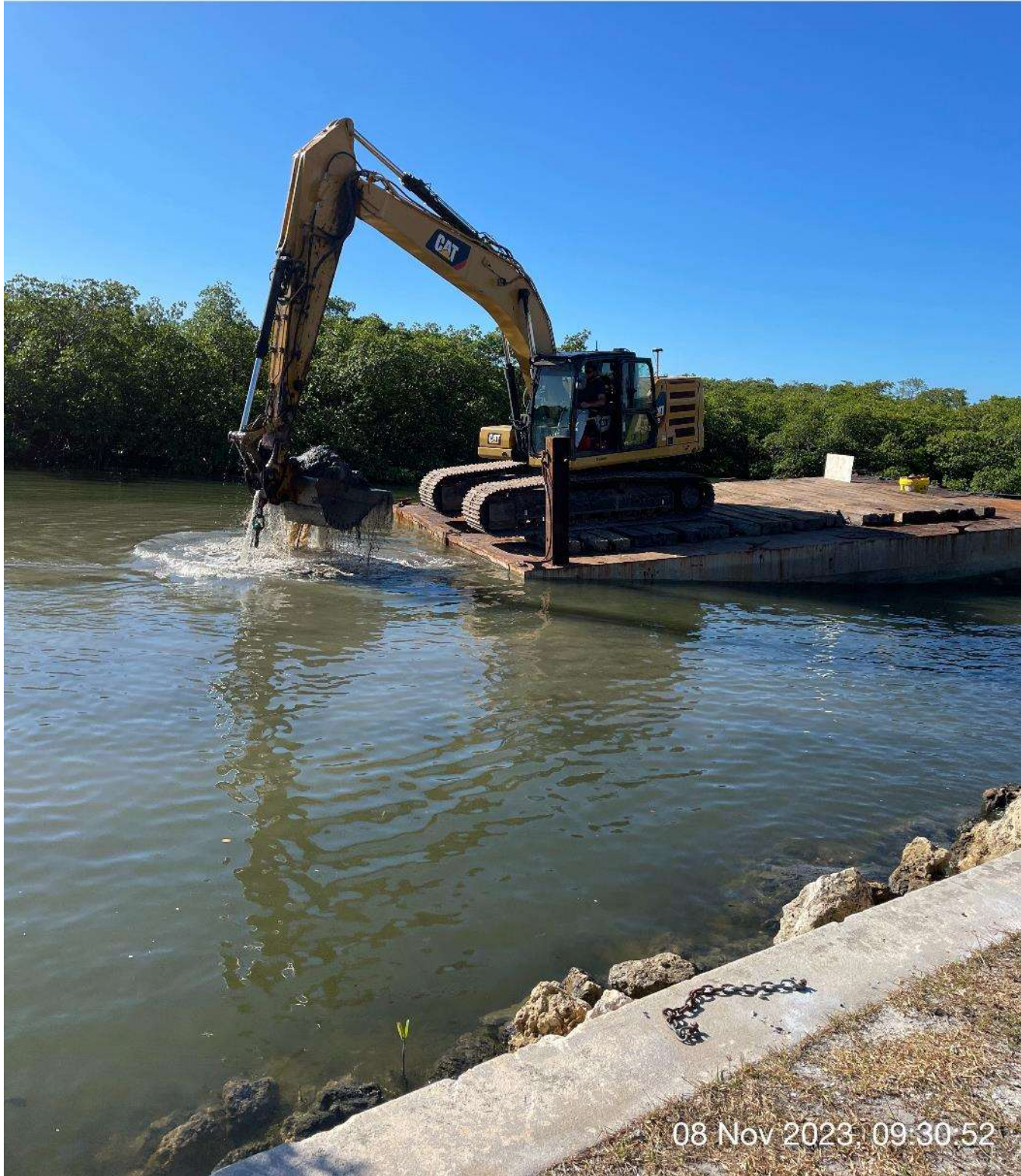
323 excavator removing sediment at station 3+00 in Canal Main B1.

SE S SW 0 150 180 210 240 ☀ 192°S (T) ☉ 26°7'20"N, 81°46'57"W ±9ft ▲ 48ft