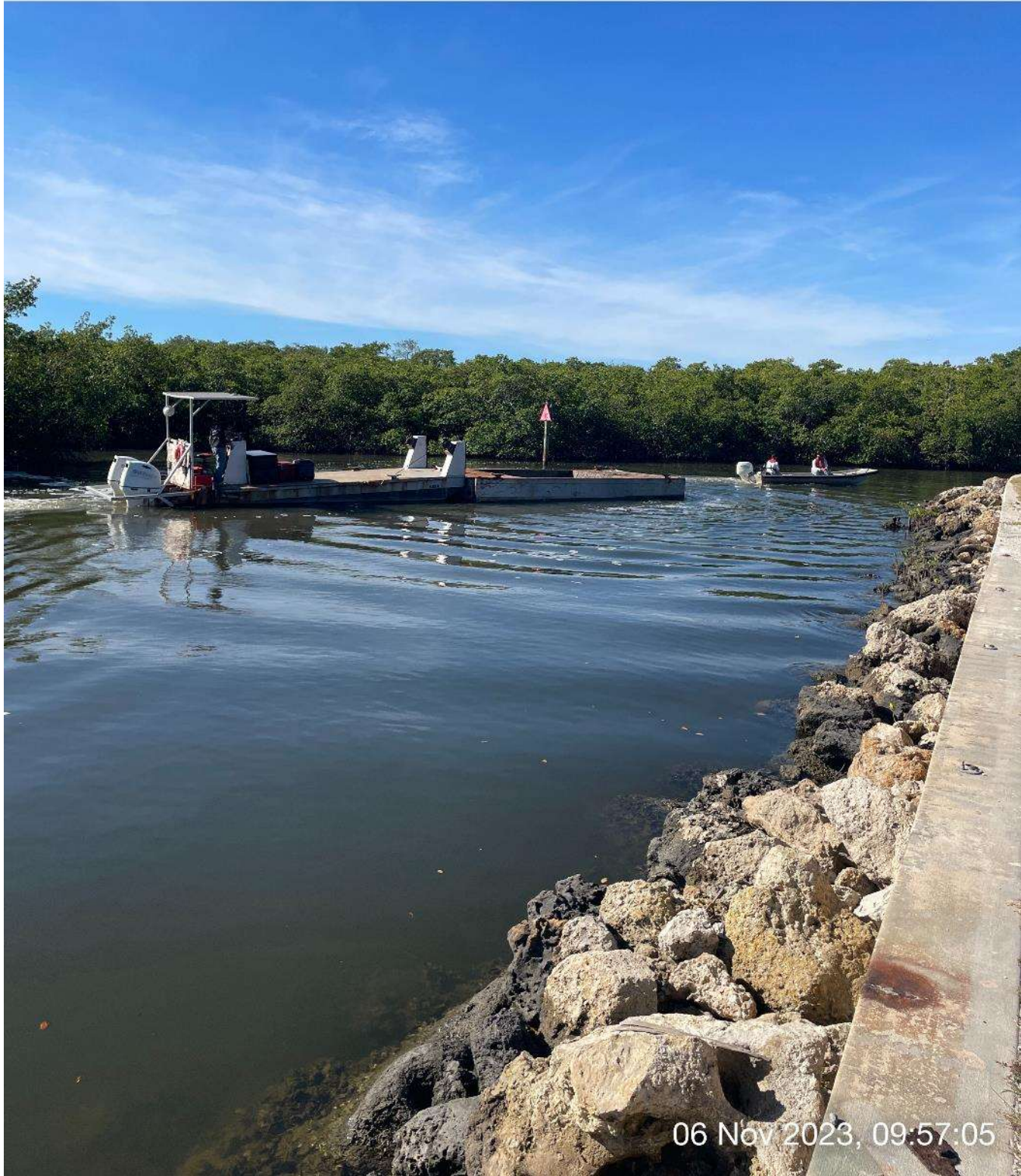
Push boat taking hopper to staging area.

☀ 223°SW (T) ☉ 26°7'20"N, 81°46'57"W ±13ft ▲ 13ft