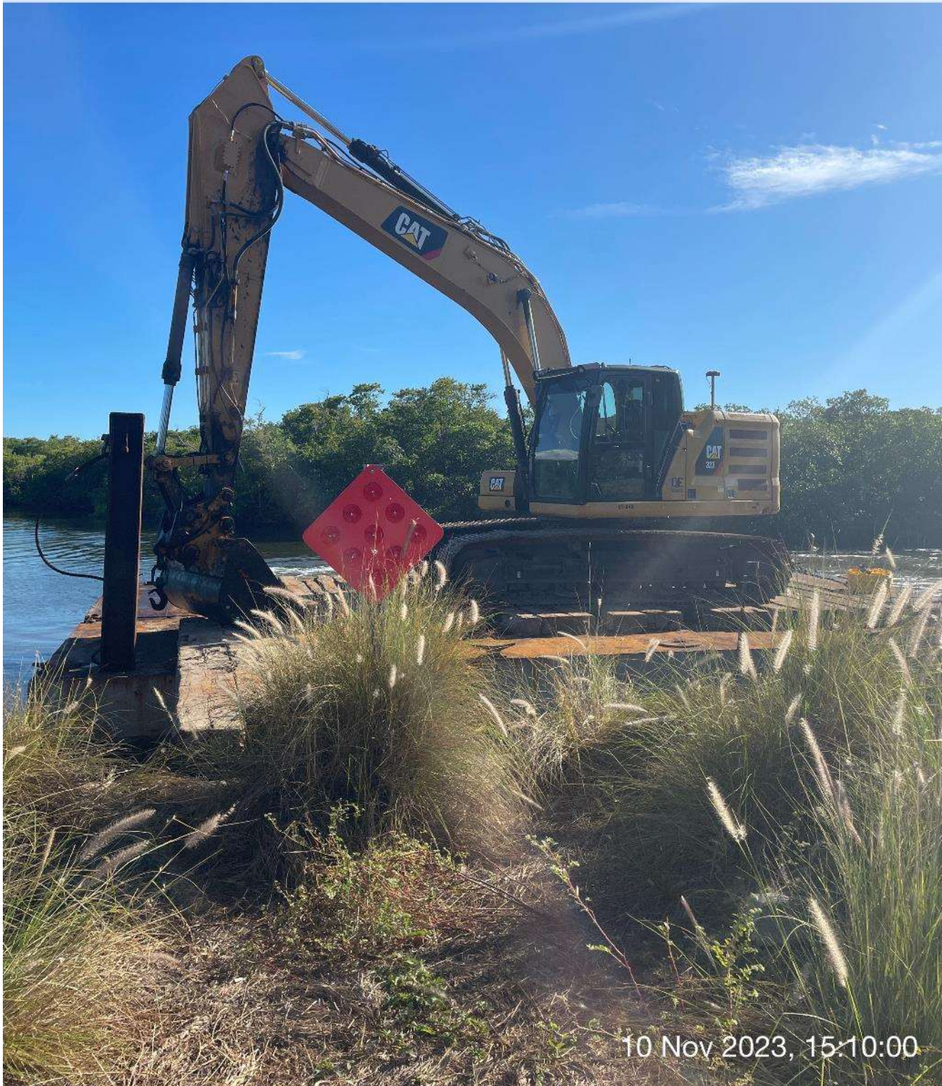
323 excavator staged at station 4+00 in Canal Main B1.

☉ 173°S (T) ☉ 26°7'20"N, 81°46'57"W ±13ft ▲ 8ft