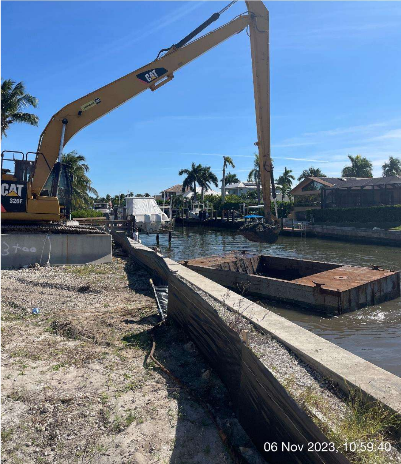
Long reach excavator removing sediment from hopper.

☉ 108°E (T) ☉ 26°8'13"N, 81°47'16"W ±13ft ▲ 16ft