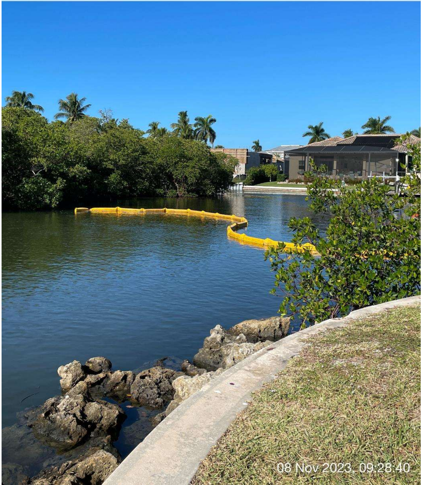
Turbidity curtain in place at station 1+50 in Canal Main B1.

☀ 280°W (T) ☉ 26°7'20"N, 81°46'59"W ±9ft ▲ 17ft