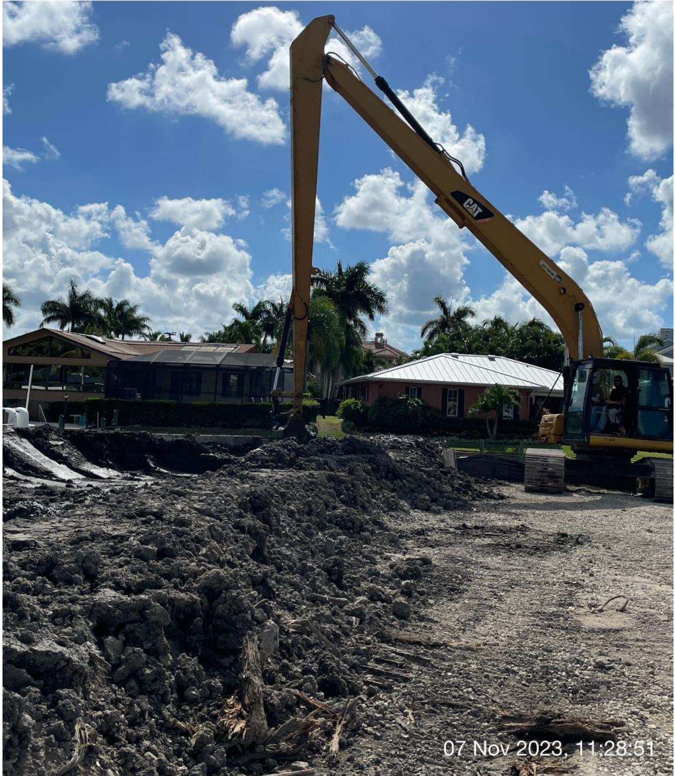
Long reach excavator spreading sediment on staging area.

☀ 167°S (T) ☉ 26°8'14"N, 81°47'15"W ±13ft ▲ 17ft