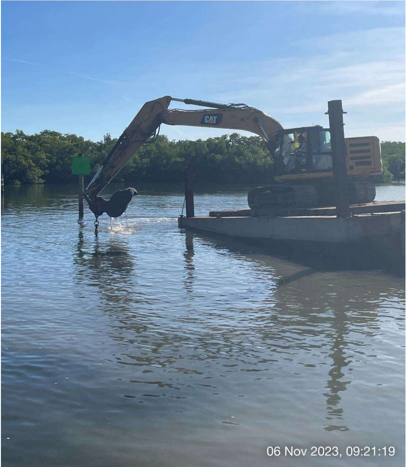
323 excavator removing sediment at station 4+00 in Canal Main B1.

☀ 100°E (T) ☉ 26°7'20"N, 81°46'58"W ±9ft ▲ 9ft