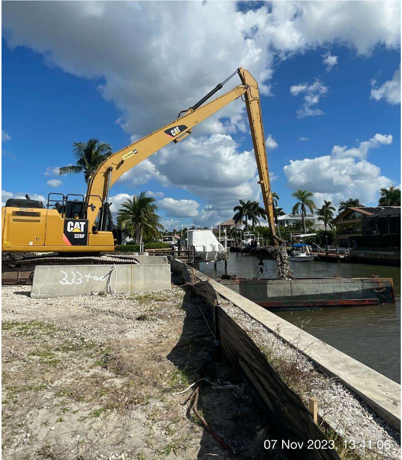
Long reach excavator removing sediment from hopper.

☉ 101°E (T) ☉ 26°8'13"N, 81°47'16"W ±13ft ▲ 13ft