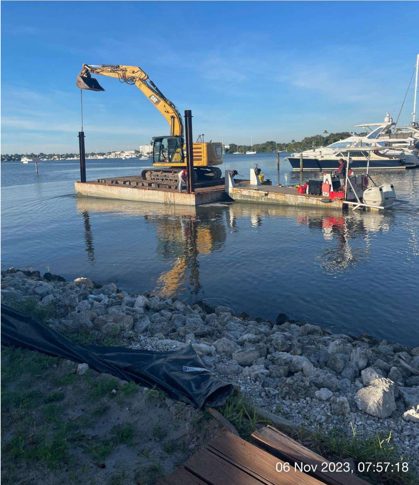
Push boat taking barge to Canal Main B1.

☀ 231°SW (T) ● 26°8'14"N, 81°47'16"W ±13ft ▲ 12ft