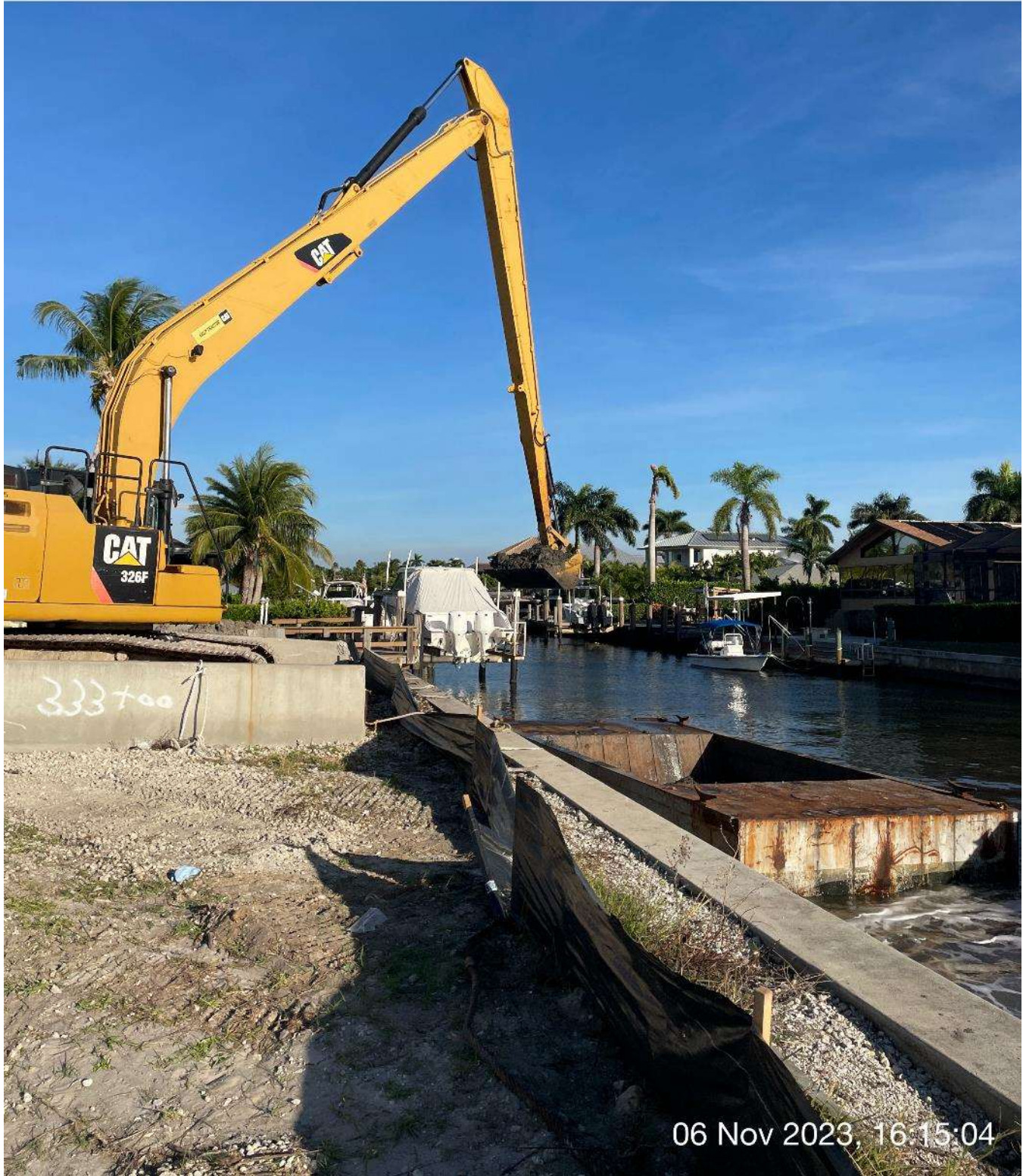
Long reach excavator removing sediment from hopper.

NE E SE 0 60 90 120 150 ☀ 101°E (T) ☉ 26°8'13"N, 81°47'16"W ±39ft ▲ 75ft