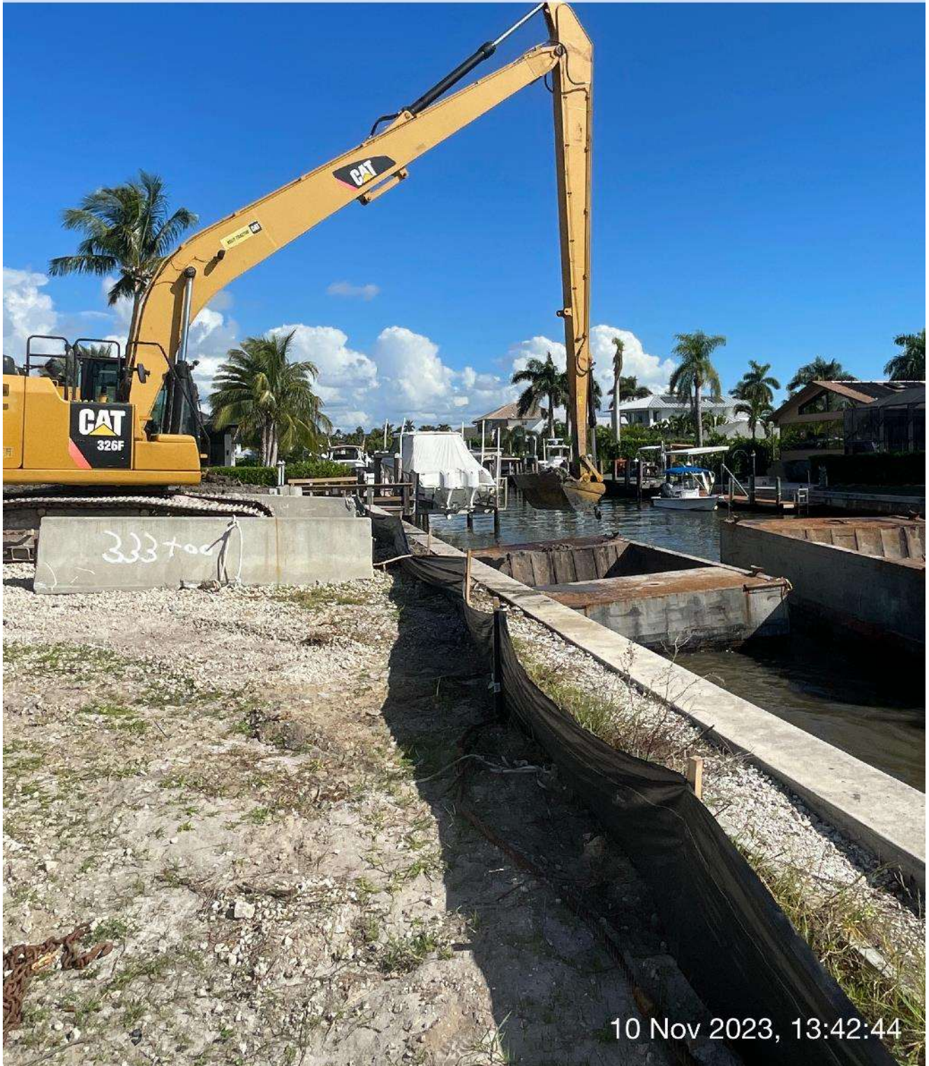
Long reach excavator removing sediment from hopper.

☉ 100°E (T) ☉ 26°8'13"N, 81°47'16"W ±13ft ▲ 16ft