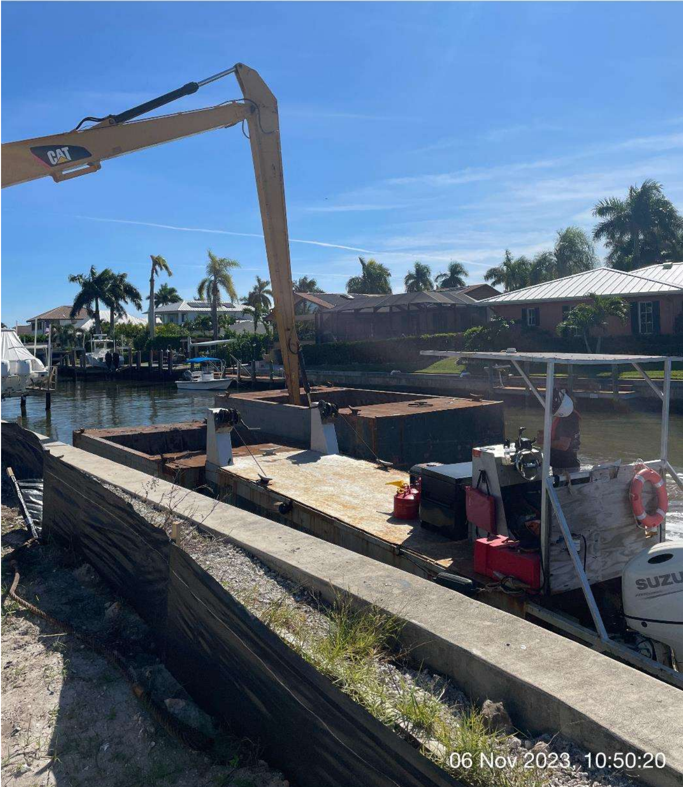
Push boat and hopper arriving at staging area.

☉ 124°SE (T) ☉ 26°8'13"N, 81°47'16"W ±9ft ▲ 21ft