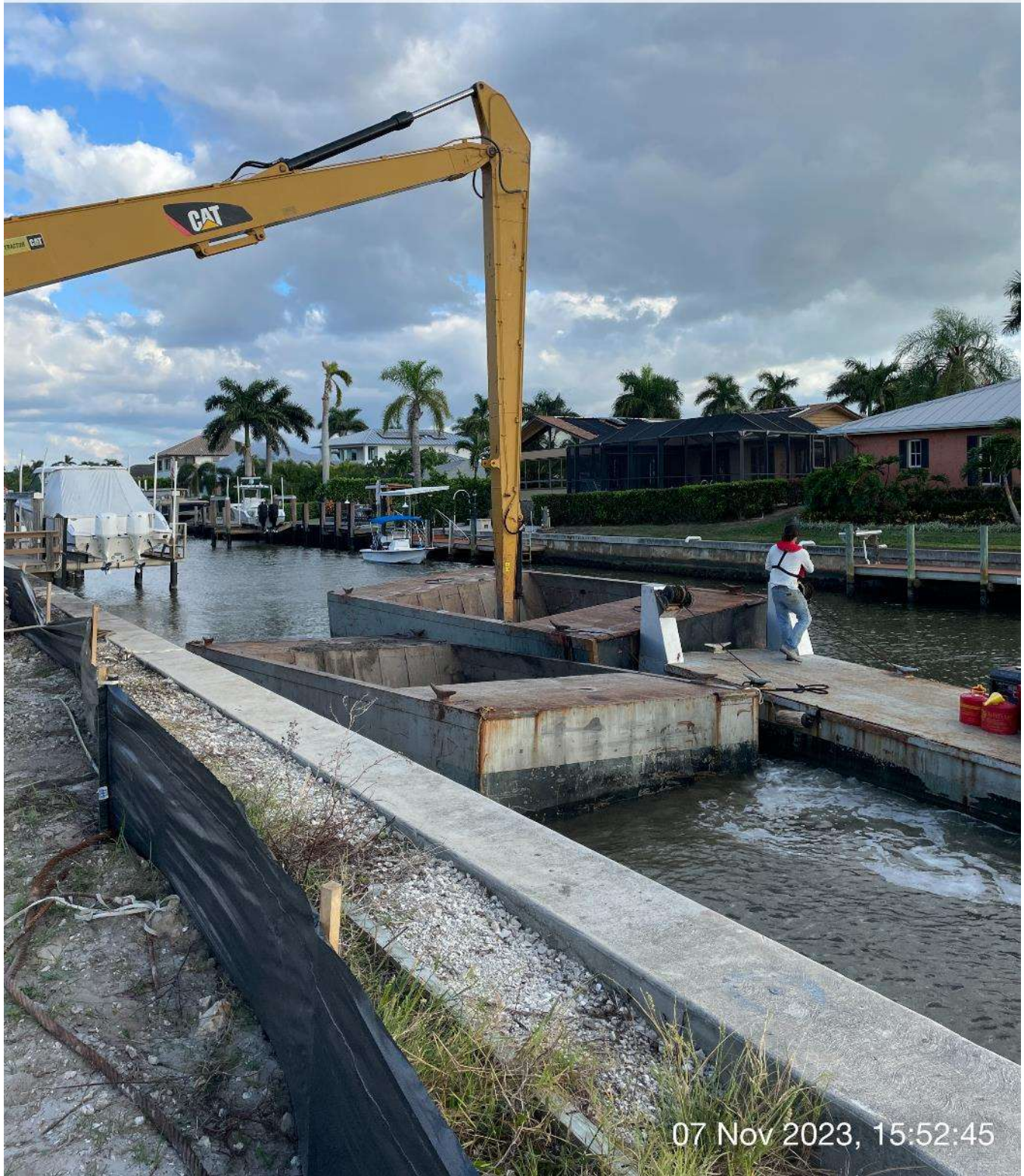
Hopper arriving at staging area.

E SE S 60 90 120 150 180 ☉ 122°SE (T) ☉ 26°8'13"N, 81°47'16"W ±13ft ▲ 9ft