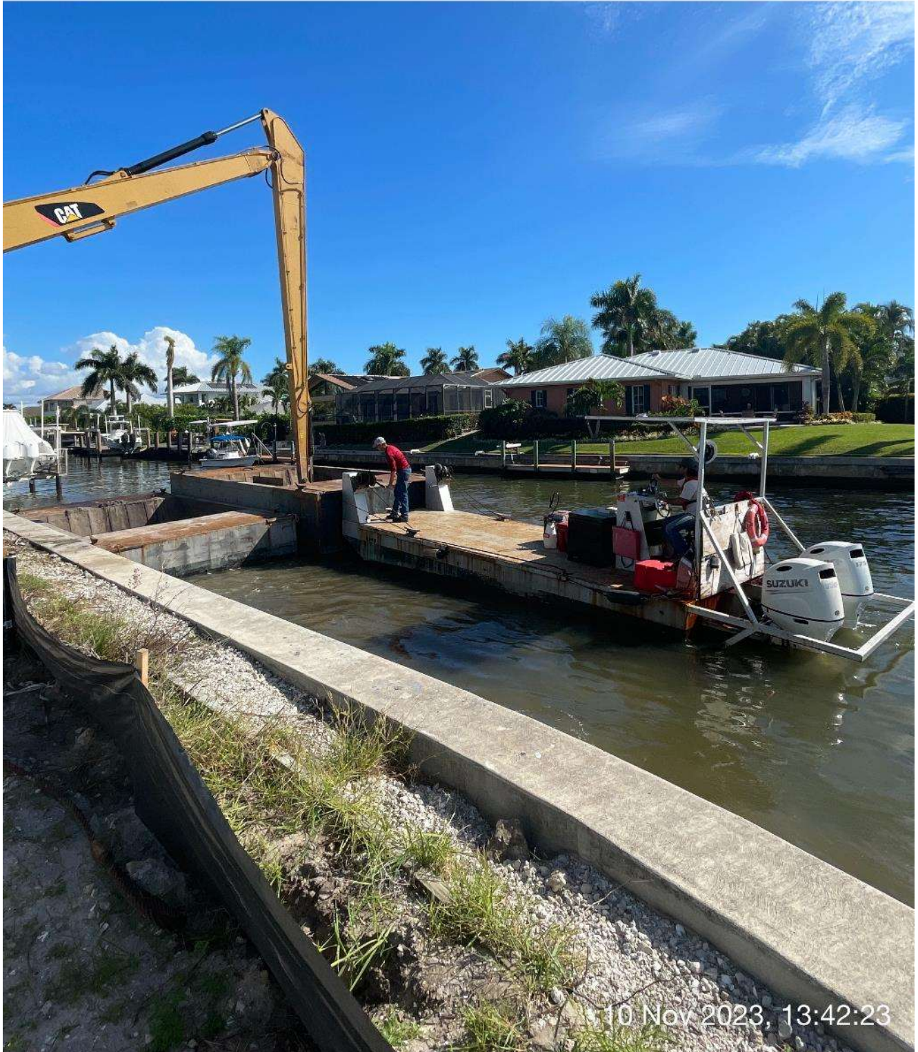
Push boat and hopper arriving at staging area.

E 90 SE 150 S 180 ☀ 132°SE (T) ☉ 26°8'13"N, 81°47'16"W ±13ft ▲ 12ft