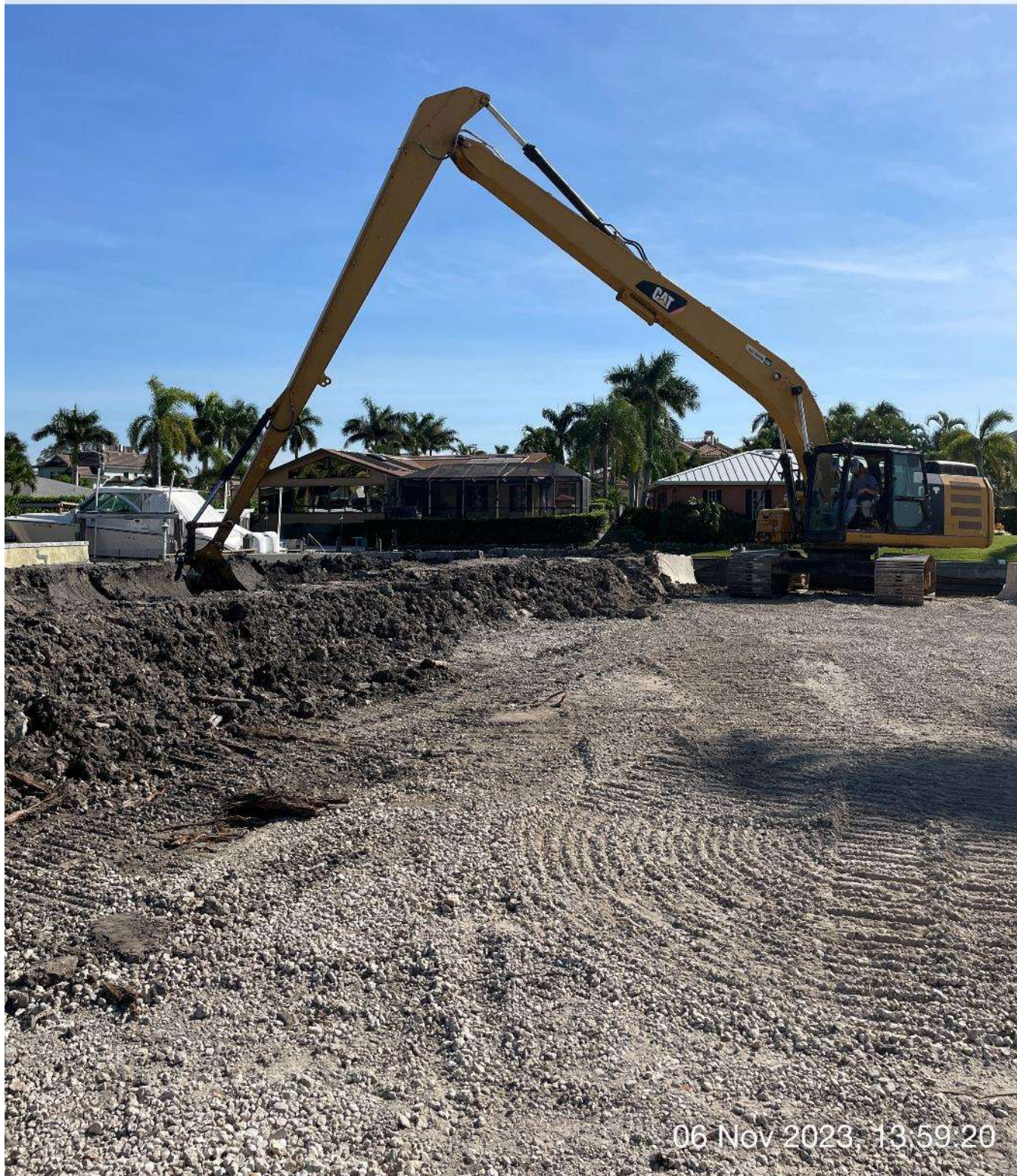
Long reach excavator spreading sediment on staging area.

☀ 157°SE (T) ● 26°8'14"N, 81°47'16"W ±9ft ▲ 38ft