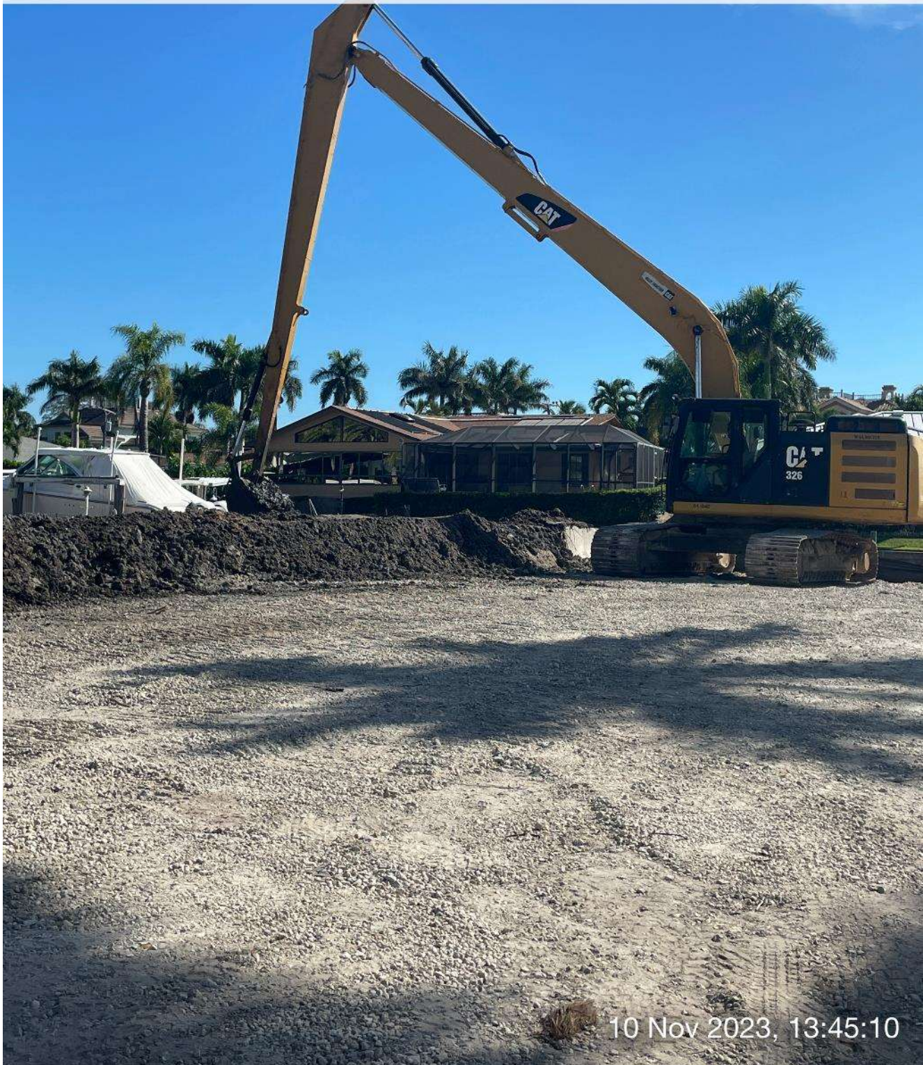
Long reach excavator spreading sediment onto staging area.

☉ 147°SE (T) ● 26°8'14"N, 81°47'16"W ±13ft ▲ 18ft