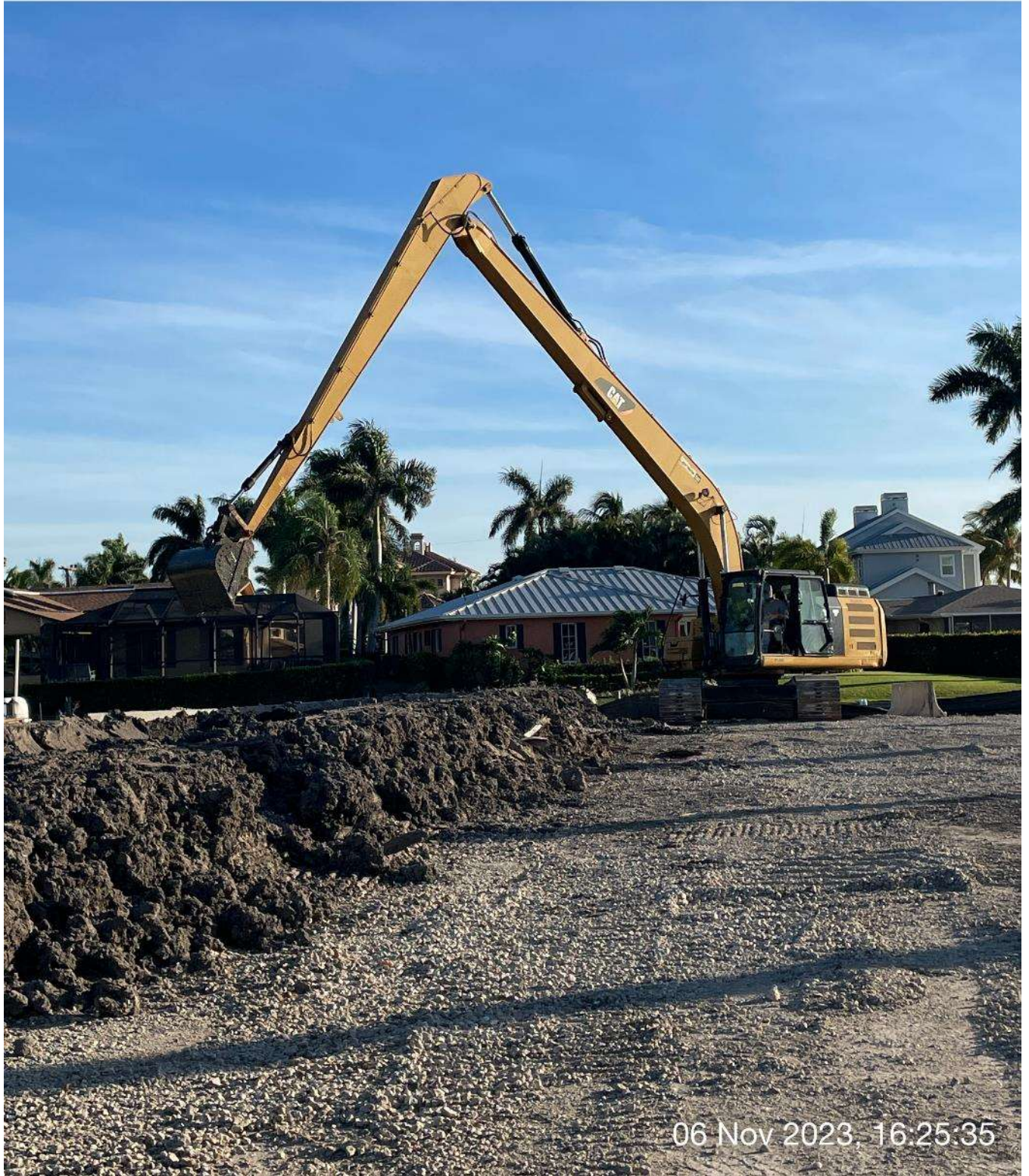
Long reach excavator spreading sediment on staging area.

☉ 171°S (T) ☉ 26°8'14"N, 81°47'16"W ±13ft ▲ 13ft