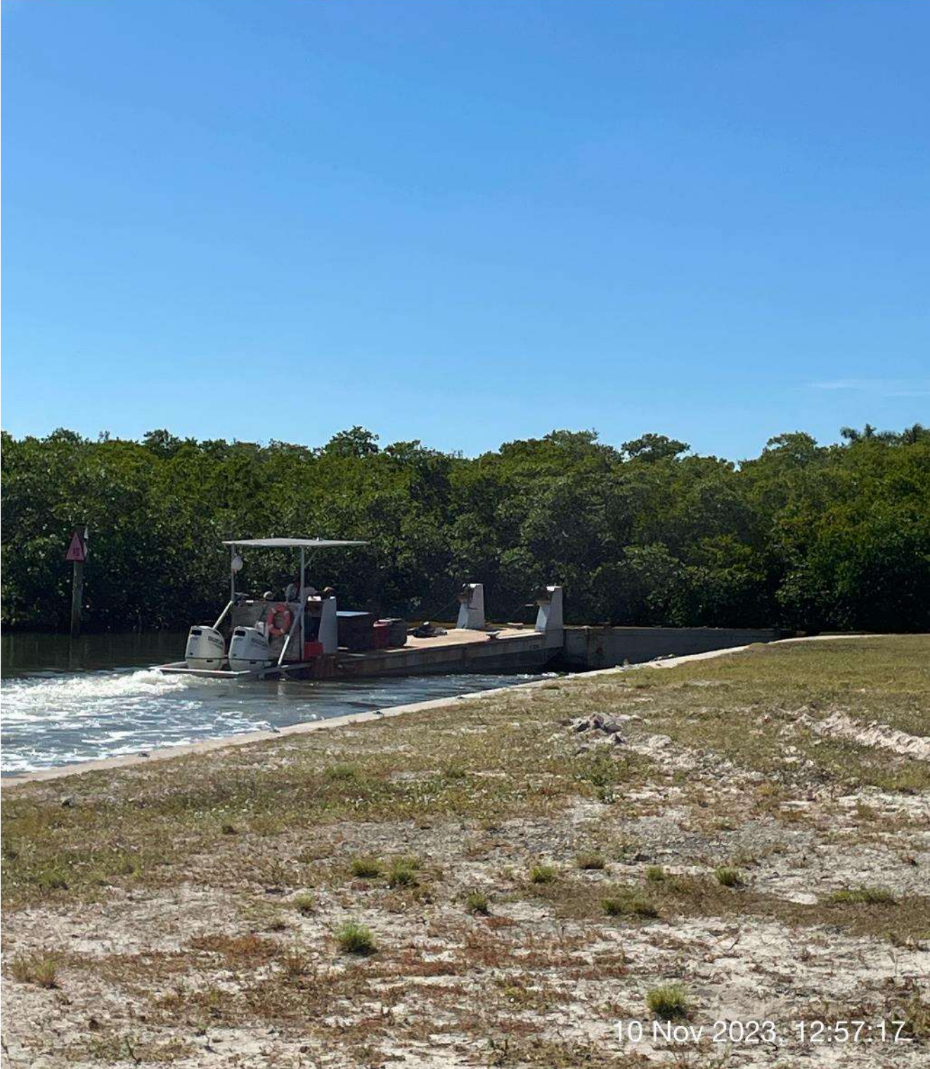
Push boat taking hopper to staging area.

☀ 202°S (T) ☉ 26°7'20"N, 81°46'57"W ±13ft ▲ 13ft