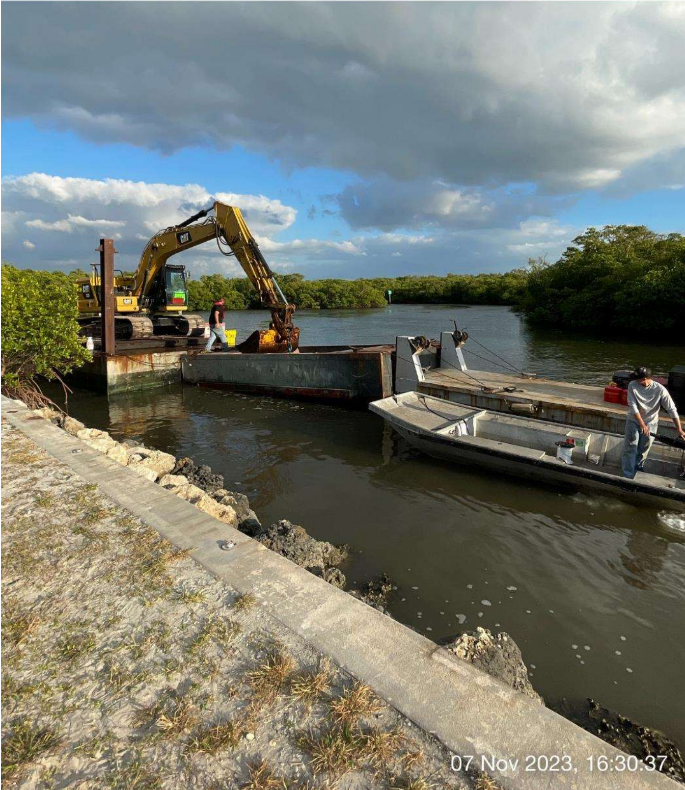
Equipment staged at station 4+00 in Canal Main B1.

☀ 108°E (T) ☉ 26°7'20"N, 81°46'57"W ±13ft ▲ 10ft