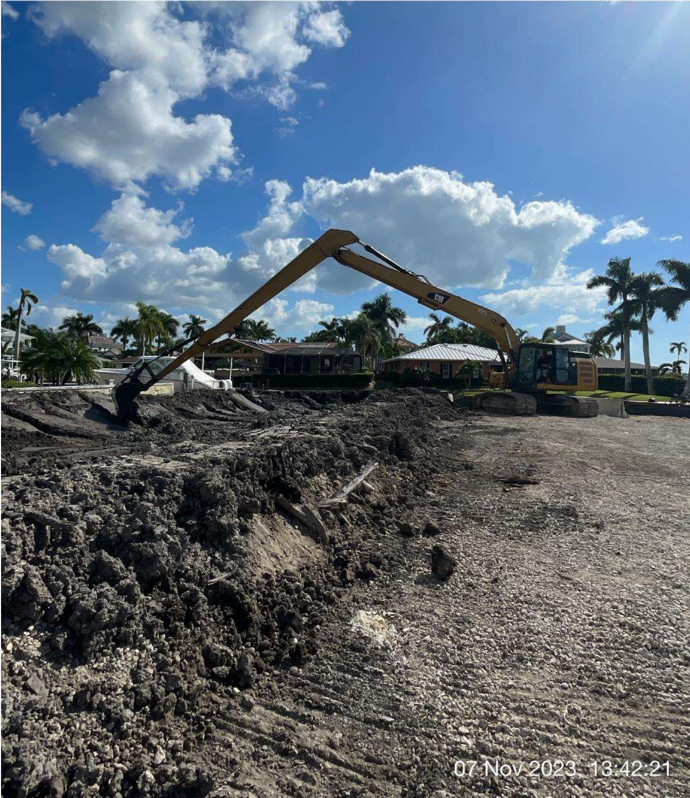
Long reach excavator spreading sediment on staging area.

☀ 165°S (T) ● 26°8'14"N, 81°47'15"W ±13ft ▲ 21ft