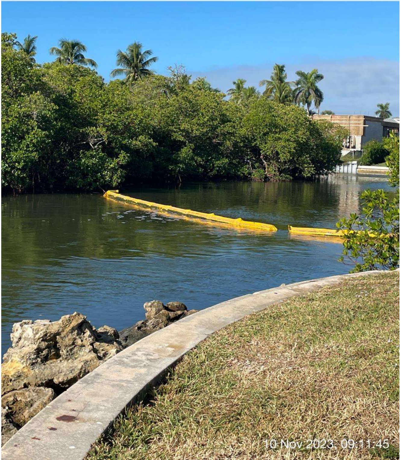
Turbidity curtain in place at station 1+50 in Canal Main B1.

SW W NW 210 240 270 300 330 ☉ 267°W (T) ☉ 26°7'19"N, 81°46'58"W ±13ft ▲ 10ft