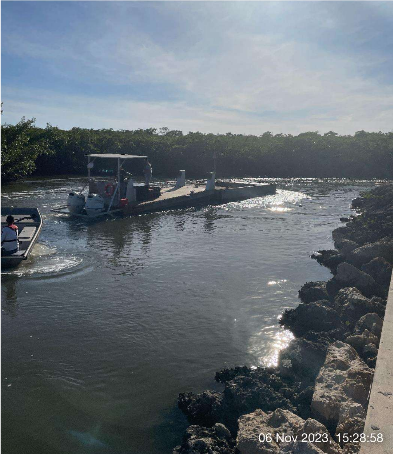
Push boat taking hopper to staging area.

S 180 SW 270 W 50 180 210 240 270 219°SW (T) 26°7'20"N, 81°46'57"W ±13ft ▲ 12ft