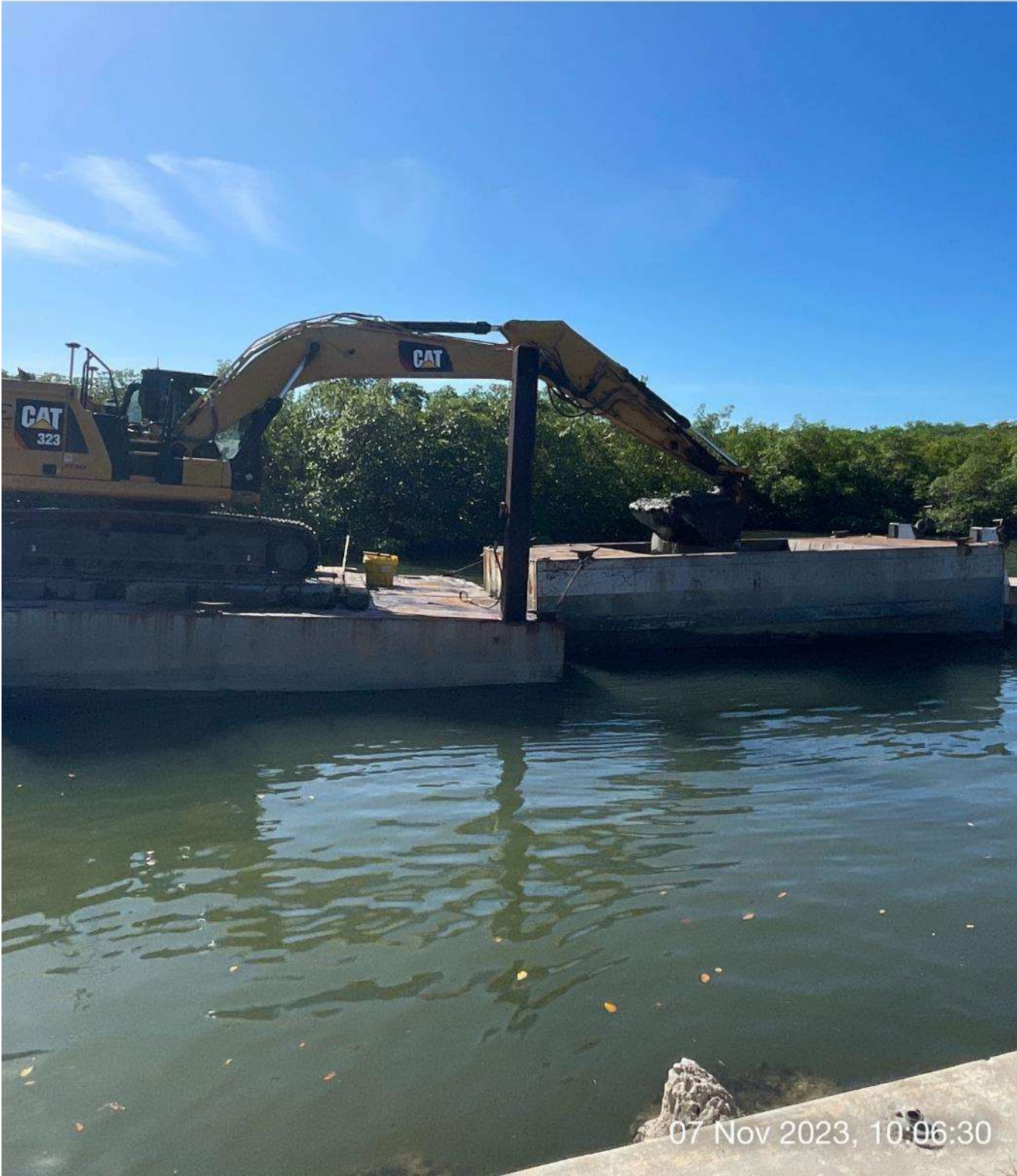
323 excavator removing sediment at station 3+50 in Canal Main B1.

☀ 179°S (T) ☉ 26°7'20"N, 81°46'57"W ±13ft ▲ 11ft