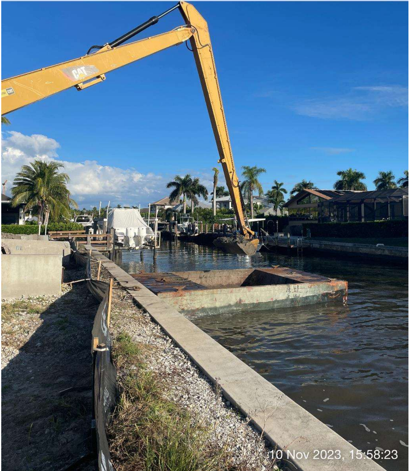
Long reach excavator removing sediment from hopper.

☀ 110°E (T) ☉ 26°8'13"N, 81°47'16"W ±13ft ▲ 17ft