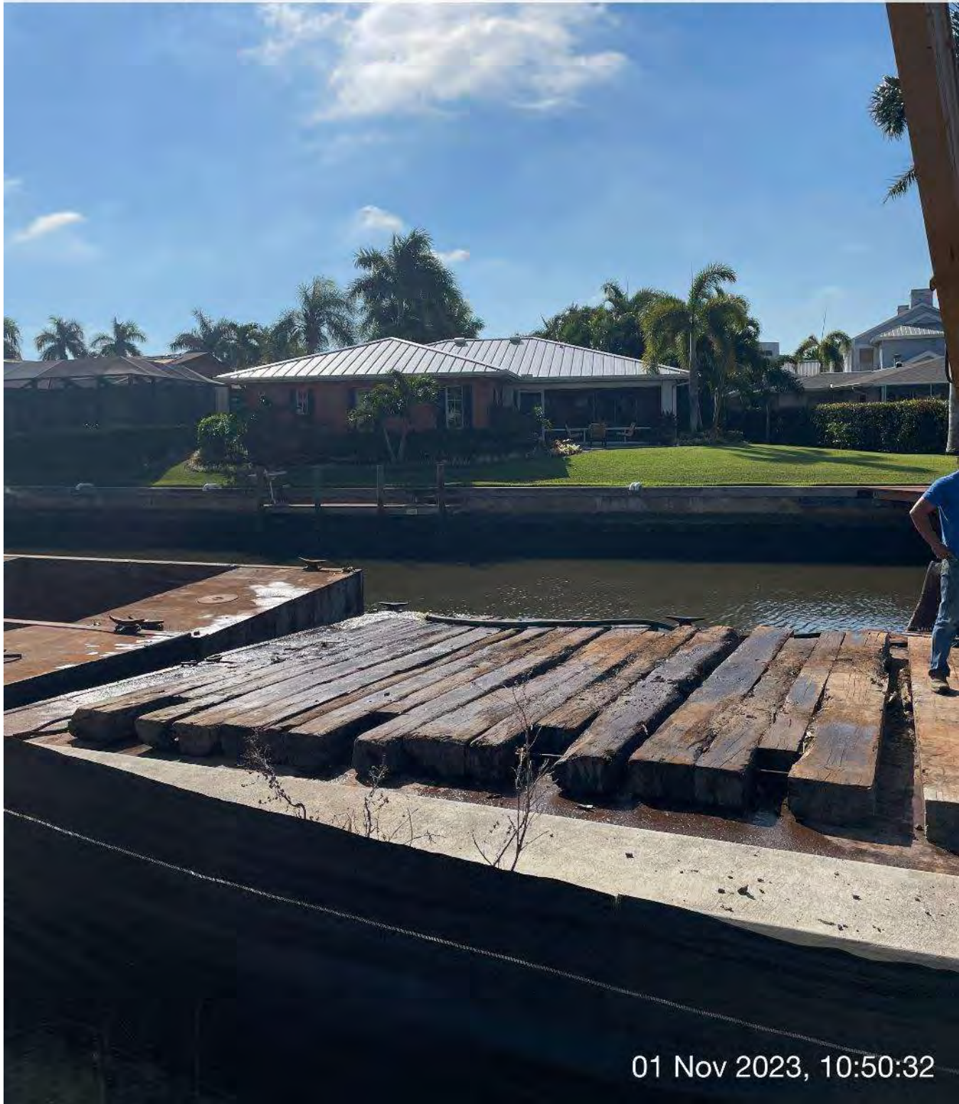
Hose pumping out water from the barge.

☉ 173°S (T) ☉ 26°8'13"N, 81°47'16"W ±16ft ▲ 12ft