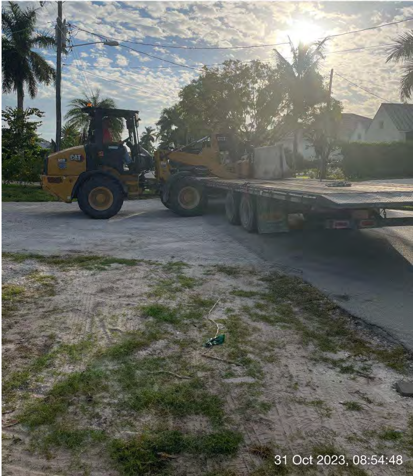
Front end loader loading jersey barriers onto trailer.

E SE S 60 90 120 150 180 129°SE (T) 26°7'38"N, 81°47'9"W ±29ft ▲ 45ft