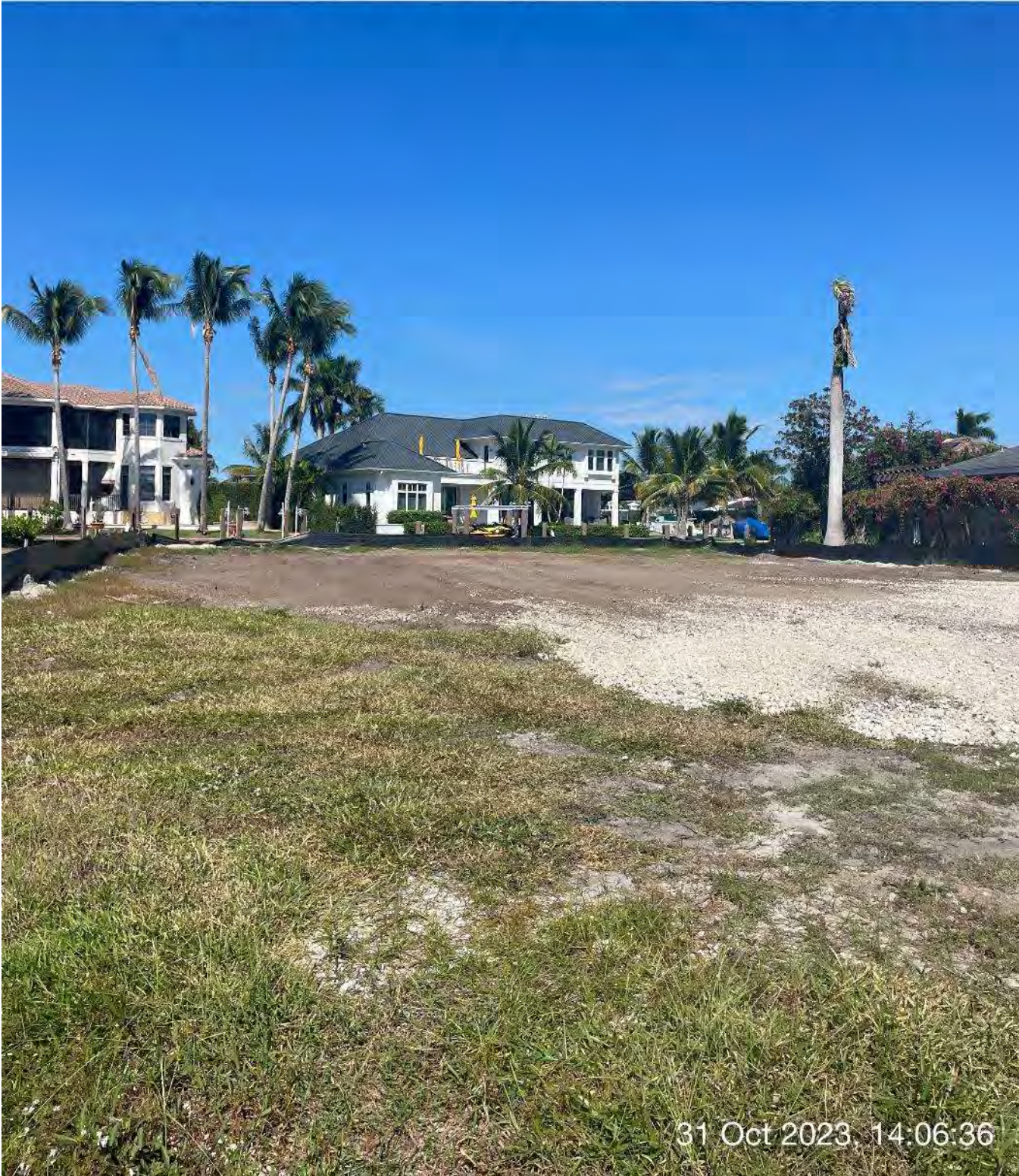
Staging area at 1387 Marlin Drive.