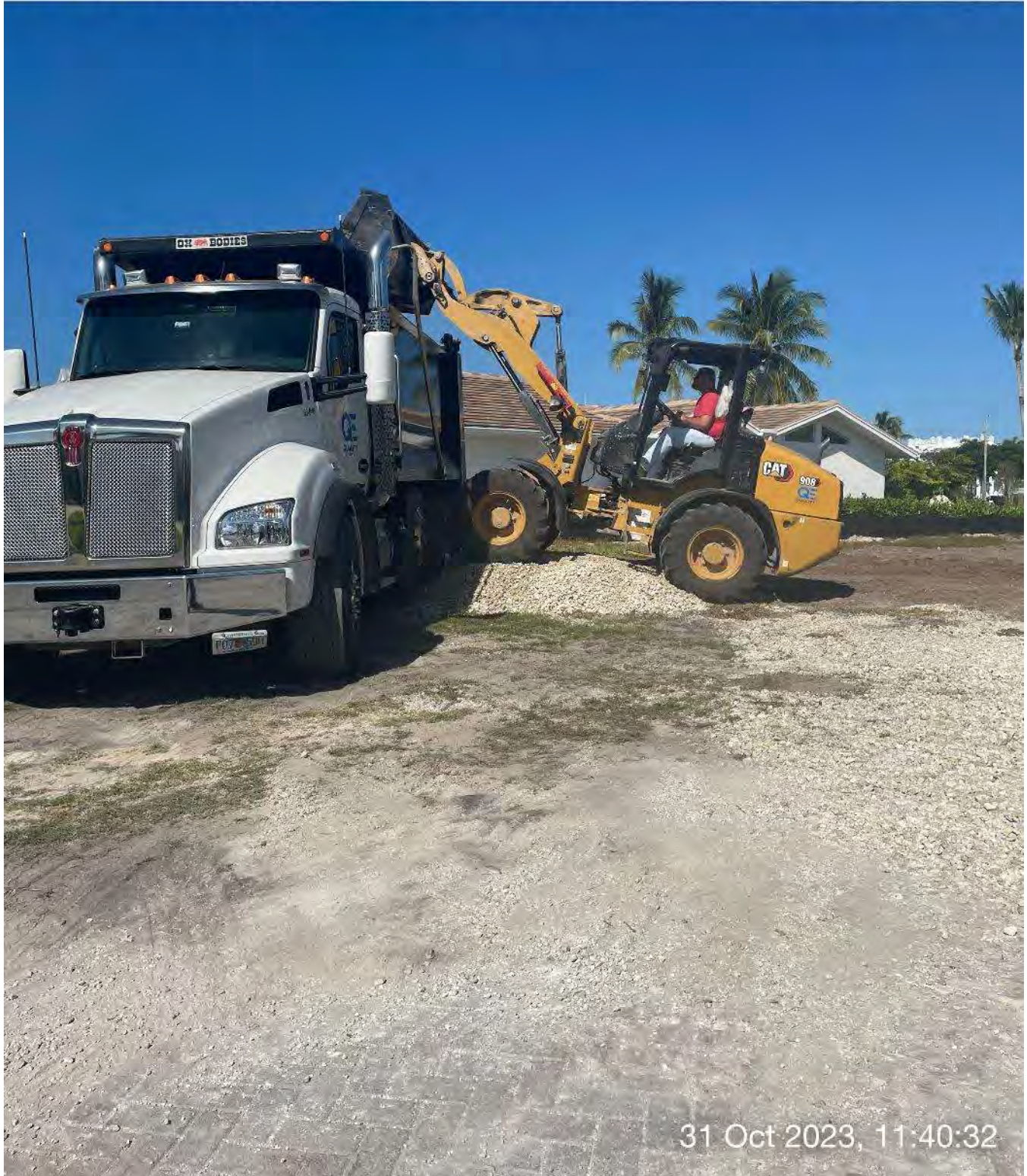
Front end loader loading dirt from staging area into dump truck.

W NW N 240 270 300 330 0 ☀ 301°NW (T) ☉ 26°7'38"N, 81°47'9"W ±13ft ▲ 8ft