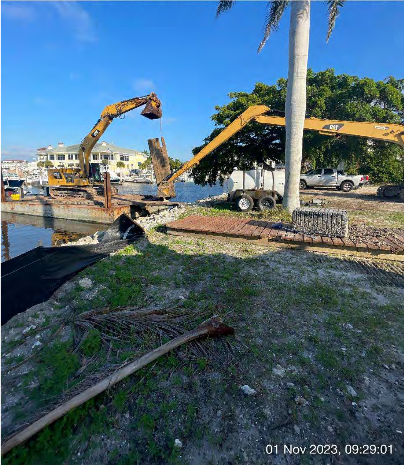
323 excavator and long reach excavator making a bridge to unload 323 excavator from barge.

W 270 NW 300 330 N 0 30 ☀ 333°NW (T) ☉ 26°8'13"N, 81°47'16"W ±13ft ▲ 8ft