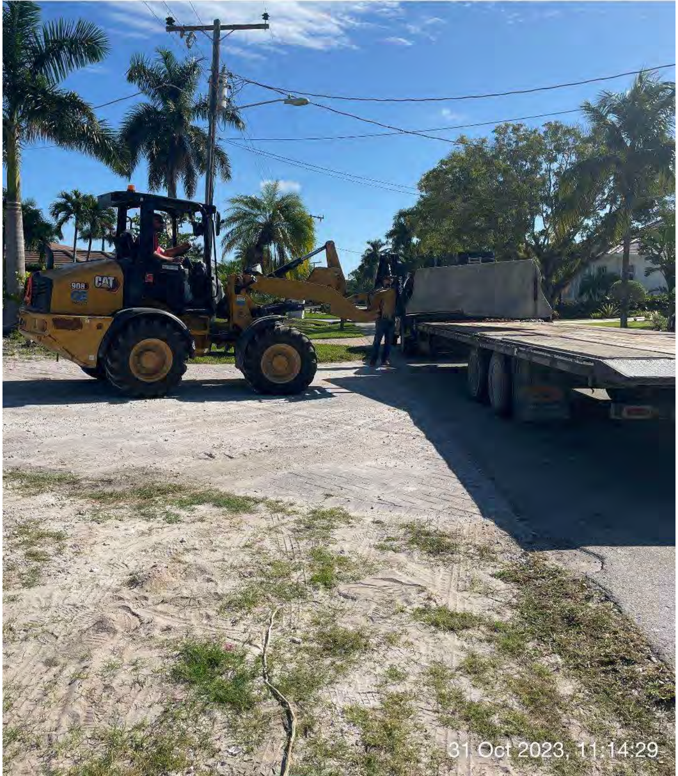
Front end loader loading jersey barriers onto trailer.

NE 60 E 90 SE 120 150 180 108°E (T) 26°7'38"N, 81°47'9"W ±13ft ▲ 15ft