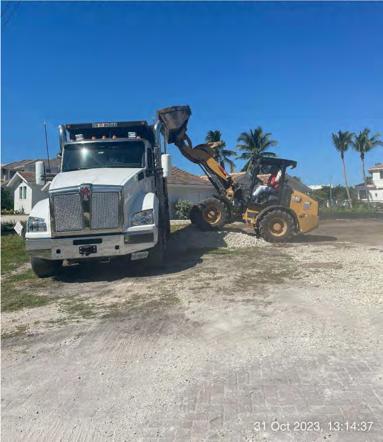
Front end loader loading dirt from staging area into dump truck.

W NW N 240 270 300 330 0 ☀ 307°NW (T) ☉ 26°7'38"N, 81°47'9"W ±13ft ▲ 8ft