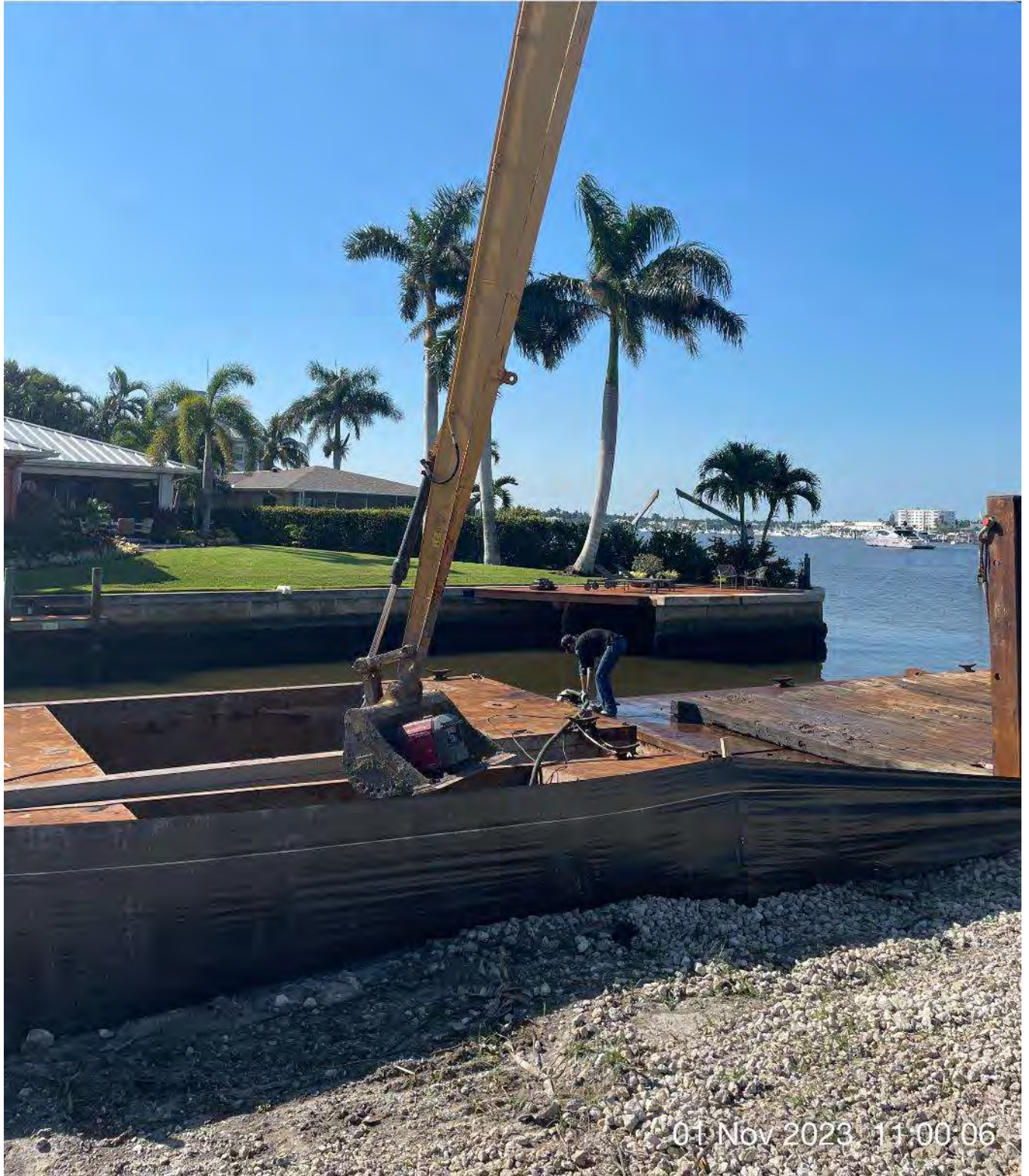
Hose pumping out water from the hoppers.

SE 150 S 180 SW 210 240 W 270 ☀ 200°S (T) ☉ 26°8'13"N, 81°47'15"W ±13ft ▲ 32ft