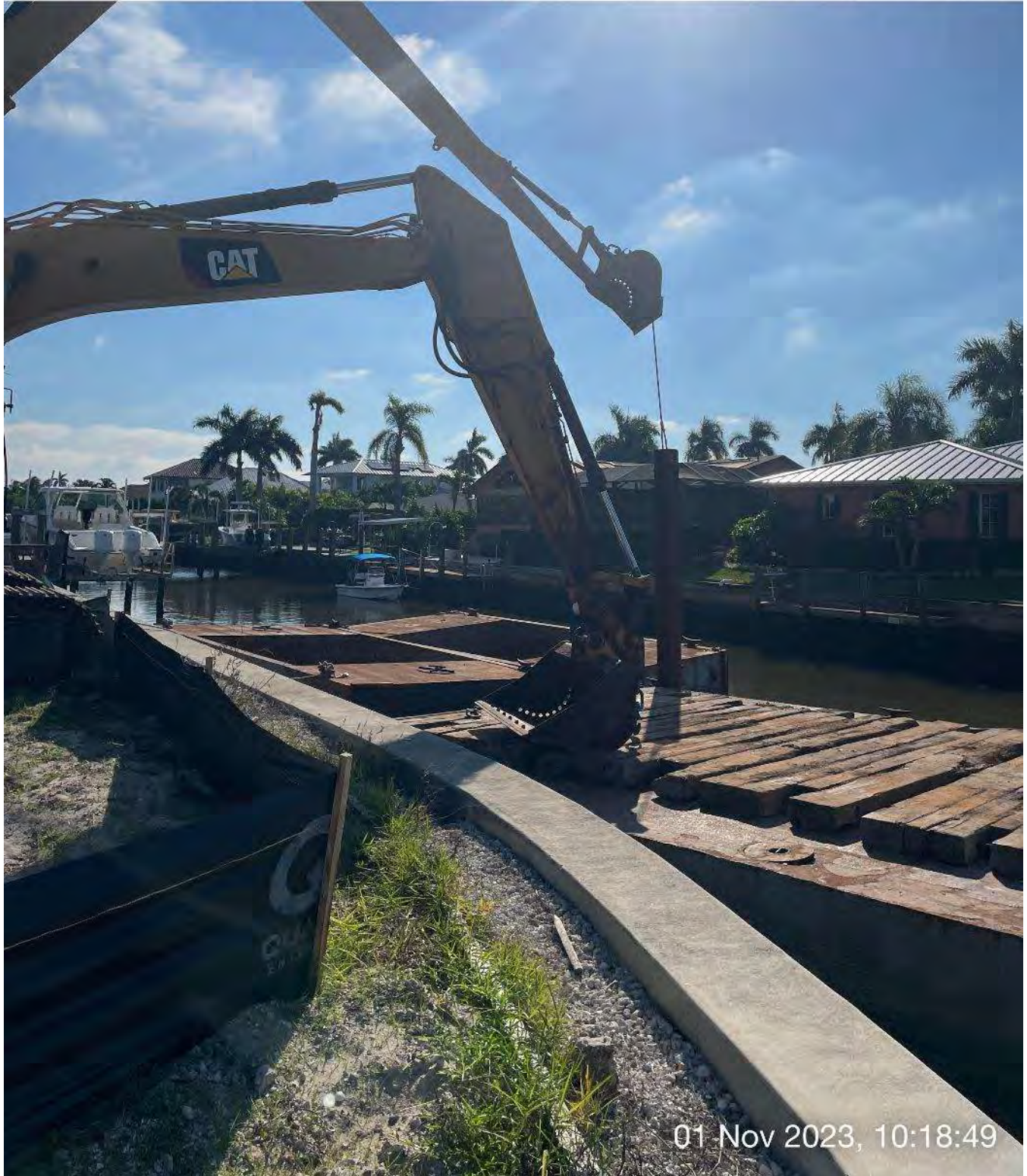
323 excavator and long reach excavator re-rigging the barge.

E 60 90 20 SE 150 180 S ☀ 118°SE (T) ● 26°8'13"N, 81°47'16"W ±9ft ▲ 10ft