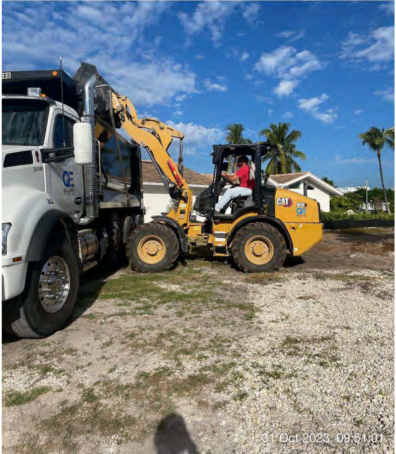
Front end loader loading dirt from staging area into dump truck.

W NW N 40 270 300 330 0 ☀ 311°NW (T) ☉ 26°7'38"N, 81°47'9"W ±13ft ▲ 16ft