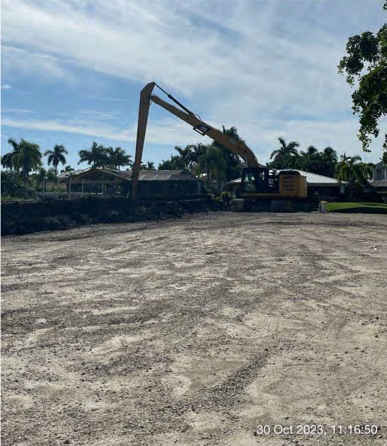
Long reach excavator separating wet and dry material on staging area at 1300 Curlew Avenue.

☀ 183°S (T) ☉ 26°8'15"N, 81°47'16"W ±9ft ▲ 26ft