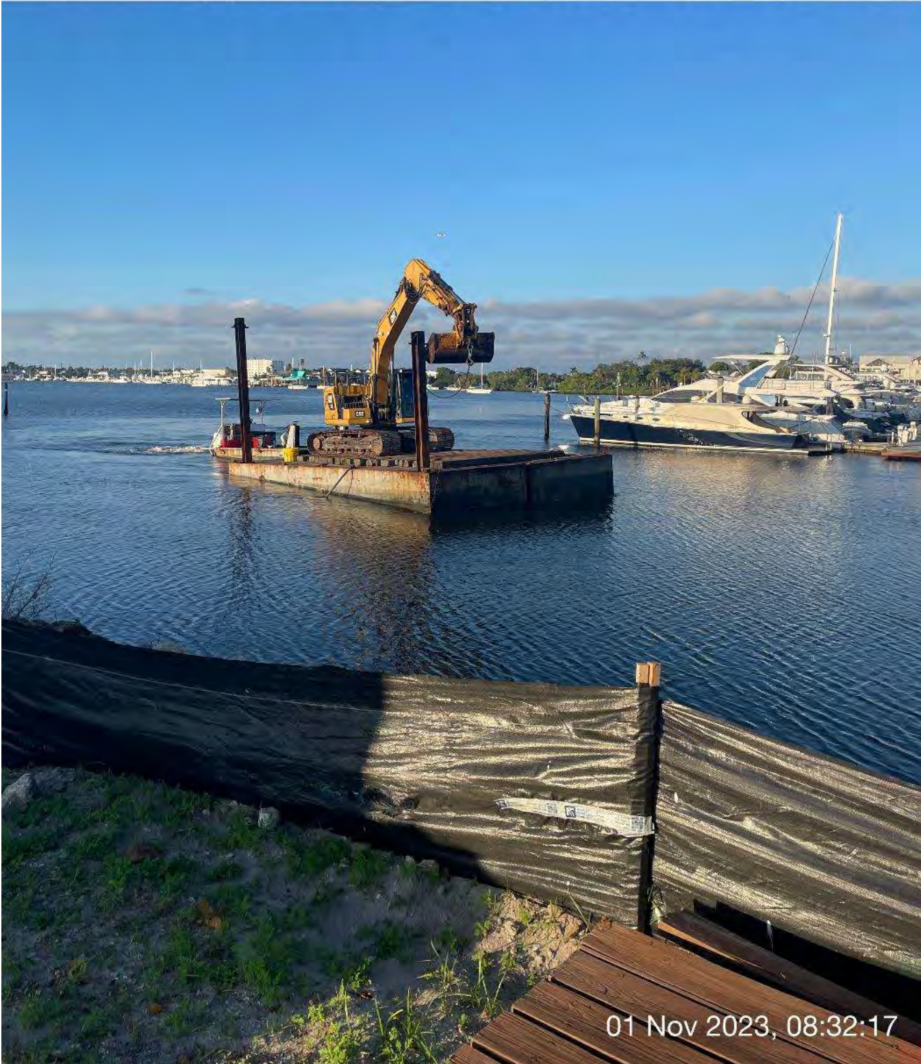
Contractor bringing equipment back to staging area at 1300 Curlew Avenue.

☀ 235°SW (T) ● 26°8'14"N, 81°47'16"W ±13ft ▲ 20ft