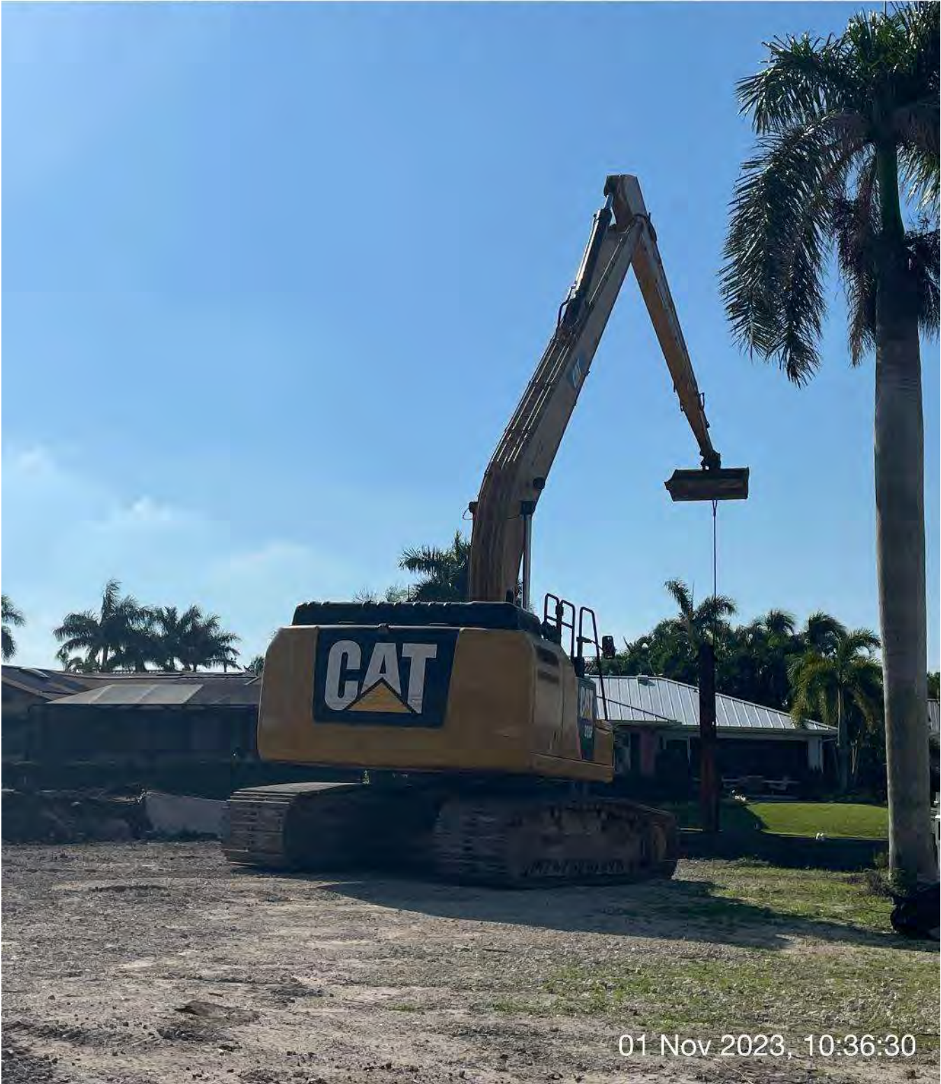
323 excavator re-rigging the barge.

☀ 158°(null) (T) ☉ 26°8'14"N, 81°47'16"W ±39ft ▲ 43ft