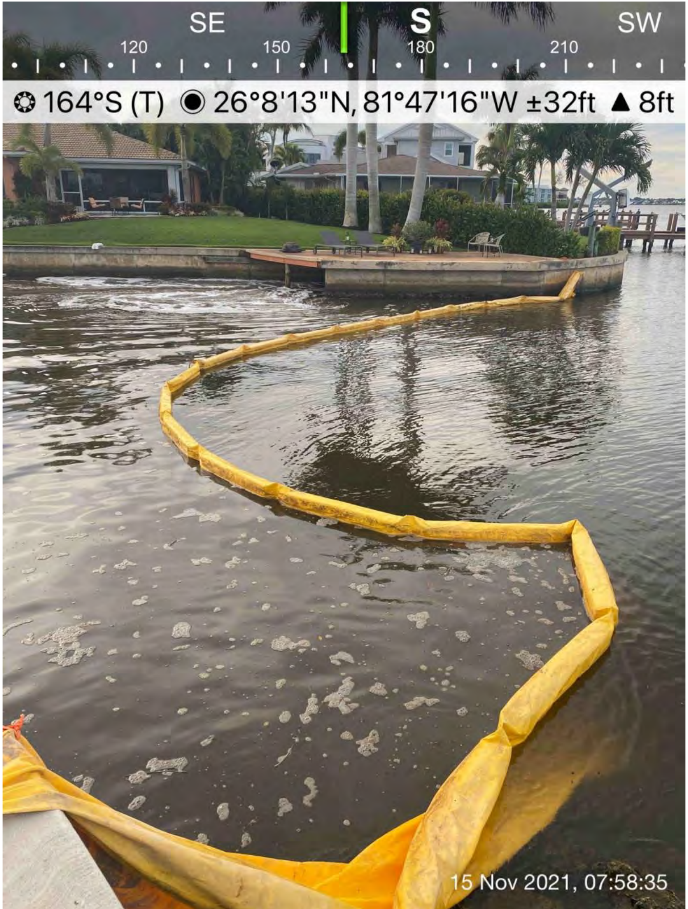
Turbidity curtain across the mouth of Canal CC-CC