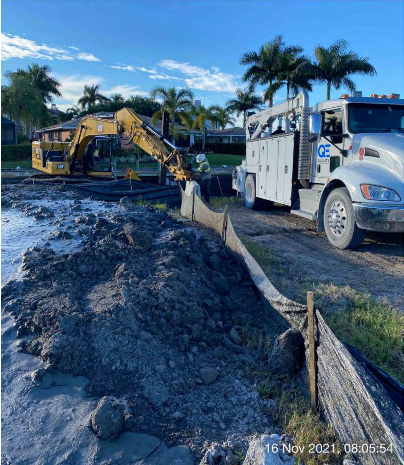
323 excavator, utility truck, and dewatering site at 1300 Curlew Avenue

☀ 173°S (T) ☉ 26°8'13"N, 81°47'16"W ±39ft ▲ 8ft