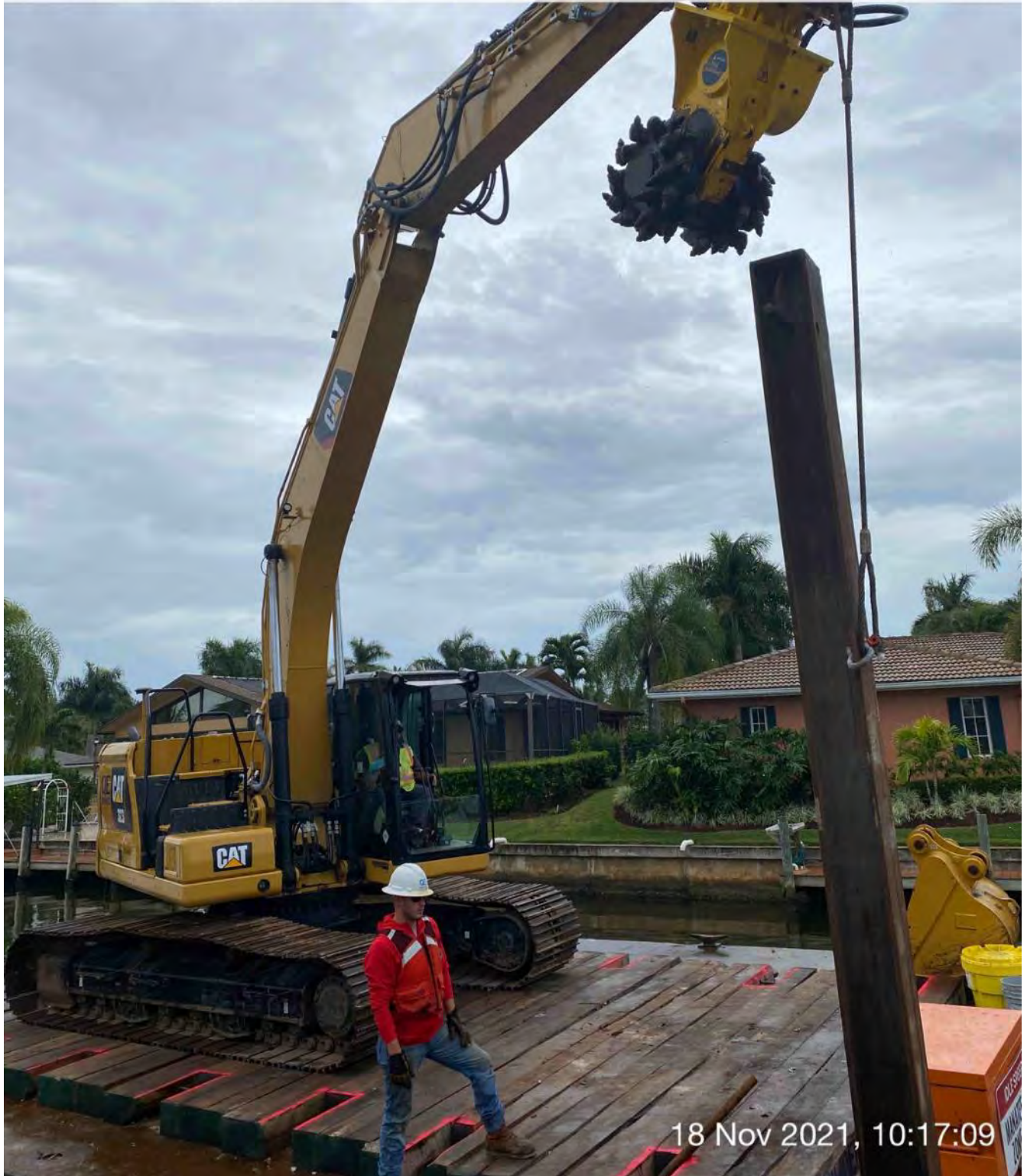
323 excavator lifting spud to allow push boat to move the barge to station 2+50

☉ 144°SE (T) ☉ 26°8'13"N, 81°47'16"W ±13ft ▲ 8ft