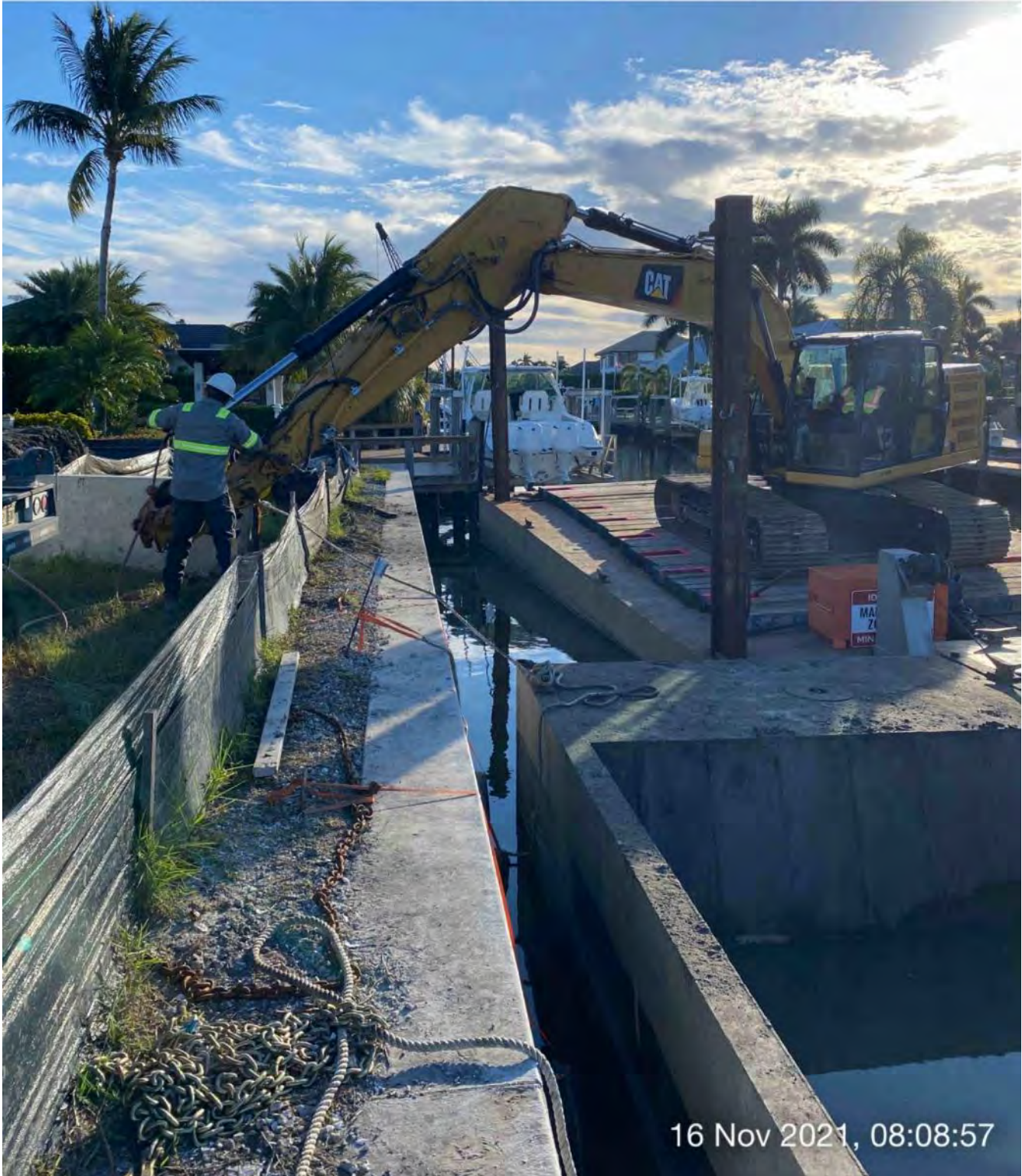
Fixing, greasing, and cleaning parts on the 323 excavator

NE E SE 30 60 90 120 150 ☀ 96°E (T) ☉ 26°8'13"N, 81°47'16"W ±26ft ▲ 8ft