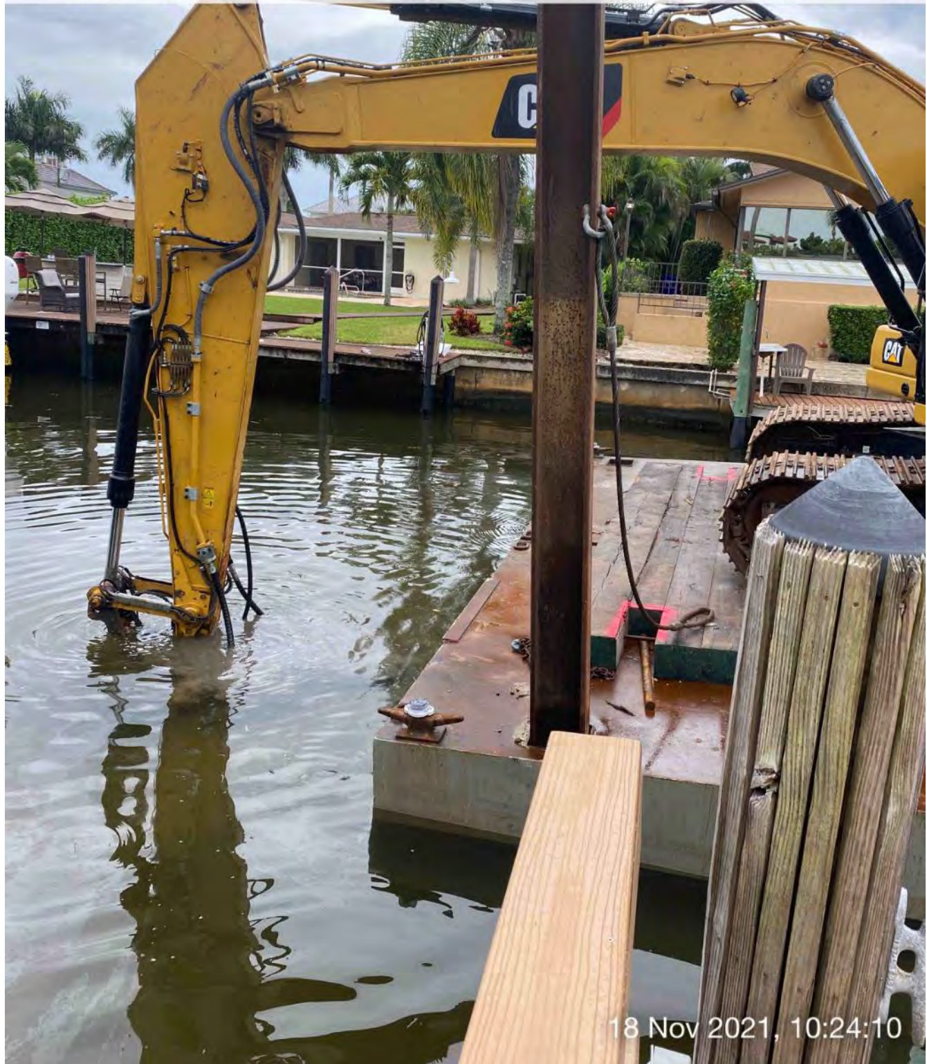
323 excavator grinding rock at station 3+00

☀ 162°S (T) ● 26°8'13"N, 81°47'14"W ±13ft ▲ 9ft