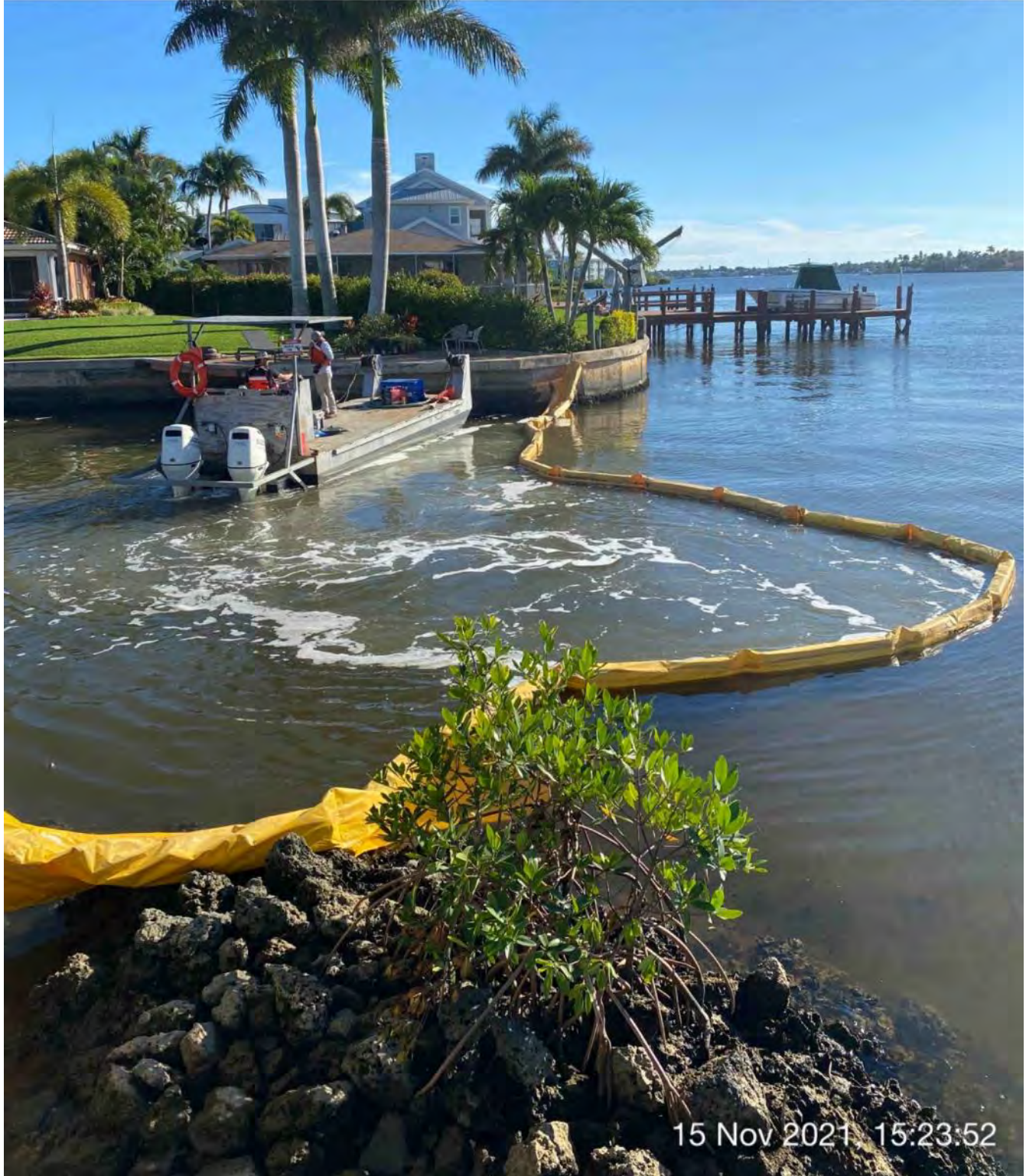
Installing turbidity curtain across the mouth of Canal CC-CC

SE S SW 120 150 80 210 240 ☀ 178°S (T) ☉ 26°8'13"N, 81°47'16"W ±13ft ▲ 7ft