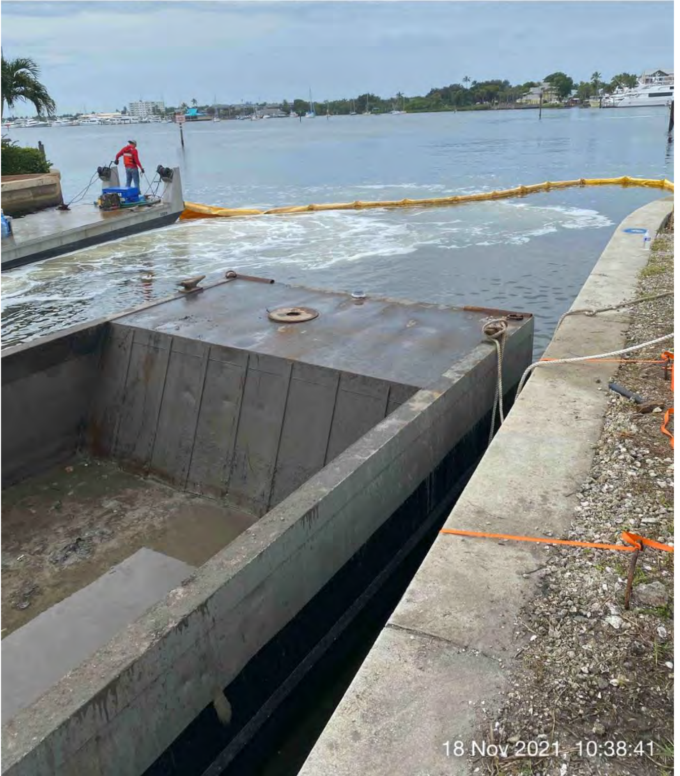
Installing turbidity curtain across the mouth of Canal CC-CC

☀ 249°W (T) ☉ 26°8'13"N, 81°47'16"W ±32ft ▲ 9ft