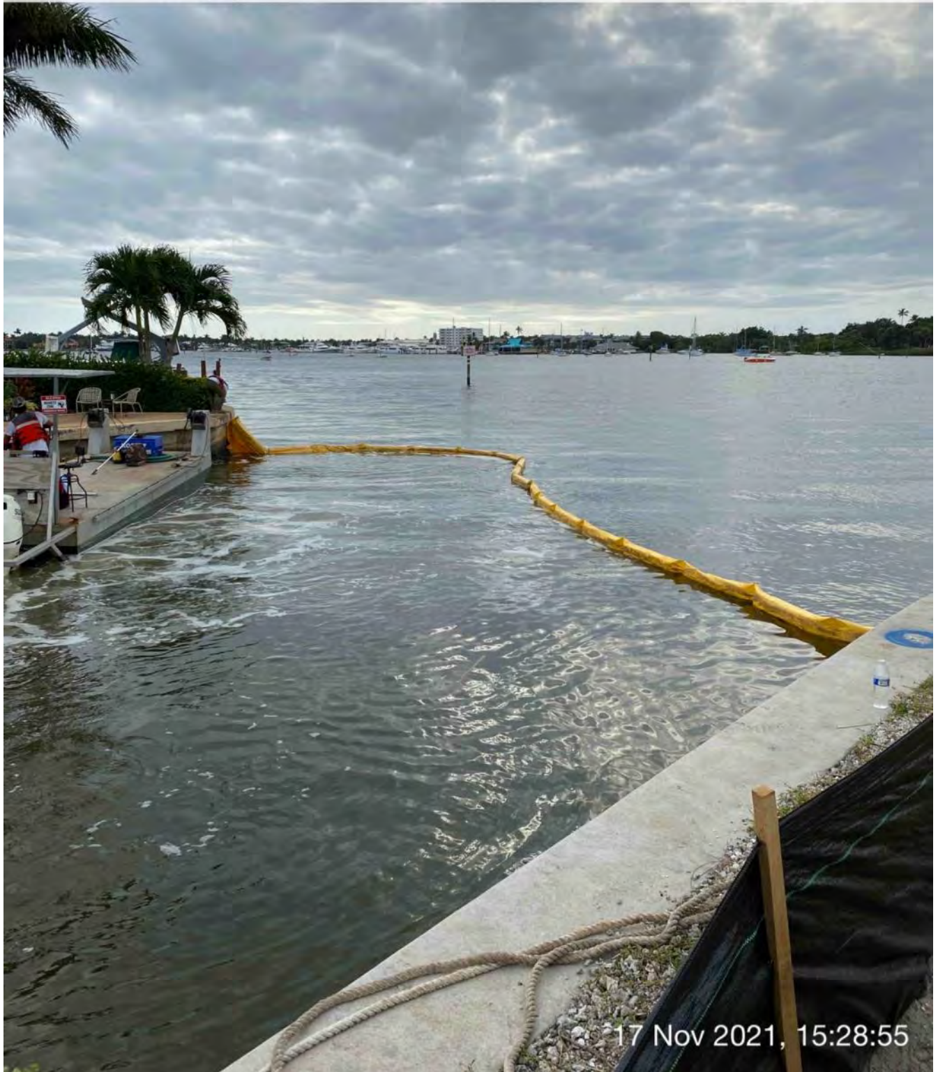
Turbidity curtain across the mouth of Canal CC-CC

S 180 SW 210 240 W 270 300 ☉ 231°SW (T) ● 26°8'13"N, 81°47'16"W ±29ft ▲ 8ft