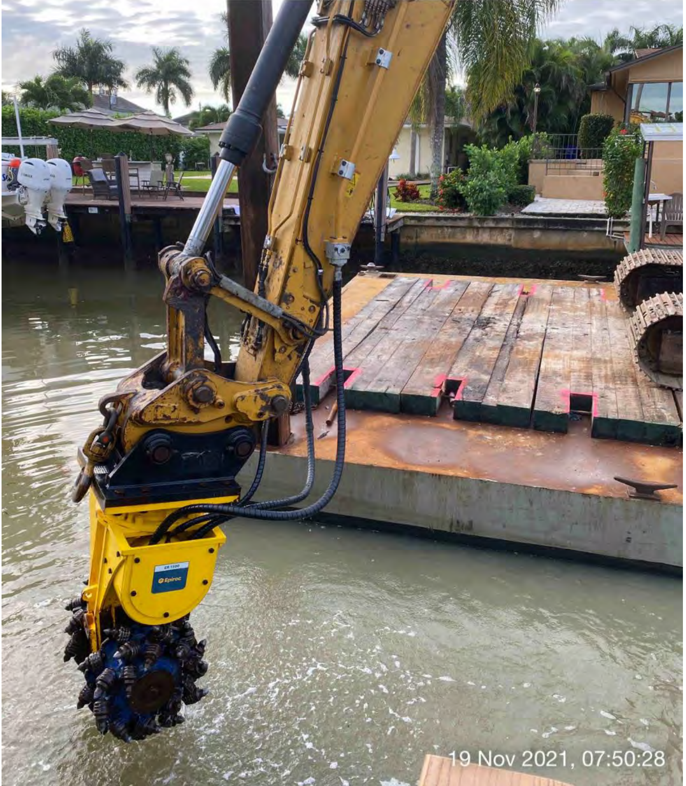
323 excavator grinding rock at station 3+00

☀ 158°S (T) ☉ 26°8'13"N, 81°47'14"W ±29ft ▲ 8ft