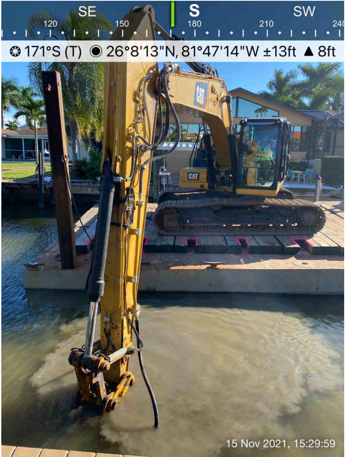
323 excavator grinding rock at station 3+00