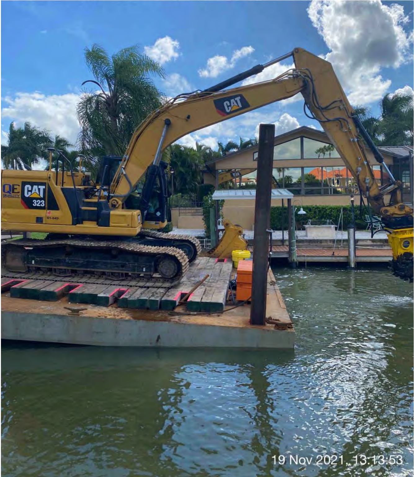
323 excavator grinding rock at station 2+50

☀ 173°S (T) ● 26°8'13"N, 81°47'14"W ±22ft ▲ 8ft