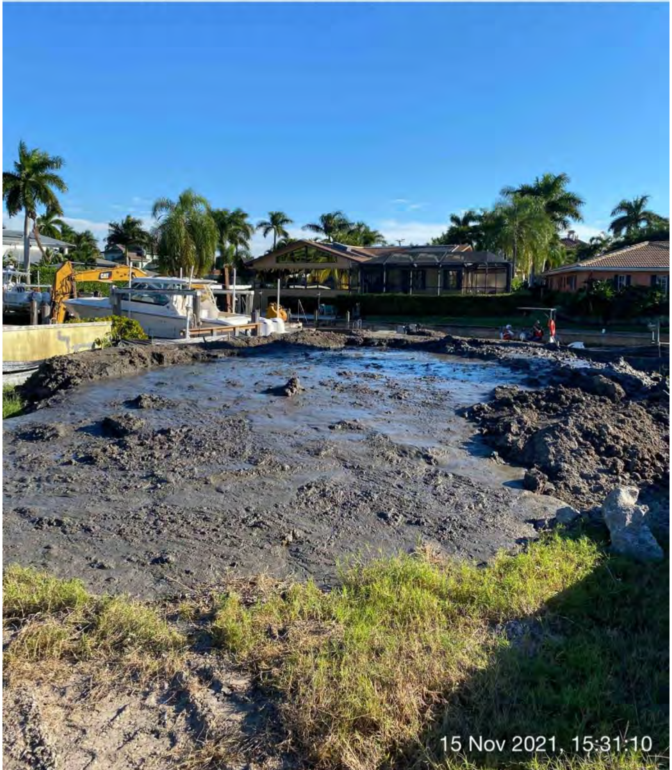
Dewatering site on the southeast side of the empty lot at 1300 Curlew Avenue

E 90 SE 120 150 S 180 210 SW ☀ 155°SE (T) ● 26°8'14"N, 81°47'15"W ±32ft ▲ 8ft