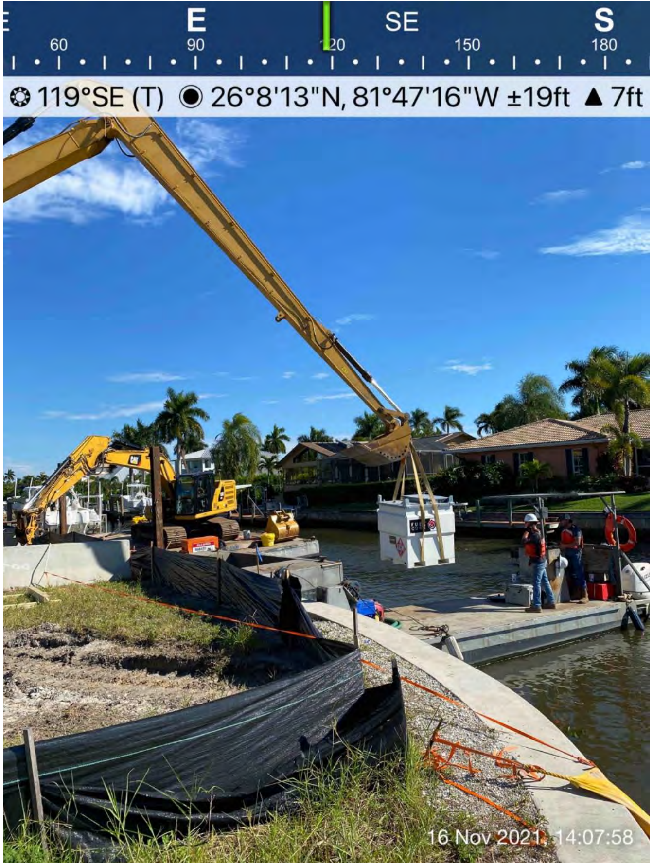
326 excavator transporting small fuel cube from push boat back to the southeast corner of 1300 Curlew Avenue