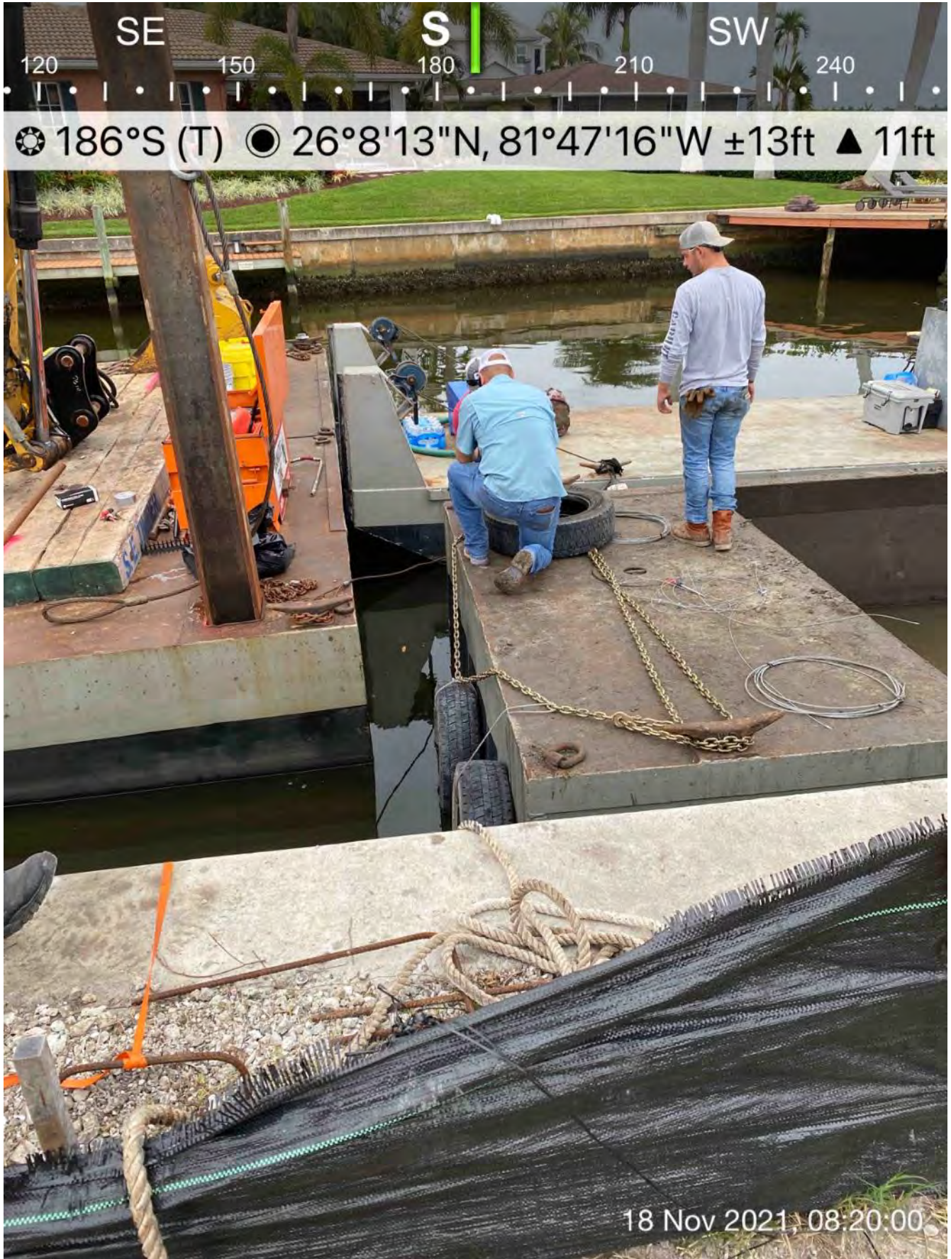
Attaching tires as buffers to the hopper