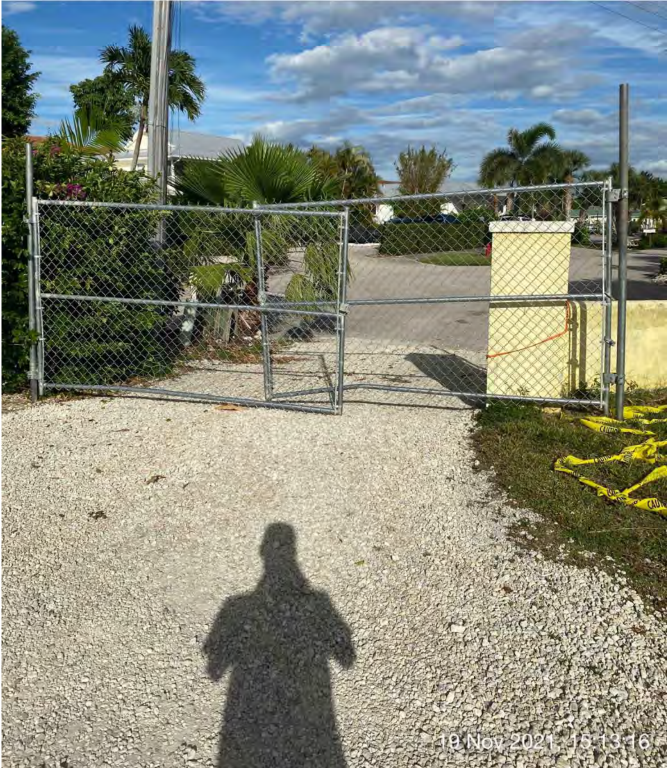
Metal fence installed at the entrance of 1300 Curlew Avenue

W 270 NW 300 330 N 0 NE 30 ☀ 337°NW (T) ☉ 26°8'14"N, 81°47'15"W ±16ft ▲ 8ft