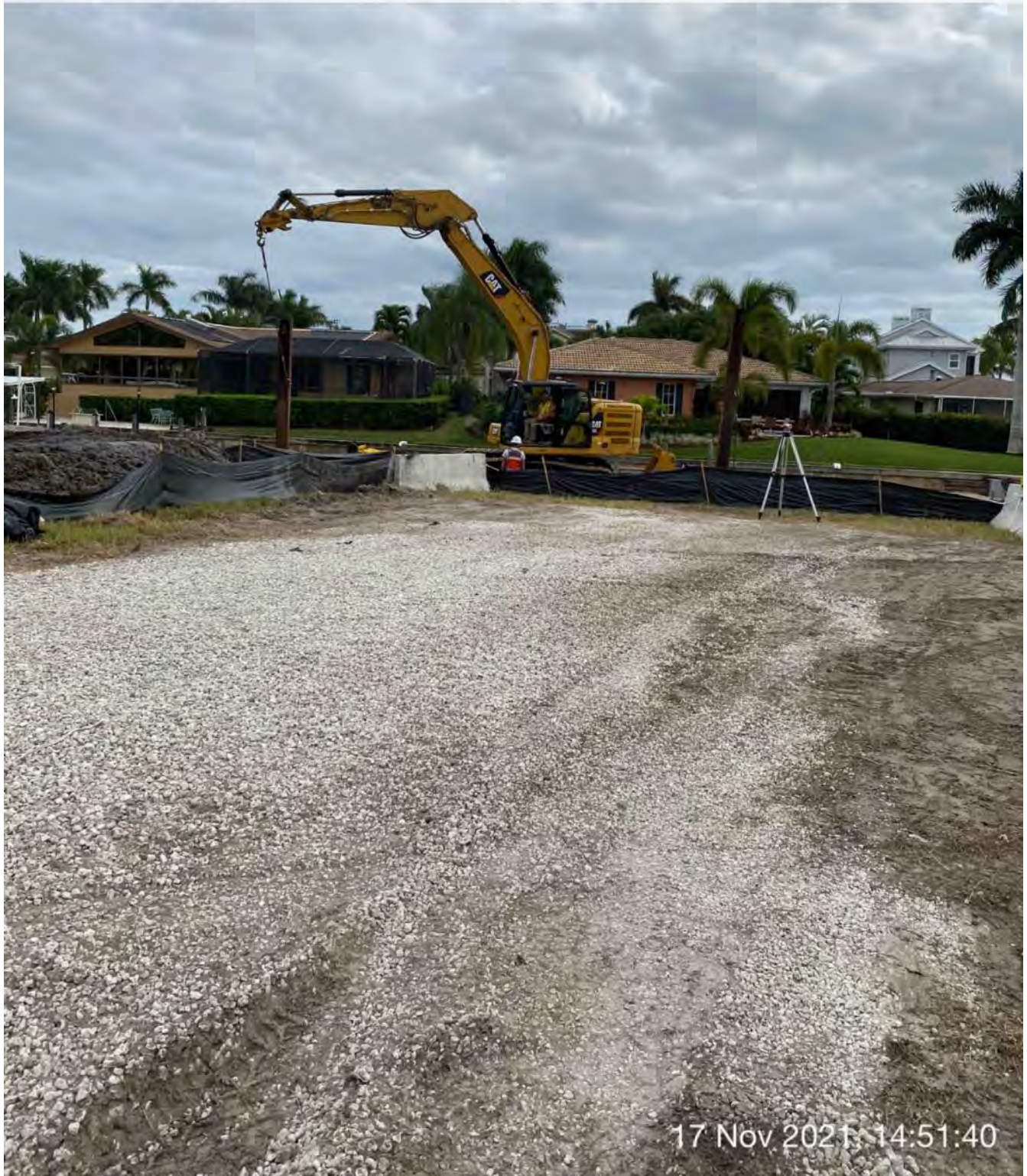
323 excavator lifting spud to allow push boat to move barge from station 1+50 to 3+50

☀ 175°S (T) ● 26°8'14"N, 81°47'16"W ±13ft ▲ 8ft