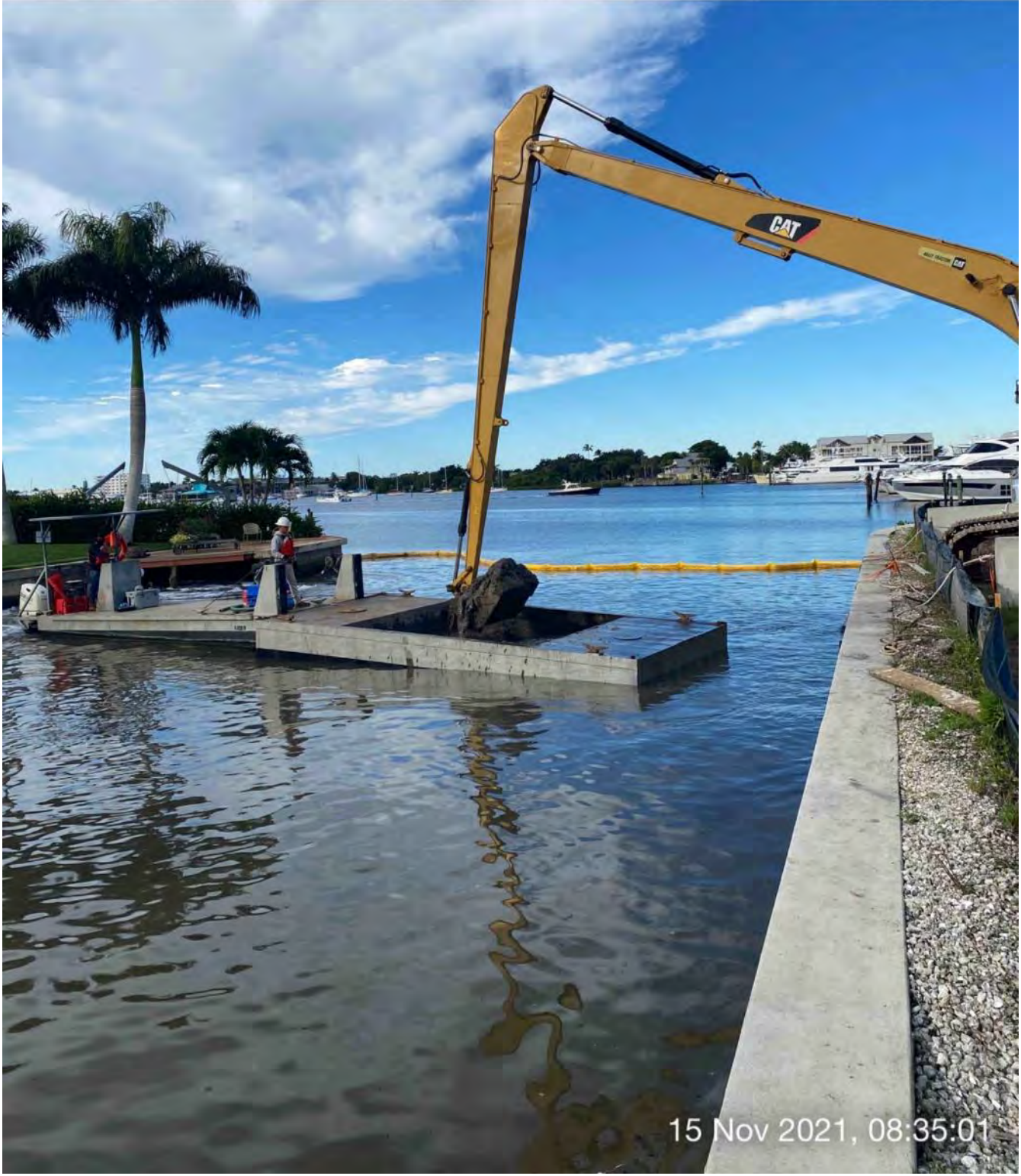
326 excavator transferring material from hopper to the dewatering site on the empty lot at 1300 Curlew Avenue

S 180 SW 210 240 W 270 NW 300 ☉ 247°SW (T) ☉ 26°8'13"N, 81°47'15"W ±13ft ▲ 8ft