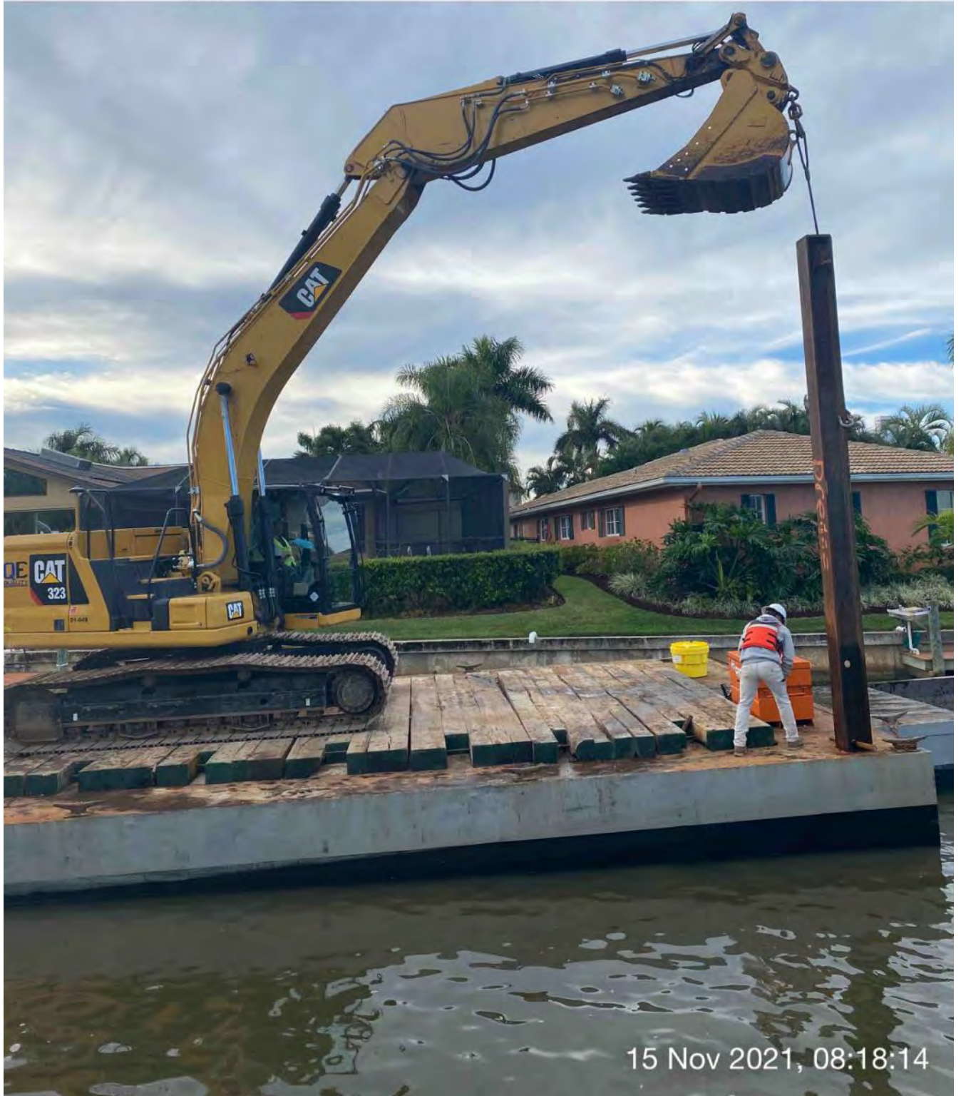
323 excavator lifting spud to allow push boat to position the barge

☀ 169°S (T) ● 26°8'13"N, 81°47'15"W ±22ft ▲ 8ft