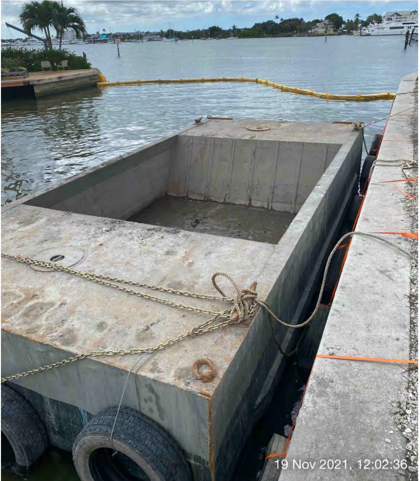
Hopper with sediment tied to the barrier walls at station 1+50 on the south side of 1300 Curlew Avenue

SW W NW 210 240 270 300 ☉ 253°W (T) ☉ 26°8'13"N, 81°47'15"W ±32ft ▲ 8ft