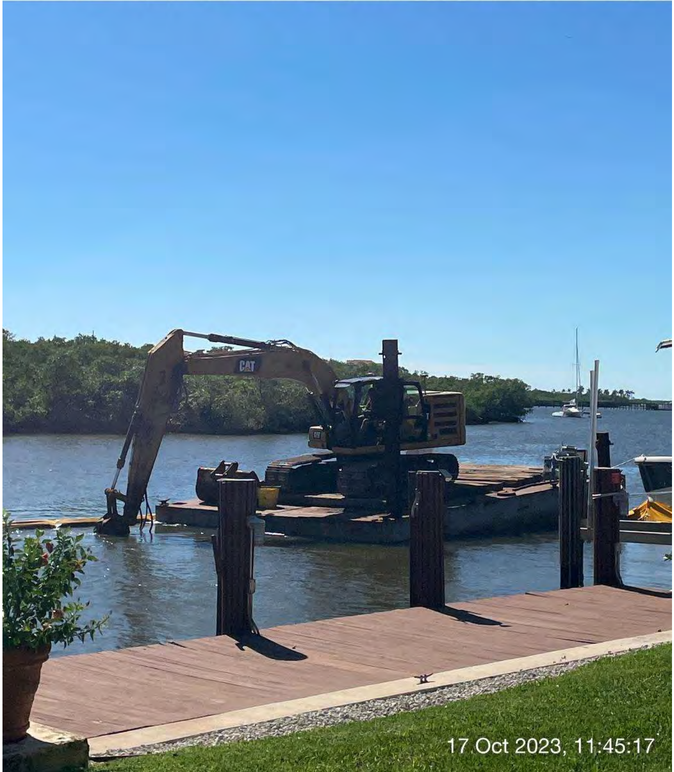
323 excavator grinding rock at station 4+00 in Canal Main B.

☀ 162°S (T) ● 26°7'18"N, 81°47'4"W ±9ft ▲ 11ft