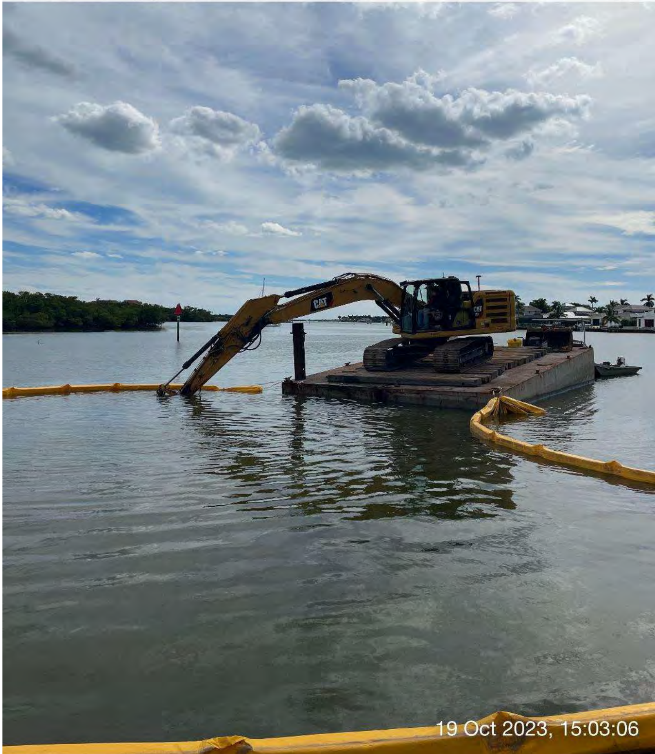
323 excavator grinding rock at station 2+75 in Canal Main B.

☉ 190°S (T) ☉ 26°7'16"N, 81°47'5"W ±13ft ▲ 28ft