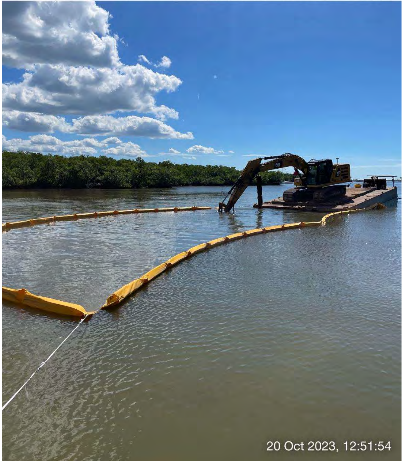
323 excavator grinding rock at station 2+25 in Canal Main B.

☀ 160°S (T) ☉ 26°7'16"N, 81°47'5"W ±13ft ▲ 21ft