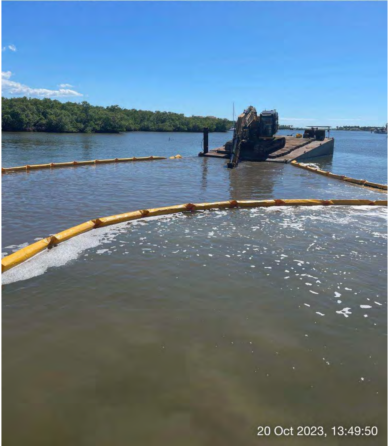
323 excavator grinding rock at station 2+25 in Canal Main B.

☉ 168°S (T) ● 26°7'16"N, 81°47'5"W ±13ft ▲ 41ft