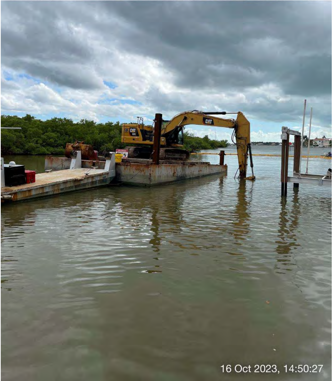
323 excavator grinding rock at station 5+50 in Canal Main B.

☀ 152°SE (T) ● 26°7'19"N, 81°47'3"W ±13ft ▲ 9ft