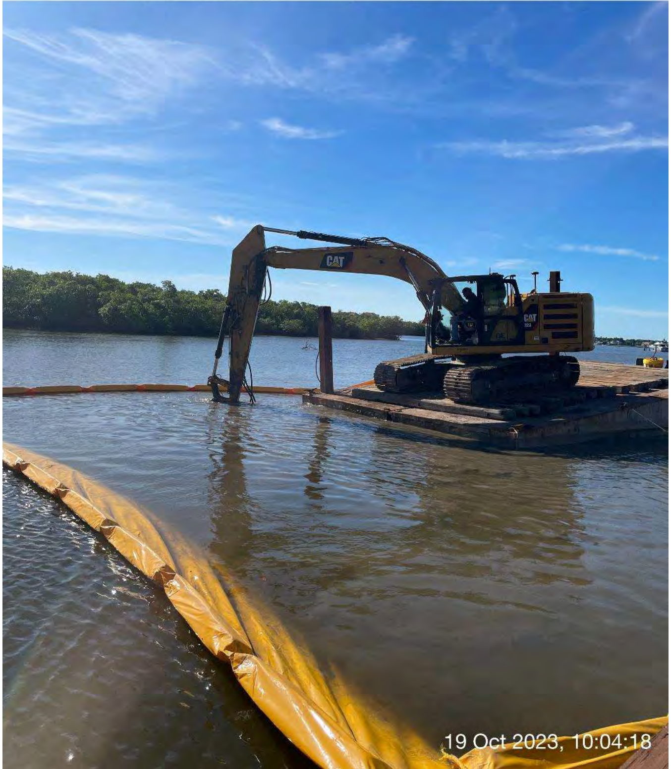
323 excavator grinding rock at station 3+00 in Canal Main B.

☉ 168°S (T) ☉ 26°7'16"N, 81°47'5"W ±9ft ▲ 15ft