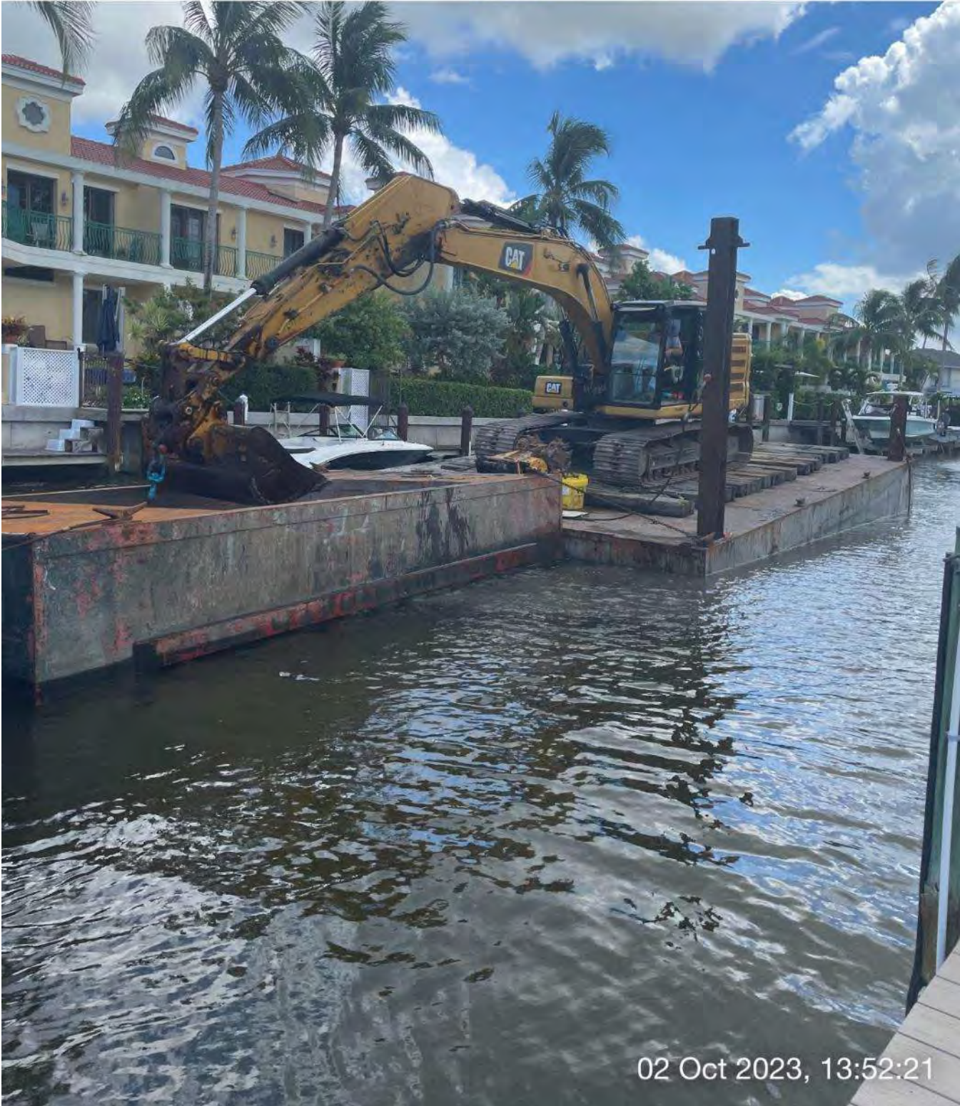
323 excavator removing sediment at station 1+50 in Canal Y-Y.

☉ 135°SE (T) ● 26°8'4"N, 81°47'10"W ±13ft ▲ 36ft