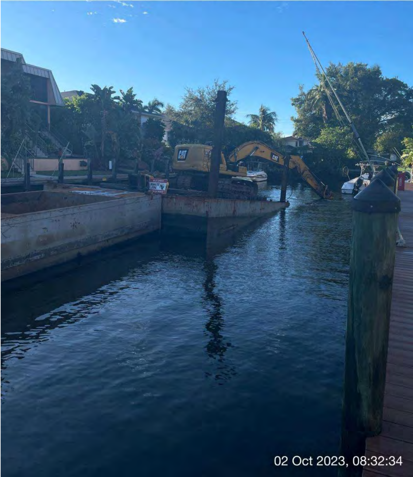
323 excavator removing sediment at station 3+00 in Canal Z-Z.

☀ 153°SE (T) ● 26°8'2"N, 81°47'6"W ±13ft ▲ 48ft