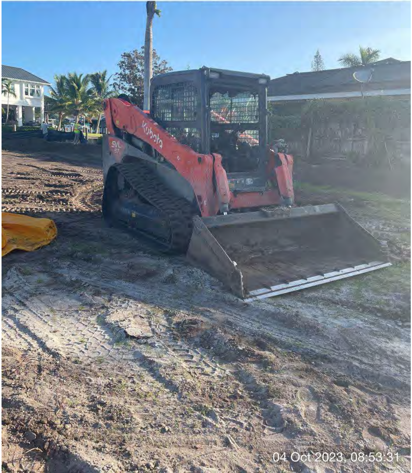
Skid steer at staging area at 1387 Marlin Drive.

☀ 40°NE (T) ● 26°7'39"N, 81°47'9"W ±13ft ▲ 13ft