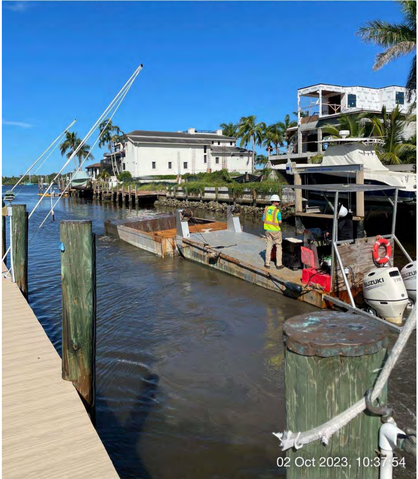
Push boat moving hopper to staging area.