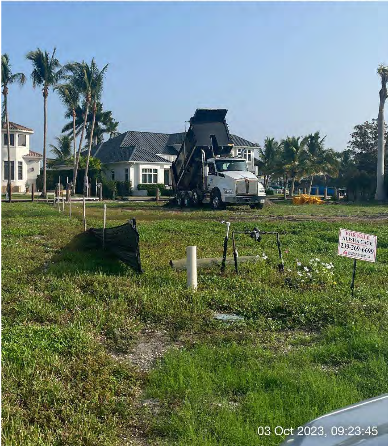
Contractor delivering dirt to staging area at 1387 Marlin Drive.

☀ 10°N (T) ☉ 26°7'38"N, 81°47'10"W ±13ft ▲ 10ft