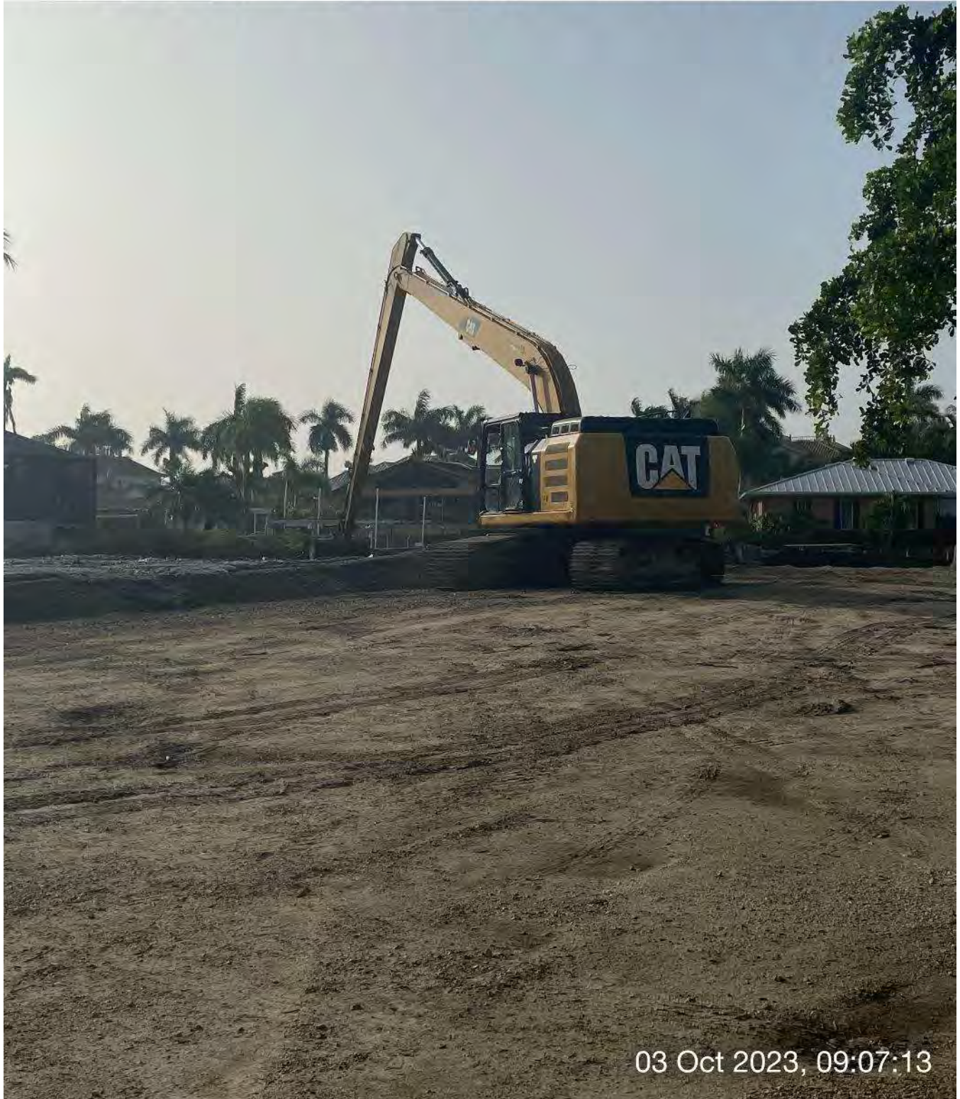
Contractor spreading dredged material at the staging area at 1300 Curlew Avenue.

☉ 151°SE (T) ● 26°8'15"N, 81°47'16"W ±9ft ▲ 6ft