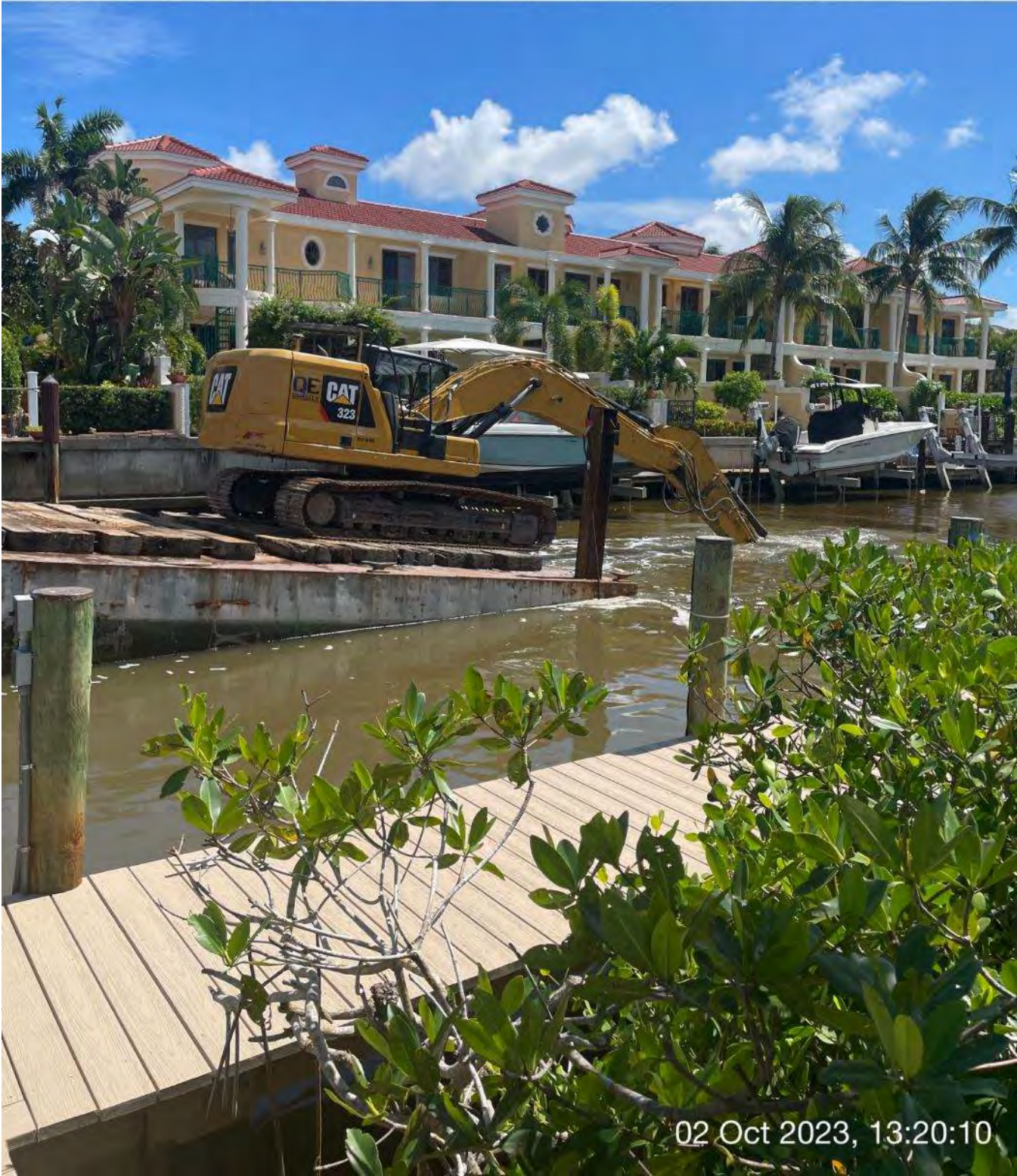
323 excavator removing sediment at station 2+00 in Canal Y-Y.

☀ 116°SE (T) ● 26°8'3"N, 81°47'11"W ±13ft ▲ 6ft