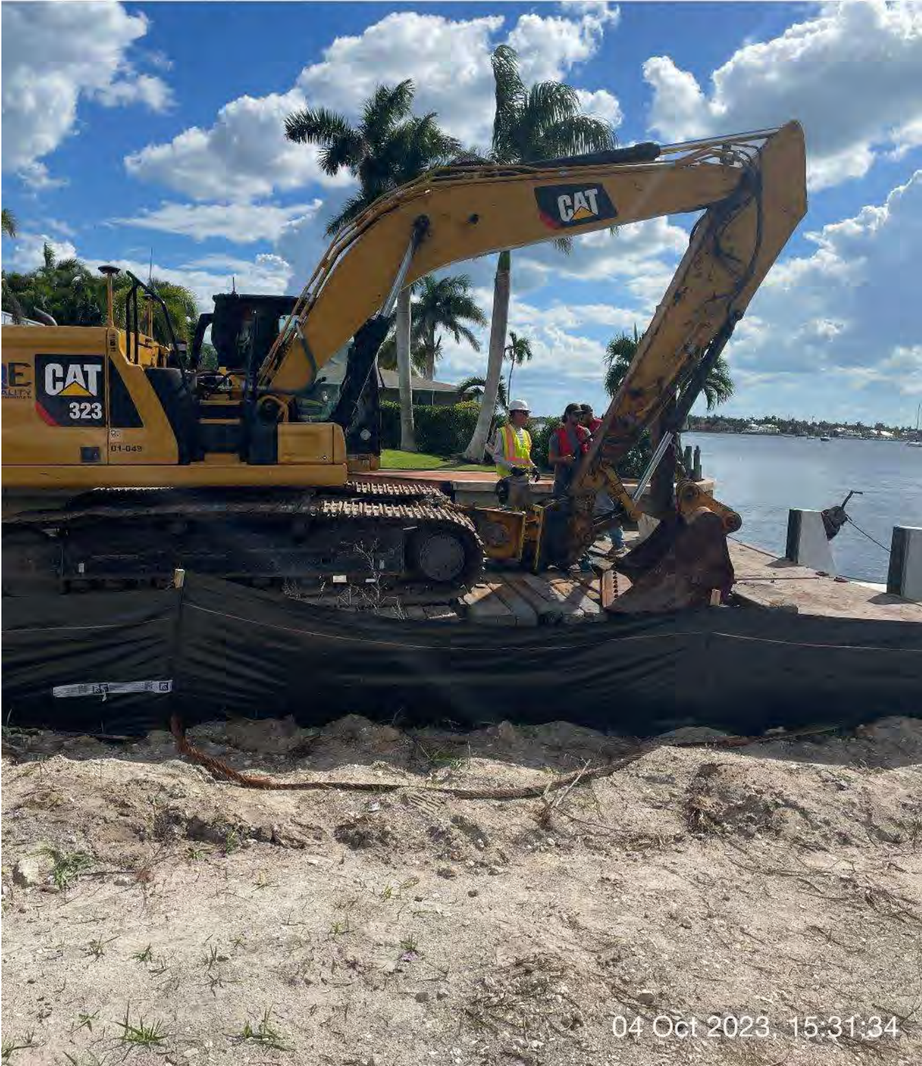
Contractor putting grinder head on 323 excavator.

S 180 SW 210 240 W 270 ☀ 224°SW (T) ☉ 26°8'14"N, 81°47'16"W ±187ft ▲ 11ft