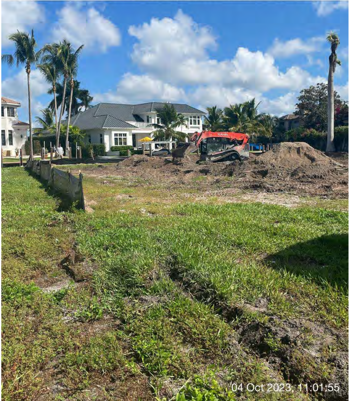
Contractor constructing the staging area.

☀ 16°N (T) ● 26°7'38"N, 81°47'10"W ±13ft ▲ 9ft