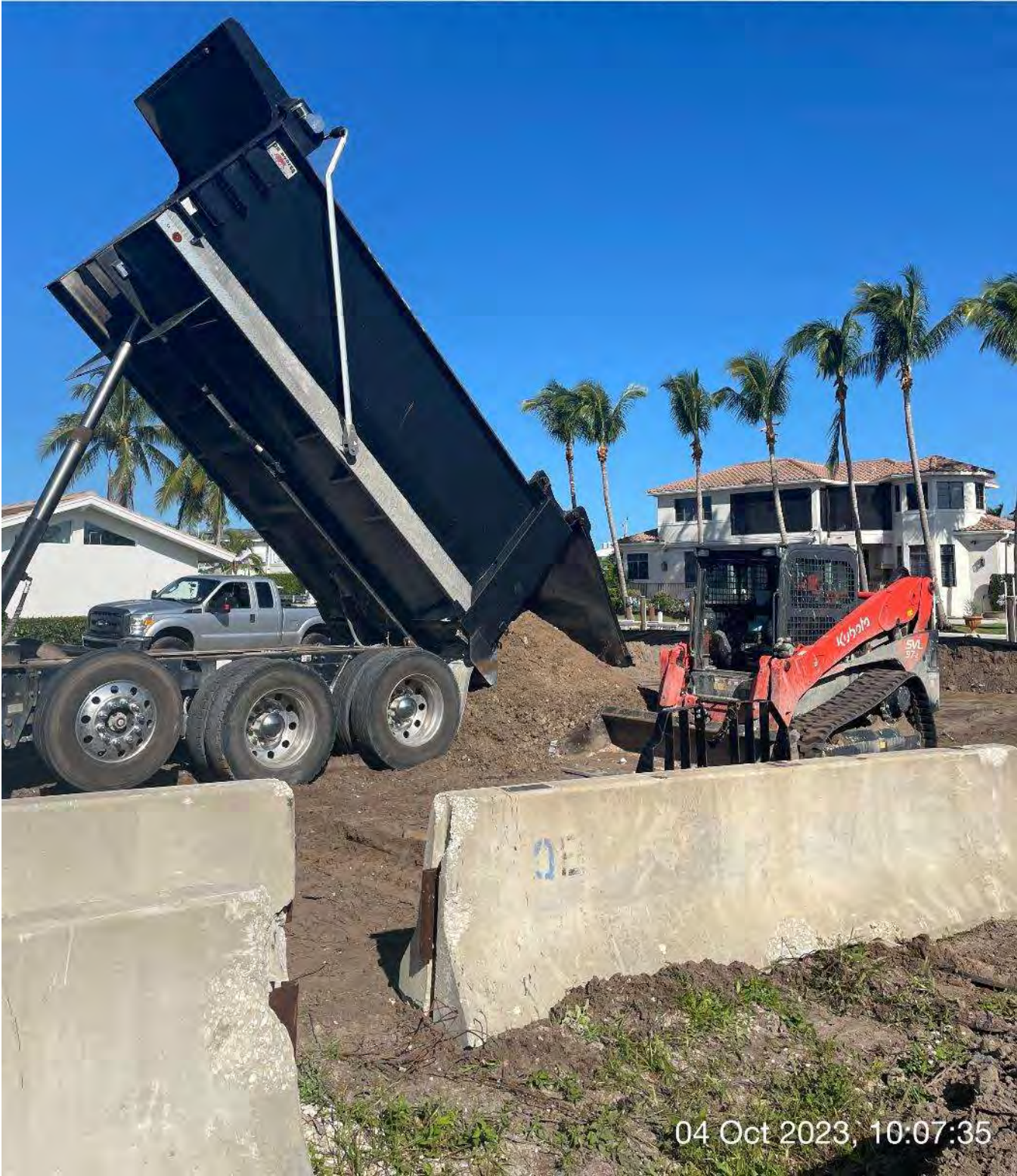
Contractor delivering dirt to staging area.

W 270 NW 300 N 330 0 ☉ 314°NW (T) ☉ 26°7'39"N, 81°47'9"W ±13ft ▲ 12ft