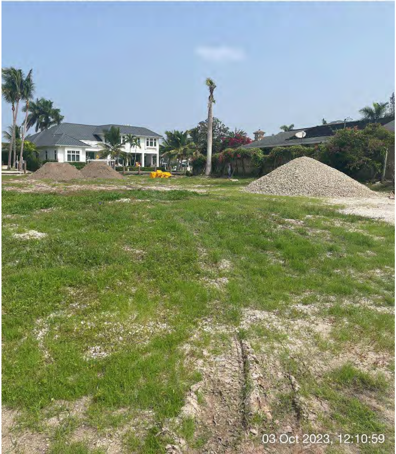
Gravel delivered by contractor at staging area at 1387 Marlin Drive.

☀ 18°N (T) ● 26°7'38"N, 81°47'9"W ±13ft ▲ 28ft