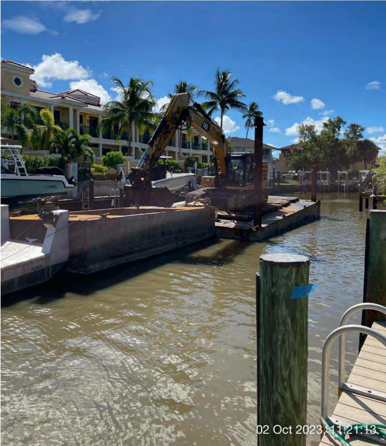
323 excavator removing sediment at station 3+00 in Canal Y-Y.

E 90 SE 120 150 S 180 210 ☀ 149°SE (T) ● 26°8'2"N, 81°47'10"W ±9ft ▲ 25ft