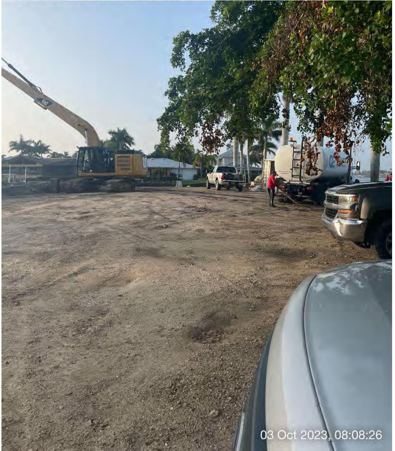
Contractor refilling water tank.

☀ 200°S (T) ☉ 26°8'15"N, 81°47'16"W ±9ft ▲ 7ft