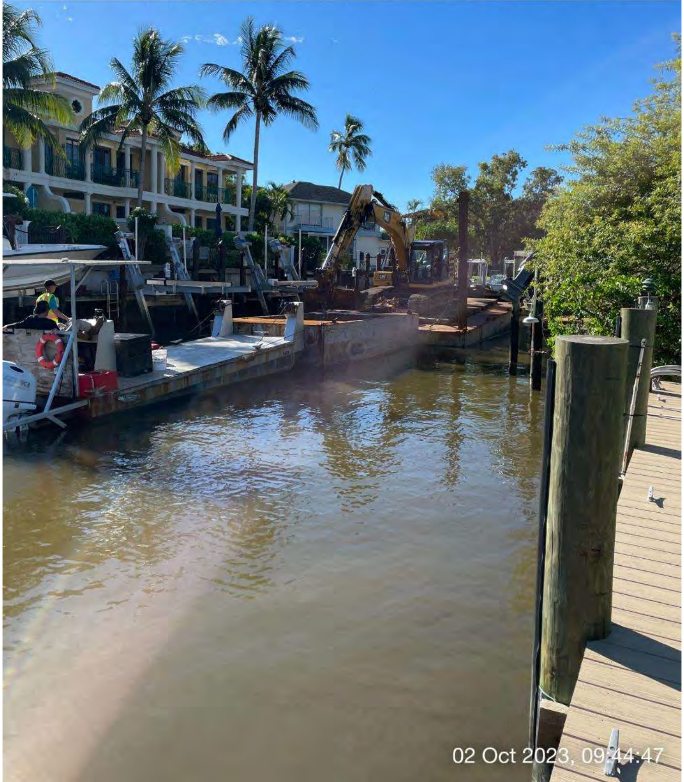
323 excavator removing sediment at station 4+00 in Canal Y-Y.

☀ 151°SE (T) ● 26°8'2"N, 81°47'10"W ±13ft ▲ 11ft