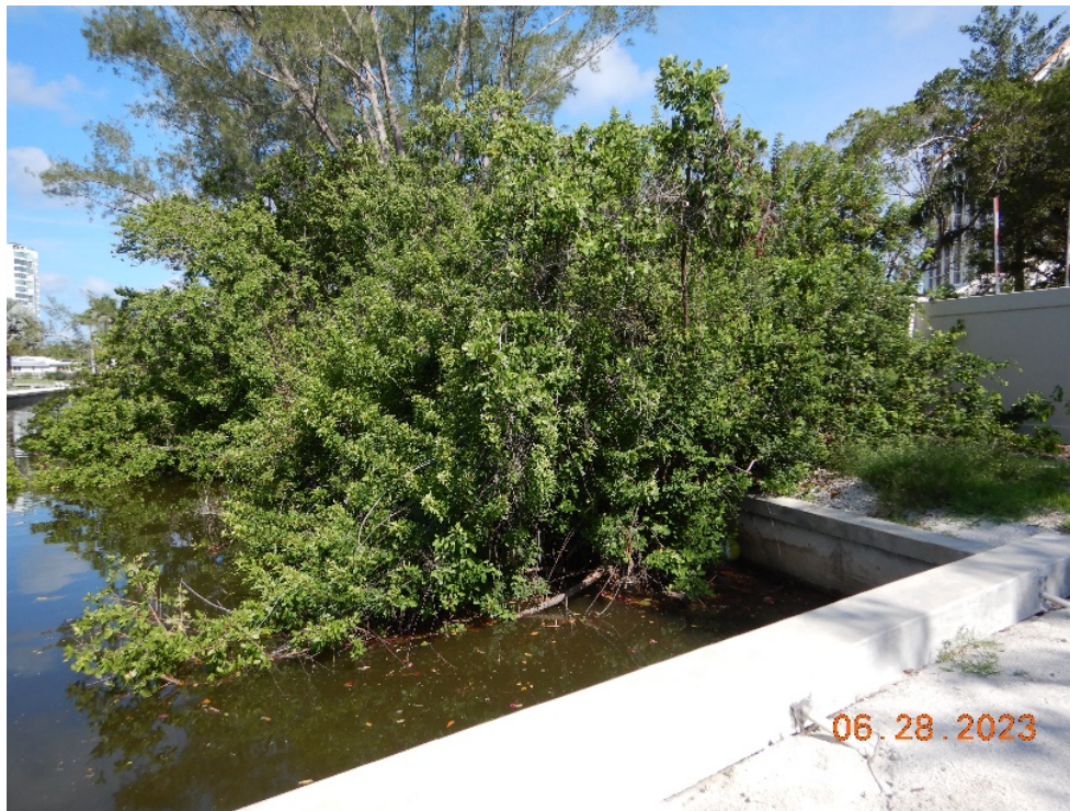
Brazilian pepper on easternmost side of the parcel