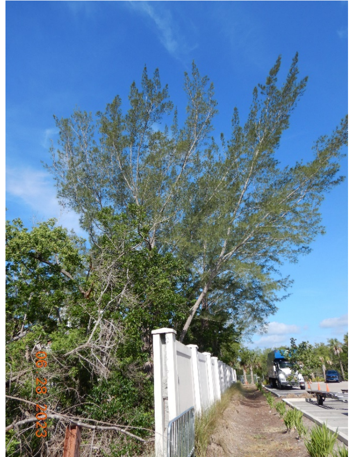
Large Australian Pines to be removed throughout the parcel