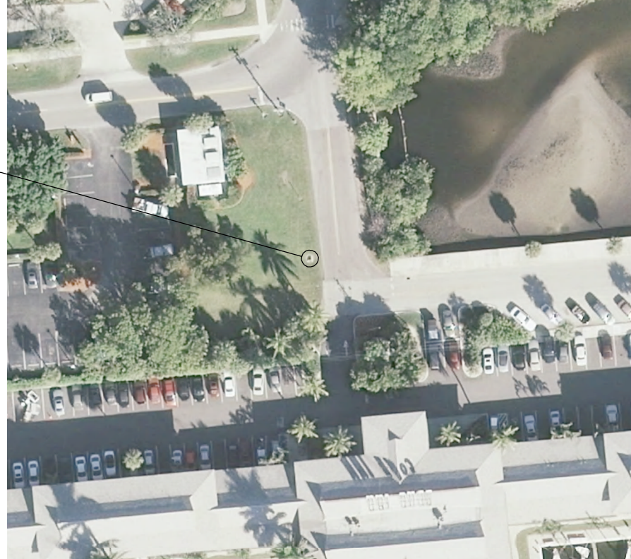
FLUIDS DISPOSAL 1"= 40'-0"

CONTRACTOR TO USE STORMWATER CATCH BASIN FOR DISPOSAL OF DRILLING FLUIDS AFTER SETTLING AND IN ACCORDANCE WITH ALL APPLICABLE REGULATIONS