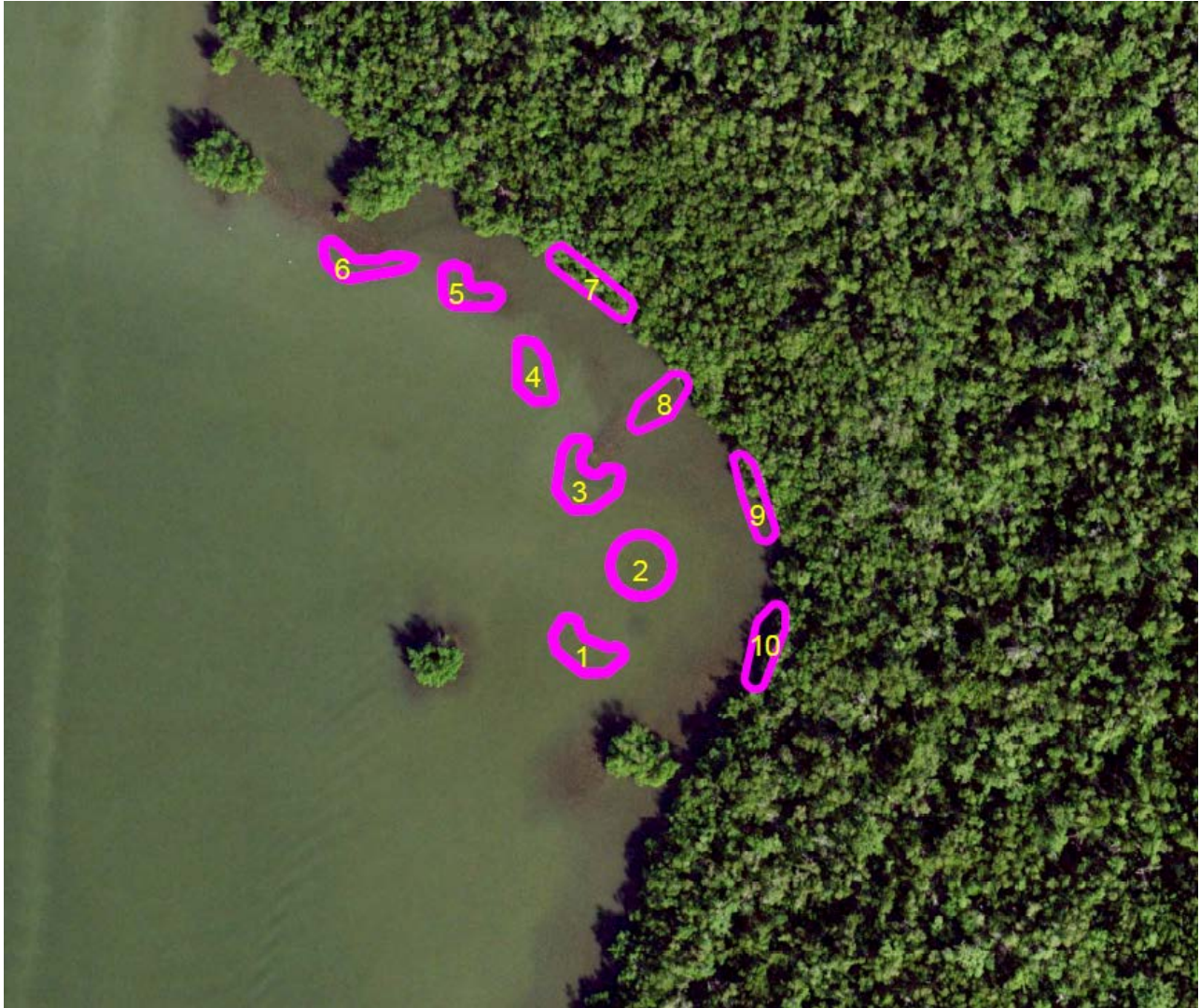
Figure 2: Site 2 Oyster Reefs with Numbers