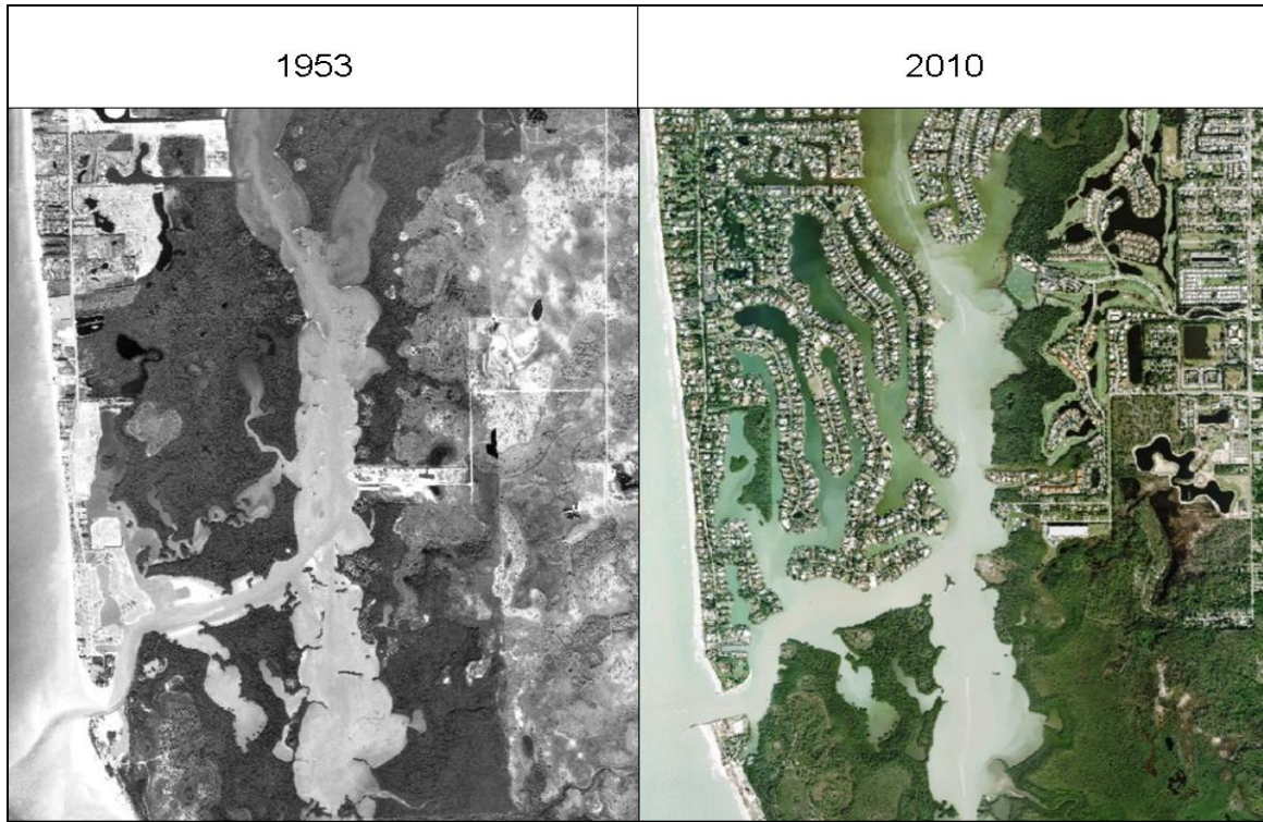
Five decades of change in Naples Bay (Laakkonen, 2014).