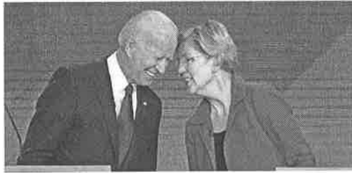
Former Vice President Joe Biden and Sen. Elizabeth Warren, D-Mass., talk Thursday during a Democratic debate in Houston.

WASHINGTON — Joe Biden is the Democratic front-runner. And there were moments in Thursday night's debate when he looked the part.