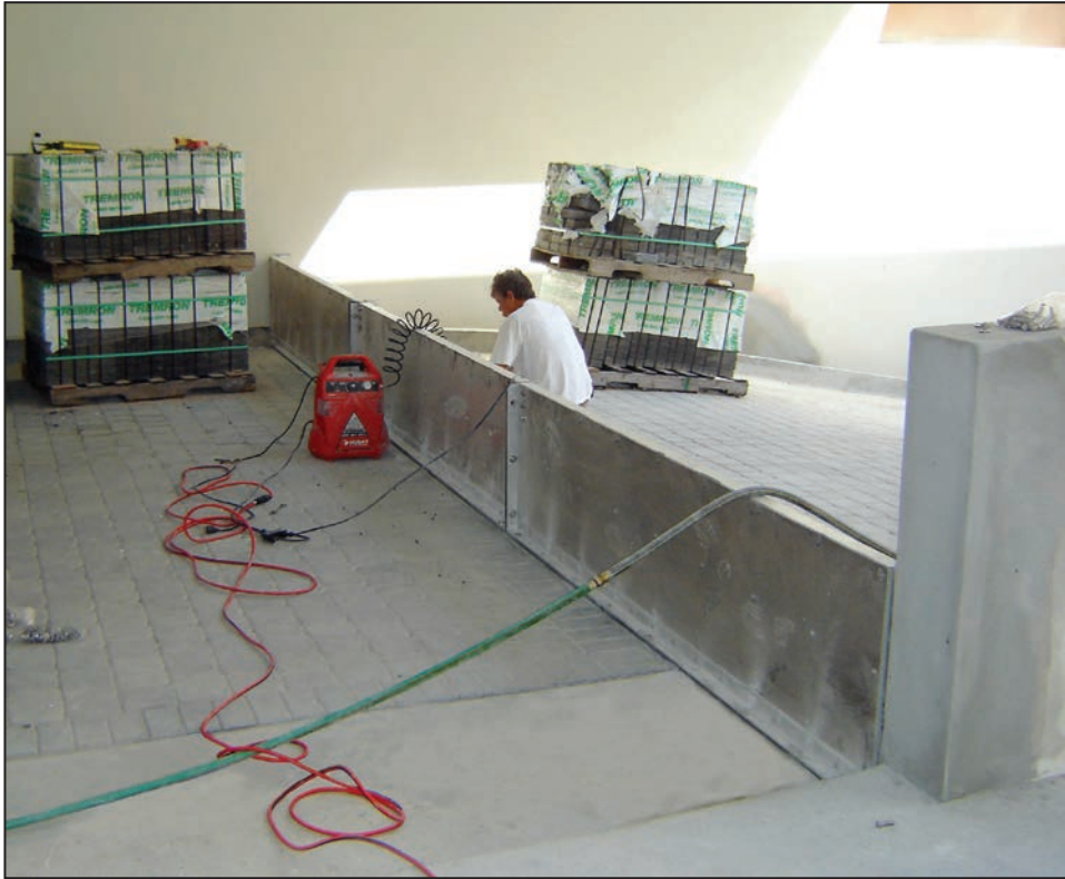
Figure 5: Manually deployed panel