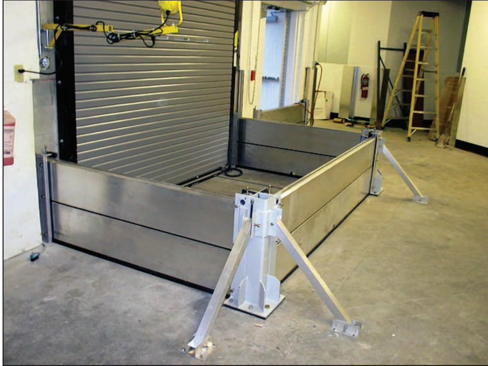
Figure 3: Stop logs deployed inside the building to trap seepage around the garage door and avoid accumulation of rainfall