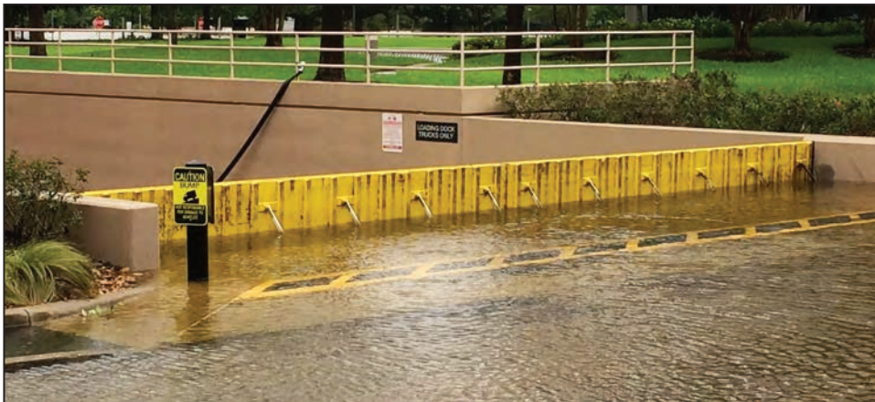
Figure 6: Automatic gate (deploys automatically when triggered by rising floodwater)