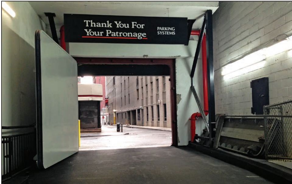
Figure 4: Permanent swing door (deployment requires closing and securing the door)